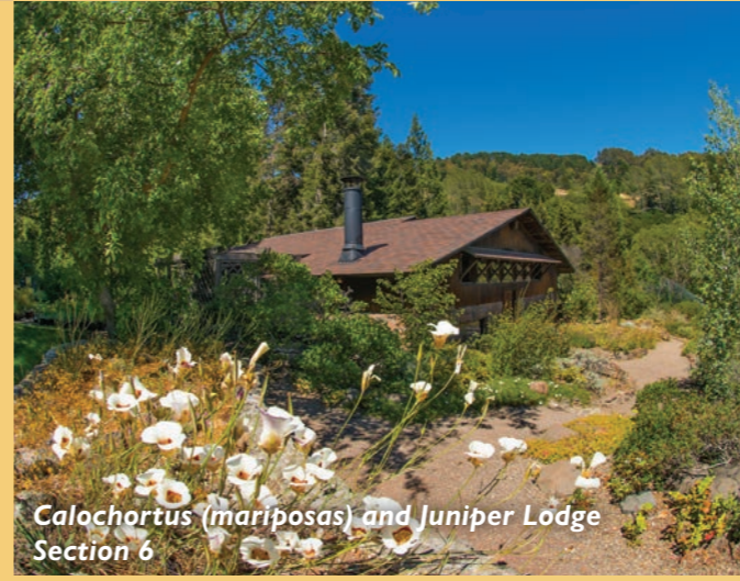
Calochortus (mariposas) and Juniper Lodge Section 6

Garden tours for groups are available by appointment. In addition, free tours start at the Visitor Center on most Saturdays and holidays at 2 p.m.; Sundays at 11 a.m. and 2 p.m. Please call 1-888-327-2757, option 3, ext. 4507, to confirm weekend tours and for group tour appointments.