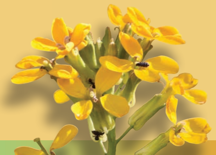
Erysimum capitatum (western wallflower)

For more information on the Botanic Garden, see nativeplants.org .