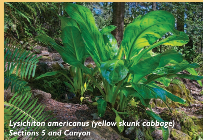
Lysichiton americanus (yellow skunk cabbage) Sections 5 and Canyon