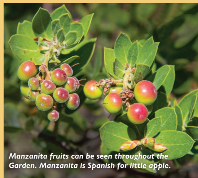
Manzanita fruits can be seen throughout the Garden. Manzanita is Spanish for little apple.