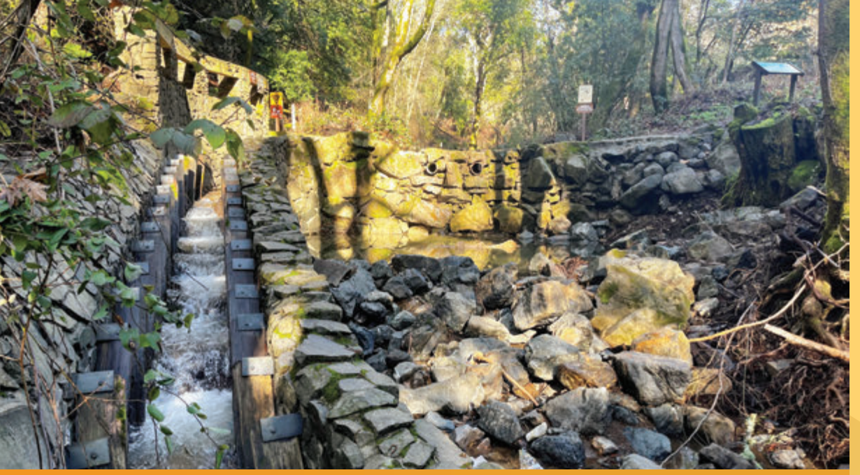
Native trout use a constructed fish ladder to seasonally migrate up Redwood Creek.

Besides hiking, biking, and nature study, there are picnic sites with meadows, and children's play area. Equestrian amenities are found near the east entrances of the park.