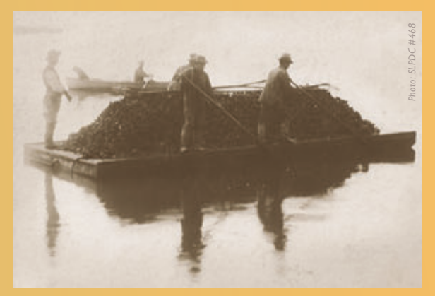
Oyster workers harvesting shellfish in San Leandro Bay under the protection of an armed guard, c. 1880-'90s.

Shellfish, including oysters, flourished in the mudflats here years ago. They were fed by incoming tides, preyed upon by bat rays and shorebirds,