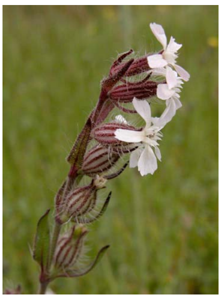
Windmill Pink Silene gallica Introduced Annual Pink Family