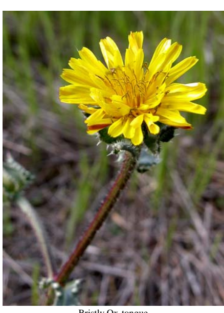
Bristly Ox-tongue Picris echioides Introduced Annual-Biennial Sunflower Family