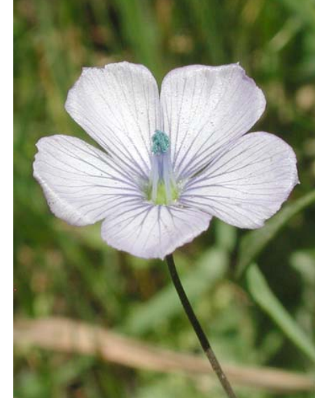
Narrow-leaf Flax Linum bienne Introduced Perennial Flax Family