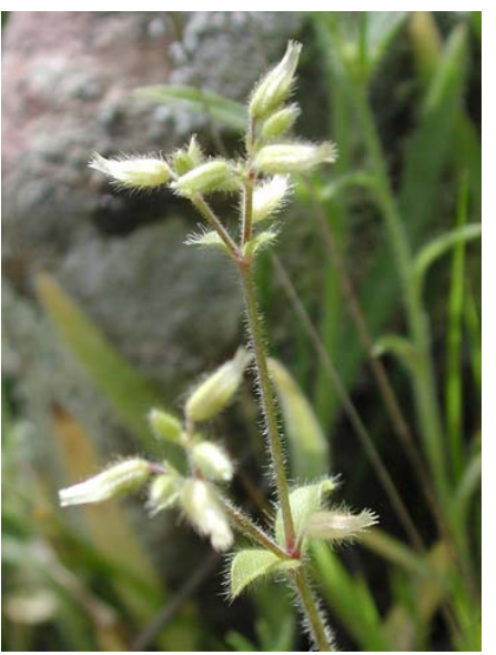
Mouse-ear Chickweed Cerastium glomeratum Introduced Annual Pink Family