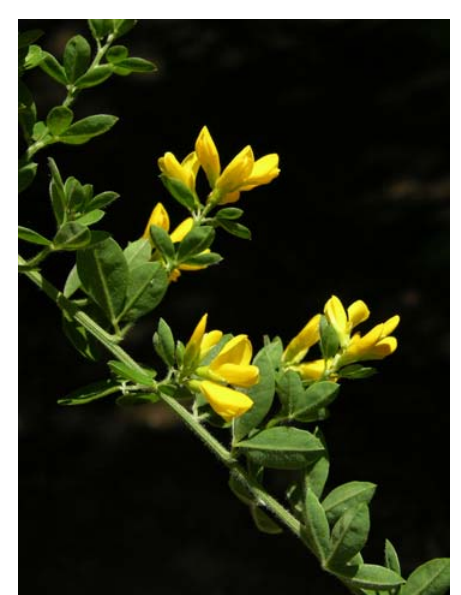
French Broom Genista monspessulana Introduced Perennial Pea Family