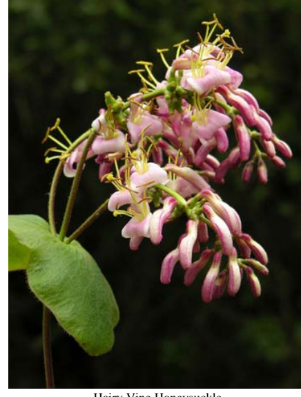
Hairy Vine Honeysuckle Lonicera hispidula var. vacillans Native Perennial Honeysuckle Family