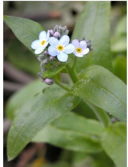
Forget-me-not Myosotis latifolia Introduced Perennial Borage Family