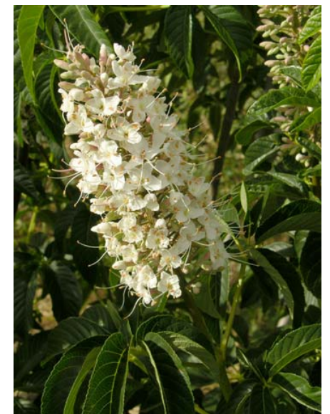
California Buckeye Aesculus californica Native Perennial Buckeye Family