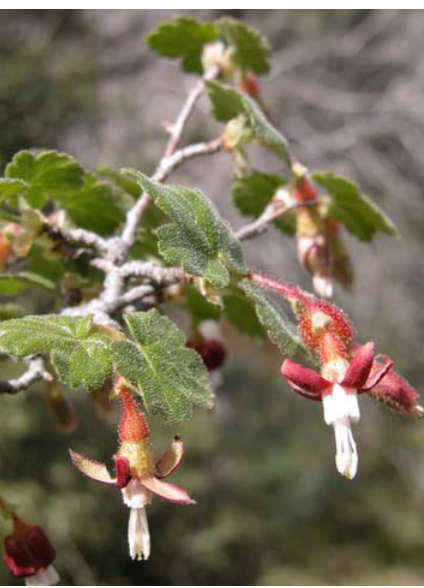
Canyon Gooseberry Ribes menziesii Native Perennial Gooseberry Family