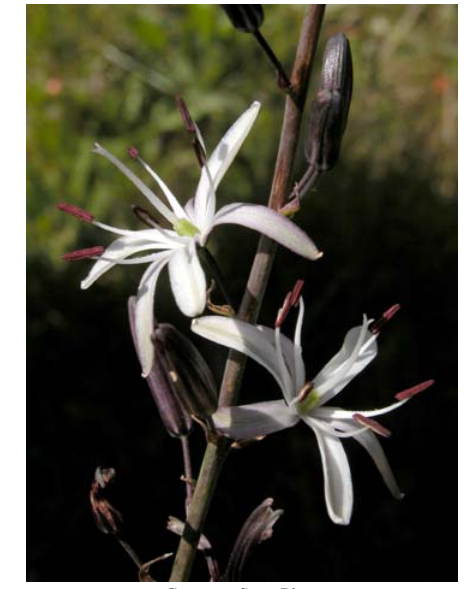
Common Soap Plant Chlorogalum pomeridianum var. pomeridianum Native Perennial Lily Family