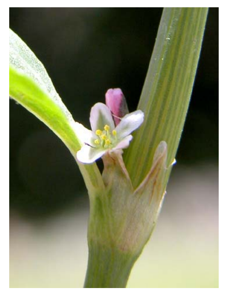
Common Yard Knotweed Polygonum arenastrum Introduced Annual Buckwheat Family