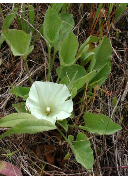
Shortstem Morning Glory Calystegia subacaulis ssp. subacaulis Native Perennial Morning-Glory Family