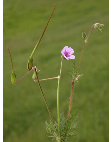
Long-beaked Filaree Erodium botrys Introduced Annual Geranium Family