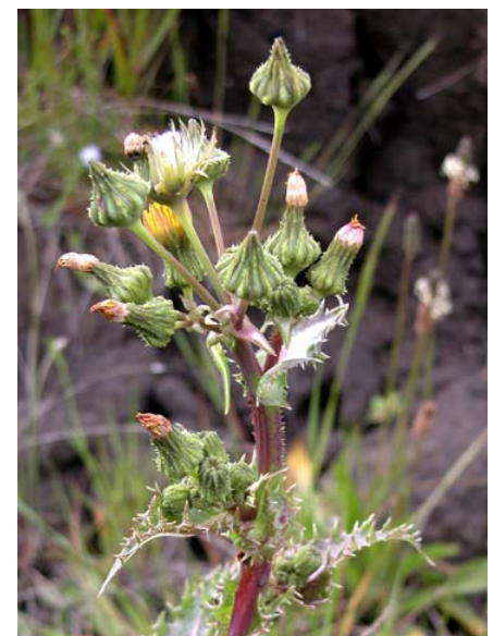
Prickly Sow Thistle Sonchus asper ssp. asper Introduced Annual Sunflower Family