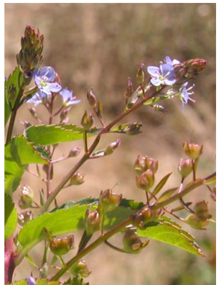
American Brooklime Speedwell Veronica americana Native Perennial Snapdragon Family