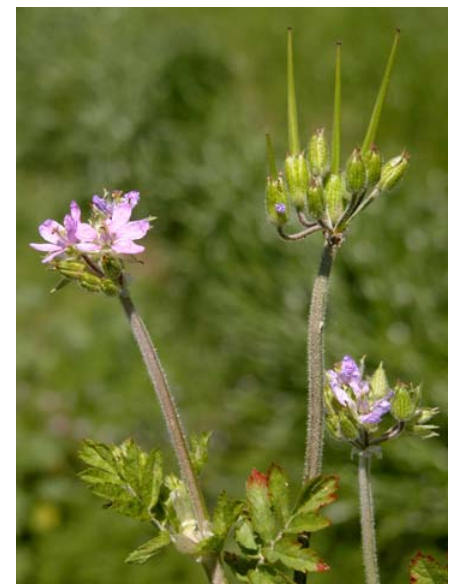
White-stem Filaree Erodium moschatum Introduced Annual Geranium Family