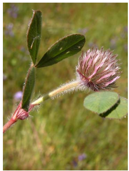
Rose Clover Trifolium hirtum Introduced Annual Pea Family