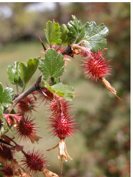
Hillside Gooseberry Ribes californicum var. californicum Native Perennial Gooseberry Family