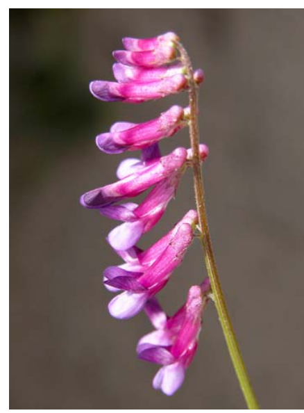
Winter Vetch Vicia villosa ssp. varia Introduced Annual-Biennial Pea Family