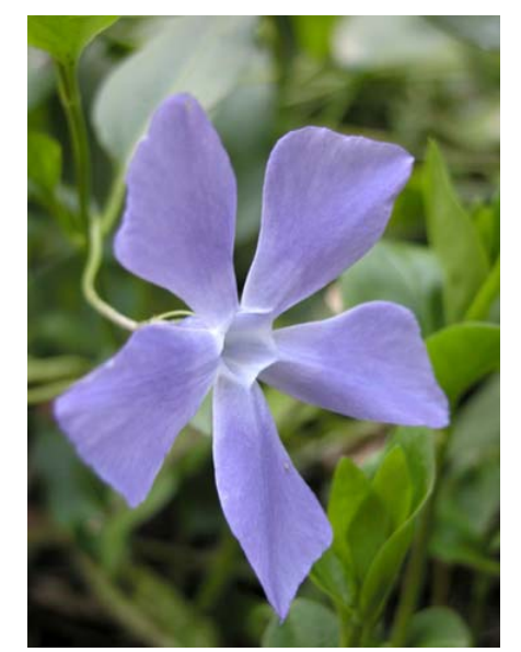
Greater Periwinkle Vinca major Introduced Perennial Dogbane Family