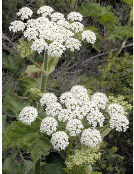
Cow Parsnip Heracleum lanatum Native Perennial Carrot Family