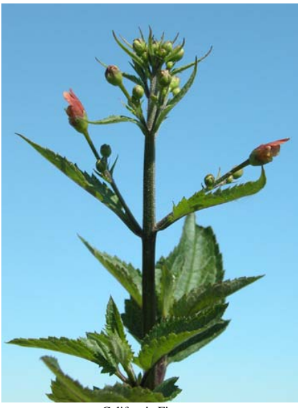
California Figwort Scrophularia californica ssp. californica Native Perennial Snapdragon Family