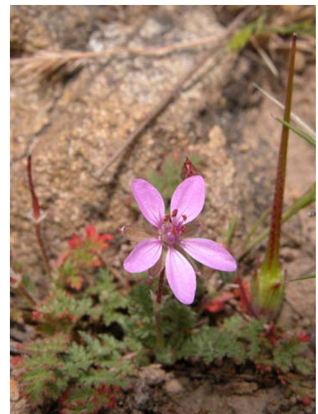
Red-stem Filaree Erodium cicutarium Introduced Annual Geranium Family