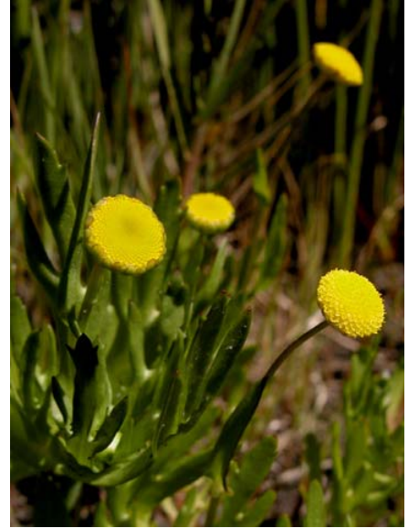
Brass Buttons Cotula coronopifolia Introduced Perennial Sunflower Family