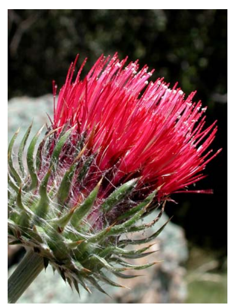
Venus / Cobweb Thistle Cirsium occidentale var. venustum Native Biennial Sunflower Family