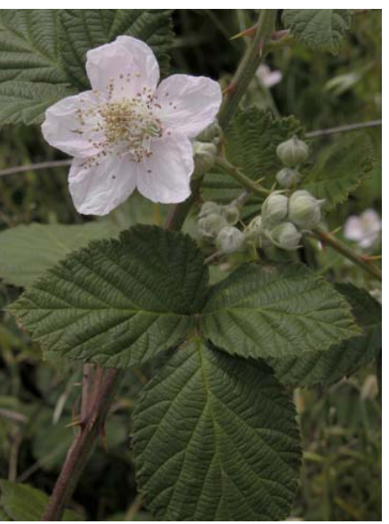
Himalayan Blackberry Rubus discolor Introduced Perennial Rose Family