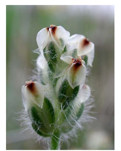
California Dwarf Plantain Plantago erecta Native Annual Plantain Family