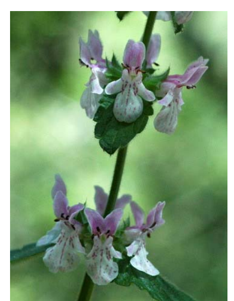
Common Rigid Hedge Nettle Stachys ajugoides var. rigida Native Perennial Mint Family