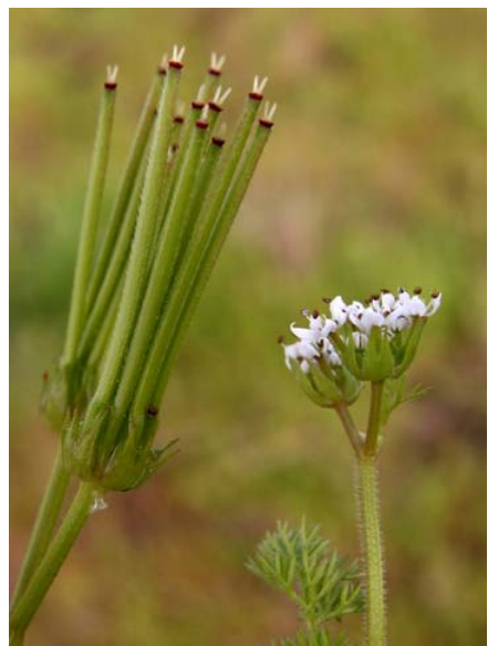
Shepherd's Needle Scandix pecten-veneris Introduced Annual Carrot Family