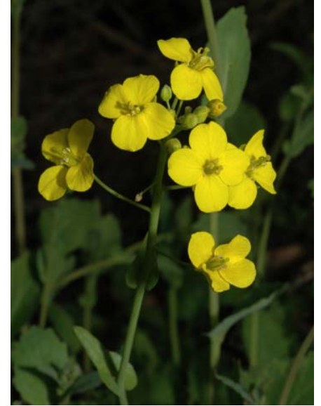
Yellow Field Mustard Brassica rapa Introduced Annual Mustard Family