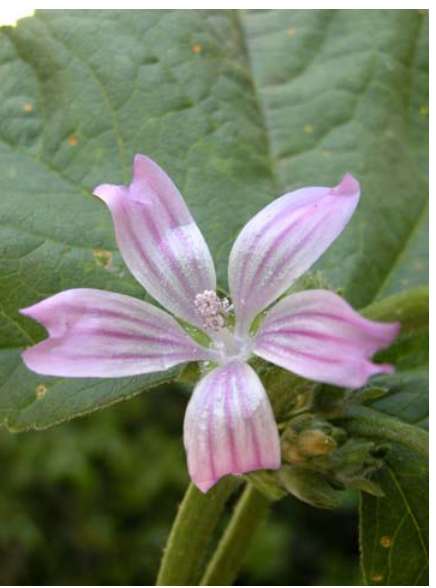
Bull Mallow Malva nicaeensis Introduced Annual Mallow Family