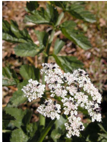
Pacific Water Parsley Oenanthe sarmentosa Native Perennial Carrot Family