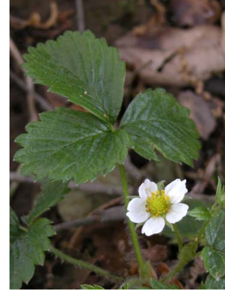
Woodland Strawberry Fragaria vesca Native Perennial Rose Family