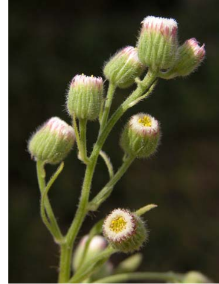
South American Horseweed Conyza bonariensis Introduced Annual Sunflower Family