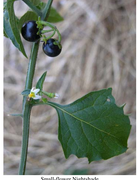
Small-flower Nightshade Solanum americanum Native Annual-Perennial Nightshade Family