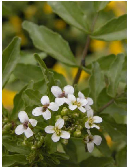
White Water Cress Rorippa nasturtium-aquaticum Native Perennial Mustard Family