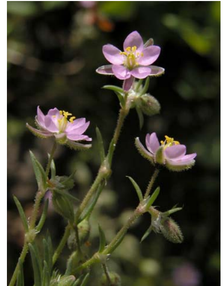
Ruby Sand Spurry Spergularia rubra Introduced Annual-Perennial Pink Family