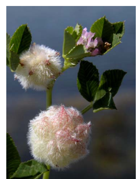
Strawberry Clover Trifolium fragiferum Introduced Perennial Pea Family