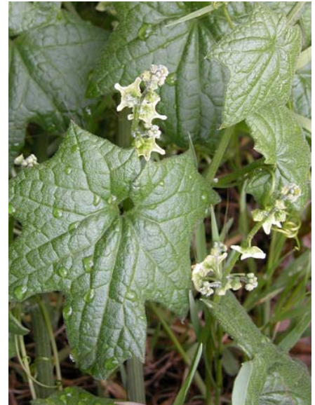
Common / California Manroot Marah fabaceus Native Perennial Gourd Family