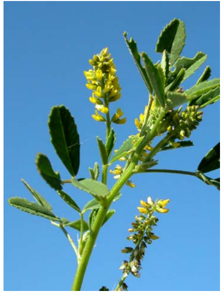
Sour Clover Melilotus indica Introduced Annual-Biennial Pea Family