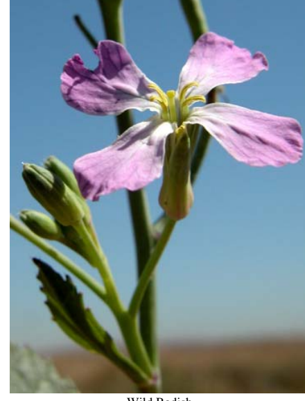
Wild Radish Raphanus sativus Introduced Annual Mustard Family