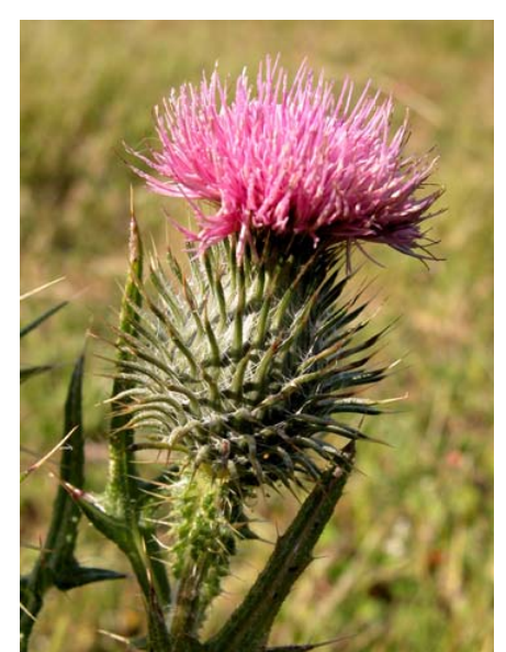
Bull Thistle Cirsium vulgare Introduced Biennial Sunflower Family