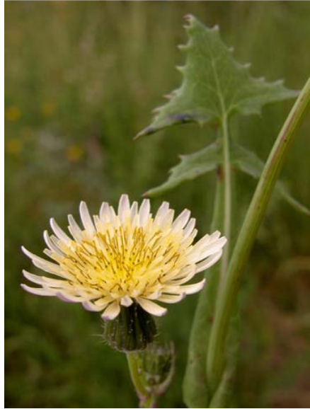
Common Sow Thistle Sonchus oleraceus Introduced Annual Sunflower Family