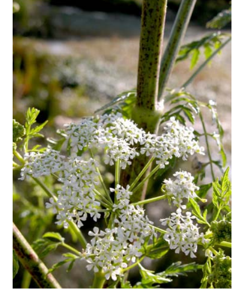
Poison Hemlock Conium maculatum Introduced Biennial Carrot Family