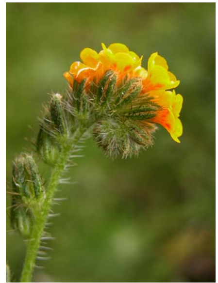
Common Fiddleneck Amsinckia menziesii var. intermedia Native Annual Borage Family