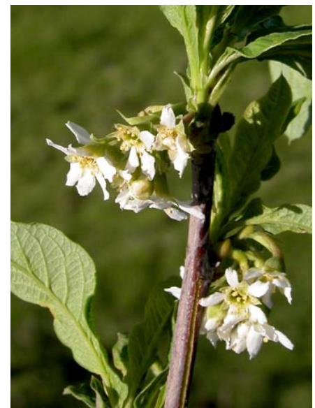
Oso Berry Oemleria cerasiformis Native Perennial Rose Family