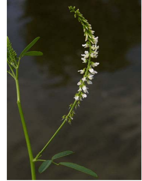
White Sweet Clover Melilotus alba Introduced Annual-Biennial Pea Family