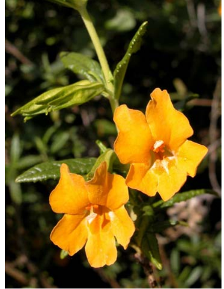
Bush Monkey Flower Mimulus aurantiacus Native Perennial Snapdragon Family