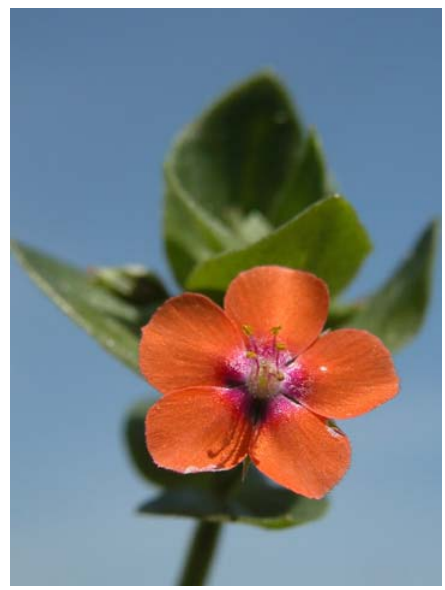
Scarlet Pimpernel Anagallis arvensis Introduced Annual Primrose Family