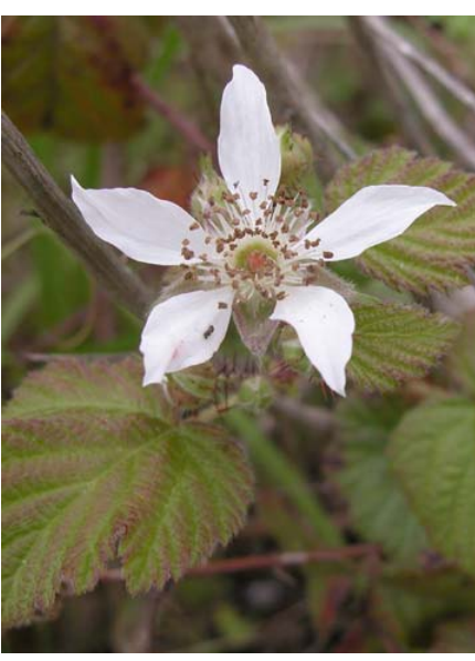
Native California Blackberry Rubus ursinus Native Perennial Rose Family