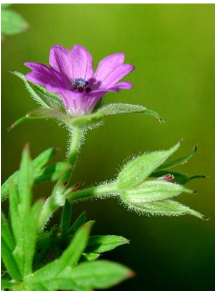
Purpletip Cut-leaf Geranium Geranium dissectum Introduced Annual Geranium Family