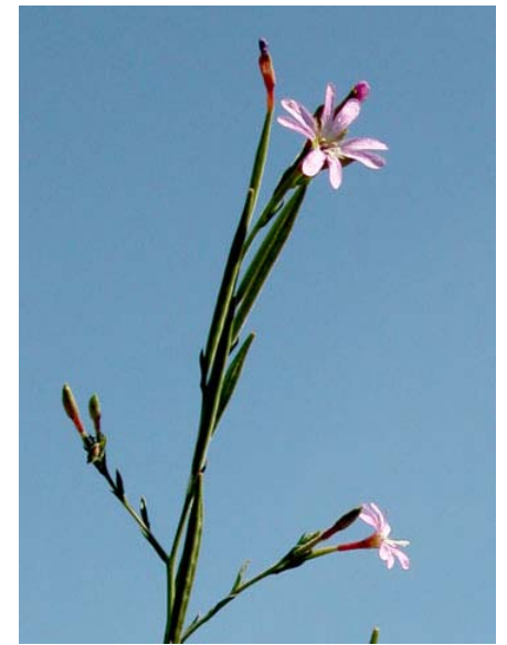
Panicled / Weedy Willowherb Epilobium brachycarpum Native Annual Evening Primrose Family