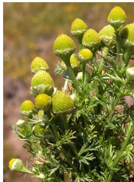
Pineapple Weed Chamomilla suaveolens Introduced Annual Sunflower Family