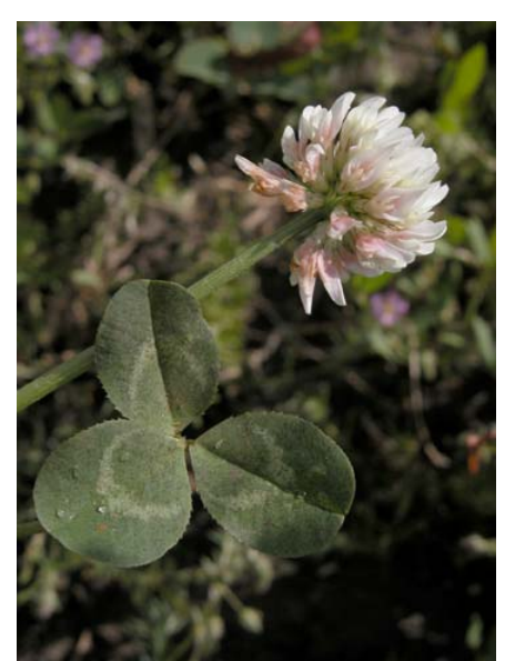
White Clover Trifolium repens Introduced Perennial Pea Family