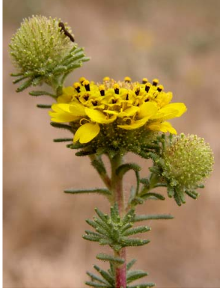
Santa Cruz Tarplant Holocarpha macradenia Native Annual Sunflower Family