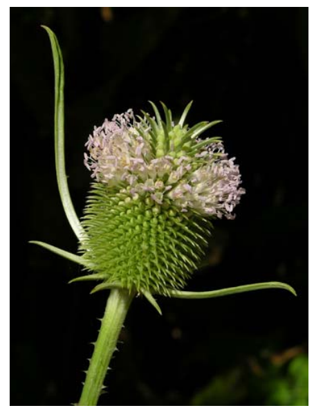
Wild Teasel Dipsacus sativus Introduced Biennial Teasel Family