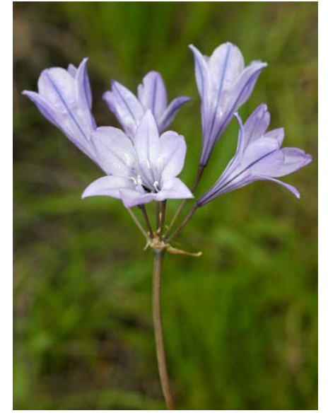
Ithuriel's Spear Triteleia laxa Native Perennial Lily Family