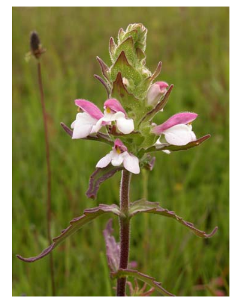
Bellardia Bellardia trixago Introduced Annual Snapdragon Family