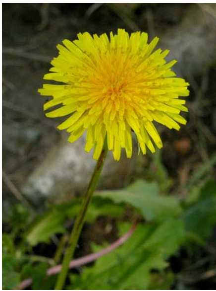
Common Dandelion Taraxacum officinale Introduced Biennial-Perennial Sunflower Family