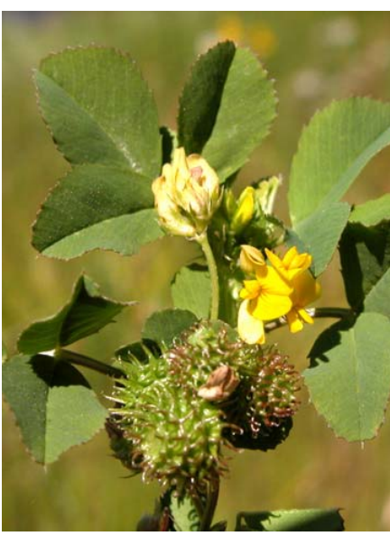
California Bur Clover Medicago polymorpha Introduced Annual Pea Family