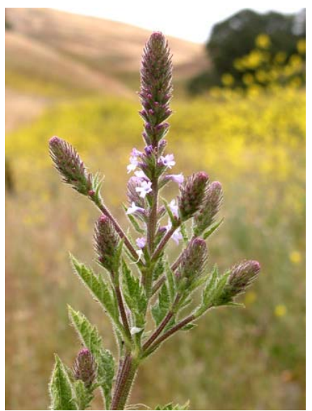
Robust Vervain Verbena lasiostachys var. scabrida Native Perennial Vervain Family