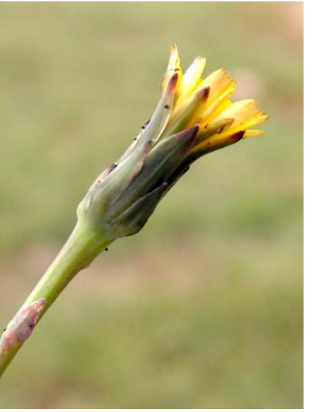
Smooth Cat's-ear Hypochaeris glabra Introduced Annual Sunflower Family