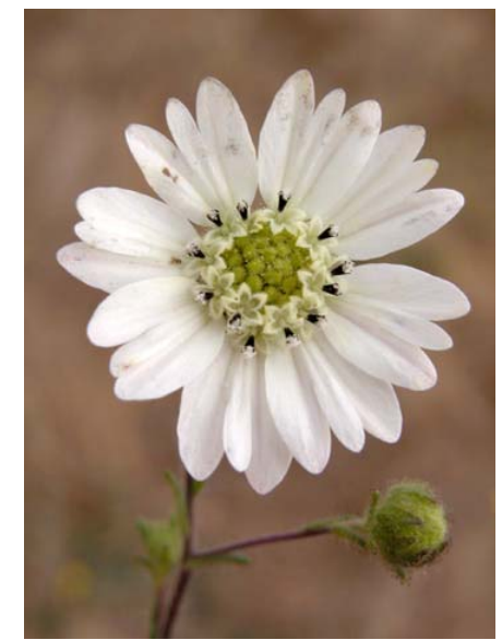
Hayfield Tarweed Hemizonia congesta ssp. luzulaefolia Native Perennial Sunflower Family