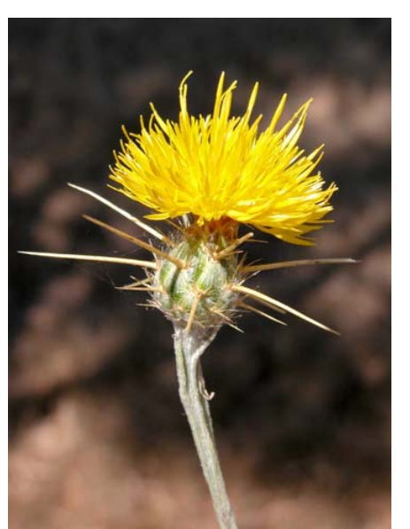
Yellow Star Thistle Centaurea solstitialis Introduced Annual Sunflower Family