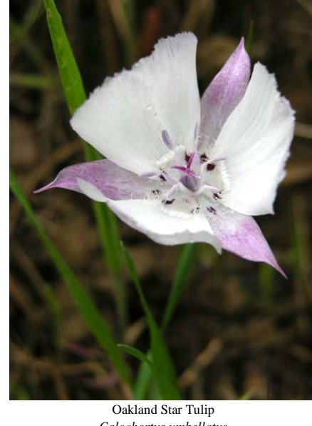
Oakland Star Tulip Calochortus umbellatus Native Perennial Lily Family