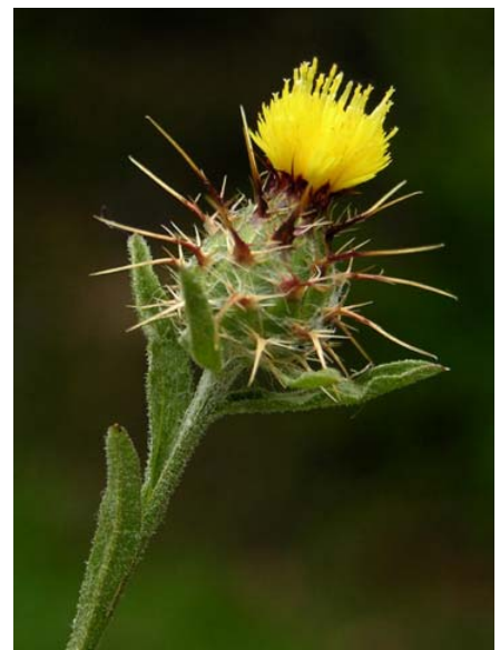
Tocalote Centaurea melitensis Introduced Annual Sunflower Family