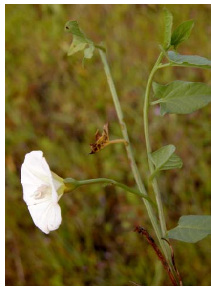
Field Bindweed Convolvulus arvensis Introduced Perennial Morning-Glory Family