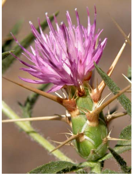
Purple Star Thistle Centaurea calcitrapa Introduced Annual-Biennial Sunflower Family