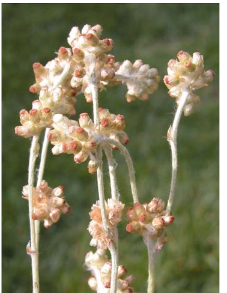
Weedy Cudweed Gnaphalium luteo-album Introduced Annual Sunflower Family