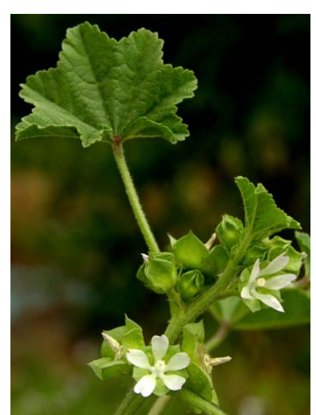
Hidden-flower Cheeseweed Malva parviflora Introduced Annual Mallow Family