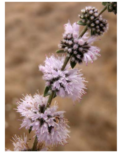
Pennyroyal Mentha pulegium Introduced Perennial Mint Family