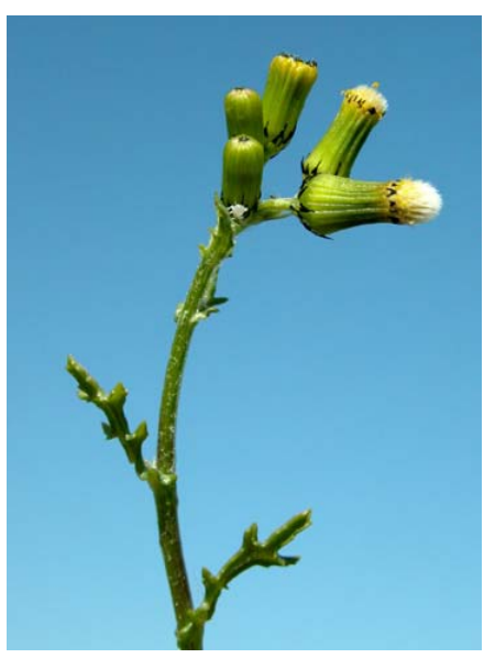
Common Groundsel Senecio vulgaris Introduced Annual Sunflower Family