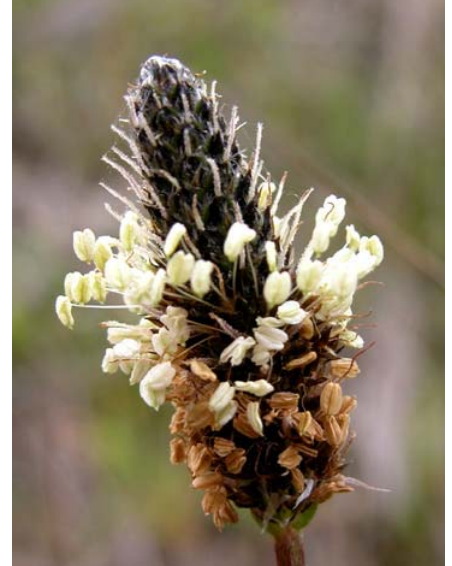
English Plantain Plantago lanceolata Introduced Annual Plantain Family