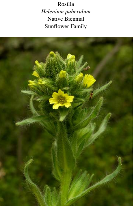
Common / Coast Tarweed Madia sativa Native Annual Sunflower Family