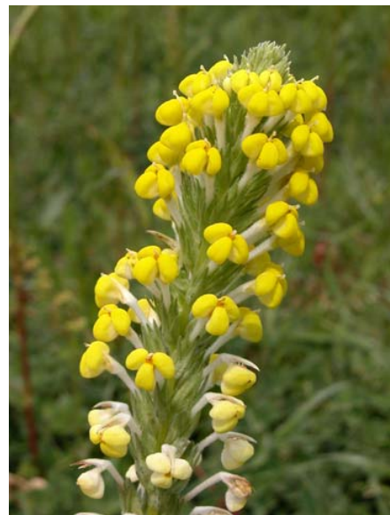
Yellow Johnny-tuck Triphysaria eriantha ssp. eriantha Native Annual Snapdragon Family