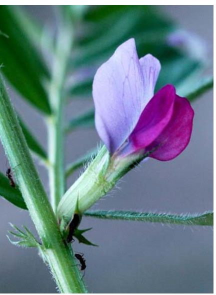
Spring Vetch Vicia sativa ssp. sativa Introduced Annual Pea Family