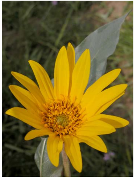
Narrow-leaf Mule's Ear Wyethia angustifolia Native Perennial Sunflower Family