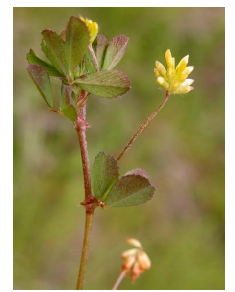
Shamrock Clover Trifolium dubium Introduced Annual Pea Family