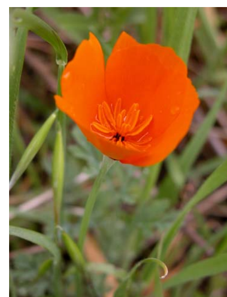
California Poppy Eschscholzia californica Native Perennial Poppy Family