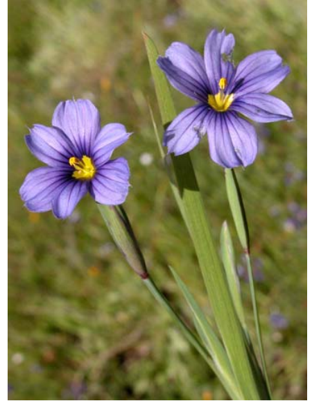
Blue-eyed Grass Sisyrinchium bellum Native Perennial Iris Family