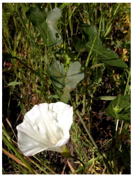
Climbing Morning Glory Calystegia purpurata ssp. purpurata Native Perennial Morning-Glory Family