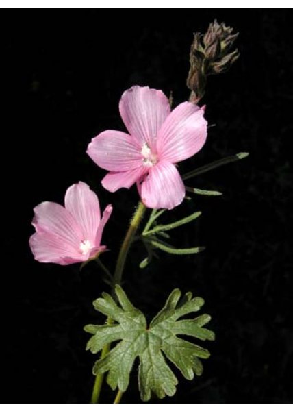
Common Checkerbloom Sidalcea malvaeflora ssp. malvaeflora Native Perennial Mallow Family