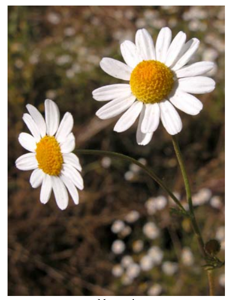
Mayweed Anthemis cotula Introduced Annual Sunflower Family