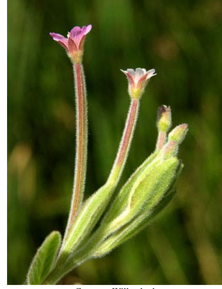
Common Willowherb Epilobium ciliatum ssp. ciliatum Native Perennial Evening Primrose Family