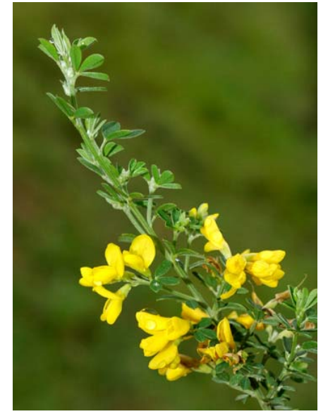
Scotch Broom Cytisus scoparius Introduced Perennial Pea Family