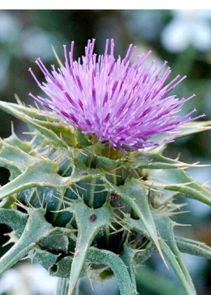
Milk Thistle Silybum marianum Introduced Annual-Biennial Sunflower Family