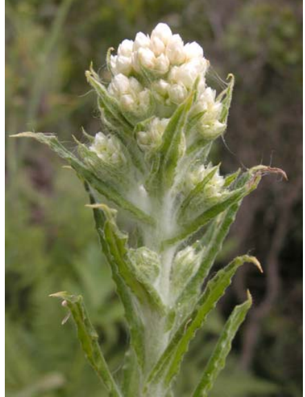
California Everlasting Gnaphalium californicum Native Biennial Sunflower Family