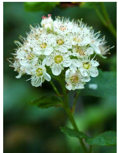
Pacific Ninebark Physocarpus capitatus Native Perennial Rose Family