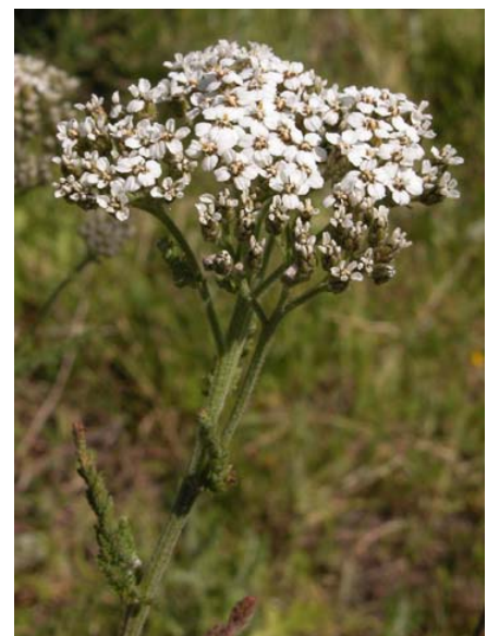
Yarrow Achillea millefolium Native Perennial Sunflower Family