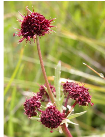
Purple Sanicle Sanicula bipinnatifida Native Perennial Carrot Family