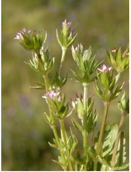
Blue Field Madder Sherardia arvensis Introduced Annual Madder Family