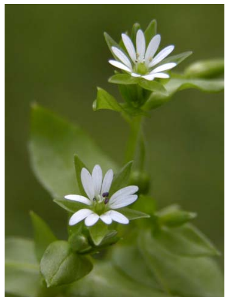
Common Chickweed Stellaria media Introduced Annual Pink Family