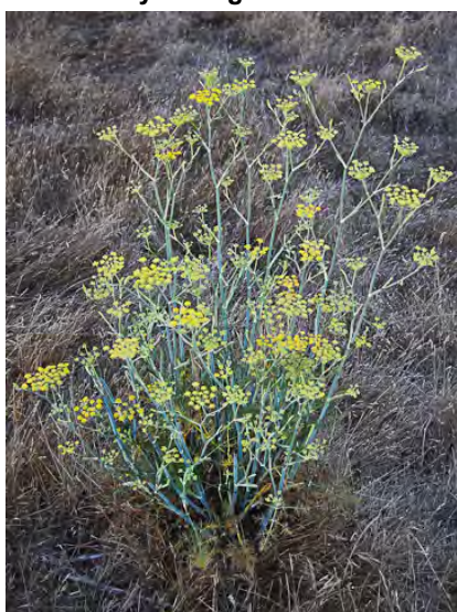
FENNEL (Foeniculum vulgare) Naturalized Perennial - Carrot Family - (May–Sep) - Roadsides, disturbed sites - Plants 3-6.5' tall, anise-scented. Stems waxy-blue, canelike. Flowers yellow. Leaf segments thread-like, edible when young. INVASIVE weed.