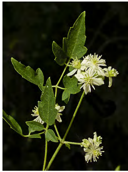
WESTERN VIRGIN'S BOWER (Clematis ligusticifolia) Native Perennial - Buttercup Family - (Jun-Sep) - Along streams, wet places - Leaflets 5-15, irregularly lobed. Flowers many, in fall. Sepals white to cream, 0.2-0.24" long.