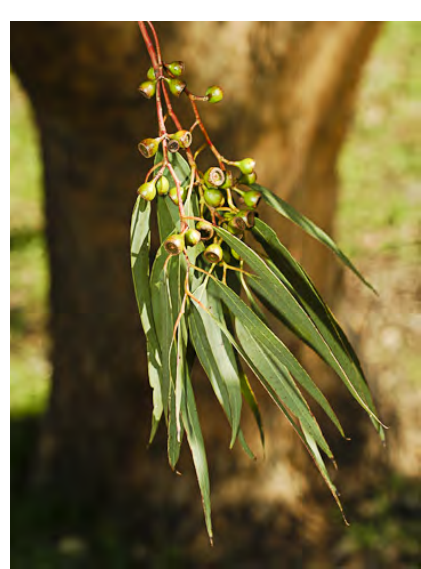
RIVER RED GUM (Eucalyptus camaldulensis) Naturalized Perennial - Myrtle Family - (Apr–Jul) - Common. Disturbed areas - Tree to 80' tall. Leaves 2-8" long, 0.6-1" wide. Flowers 5-10 in simple umbel, small, white; bud cap <0.25". INVASIVE.