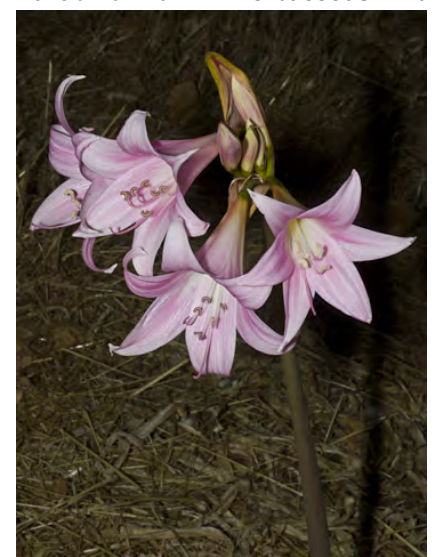
NAKED LADIES (Amaryllis belladonna) Naturalized Perennial - Amaryllis Family -(Jul-Sep) - Disturbed sites, often around abandoned home sites - Stems leafless, 1-2' tall. Flowers large and pink (sometimes white or yellow at the base). Escaped ornamentals.