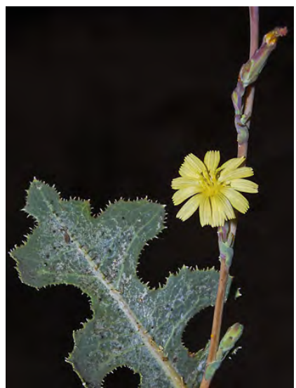
PRICKLY LETTUCE (Lactuca serriola) Naturalized Annual - Sunflower Family - (May-Oct) - Abundant. Disturbed places - Stem 1.6-10' tall, prickly-bristly. Leaves deeply-lobed, midvein and edges prickly-bristly. Flowers pale yellow, 0.16-0.2" wide.