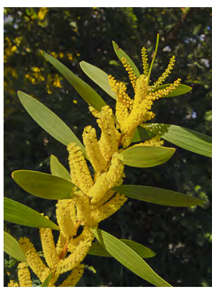
SYDNEY GOLDEN WATTLE (Acacia longifolia) Naturalized Perennial - Pea Family - (Jan-Apr) - Uncommon. Disturbed places, especially sandy coastal areas - Shrub-small tree, spineless. Leaves simple, 2-6" long with 2-4 main veins. Flowers bright yellow.