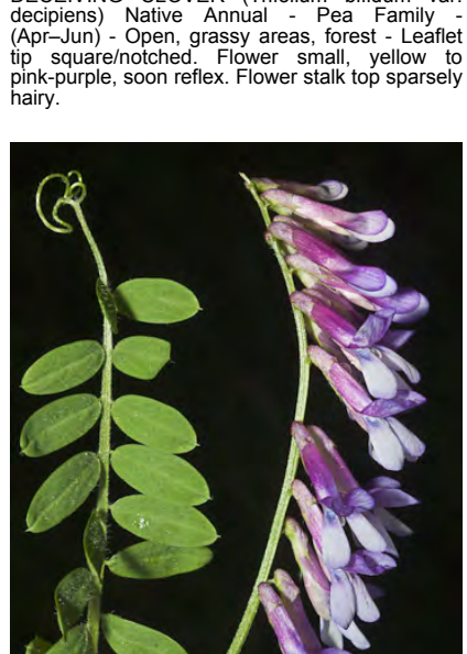
SPARSELY HAIRY VETCH (Vicia villosa subsp. varia) Naturalized Annual-Biennial - Pea Family -(Mar-Jun) - Grassland, roadside, disturbed areas ..... ชนก) - ซาสรรเสแน, roadside, disturbed areas - Stems w/few hairs. Flowers 10-20, blue-purple to white, 0.4-0.55" long. Lower bract lobes 0.04-0.1" long.