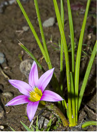
SOUTH AFRICAN ROMULEA (Romulea rosea var. australis) Naturalized Perennial - Iris Family - (Mar-Apr) - Uncommon. Disturbed areas, dry, sandy or often hard-packed soil - Plant gen < 4" tall. Leaves 2-14" long. Flower pink w/yellow tube, 0.6-0.8" long.