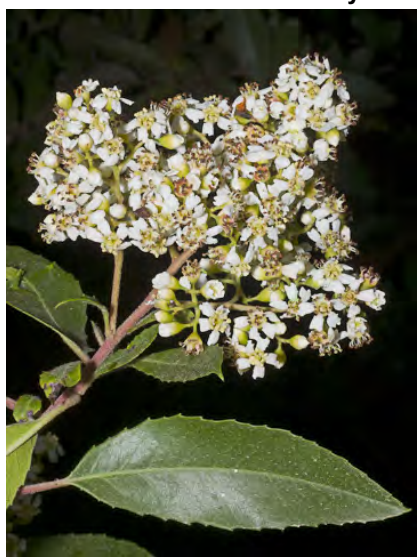
CHRISTMAS BERRY / TOYON (Heteromeles arbutifolia) Native Perennial - Rose Family - ((May)Jun-Aug) - Chaparral, oak woodland, mixed-evergreen forest - Shrub-tree < 33' tall, evergreen. Leave Fauit bright for long. Fruit bright red.