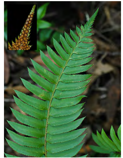
WESTERN SWORD FERN (Polystichum munitum) Native Perennial - Wood Fern Family - - Common. Wooded hillsides, shaded slopes, rarely cliffs, outcrops - Fronds gen 20-48" long, divided once. Segments usually separate, teeth point to tips, scaly rachis.