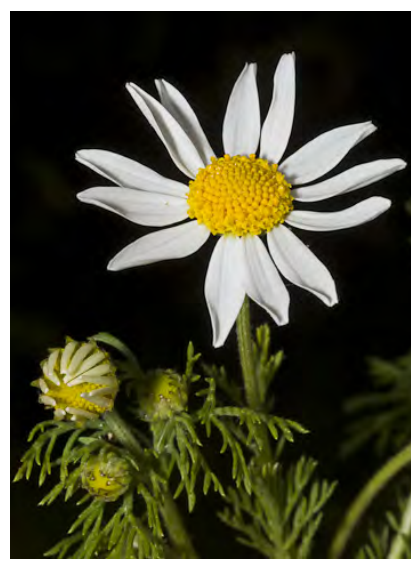
MAYWEED (Anthemis cotula) Naturalized Annual - Sunflower Family - (Apr-Aug) - Common. Disturbed areas, fields, coastal dunes, chaparral, oak woodland - Leaves finely divided into thread-like lobes. Flowers > 0.6" wide, many on top of a well-branched stem.