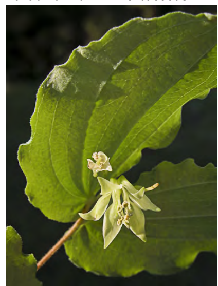
HOOKER FAIRY BELLS (Prosartes hookeri) Native Perennial - Lily Family - (Mar–Jun) - Montane conifer, mixed-evergreen forest, exposed roadside - Stem 12-32" tall. Leaf 1.2-6" long. Flower 0.3-0.6" long, white, hanging below the leaves, stamens > petals.