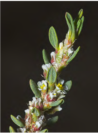
KNOTWEED (Polygonum aviculare subsp. depressum) Naturalized Annual - Buckwheat Family - (May–Nov) - Disturbed places - Stem 4-20", mat-forming. Flowers 2-8/leaf axil, ~0.1" long, fused 1/2 length, w/white or pink margins.