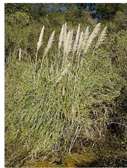
HAIRY PAMPAS GRASS (Cortaderia jubata) Naturalized Perennial - Grass Family - (Sep-Feb) - Disturbed sites, many habitats, esp coastal -Plant 6-23' tall. Leaf blades 0.1-0.5" wide, sheathes hairy. NOXIOUS weed.