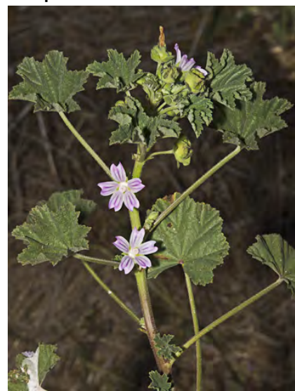
BULL MALLOW (Malva nicaeensis) Naturalized Annual - Mallow Family - (Mar–Jun) - Disturbed places - Stem 0.7-2'. Leaf blade 1.2-4.7" wide, 5-7 shallow lobes. Bractlets egg-shaped,0.16-0.2" long. Petals pink to blue-violet, 0.2-0.5" long.