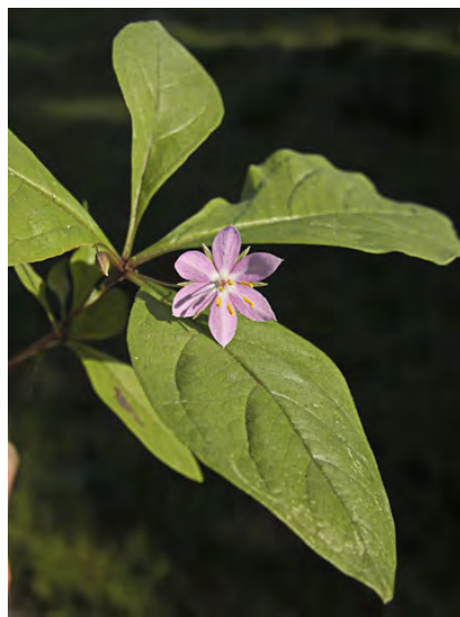
STARFLOWER (Trientalis latifolia) Native Perennial - Myrsine Family - (Apr–Jul) - Shaded places, esp woodland - Stem 2-12". Leaves 1-3.5" long, 0.4-2" wide, egg-shaped; stem leaves in 1 whorl near stem tip. Flower gen pink to rose, 0.3-0.6" wide.