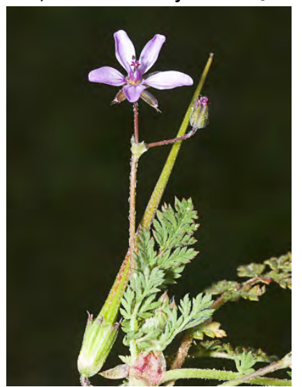
REDSTEM FILAREE (Erodium cicutarium) Naturalized Annual - Geranium Family (Feb-Sep) - Open, disturbed sites, grassland, scrub - Stem 4-20". Leaves compound, leaflets dissected. Sepal tip bristly. Petal pink to purple. Fruit beak 0.8-2". INVASIVE.