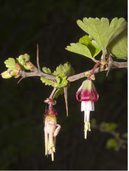
HILLSIDE GOOSEBERRY (Ribes californicum var. californicum) Native Perennial - Gooseberry Family - (Feb–Mar) - Forest openings, woodland - Shrub < 5' tall. Leaf blades 0.4-1.2" long, not sticky. Sepals greenish, petals 0.12" long, white.