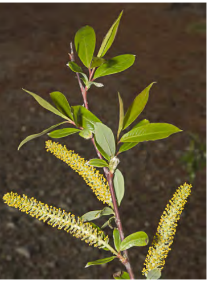
RED WILLOW (Salix laevigata) Native Perennial - Willow Family - (Dec-Jun) - Common. Riverbanks, seepage areas, lakeshores, canyons - Tree bark fissured. Leaf lanceolate, glaucous below, gen w/stalk glands. Stamens 5. Fruit glabrous.