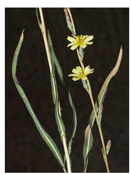
WILLOW LETTUCE (Lactuca saligna) Naturalized Annual - Sunflower Family (Jul-Nov) - Roadsides, grassland - Stem 12-39" tall. Leaf lobes entire or few-toothed, no prickles underneath. Flowers 5-12, pale yellow, open in morning.