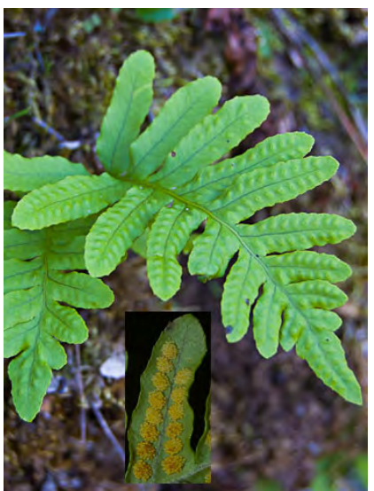
POLYPODY FERN (Polypodium calirhiza) Native Perennial - Polypody Family - - - On plants, rocky cliffs or outcrops, roadcuts, often granitic or volcanic, rarely dunes - Leaf blades 4-8" long, often widest above base, deeply lobed.