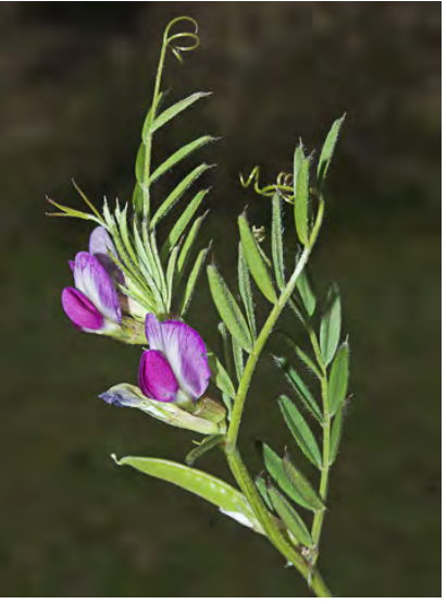
NARROW-LEAVED VETCH (Vicia sativa subsp. nigra) Naturalized Annual - Pea Family - (Mar–Jun) - Roadsides, disturbed areas, grassland, open areas in oak and riparian woodlands - Flowers 1-2 at leaf bases, pink-purple to white, 0.4-0.7" long. Leaflets 0.2-0.3" wide.