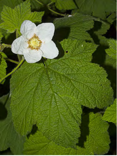
THIMBLEBERRY (Rubus parviflorus) Native Perennial - Rose Family - (Mar-Aug) - Common; moist semi-shaded areas, esp edges of woodland - Shrub 0.5-2 m tall, not prickly. Petals 0.5-0.9" long, white. Leaves simple, 3-5 lobed. Raspberry-type fruit.