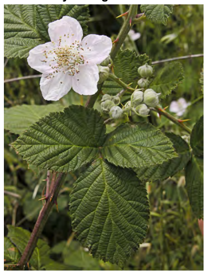
HIMALAYAN BLACKBERRY (Rubus armeniacus) Naturalized Perennial - Rose Family - (Mar–Jun) - Common. Disturbed areas, roadsides - Shrub withorny 5-angled stem. Leaflets 3-5, white-hairy beneath. Blackberry-type fruit. INVASIVE.