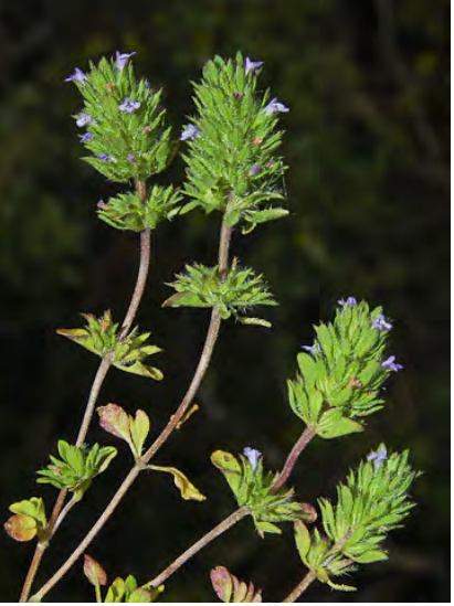
THYMELEAF BEARDSTYLE (Pogogyne serpylloides) Native Annual - Mint Family - (Mar–Jun) - Grassy, brushy areas - Plant inconspicuous. Stem 1-8" long, low-growing. Flowers 0.1-0.2" long, lavender, in dense clusters.