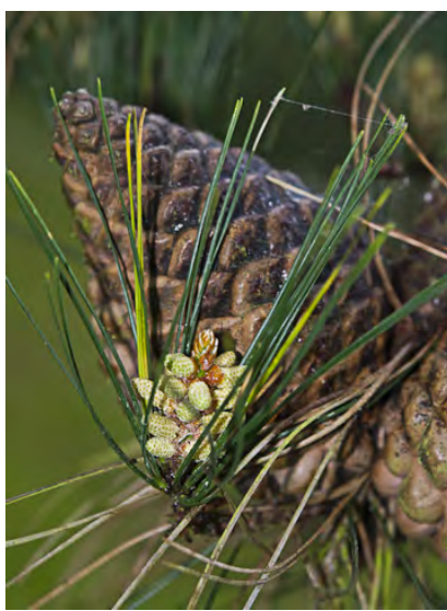
MONTEREY PINE (Pinus radiata) Native Perennial - Pine Family - - - Closed-cone-pine forest, oak woodland - Tree < 125' tall. Mature bark black, deep-grooved. Needles 3 per bundle, 2.4-5.9" long. Seed cone 2.4-6" long, asymmetric, opening 2nd year.