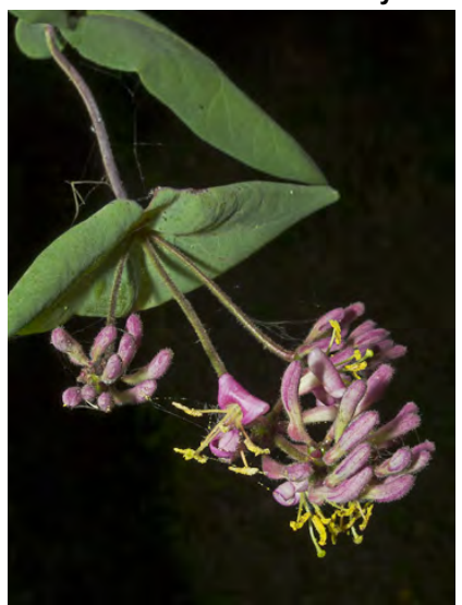
HAIRY VINE HONEYSUCKLE (Lonicera hispidula) Native Perennial - Honeysuckle Family - (May—Jun) - Canyons, streamsides, woodland - Shrub sprawling-climbing, 6-10' long, short-hairy. Flower cluster densely sticky. Flowers pink, 0.5-0.6" long, sticky-hairy.