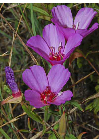
RUBY CHALICE CLARKIA (Clarkia rubicunda) Native Annual - Evening Primrose Family -(May-Aug) - Openings in woodland, forest, chaparral near coast - Stem < 5' long. Buds erect. Petals 0.4-1.2", rose w/red base. Sepals united. Stigma > anthers.