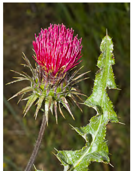
VENUS THISTLE (Cirsium occidentale var. venustum) Native Biennial - Sunflower Family - (May–Jul) - Disturbed areas, grassland, woodland - Plant 1.6-9.8' tall. Head bract cluster 0.6-2" tall, 0.6-3" diam. Flowers gen bright red-pink to red, 0.9-1.4" long.