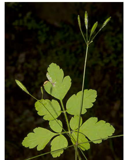
SWEET-CICELY (Osmorhiza berteroi) Native Perennial - Carrot Family - (Apr-Jul) - Conifer forest, woodland, disturbed areas - Plant 12-47". Leaflets in 3s, serrate to irreg lobed. Flower white. Fruit 0.5-1", upward pointing barbs, splitting apart below.