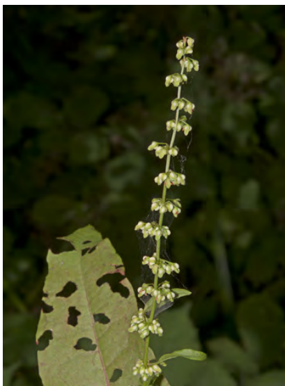
GREEN DOCK (Rumex conglomeratus) Naturalized Perennial - Buckwheat Family (May-Aug) - Common. Moist places - Stem 12-32" tall, unbranched below. Flower cluster open. Fruit valves ~0.1" long, scarcely winged around the 3 tubercles, smooth edged.