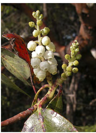
PACIFIC MADRONE (Arbutus menziesii) Native Perennial - Heath Family - (Mar–May) - Conifer, oak forests - Tree < 130' tall, evergreen, peeling red bark. Leaf blades < 5" long. Flowers yellow-white or pink, < 3.1" long. Berries red, < 0.5" diam, round.