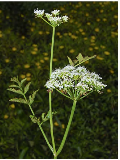
WATER PARSLEY (Oenanthe sarmentosa) Native Perennial - Carrot Family - (Jun-Oct) - Streams, marshes, ponds, gen aquatic - Plant 20-60" tall. Young shoots curled, tendril-like. Leaves twice-pinnate, leaflets alike, broad, serrate to lobed. Flowers white.