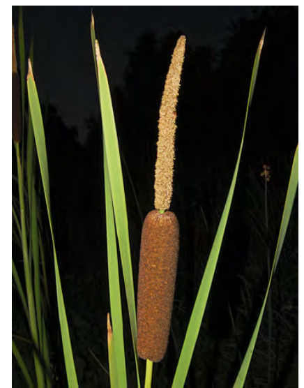
NARROW-LEAVED CATTAIL (Typha angustifolia) Native Perennial - Cattail Family - (May-Aug) - Nutrient-rich freshwater to brackish marshes, wet disturbed places - Plant 4.9-9.8' tall. Leaves gen < 0.4" wide. Flower cluster gap > 0.4".