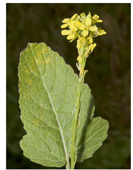
BLACK MUSTARD (Brassica nigra) Naturalized Annual - Mustard Family - (Apr-Sep) - Common. Disturbed areas, fields - Plant 1-6' tall. Petals bright yellow, 0.3-0.4" long. Fruit upright, pressed against stem. INVASIVE weed.