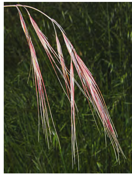
RIPGUT GRASS (Bromus diandrus) Naturalized Annual - Grass Family - (Apr-Jul) - Open, gen disturbed areas - Plant 6-40" tall. Spikelet 1-2.8" long. Lemma body 0.8-1.2" long, awn > 1.2" long. Barbed seeds can stick in flesh of animals. INVASIVE weed.