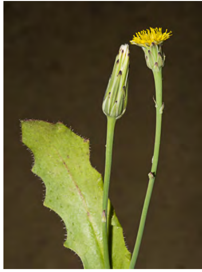
SMOOTH CAT'S-EAR (Hypochaeris glabra) Naturalized Annual - Sunflower Family (Mar-Jun) - Common. Disturbed areas, grassland, open woodland - Plant 4-24" tall, smooth. Rays 0.2-0.3" long, barely > head bracts. Only inner fruit beaked. INVASIVE.