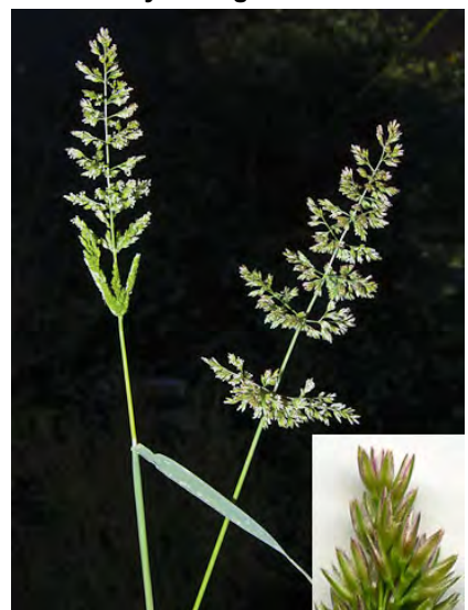
WATER BEARD GRASS (Polypogon viridis) Naturalized Perennial - Grass Family - (May–Jun) - Common. Disturbed areas, wet areas, ponds, streambanks -Stem 4-40" long, trails. Leaf blades flat, 0.08-0.4" wide. Spikelet ~ 0.1" long, no awn, whorled clusters.