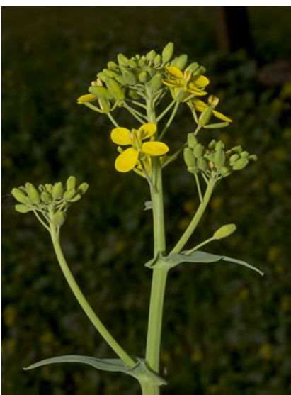
TURNIP (Brassica rapa) Naturalized Annual - Mustard Family - (Jan-May) - Disturbed areas - Stem 8-40" tall. Leaves clasping, upper smooth-edged & waxy. Petals yellow, 0.2-0.4" long, stalk 0.3-1"; fruit beak > 0.4". INVASIVE