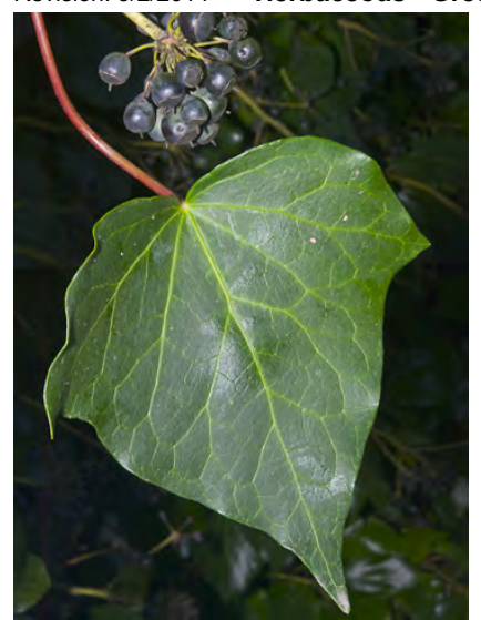
CANARY ISLANDS IVY (Hedera canariensis) Naturalized Perennial - Ginseng Family - (Aug-Nov) - Woodland, chaparral, disturbed areas - Woody vine. Leaves gen 3-pointed, > English Ivy. Flowers white to green. Fruit black, ~0.2" wide. INVASIVE weed.