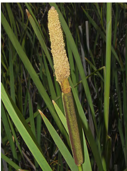
BROAD-LEAVED CATTAIL (Typha latifolia) Native Perennial - Cattail Family - (Jun—Jul) - Unpolluted to nutrient-rich freshwater (brackish) marshes - Plant 4.9-9.8' tall. Widest leaves 0.4-1.1" wide. Flower cluster with no gap between flower types.