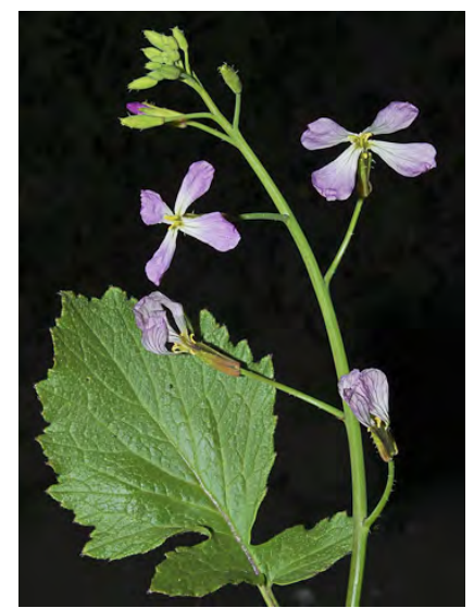
RADISH (Raphanus sativus) Naturalized Annual - Mustard Family - (May–Jul) - Disturbed areas, fields - Stem 16-51" long. Petals 0.6-1" long, white to purple. Fruit a fat cylinder w/constrictions between seeds. INVASIVE weed.