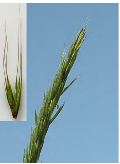
WESTERN WILD-RYE (Elymus glaucus subsp. glaucus) Native Perennial - Grass Family - (Jun-Aug) - Open areas, chaparral, woodland, forest - Tufted. Stem 12-55" tall. Leaf 0.2-0.5" wide, flat. Spikelets0.3-0.6" long, 2-4 per node. Lemma awn 0.4-1.2" long.