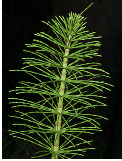
COMMON HORSETAIL (Equisetum arvense) Native Perennial - Horsetail Family - - Streambanks, wet meadows, springs, other wet, shaded places - Sterile stems 4-24" tall, 6-14 sheath teeth. Fertile stems 4-13" tall, 6-10 sheath teeth.