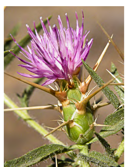
PURPLE STAR-THISTLE (Centaurea calcitrapa) Naturalized Annual-Biennial - Sunflower Family -(Apr-Nov) - Pastures, disturbed places - Plant 8-40"+. Basal leaves 1-2x divided into narrow lobes. Flowers purple with spiny bracts. NOXIOUS weed.