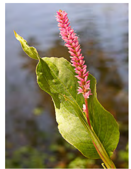
WATER SMARTWEED (Persicaria amphibia) Native Perennial - Buckwheat Family - (Jun-Nov) - Shallow lakes, streams, shores - Aquatic (floating leaves) or terrestrial. Flower clusters 0.4-6" long, 0.3-0.8" wide, pink to red.