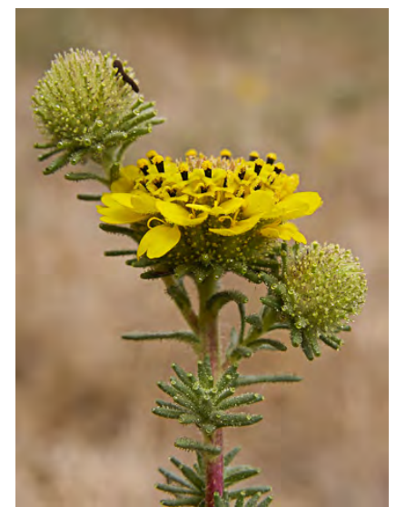
SANTA CRUZ TARPLANT (Holocarpha macradenia) Native Annual - Sunflower Family - (Jun-Nov) - Grassy areas, clay soil - Plant 4-20" tall, sticky. Heads in tight groups. Rays 8-16, disk anthers red to purple. Fed: THREATENED, Cal: ENDANGERED.