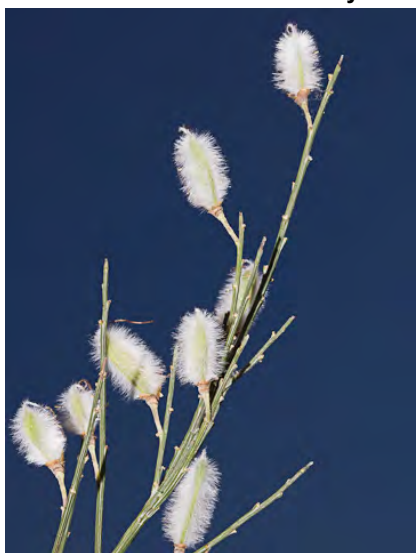
SCOTCH BROOM (Cytisus scoparius) Naturalized Perennial - Pea Family - (Apr–Jul) - Common. Disturbed places - Shrub 6.6-8' tall, deciduous. Stems sharply 5-angled, new twigs hairy. Flowers yellow, 1-2 at leaf bases, 0.6-0.8" long. NOXIOUS.