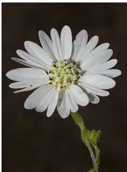
HAYFIELD TARWEED (Hemizonia congesta subsp. luzulifolia) Native Perennial - Sunflower Family - (Mar-Dec) - Disturbed, open, or grassy sites, often clayey soils, serpentine - Plant 2-32" tall. Flowers white, rays 0.2-0.5" long; head bract tips < body.