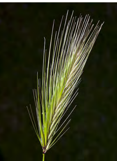
WALL BARLEY (Hordeum murinum subsp. murinum) Naturalized Annual - Grass Family - (Feb-May) - Moist, gen disturbed sites - Stem 1-2'. Leaf auricles notable. Central spikelet stalk 0-0.02". Central floret gen = lateral florets. INVASIVE weed.