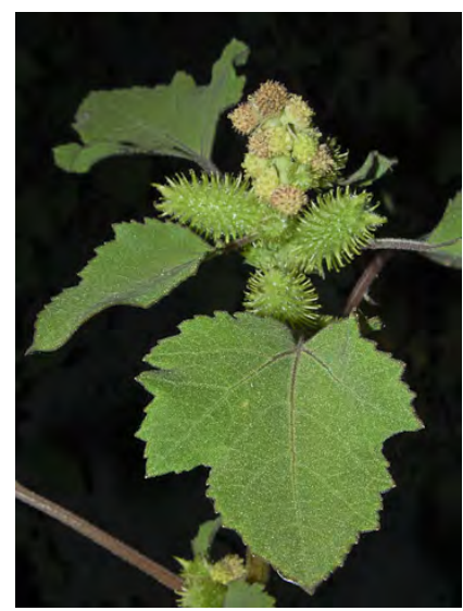
COCKLEBUR (Xanthium strumarium) Native Annual - Sunflower Family - (Jul-Oct) -Disturbed, seasonally wet, often alkaline sites, in grassland, marshes, watercourses - Plant 4-32" tall. Stem spineless. Bur 0.4-1.2"+ long.