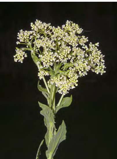
HEART-PODDED HOARY CRESS (Lepidium draba) Naturalized Perennial - Mustard Family - (Apr-Aug) - Disturbed areas, saline soils, pastures, fields - Stem gen 9-26" tall. Flowers white. Sepals smooth. Fruit smooth, heart-shaped. NOXIOUS weed.