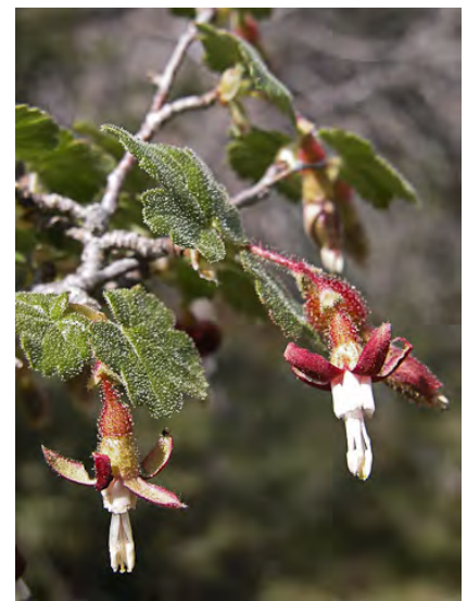
CANYON GOOSEBERRY (Ribes menziesii var. menziesii) Native Perennial - Gooseberry Family - (Feb-Apr) - Common. Forest openings, chaparral - Shrub < 10', prickly. Leaves sticky below. Styles glabrous, anthers exserted, sepals purplish.