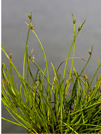
LOW BULRUSH (Isolepis cernua) Native Annual - Sedge Family - (Late spring-winter) - Sandy, sometimes brackish sea shores, bluffs, sand dunes, creeks, marshes - Plant 1.6-16" tall, tufted. Single spikelet.