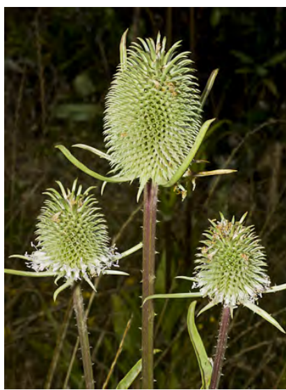
FULLER'S TEASEL (Dipsacus sativus) Naturalized Biennial - Teasel Family - (May–Jul) -Disturbed areas, fields, vacant lots, pastures -Plant gen < 6' tall. Leaf pairs fused around stem. Flower cluster lavender, 5-10 cm long, bracts spreading. INVASIVE weed.