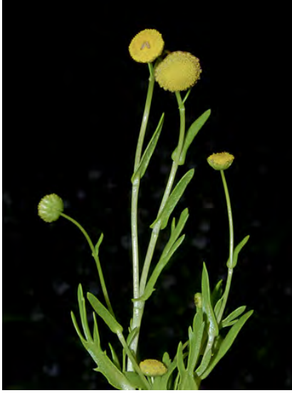
BRASS-BUTTONS (Cotula coronopifolia) Naturalized Perennial - Sunflower Family -(Mar-Dec) - Common. Saline and freshwater marshes, mud flats - Plant 2-16"+ tall, smooth, ± fleshy. Leaves linear to lance-shaped w/linear teeth or lobes. INVASIVE.