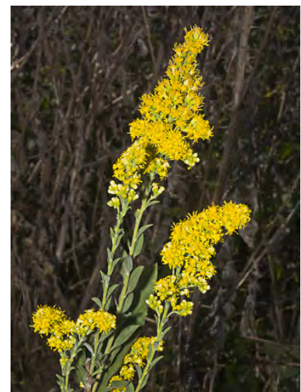
CALIFORNIA GOLDENROD (Solidago velutina subsp. californica) Native Perennial - Sunflower Family - (May–Nov) - Woodland margins, grassland, disturbed soils - Stem 8-60" tall. Gen densely short-soft-hairy. Flower cluster height 2-4x width.