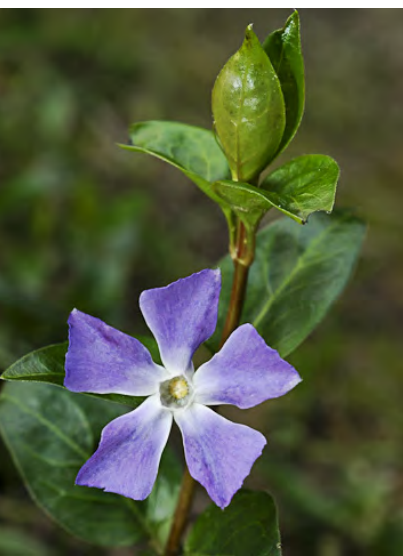
GREATER PERIWINKLE (Vinca major) Naturalized Perennial - Dogbane Family -(Mar-Jun(Jan)) - Coastal bluffs, sheltered places, esp along stream beds - Plant sprawling. Leaf blade ~ 2.8" long, oval. Flower purple-blue, 1.2-2" wide at top. INVASIVE weed.