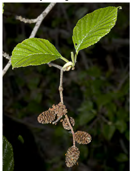
WHITE ALDER (Alnus rhombifolia) Native Perennial - Birch Family - (Apr–Jun) - Along permanent streams - Tree. Leaves flat, not rusty underneath, margins serrate, not rolled under. Female flowers cone-like. Wood used for furniture and for smoking meats.