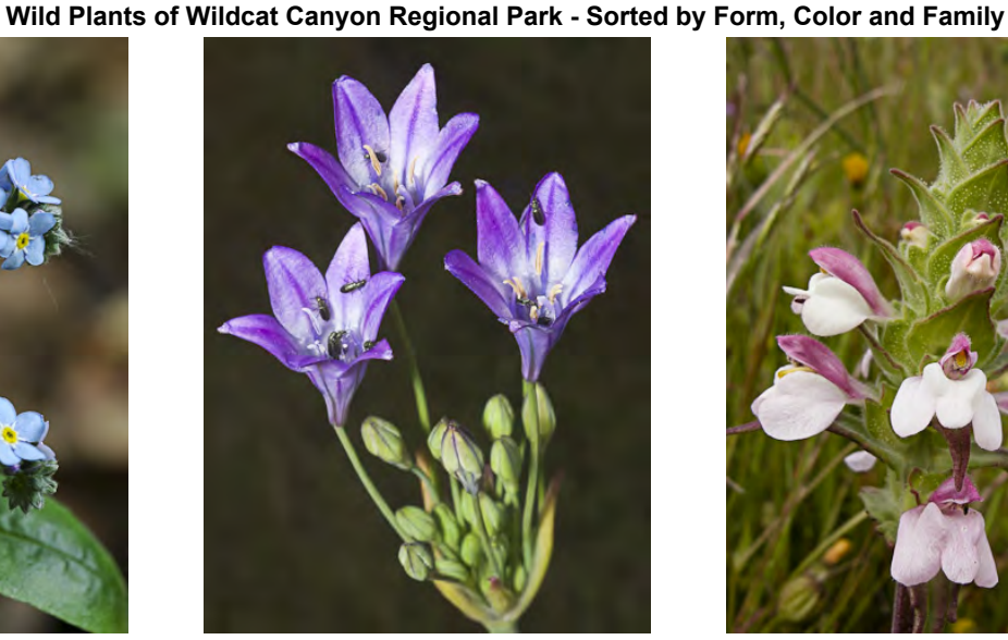
ITHURIEL'S SPEAR (Triteleia laxa) Native Perennial - Brodiaea Family - (Apr-Jun) -Common. Open forest, conifer or foothill woodland, grassland on clay soil - Flower stem 4-28". Leaves 8-16", 0.16-1" wide. Flowers blue, blue-purple or white, 0.7-1.9" long.