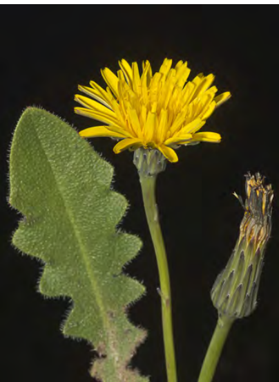
ROUGH CAT'S-EAR (Hypochaeris radicata) Naturalized Perennial - Sunflower Family (Apr–Jul) - Disturbed areas, grassland, open woodland - Plant 4-32" tall, rough-hairy. Rays 0.4-0.6" long, well exceeding head bracts. Fruits all beaked. INVASIVE weed.