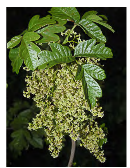
WESTERN POISON OAK (Toxicodendron diversilobum) Native Perennial - Sumac Family - (Apr–Jun) - Canyons, slopes, chaparral, coastal scrub, oak woodland - Shrub or vine. Leaflets 3, red in fall, mid leaflet stalked. Flowers green. Fruits white. TOXIC.