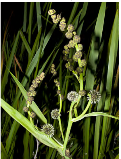
BROAD-FRUITED BUR-REED (Sparganium eurycarpum var. eurycarpum) Native Perennial - Cattail Family - (Jun-Aug) - Marshes, lakes, ponds, along streams - Plant to 8' tall. Flower cluster stem branched, clusters spherical. Styles