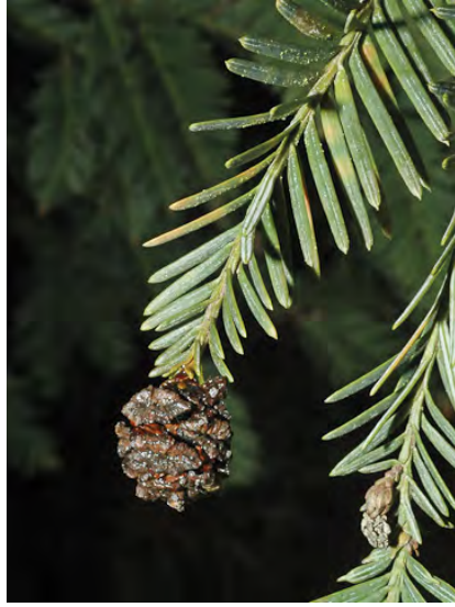
REDWOOD (Sequoia sempervirens) Native Perennial - Cypress Family - - - Redwood forest - Tree to 380' tall, evergreen. Leaves alternate: on rapidly growing stems awl-like, < 0.3" long; others flat, 0.2-1" long. Seed cone 0.5-1.4" diam, woody.