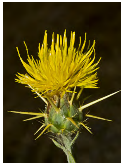
YELLOW STAR-THISTLE (Centaurea solstitialis) Naturalized Annual - Sunflower Family (May-Oct) - Invasive, roadsides, disturbed grassland or woodland - Plant 4-39" tall. Leaves woolly, extend down the stem. Flower bract spines 0.4-1" long. NOXIOUS weed.