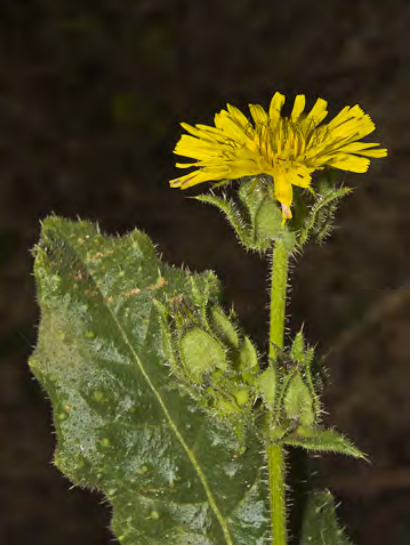
BRISTLY oX-TONGUE (Helminthotheca echioides) Naturalized Annual-Biennial - Sunflower Family - (All year) - Common. Disturbed areas - Stem 1-6.5' tall, bristly. Leaf 2-8" long, covered with prickly bumps. Flower heads 0.8-1.6" wide. INVASIVE weed.