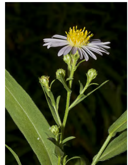
COMMON CALIFORNIA WILD ASTER (Symphyotrichum chilense) Native Perennial - Sunflower Family - (Jun-Oct) - Grassland, salt marshes, disturbed places - Plant 16-39", partly hairy. Leaf 1.6-6", 0.2-1.2" wide. Rays violet, 0.3-0.5" long.