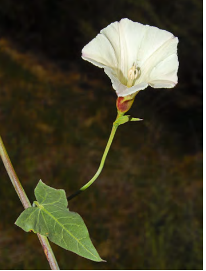
CLIMBING MORNING-GLORY (Calystegia purpurata subsp. purpurata) Native Perennial - Morning-glory Family - (May–Jun) - Chaparral, coastal scrub - Stem strongly climbing. Leaf triangular, lobes strongly angled. Bractlets smooth, small, distant.