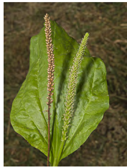
COMMON PLANTAIN (Plantago major) Naturalized Annual-Perennial - Plantain Family -(Apr–Sep) - Disturbed areas - Leaves basal, blades 5-18 cm long, broadly oval, not hairy. Flowers + stem 2-24" tall, flower cluster gen 1.2-8" long.