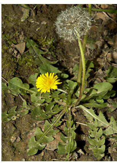
COMMON DANDELION (Taraxacum officinale) Naturalized Biennial-Perennial - Sunflower Family - (All year) - Abundant. Esp disturbed areas - Stem hollow. Leaves bright green with sharp down-pointing lobes. Outer head bracts reflexed. Fruit ~ brown.