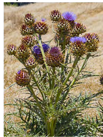
ARTICHOKE THISTLE (Cynara cardunculus subsp. flavescens) Naturalized Perennial - Sunflower Family - (Apr-Jul) - Disturbed places - Plant 1.6-8' tall. Artichoke head 1.6-6" diam, spine-tipped. Flowers blue or purple, 1.2-2" long. NOXIOUS weed.