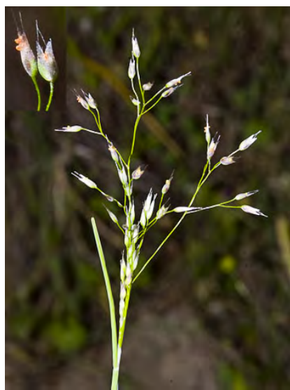
SILVER HAIR GRASS (Aira caryophyllea) Naturalized Annual - Grass Family - (Apr–Jun) Sandy soils, open or disturbed sites - Flower cluster > 0.6" wide, diffuse with long slender branches. Spikelets about 0.1" long with 2 extended awns.