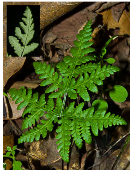
GOLDENBACK FERN (Pentagramma triangularis subsp. triangularis) Native Perennial - Brake Fern Family - - - Gen shaded, sometimes rocky or wooded areas - Leaves triangular, 1.2-4" long, undersides either granular green or powdery gold.