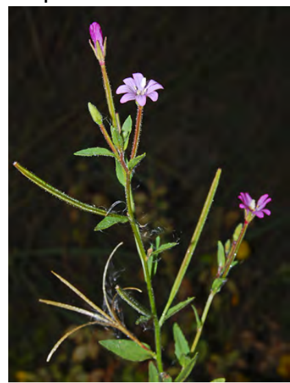
CHAPARRAL WILLOWHERB (Epilobium minutum) Native Annual - Evening Primrose Family - (Apr–Sep) - Dry, open, disturbed areas, vernal pools, often after fire - Plant < 16" tall. Flower cluster open. Petals 0.1-0.2" long, white or pink. Leaves flat, not clustered.