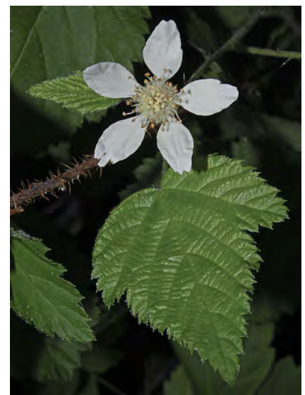
CALIFORNIA BLACKBERRY (Rubus ursinus) Native Perennial - Rose Family - (Mar–Jul) - Open, disturbed areas - Stem round, bristly/prickly. Leaves simple to 3 leaflets, underside green. Plants unisexual. Petals 0.24-0.6" long, white. Blackberry-type fruit.