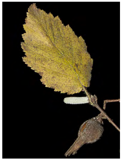
CALIFORNIA HAZELNUT (Corylus cornuta subsp. californica) Native Perennial - Birch Family - (Jan–Mar) - Common. Many habitats, esp moist, shady places - Shrub, small tree < 13' tall. Leaf velvetry-hairy. Fruits 0.8-1.2" long in papery bracts, 1-2/group.