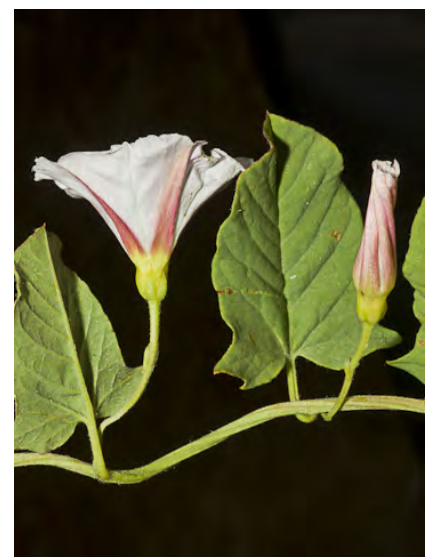
BINDWEED (Convolvulus arvensis) Naturalized Perennial - Morning-glory Family - (Mar–Oct) - Roadsides, open areas in many pl communities - Trailing. Leaf 0.8-1.2" long, w/round tip, pointed lobes. Flowers white to pink, 0.8-1" long. NOXIOUS.