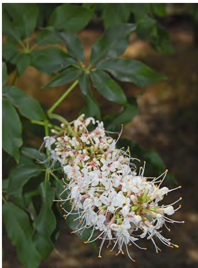
CALIFORNIA BUCKEYE (Aesculus californica) Native Perennial - Soapberry Family - (May–Jun) - Dry slopes, canyons, borders of streams - Large shrub or tree 13-39' tall. 5-7 leaflets. Flowers white to pale rose. Large seeds toxic but edible after leaching out saponins.