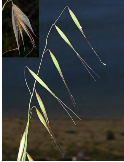
SLENDER WILD OAT (Avena barbata) Naturalized Annual - Grass Family - (Mar-Jun) - Disturbed sites - Plants gen 24-32". Spikelets 0.8-1.2" long. Awns 0.8-1.8" long. Lemma tip bristles >= 0.1" long. Seeds EDIBLE whole or ground for flour. INVASIVE weed.