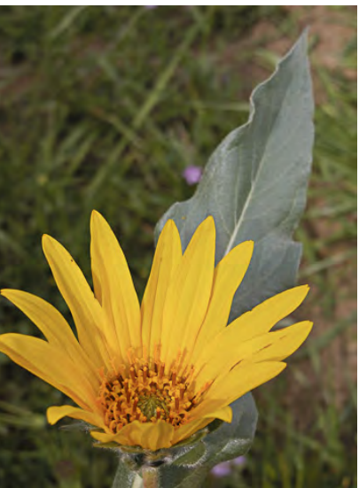
NARROW-LEAVED MULE'S EARS (Wyethia angustifolia) Native Perennial - Sunflower Family - (Apr-Aug) - Grassland - Plant 4-35" tall, rough-hairy. Leaves narrow, veins all similar, base blades 4-20" long. Ray flowers 0.6-1.8"