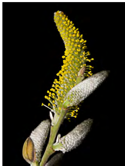
ARROYO WILLOW (Salix lasiolepis) Native Perennial - Willow Family - (Jan-Jun) - Common. Shores, marshes, meadows, etc - Shrub-tree, bark smooth. Leaf-like stipules. Leaf egg-shaped, waxy below. Fruit smooth, bract persistent, dark, stamens 2.