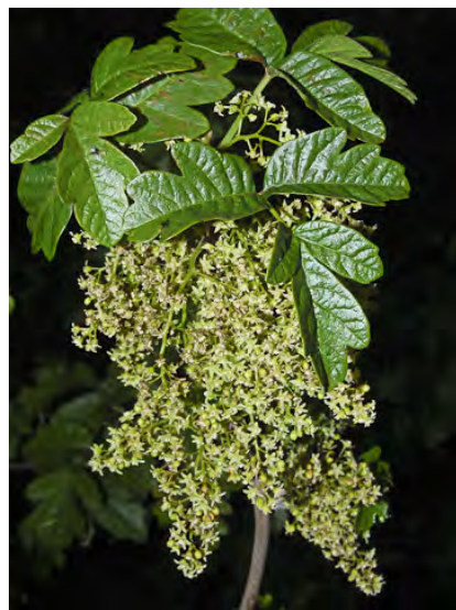
WESTERN POISON OAK (Toxicodendron diversilobum) Native Perennial - Sumac Family - (Apr-Jun) - Canyons, slopes, chaparral, coastal scrub, oak woodland - Shrub or vine. Leaflets 3, red in fall, mid leaflet stalked. Flowers green. Fruits white. TOXIC.