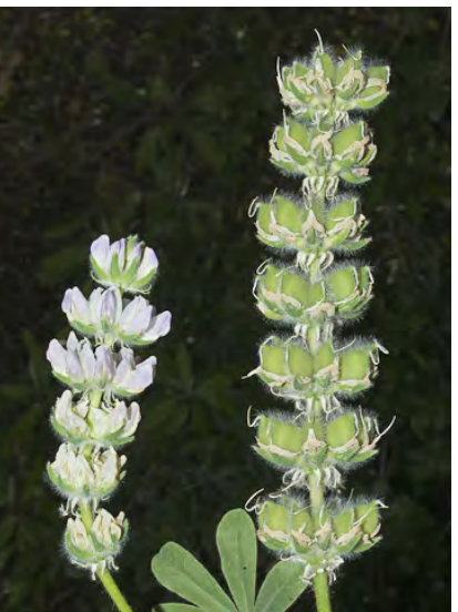
CHICK LUPINE (Lupinus microcarpus var. microcarpus) Native Annual - Pea Family - (Mar–Jun) - Abundant. Open or disturbed areas, occ seeded on roadbanks - Plant 4-32", hairy. Leaves smooth above. Flowers gen pink to purple. Flower bracts shaggy.