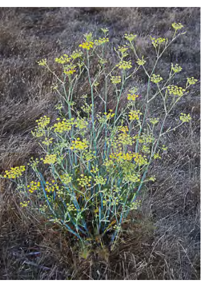
FENNEL (Foeniculum vulgare) Naturalized Perennial - Carrot Family - (May–Sep) - Roadsides, disturbed sites - Plants 3-6.5' tall, anise-scented. Stems waxy-blue, canelike. Flowers yellow. Leaf segments thread-like, edible when young. INVASIVE weed.