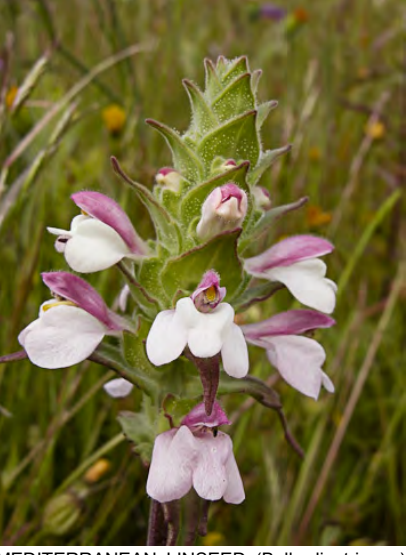
MEDITERRANEAN LINSEED (Bellardia trixago) Naturalized Annual - Broom-rape Family -(Apr-Jun) - Disturbed grassland. - Plant sticky-hairy. Stem 6-32" tall. Leaves lance-shaped, toothed. Flowers 0.8-1" long, 2-lipped: upper lip pink, lower lip white. INVASIVE.