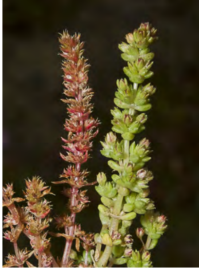
PYGMY WEED (Crassula connata) Native Annual - Stonecrop Family - (Feb–May) - Open areas - Plants 0.8-2.4"+ tall, red in age. Flowers < 0.1" long, 2 per node; Sepals 4, pointed end. Petals generally < sepals.