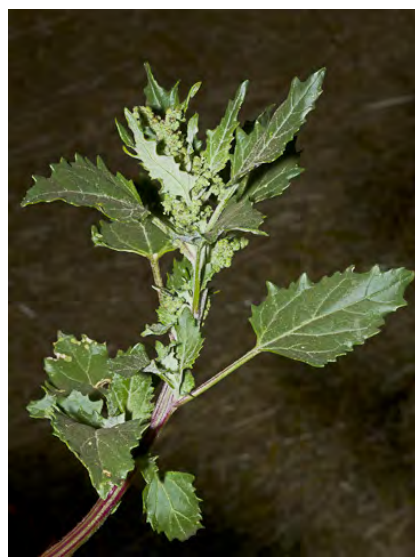
WALL GOOSEFOOT (Chenopodium murale) Naturalized Annual - Goosefoot Family - (All year) - Common. Disturbed areas, fields - Plant 6-24" tall. Leaves dark green, shiny, broad, toothed. Seeds horizontal, bumpy, rim angled.