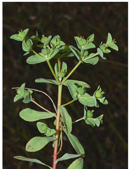
WART SPURGE (Euphorbia spathulata) Native Annual - Spurge Family - (Mar–Jun) - Open, gen disturbed places - Stem 6-17" tall, smooth. Leaves spoon-shaped, 0.4-1.2" long, finely toothed. Gland oblong.