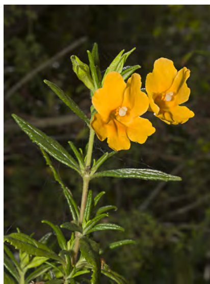
BUSH MONKEYFLOWER (Mimulus aurantiacus var. aurantiacus) Native Perennial - Lopseed Family - (Mar–Jun) - Disturbed areas, coastal cliffs, canyon sides - Shrub 4-60". Flowers yellow, orange or red; 1-2.3" long; bract tube glabrous.