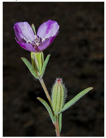
FOUR-SPOT (Clarkia purpurea subsp. quadrivulnera) Native Annual - Evening Primrose Family - (Apr–Aug) - Common. Open, grassy or shrubby places - Buds erect. Petals < 0.6", lavender to dark red. Ovary 8-grooved. Sepals 1's or 2's.