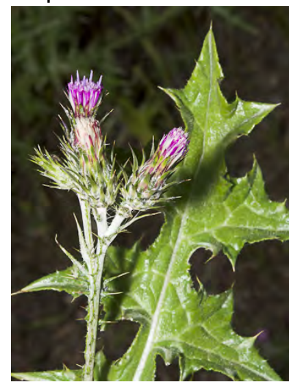
ITALIAN THISTLE (Carduus pycnocephalus subsp. pycnocephalus) Naturalized Annual - Sunflower Family - (Mar–Jul) - Roadsides, pastures, disturbed areas - Stems 8-79", narrow spiny-wings. Lower leaves 4-10 lobed, heads 2-5, flower bracts woolly. NOXIOUS.