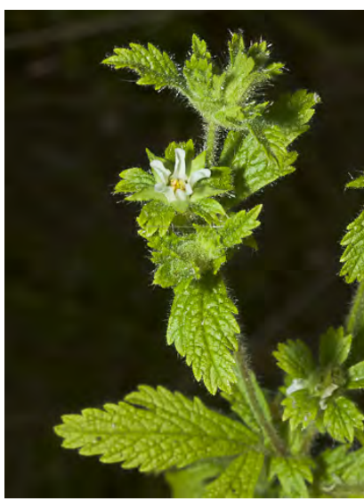
UNLOBED CALIFORNIA HORKELIA (Horkelia californica var. frondosa) Native Perennial - Rose Family - (May–Oct) - Coastal scrub, canyons, poison-oak thickets - Plant 4-48". Leaflets 0.6-2.4" long, 3-5 per side, cut < 1/4 to base.