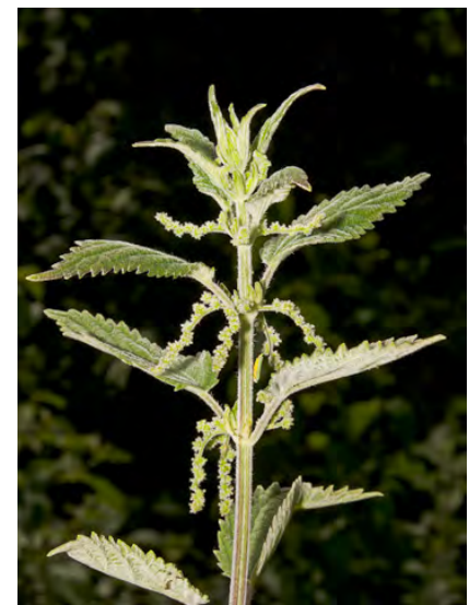
HOARY NETTLE (Urtica dioica subsp. holosericea) Native Perennial - Nettle Family - (Jun-Sep) - Meadows, seeps, springs, margins of marshes, streams, lakes, moist areas in chaparral, coastal scrub - Plant 3.3-9.8' tall, grayish, covered with stinging hairs.