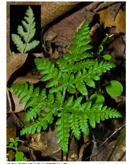
GOLDENBACK FERN (Pentagramma triangularis subsp. triangularis) Native Perennial - Brake Fern Family - - - Gen shaded, sometimes rocky or wooded areas - Leaves triangular, 1.2-4" long, undersides either granular green or powdery gold.