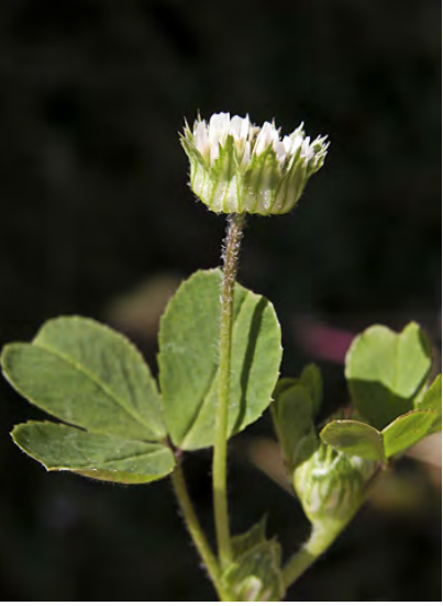
THIMBLE CLOVER (Trifolium microdon) Native Annual - Pea Family - (Mar–Jun) - Common locally. Open, moist or dry, gen disturbed areas - Short-hairy. Head bract w/flat base. Flowers white to pink. Calyx lobes < 1/2 flower tube length, < flowers.