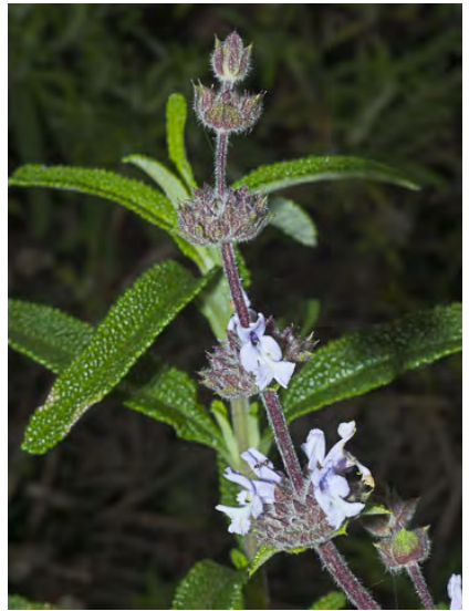
BLACK SAGE (Salvia mellifera) Native Perennial - Mint Family - (Mar–Jun) - Coastal-sage scrub, lower chaparral - Shrub 3.3-6' tall. Leaf 1-2.8" long, toothed, hairy underneath. Flowers blue, white or lavender, tube 0.2-0.4" long, in clusters 0.6-1.6" wide.