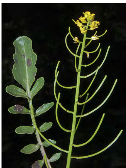
ERECT-POD WINTER CRESS (Barbarea orthoceras) Native Perennial - Mustard Family - (Mar–Jul) - Meadows, streambanks, moist woodland, grassland - Stem 8-24". Lower leaves w/large terminal lobe, upper clasping stem. Petals bright yellow, 0.2-0.3" long.