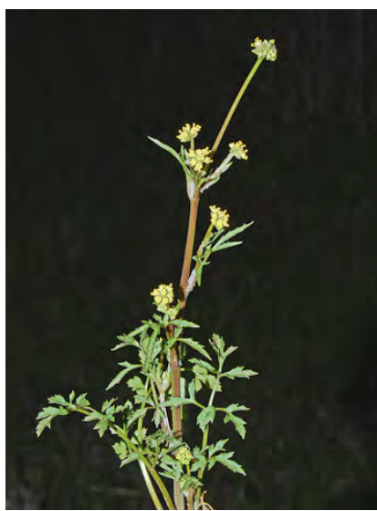
POISON SANICLE (Sanicula bipinnata) Native Perennial - Carrot Family - (Apr-May) - Open grassland or pine/oak woodland - Plants 5-24" tall. Leaves 2x pinnate. Flowers yellow, male flower stalk < fruit. Reported to be slightly TOXIC.