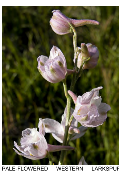
PALE-FLOWERED WESTERN LARKSPUR (Delphinium hesperium subsp. pallescens) Native Perennial - Buttercup Family - (Mar–May) - Oak woodland, e slope coast ranges - Plant gen 16-32" w/short-hairy base. Flowers white, pinkish or It blue.