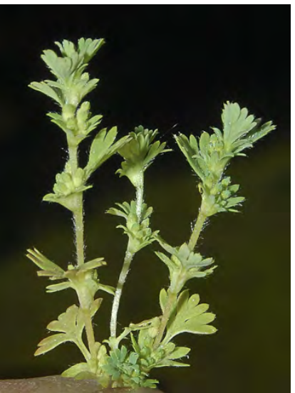
LADY'S MANTLE (Aphanes occidentalis) Native Annual - Rose Family - (Mar–May) - Seasonally moist grassland, chaparral, woodland - Plant inconspicuous, soft hairy, < 4" tall. Leaves 0.1-0.5" long, deeply lobed. Flowers yellow-green, < 0.1" long.