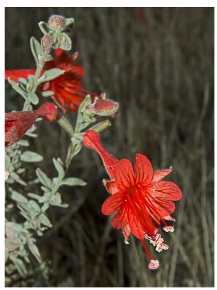
CALIFORNIA FUCHSIA (Epilobium canum subsp. canum) Native Perennial - Evening Primrose Family - (Jun-Dec) - Dry slopes, ridges - Plant hairy, gen sticky with a woody base. Leaf 0.3-2.8" long, gray to green. Flowers red-orange, floral tube 0.8-1.2" long.