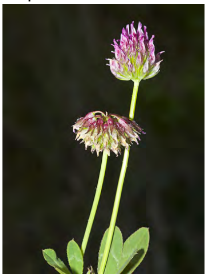
FOOTHILL CLOVER (Trifolium ciliolatum) Native Annual - Pea Family - (Mar—Jun) - Locally common. Grassland, chaparral, disturbed areas -Flower head 0.3-0.8" wide w/vestigial bract. Flowers pink to purple, soon reflexed, bracts w/short, flat bristles.