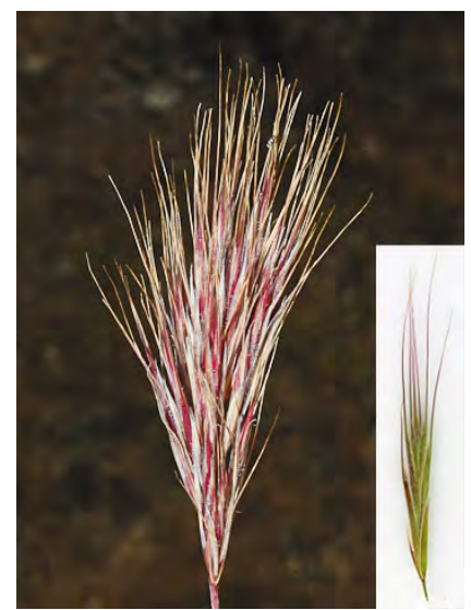
RED BROME (Bromus madritensis subsp. rubens) Naturalized Annual - Grass Family - (Mar–Jun) - Disturbed areas, roadsides - Plant 4-20". Flower cluster condensed, branches obscure, < spikelets. Stem & sheathes hairy. INVASIVE weed.