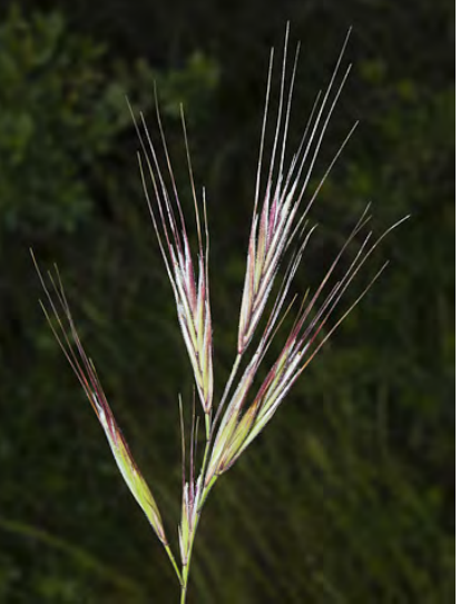
FOXTAIL CHESS (Bromus madritensis subsp. madritensis) Naturalized Annual - Grass Family - (Apr-Jan) - Disturbed areas, roadsides - Plants 4-20" tall. Stem and sheathes smooth. Flower cluster branches visible, lower spikelets erect, >