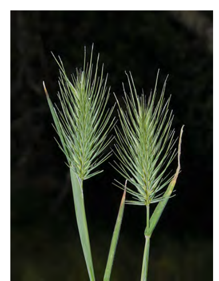
MEDITERRANEAN BARLEY (Hordeum marinum subsp. gussoneanum) Naturalized Annual - Grass Family - (Apr-Jun) - Dry to moist, disturbed sites - Stem 4-20". Leaf blades to 32" long, auricles < 0.08". Central lemma awn 0.25-0.7" long. INVASIVE weed.