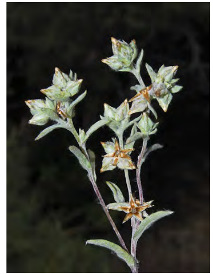
DAGGERLEAF COTTONROSE (Logfia gallica) Naturalized Annual - Sunflower Family - (Mar-Jul) - Bare or grassy openings, burns - Plant 1-20" tall, gen cobwebby. Leaves awl-shaped, stiff, > flower heads. Flowers brown to yellow.