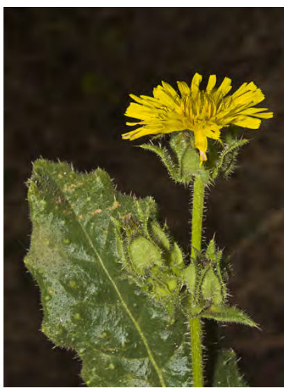
BRISTLY OX-TONGUE (Helminthotheca echioides) Naturalized Annual-Biennial - Sunflower Family - (All year) - Common. Disturbed areas - Stem 1-6.5' tall, bristly. Leaf 2-8" long, covered with prickly bumps. Flower heads 0.8-1.6" wide. INVASIVE weed.