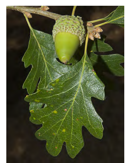
VALLEY OAK (Quercus lobata) Native Perennial - Oak Family - (Mar–Apr) - Slopes, valleys, savanna - Tree < 115' tall, deciduous. Leaves 2-5" long, not leathery, deeply lobed, lobes without bristles. Acorns 1.2-2" long, slender, cup 0.4-1.2" deep.