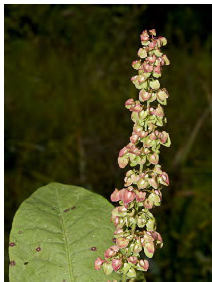
CURLY DOCK (Rumex crispus) Naturalized Perennial - Buckwheat Family - (All year) - Abundant. Disturbed places - Stem 16-39" tall. Flower cluster dense, valves 0.2-0.24", winged around tubercles, smooth edged. 1 tubercle enlarged. INVASIVE.