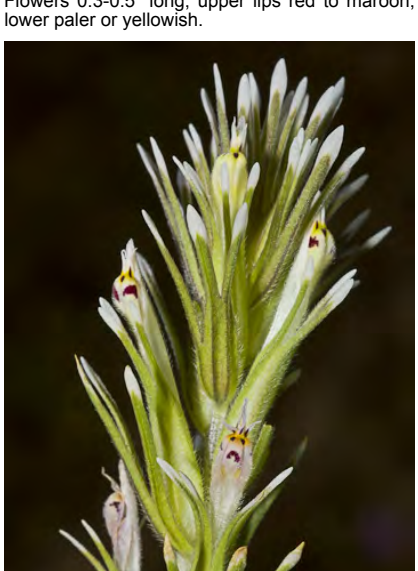
VALLEY TASSELS (Castilleja attenuata) Native Annual - Broom-rape Family - (Mar–May) - Grassland - Plant 4-20" tall, hairy, non-sticky. Leaves 0.8-3.1" long, narrow, 0-3 lobes. Flower cluster 1-12" long, narrow, tips white or pale yellow.