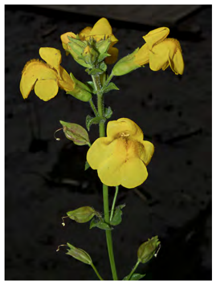
GOLDEN MONKEYFLOWER (Mimulus guttatus) Native Perennial - Lopseed Family - (Mar-Aug) - Common. Wet places, gen terrestrial, occ emergent or floating in mats - Plant 0.8-60". Flower yellow, gen > 0.8" long; mature bracts flattened sideways, inflated in fruit.