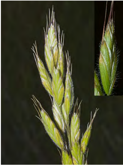
SOFT CHESS (Bromus hordeaceus) Naturalized Annual - Grass Family - (Apr-Jul) - Fields, disturbed areas - Plant 4-26" tall. Leaf hairy. Flower cluster 1-5" long, dense, some stalks > spikelet. Spikelet 0.5-0.9". Lemma 0.26-0.4", awn 0.16-0.4". INVASIVE weed.