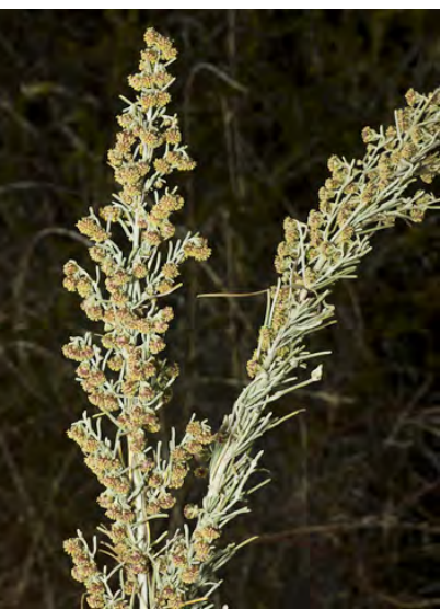
CALIFORNIA SAGEBRUSH (Artemisia californica) Native Perennial - Sunflower Family - (Aug-Nov) - Coastal scrub, chaparral, open woodland - Shrub 2-8.5' tall, rounded. Leaves 0.4-4", hairy, thread-like, It green to gray. Flower heads < 5 mm wide. Sage-scented.