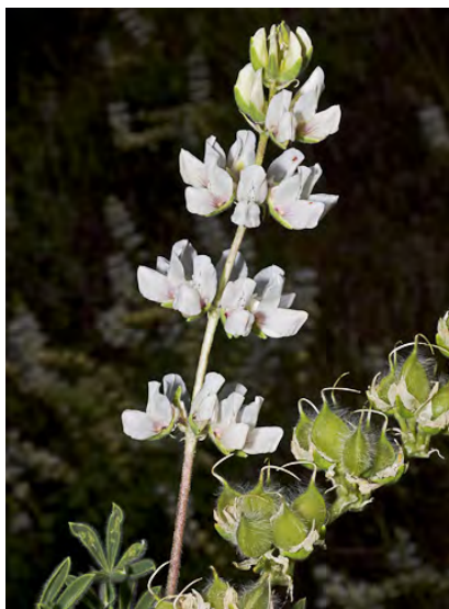
GULLY LUPINE (Lupinus microcarpus var. densiflorus) Native Annual - Pea Family - (Apr–Jun) - Abundant. Open or disturbed areas, occ seeded on roadbanks - Plant 4-32" tall, hairy. Flowers 0.3-0.7" long, white to yellow. Flower bract hairs few, short.