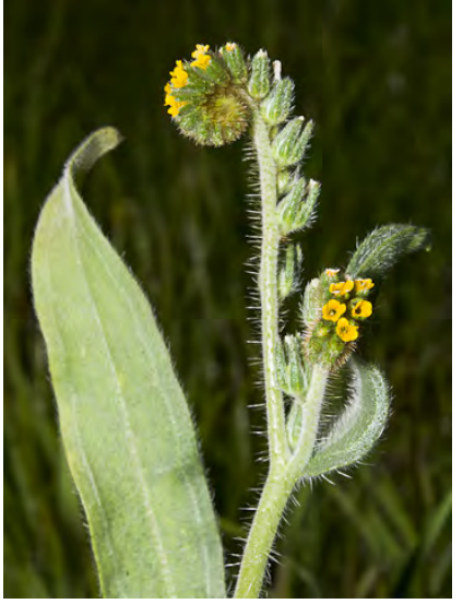
SMALL-FLOWERED FIDDLENECK (Amsinckia menziesii) Native Annual - Borage Family - (May-Jul) - Shade-tolerant, open, disturbed areas at forest/woodland edges - Flowers yellow to orange-yellow, generally spotted, 0.2-0.3" long, 0.1" wide. Leaves coarse-hairy.