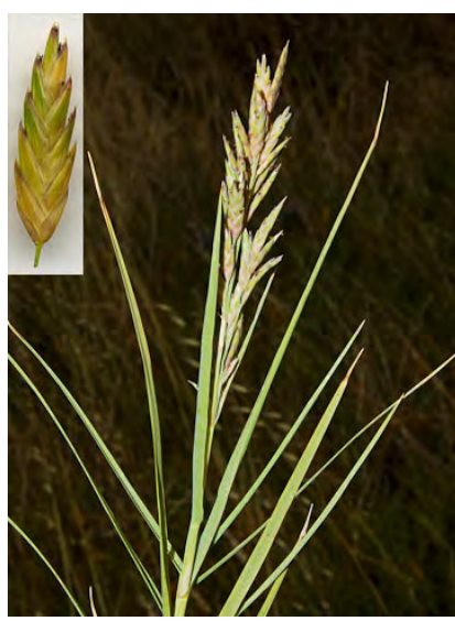
SALT GRASS (Distichlis spicata) Native Perennial - Grass Family - (Apr-Sep) - Salt marshes, coastal dunes, moist, alkaline areas - Stem 4-20" long. Leaves 0.8-4" long, flat, stiff. Flower cluster 0.8-3" long, narrow. Spikelets straw-colored to purple, 2-20/group, 0.24-0.8" long