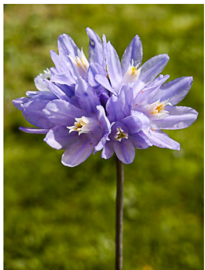
BLUE DICKS (Dichelostemma capitatum subsp. capitatum) Native Perennial - Brodiaea Family - (Mar-Jun) - Open woodland, scrub, desert, grassland - Plant 2-28" tall. Flowers blue-purple, not narrowed in the middle. Stamens 6. Early spring bloomer.