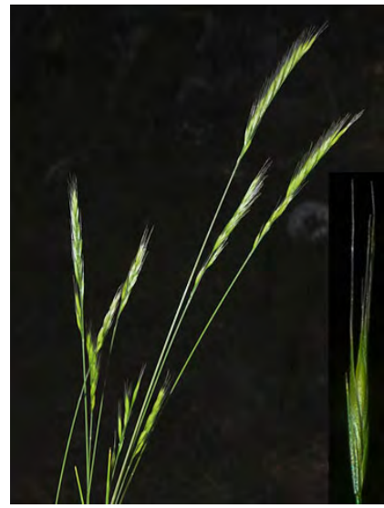
BROME FESCUE (Festuca bromoides) Naturalized Annual - Grass Family - (May–Jun) -Uncommon. Dry, disturbed places, coastal-sage scrub, chaparral - Stem < 20". Inflor 0.6-6" tall, dense, lower branches erect. Spikelet 0.2-0.4" long, awn 0.1-0.3" long.