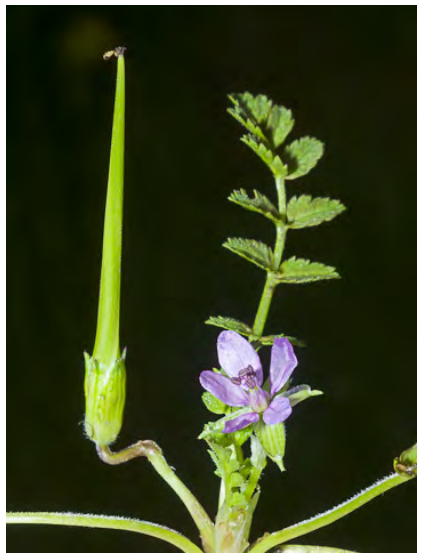
LONG-BEAKED FILAREE (Erodium botrys) Naturalized Annual - Geranium Family -(Mar-Jul) - Dry, open or disturbed sites - Stem 2-35" tall, coarse-hairy. Leaves lobed. Petals pink, 0.3-0.5" long. Sepals w/reddish tip. Fruit beak 2-4.7" long.