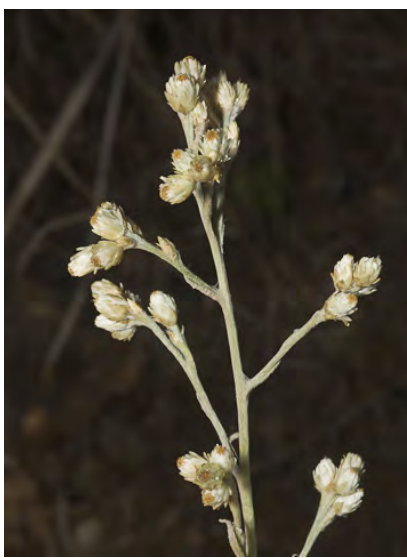
SCENTED WHITE EVERLASTING (Pseudognaphalium beneolens) Native Biennial - Sunflower Family - (Jun–Oct) - Dry, open slopes, disturbed sites - Leaves narrow, woolly. Heads white, 0.2-0.24" long.