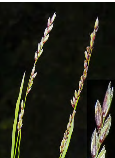
CALIFORNIA MELIC (Melica californica) Native Perennial - Grass Family - (Apr–May) - Open or rocky hillsides, oak woodland, conifer forest - Stem 16-55". Leaf 0.06-0.2" wide. Spiklet 0.2-0.6" long, w/3-7 fertile florets; sterile tip widest above middle, tip squared.