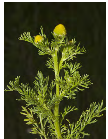
PINEAPPLE WEED (Matricaria discoidea) Naturalized Annual - Sunflower Family -(Feb-Aug) - Abundant. Disturbed sites, riverbanks - Plant 4-12" tall, sweet-scented. Heads pineapple-shaped, ~ 0.4" wide; head stalk to 0.6" long.