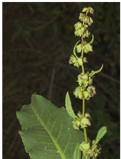
FIDDLE DOCK (Rumex pulcher) Naturalized Perennial - Buckwheat Family - (May–Sep) - Disturbed places, meadows, moist or dry habitats - Stem 8-24" long, branches widely spreading. Leaf blades 1.6-4" long, 1.2-2" wide. Valves w/2-5 teeth.