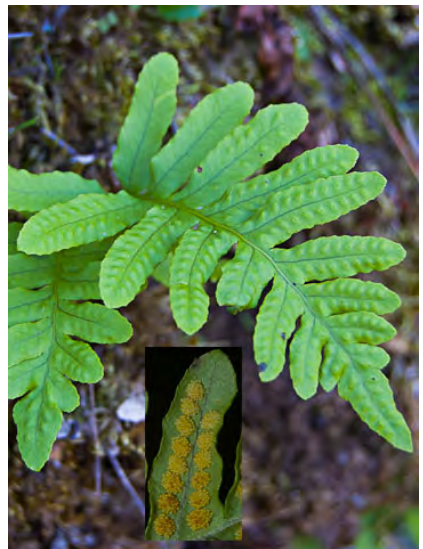
POLYPODY FERN (Polypodium calirhiza) Native Perennial - Polypody Family - - On plants, rocky cliffs or outcrops, roadcuts, often granitic or volcanic, rarely dunes - Leaf blades 4-8" long, often widest above base, deeply lobed.