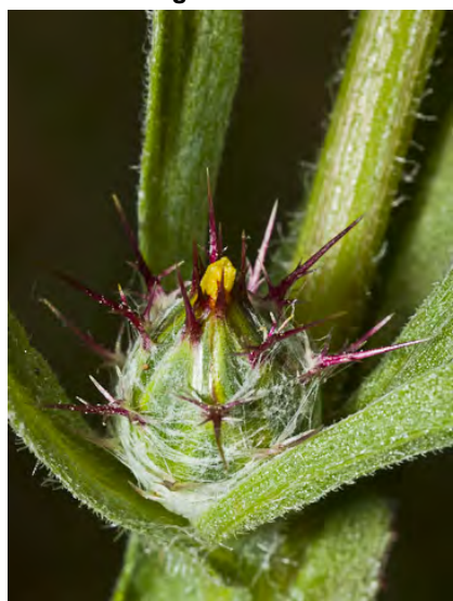
TOCALOTE (Centaurea melitensis) Naturalized Annual - Sunflower Family - (Apr–Jul) - Disturbed fields, open woodland - Plant 4-39", gray-hairy, resinous. Leaves 0.8-6" long. Flowers yellow, 0.4-0.8" long, bracts tipped w/purple spines. NOXIOUS weed.