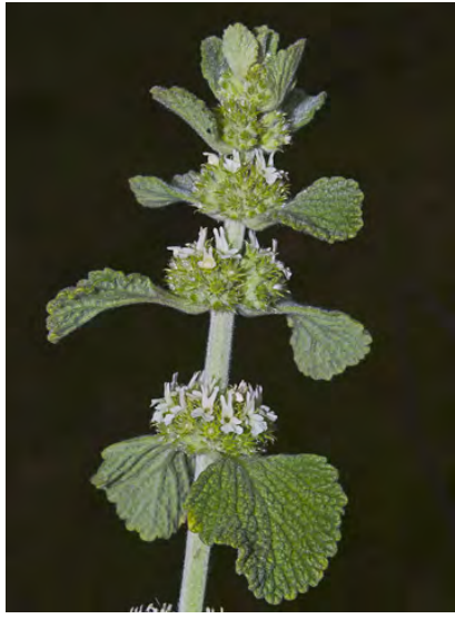
COMMON HOREHOUND (Marrubium vulgare) Naturalized Perennial - Mint Family - (Mar-Nov) - Disturbed sites, gen overgrazed pastures - Stem 4-24" long. Leaf blades 0.6-2.2" long. Flower bract w/10 hook-tipped teeth. Flowers white, ~0.2" long. INVASIVE.