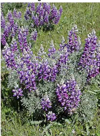
BUSH LUPINE (Lupinus albifrons var. albifrons) Native Perennial - Pea Family - (Mar–Jun) - Common. Chaparral, foothill woodland - Shrub 2-16' tall, gen distinct trunk, green to silvery. Flowers 0.35-0.6" long, purple, banner back hairy, keel top ciliate mid to tip.