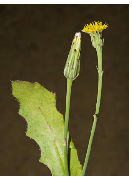
SMOOTH CAT'S-EAR (Hypochaeris glabra) Naturalized Annual - Sunflower Family - (Mar-Jun) - Common. Disturbed areas, grassland, open woodland - Plant 4-24" tall, smooth. Rays 0.2-0.3" long, barely > head bracts. Only inner fruit beaked. INVASIVE.