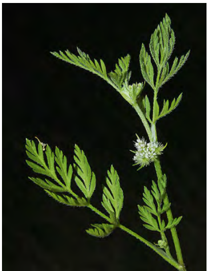
SHORT SOCK-DESTROYER (Torilis nodosa) Naturalized Annual - Carrot Family - (Apr—Jun) - Disturbed places - Plant spreading, 4-20" tall. Flowers white to red, clusters dense, < leaf. Fruit ~ 0.1" long, uncurved bristles on outer surface, bumps inside.