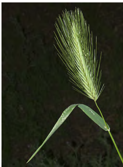
HARE BARLEY (Hordeum murinum subsp. leporinum) Naturalized Annual - Grass Family - (Feb-May) - Moist, gen disturbed sites. Common - Stem 12-43" tall. Central spikelet stalk ~0.06" long. Central floret << lateral florets. INVASIVE