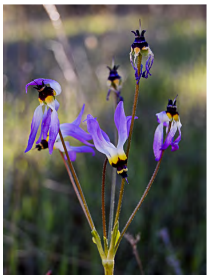
PADRE SHOOTING STAR (Dodecatheon clevelandii subsp. patulum) Native Perennial - Primrose Family - (Mar–May) - Moist places, often on serpentine or in ± alkaline sites - Leaf blade length >2x width. Flowers often white. Filiment tube w/light spots below anthers.