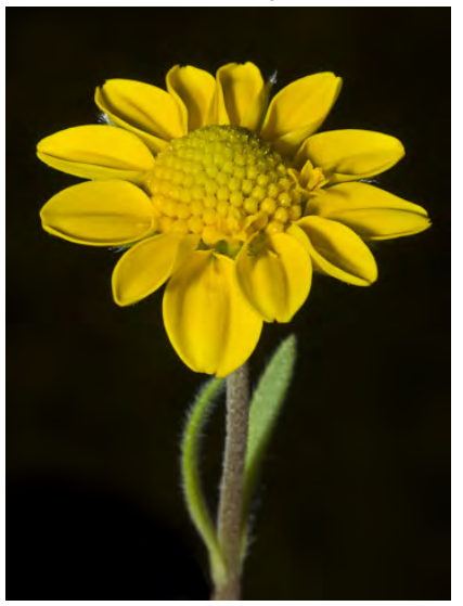
CALIFORNIA GOLDFIELDS (Lasthenia californica subsp. californica) Native Annual - Sunflower Family - (Feb-Jun) - Many habitats - Stem < 16" tall, hairy. Leaves 0.3-2.8" long, <0.25" wide, smooth edged. Head bracts 4-13, not joined. Rays 0.2-0.7" long.