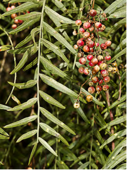
PEPPER TREE (Schinus molle) Naturalized Perennial - Sumac Family - (Jun-Aug) - Washes, slopes, abandoned fields - Tree 16-60' tall. Flowers white to yellow. Leaves compound, leaflets stemless. Fruits pink to red, 0.2-0.3"