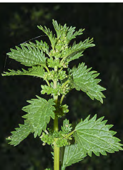
DWARF NETTLE (Urtica urens) Naturalized Annual - Nettle Family - (Jan-Jun) - Disturbed areas, stream banks, shaded areas in grassland, oak woodland, chaparral, coastal-sage scrub, riparian woodland - Leaf teeth sharp. Petals 2 large, 2 small, free to base.