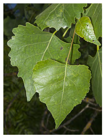
FREMONT COTTONWOOD (Populus fremontii subsp. fremontii) Native Perennial - Willow Family - (Mar–Apr) - Scattered. Alluvial bottomland, streamsides - Tree < 66' tall. Leaves heart-shaped to triangular, coarsely scalloped, blade 1.2-2.8" long.