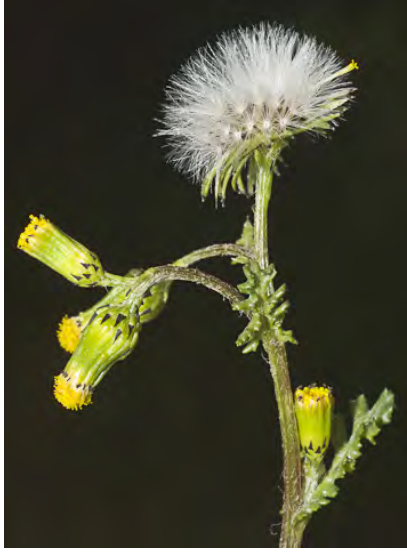
COMMON GROUNDSEL (Senecio vulgaris) Naturalized Annual - Sunflower Family -(Feb-Jul) - Common. Disturbed areas - Plant 4-24" tall, not hairy, w/1-10+ stems. Flower head bracts with black-tips. Milky sap.