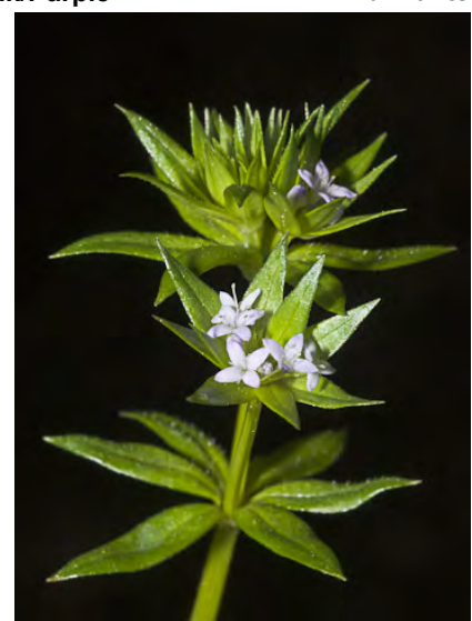
FIELD MADDER (Sherardia arvensis) Naturalized Annual - Madder Family - (Mar–Jul) -Pastures, disturbed areas, grassland, dry meadows, oak woodland - Stem 2.8-6.3" long. Leaves in whorls of 5-6, 0.2-0.5" long. Flowers pink or lavender, the 4 lobes < tube.