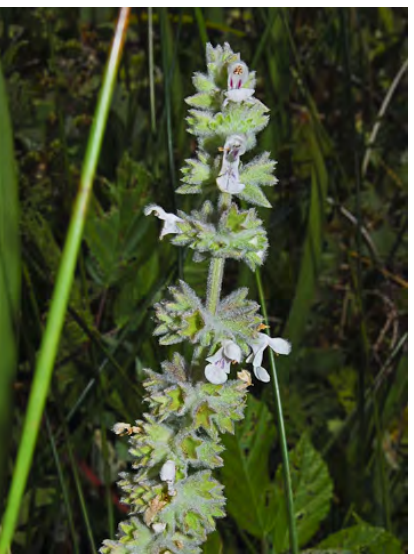
WHITE-STEM HEDGE-NETTLEE (Stachys albens) Native Perennial - Mint Family - (May-Oct) - Swamps, seeps - Plant 1.6-8' tall, densely cobwebby-hairy. Leaf felty, blade 1.2-6" long. Flowers white to pink; tube 0.2-0.4" long, hidden in bracts.