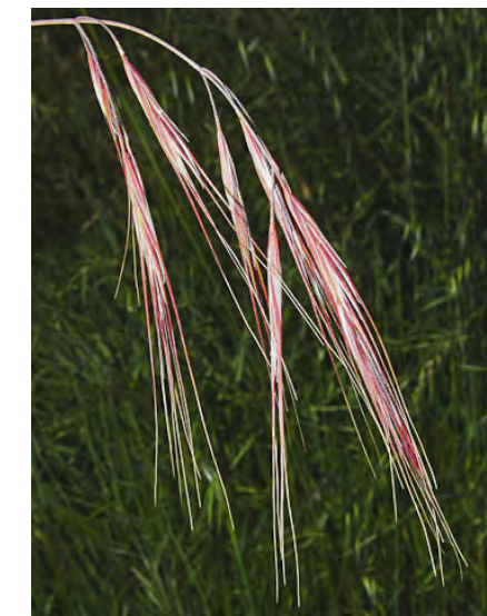
RIPGUT GRASS (Bromus diandrus) Naturalized Annual - Grass Family - (Apr-Jul) - Open, gen disturbed areas - Plant 6-40" tall. Spikelet 1-2.8" long. Lemma body 0.8-1.2" long, awn > 1.2" long. Barbed seeds can stick in flesh of animals. INVASIVE weed.