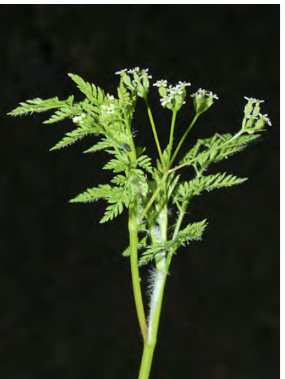
BUR-CHERVIL (Anthriscus caucalis) Naturalized Annual - Carrot Family - (Apr-Jun) - Generally shady places - Plant 18-40" tall. Flowers white; flower stalk >= fruit length. Fruits 0.1-0.2" long with curved "velcro" bristles. Leaves fern-like, triangular outline.