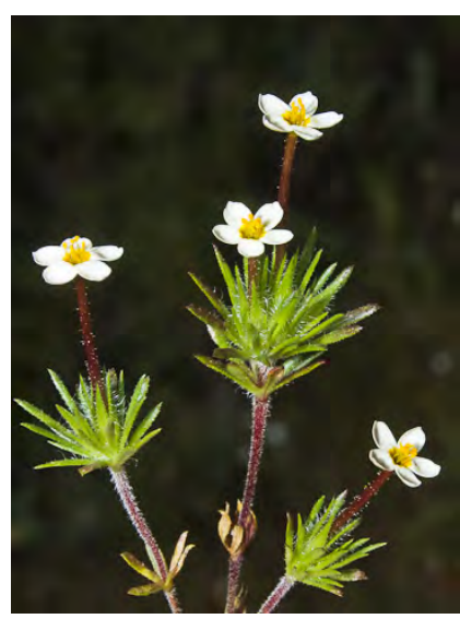
BICOLOR LEPTOSIPHON (Leptosiphon bicolor) Native Annual - Phlox Family - (Mar–Jun) - Common. Open, grassy areas, chaparral, woodland - Plant 0.8-8.3" tall, hairy. Flower lobes ~0.1" long, pink or white; tube red; stigma <=0.02" long.