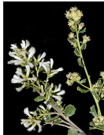
COYOTE BRUSH (Baccharis pilularis subsp. consanguinea) Native Perennial - Sunflower Family - (Jul-Dec) - Coastal bluffs, woodland, grassland, disturbed sites, occ on serpentine - Shrub < 15' tall, brittle, common. Leaves gen 0.6-1.6" long.