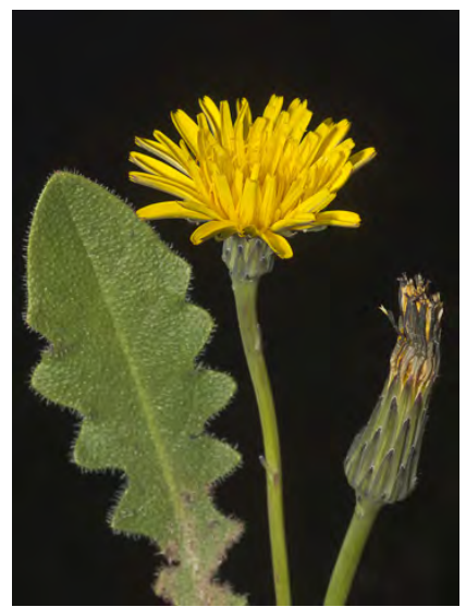
ROUGH CAT'S-EAR (Hypochaeris radicata) Naturalized Perennial - Sunflower Family - (Apr–Jul) - Disturbed areas, grassland, open woodland - Plant 4-32" tall, rough-hairy. Rays 0.4-0.6" long, well exceeding head bracts. Fruits all beaked. INVASIVE weed.