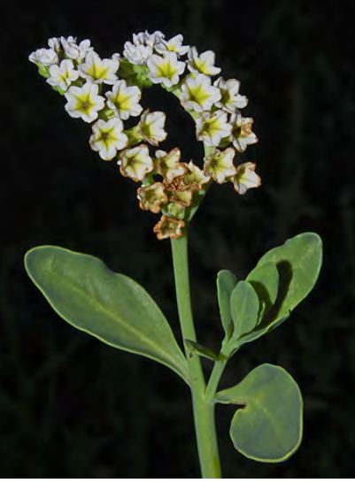
SEASIDE HELIOTROPE (Heliotropium curassavicum var. oculatum) Native Perennial - Borage Family - (Feb-Oct) - Moist to dry, saline to alkaline soils, gen near water - Plant fleshy. Leaf 0.4-2.4 cm long. Flowers white w/ yellow center, 0.12-0.2" long.