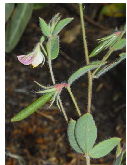
SPANISH CLOVER (Acmispon americanus var. americanus) Native Annual - Pea Family - (May-Oct) - Coast, chaparral, waterways, roadsides, disturbed areas - Plant 2-24", hairy. Flowers white to pink, solitary, bract lobes >> flower tube.