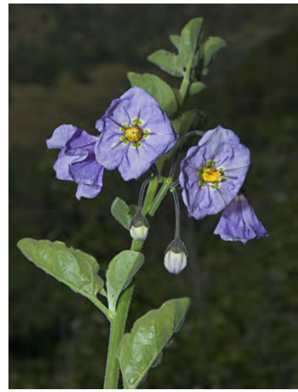
BLUE WITCH (Solanum umbelliferum) Native Perennial - Nightshade Family - (All year) -Shrubland, mixed-evergreen forest, woodland -Plant gen < 39", upper stem hairs branched, dense. Flowers 0.6-1" wide, purple, with green spots at the base.