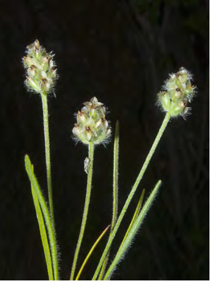
CALIFORNIA DWARF PLANTAIN (Plantago erecta) Native Annual - Plantain Family - (Mar–May) - Sandy, clay, serpentine soil; grassy slopes, flats, open woodland - Leaf 1.2-5" long, linear, hairy. Flowers + stem 1.2-12" tall, cluster 0.2-1.2" long.