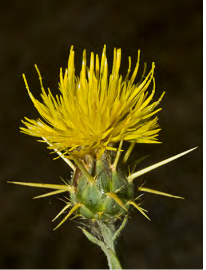
YELLOW STAR-THISTLE (Centaurea solstitialis) Naturalized Annual - Sunflower Family (May-Oct) - Invasive, roadsides, disturbed grassland or woodland - Plant 4-39" tall. Leaves woolly, extend down the stem. Flower bract spines 0.4-1" long. NOXIOUS weed.