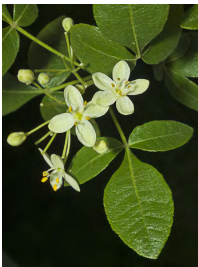
WESTERN HOP TREE (Ptelea crenulata) Native Perennial - Rue Family - (Apr-May) - Scrub, woodland - Shrub/tree < 16' tall. Leaflets 3, 0.8-2.8" long, citrus odor when crushed. Petals green-white, 0.16-0.2" long, fragrant. Fruits 1-2