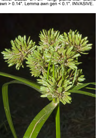
TALL NUTSEDGE (Cyperus eragrostis) Native Perennial - Sedge Family - (May–Nov) - Vernal pools, streambanks - Leaves basal. Flower cluster bracts 4-8. Spikelets 0.2-0.8" long, oblong, in heads to 1.6" wide. Seeds short-stalked.