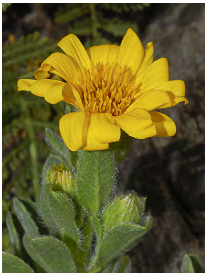
BOLANDER GOLDENASTER (Heterotheca sessiliflora subsp. bolanderi) Native Perennial - Sunflower Family - (Jun—Sep) - Dunes, headlands, grassy coastal slopes - Plant gen 8-28", unbranched. Leaves wide, soft-hairy. Heads clustered, rays 0.3-0.6".