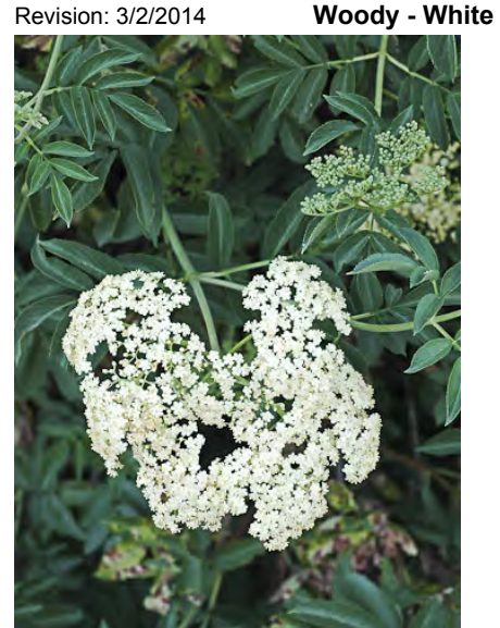
BLUE ELDERBERRY (Sambucus nigra subsp. caerulea) Native Perennial - Muskroot Family -(Mar–Sep) - Common. Streambanks, open places in forest - Shrub 7-26' tall. Flower cluster flat-topped, 1.6-13" diam, petals spreading. Fruits waxy blue-black.