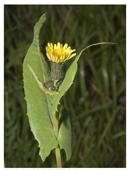
COMMON SOW THISTLE (Sonchus oleraceus) Naturalized Annual - Sunflower Family - (All year) - Abundant. Disturbed places - Plant 4-55" tall. Leaf teeth soft to touch. Basal lobes of upper leaves sharply pointed, straight to curving upward.