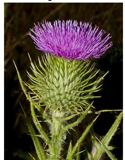
BULL THISTLE (Cirsium vulgare) Naturalized Biennial - Sunflower Family - (May-Oct) - Common. Disturbed areas - Plant 12-79" tall. Top of leaves bristly; leaf base forming decurrent wings on stem. Flowers purple, gen 1-2" wide. NOXIOUS weed.