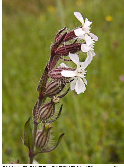
SMALL-FLOWER CATCHFLY (Silene gallica) Naturalized Annual - Pink Family - (Spring-early summer) - Fields, disturbed areas - Plant 4-16". Leaves < 1.4" long. Flower cluster short-hairy, bracts sticky-hairy, petal blade 0.2-0.5" long, smooth to notched, white to pink.