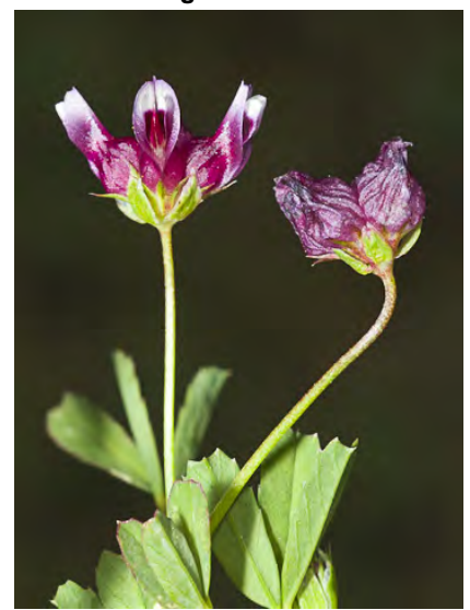
TRUNCATE SACK CLOVER (Trifolium depauperatum var. truncatum) Native Annual чераиретацип var. truncatum) Native Annual -Pea Family - (Apr–Jun) - Grassy flats, disturbed slopes, openings in woodland - Head bracts <= 0.1" long. Flowers pink-purple. Fruit ~0.1" long, inflated, stalked.