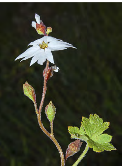
WOODLAND STAR (Lithophragma affine) Native Perennial - Saxifrage Family - (Mar–Apr) - Open, grassy slopes - Plant 4-24" tall. Leaves w/3-5 sharp-toothed shallow lobes, stem leaves alternate. Petals 0.2-0.5" long, white. Hypanthium funnel-shaped.