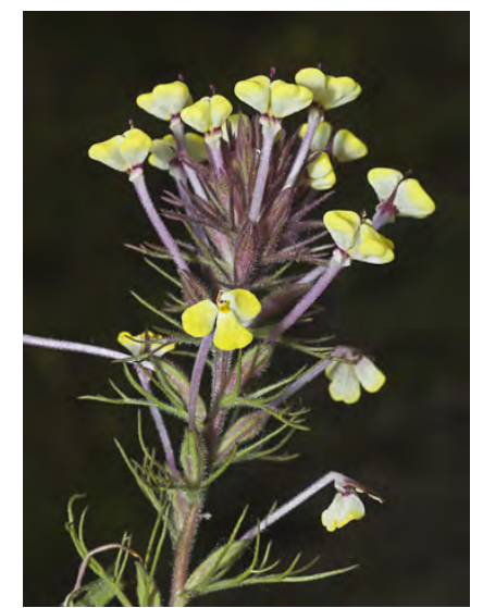
YELLOW JOHNNY-TUCK (Triphysaria eriantha subsp. eriantha) Native Annual - Broom-rape Family - (Mar–May) - Grassland, foothills - Plant 4-14" tall, purple. Leaves 0.4-2" long, 3-7 lobed. Flowers yellow with dark purple beak, 0.4-1" long.