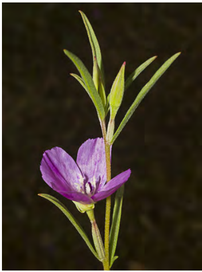
SMALL CLARKIA (Clarkia affinis) Native Annual - Evening Primrose Family - (May–Jun) - Openings in woodland, chaparral - Stem < 32". Buds erect, ovary 8-grooved, sepals united on side. Petals 0.2-0.6" long, pale pink to dark wine-red, often purple-flecked.