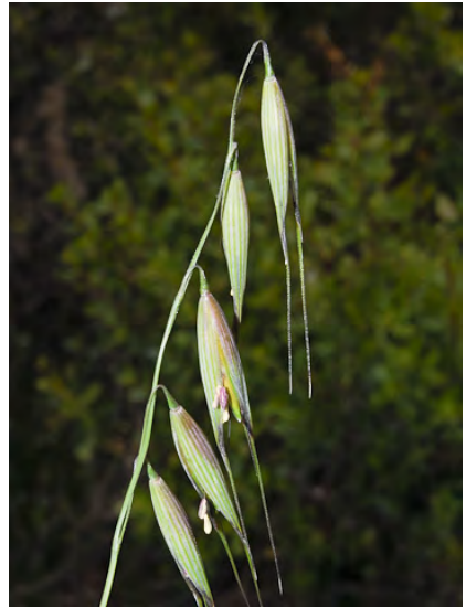
WILD OAT (Avena fatua) Naturalized Annual Grass Family - (Apr–Jun) - Disturbed sites - Plants 1-5' tall. Spikelets 0.7-1.3" long. Low awn 1-1.6" long. Lemma tip bristles < 0.04" long. Seeds EDIBLE whole or ground for flour. INVASIVE weed.