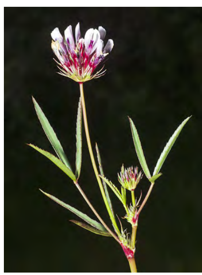
TOMCAT CLOVER (Trifolium willdenovii) Native Annual - Pea Family - (Mar-Jun) - Abundant. Disturbed, gen spring-moist, heavy soils, occas serpentine - Head bract wheel-shaped, sharp-lobed. Leaf narrow. Flowers purple w/white tip, 0.3-0.6" long.