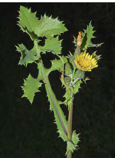
PRICKLY SOW THISTLE (Sonchus asper subsp. asper) Naturalized Annual - Sunflower Family - (All year) - Common. Slightly moist disturbed sites, along streams - Plant 4-48". Leaf teeth prickly. Basal lobes of upper leaves rounded, curving downward.