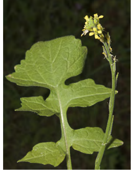
HEDGE MUSTARD (Sisymbrium officinale) Naturalized Annual - Mustard Family - (Apr–Sep) - Disturbed areas, fields, pastures - Stem 10-22" tall, thin, wiry. Petals 0.1-0.16" long, pale yellow. Fruit 0.4-0.55" long, awl-shaped, appressed.