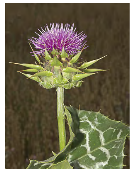
MILK THISTLE (Silybum marianum) Naturalized Annual-Biennial - Sunflower Family - (Feb–Jun) - Roadsides, pastures, disturbed areas - Stem 1-10', stout. Leaves spiny, shiny green wiwhite veins and spots. Flowers red-purple. INVASIVE weed.