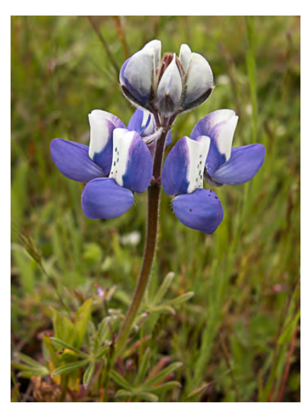
SKY LUPINE (Lupinus nanus) Native Annual -Pea Family - (Mar–Jun) - Abundant. Open or disturbed areas - Plant 4-24" tall, hairy. Flowers blue to pink to white, 0.2-0.6" long; banner as wide as long. Flower stalk gen > 0.12" long.