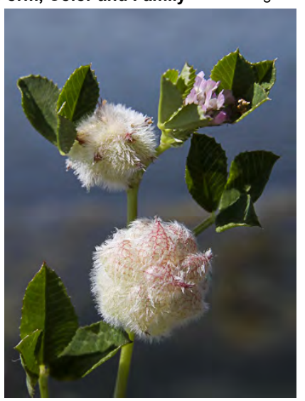
STRAWBERRY CLOVER (Trifolium fragiferum) Naturalized Perennial - Pea Family - (Late spring) - Roadsides, gen in saline soil - Head bracts 0.08" long, green. Flowers pink, 0.2-0.24" long, quickly hidden by hairy inflated flower bracts.