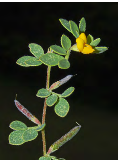
CALIFORNIA LOTUS (Acmispon wrangelianus) Native Annual - Pea Family - (Mar–Jun) - Abundant. Coastal bluffs, chaparral, disturbed areas - Low growing. Flowers yellow aging red, 0.2-0.4" long, almost stemless. Bract lobes same length as flower tube.