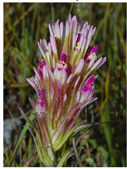
COMMON OWL'S-CLOVER (Castilleja densiflora subsp. densiflora) Native Annual - Broom-rape Family - (Mar–May) - Grassland - Plant 4-16" tall. Leaves 0.8-3.1" long, narrow-lobed. Flower cluster gen rose-purple. Flower upper lip straight.