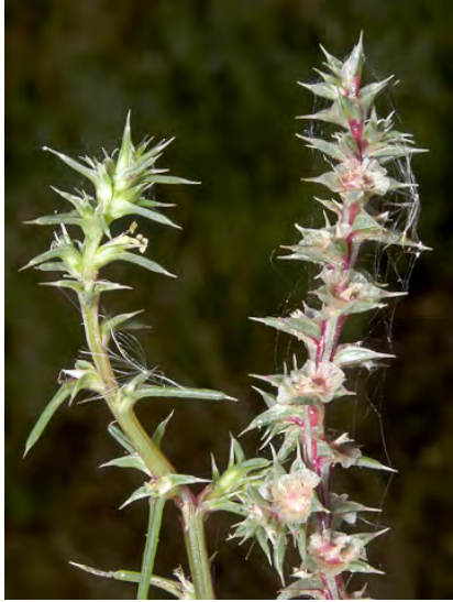
RUSSIAN THISTLE (Salsola tragus) Naturalized Annual-Perennial - Goosefoot Family - (Jul-Oct) - Common. Disturbed places - Plant < 5' tall. Stem gen red-striped, widely branched. Leaves succulent, 0.3-2" long, upper spine-tipped. NOXIOUS.