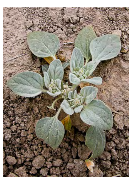
TURKEY-MULLEIN (Croton setigerus) Native Annual - Spurge Family - (May-Oct) - Dry, open, often disturbed areas - Plant < 8" tall, moundlike, covered w/long stiff hairs. Leaf blade 0.4-2" long, oval. TOXIC to livestock.