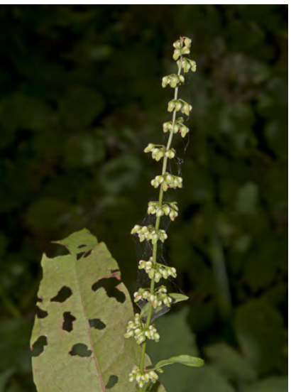
GREEN DOCK (Rumex conglomeratus) Naturalized Perennial - Buckwheat Family (May-Aug) - Common. Moist places - Stem 12-32" tall, unbranched below. Flower cluster open. Fruit valves ~0.1" long, scarcely winged around the 3 tubercles, smooth edged.