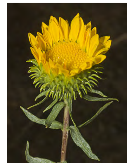
GREAT VALLEY GUMPLANT (Grindelia camporum) Native Perennial - Sunflower Family - (May-Nov) - Sandy or saline bottomland, roadsides - Stem non-woody, 2-8' tall, whitish. Leaves gen resinous. Head to 1.2" wide, bracts bend downward.