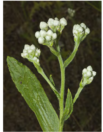
CALIFORNIA EVERLASTING (Pseudognaphalium californicum) Native Biennial - Sunflower Family - (Apr-Jul) - Sandy canyons, dry hills, coastal chaparral - Stem 8-51" tall. Leaves green + glandular on both sides. Heads white, spheric, 0.2-0.24" long.