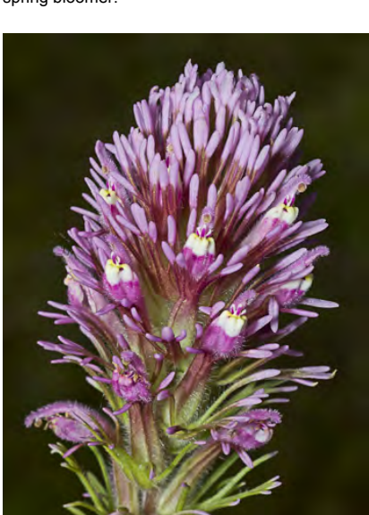
PURPLE OWL'S-CLOVER (Castilleja exserta subsp. exserta) Native Annual - Broom-rape Family - (Mar–May) - Open fields, grassland - Plant sticky, short-hairy. Flower cluster tipped white, pale yellow or rose. Flower upper lip hooked, fuzzy.