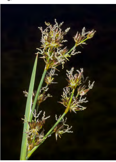
IRIS-LEAVED RUSH (Juncus xiphioides) Native Perennial - Rush Family - (Jul-Oct) - Wet places - Plant 16-32" tall. Leaf blades 0.2-0.5" wide, flat, Iris-like. Heads many, few-flowered. Anthers 6, < filaments, flowers self-pollinating.