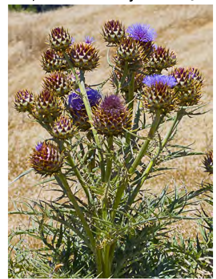
ARTICHOKE THISTLE (Cynara cardunculus subsp. flavescens) Naturalized Perennial - Sunflower Family - (Apr-Jul) - Disturbed places - Plant 1.6-8' tall. Artichoke head 1.6-6" diam, spine-tipped. Flowers blue or purple, 1.2-2" long. NOXIOUS weed.