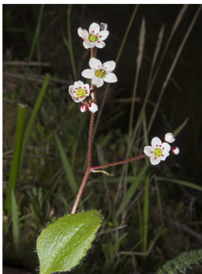
CALIFORNIA SAXIFRAGE (Micranthes californica) Native Perennial - Saxifrage Family - (Feb-May(Jun)) - Moist, shady places - Plant 6-14" tall. Leaves 1.6-4" long, at base, egg-shaped, >= 0.08" wide, toothed. Petals white, 0.1-0.18" long.