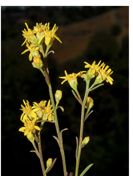
CALIFORNIA MATCHWEED (Gutierrezia californica) Native Perennial - Sunflower Family -(Jul-Nov) - Grassland, arid woodland and shrubland, serpentine - Stem 8-40" long, woody base. Leaf narrow, flat, <= 2" long. Ray flowers 4-13, 0.1-0.3" long.