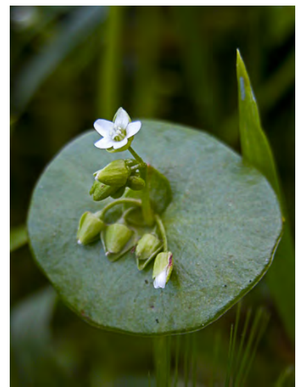
COMMON MINER'S LETTUCE (Claytonia perfoliata subsp. perfoliata) Native Annual - Miner's Lettuce Family - (Jan-May) - Vernally moist, often shady or disturbed sites - Basal leaf length <3x width. Stem leaf gen not angled. Seeds shiny w/large appendage.