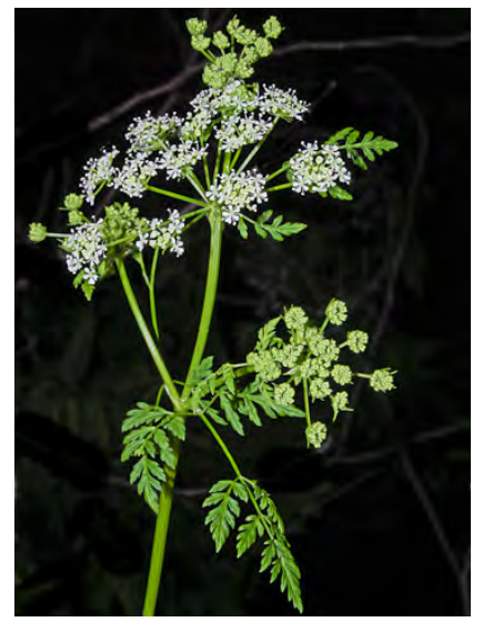
POISON HEMLOCK (Conium maculatum) Naturalized Biennial - Carrot Family - (Apr–Jul) -Common. Moist, esp disturbed places - Plants 2-10' tall. Stems purple-spotted. Leaves fern-like, gen 2x divided. Flowers white. TOXIC. INVASIVE weed.