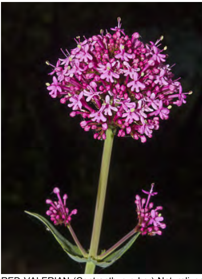
RED VALERIAN (Centranthus ruber) Naturalized Perennial - Valerian Family - (Apr–Jul) -Disturbed places, rock or wall crevices, roadsides - Stem 1-3' long, hollow, gen woody base. Leaves 2-3" long. Flowers purple-red or white, 0.5-0.7" long. Cultivar.