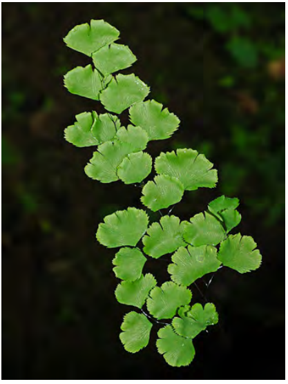
CALIFORNIA MAIDENHAIR (Adiantum jordanii) Native Perennial - Brake Fern Family - - - Shaded hillsides, moist woodland - Leaves 8-28" long with many rounded symmetrical segments, each with < 4 irregular lobes. Cultivated. Sudden Oak Death carrier.