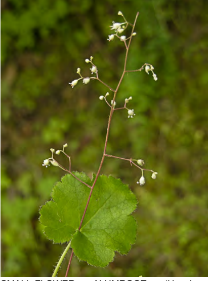
SMALL-FLOWER ALUMROOT (Heuchera micrantha) Native Perennial - Saxifrage Family - (Apr-Jul) - Moist, rocky banks and cliffs - Plant 4-40" tall. Leaf blade 0.8-4.7" long, 5-7 lobed, generally hairy. Petals white, ~ 0.1" long.