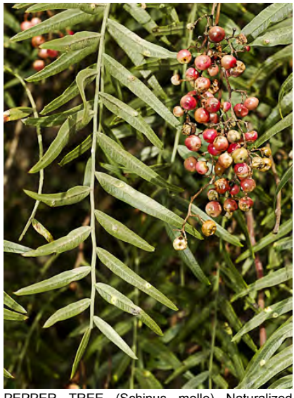
PEPPER TREE (Schinus molle) Naturalized Perennial - Sumac Family - (Jun–Aug) - Washes, slopes, abandoned fields - Tree 16-60' tall. Flowers white to yellow. Leaves compound, leaflets stemless. Fruits pink to red, 0.2-0.3" diam.