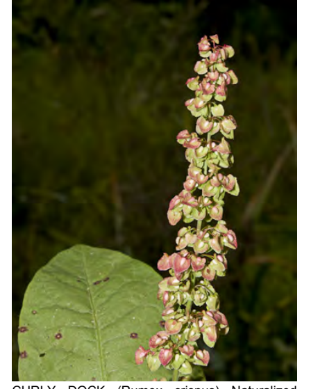
CURLY DOCK (Rumex crispus) Naturalized Perennial - Buckwheat Family - (All year) -Abundant. Disturbed places - Stem 16-39" tall. Flower cluster dense, valves 0.2-0.24", winged around tubercles, smooth edged. 1 tubercle enlarged. INVASIVE.