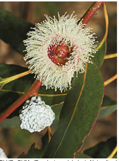
BLUE GUM (Eucalyptus globulus) Naturalized Perennial - Myrtle Family - (Oct–Jan) - Common. Disturbed areas - Tree < 200' tall. Flowers single, large, gen stemless. Leaves 4-12" long, 1-1.6" wide; used medicinally by Aboriginals. INVASIVE weed.