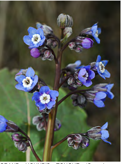
GRAND HOUND'S TONGUE (Cynoglossum grande) Native Perennial - Borage Family -(Feb–May) - Chaparral, woodland - Stem 1-3'. Leaf stalk 3-6". Leaf blade 3-6" cm long, broadly oval. Flowers bright blue w/inner white teeth.