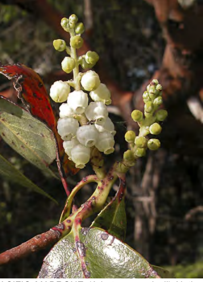
PACIFIC MADRONE (Arbutus menziesii) Native Perennial - Heath Family - (Mar–May) - Conifer, oak forests - Tree < 130' tall, evergreen, peeling red bark. Leaf blades < 5" long. Flowers yellow-white or pink, < 3.1" long. Berries red, < 0.5" diam, round.