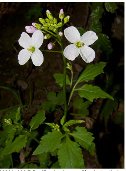
MILK MAIDS (Cardamine californica) Native Perennial - Mustard Family - (Jan-May) - Gen shaded sites, canyons, woodland. One of first spring flowers - Stem 10-24<sup>4</sup> long. Leaves lobed to compound w/sharp teeth. Petals white or pale rose, 0.3-0.5" long.