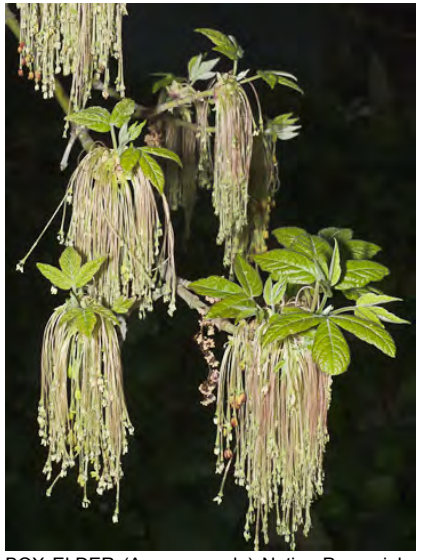
BOX ELDER (Acer negundo) Native Perennial -Soapberry Family - (Mar–Apr) - Streamsides, bottomland. - Tree < 66' tall. Leaflets in 3s. Group of 10-250 hanging flowers appear with leaves. Winged fruits. Widely planted ornamental.