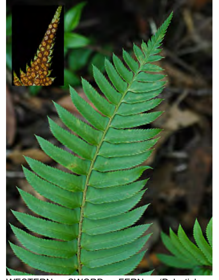
WESTERN SWORD FERN (Polystichum munitum) Native Perennial - Wood Fern Family -- Common. Wooded hillsides, shaded slopes, rarely cliffs, outcrops - Fronds gen 20-48" long, divided once. Segments usually separate, teeth point to tips, scaly rachis.