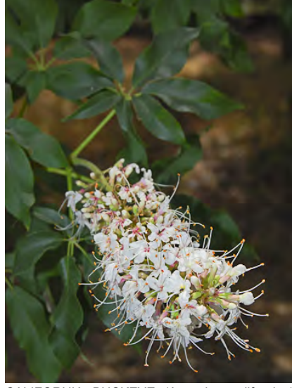
CALIFORNIA BUCKEYE (Aesculus californica) Native Perennial - Soapberry Family - (May–Jun) - Dry slopes, canyons, borders of streams - Large shrub or tree 13-39' tall. 5-7 leaflets. Flowers white to pale rose. Large seeds toxic but edible after leaching out saponins.