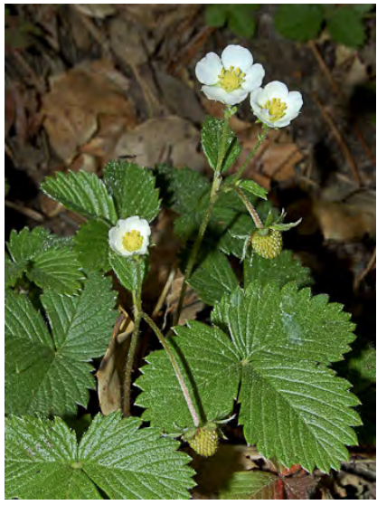
WOOD STRAWBERRY (Fragaria vesca) Native Perennial - Rose Family - (Jan–Jul) - Gen partial shade in forest - Stem gen 1.2-6" long. Leaflets 3, thin. Central leaflet gen w/12-21 teeth. Flower white, gen 0.6" wide, often above leaves. Fruit a strawberry.