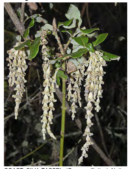
COAST SILK TASSEL (Garrya elliptica) Native Perennial - Silk Tassel Family - (Jan–Mar) -Seacliffs, sand dunes, chaparral, foothill-pine woodland - Shrub or small tree, < 26' tall. Leaves wavy-margined, underside hairs felt-like, interwoven. Fruit hairy.