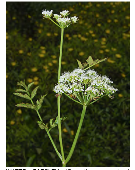
WATER PARSLEY (Oenanthe sarmentosa) Native Perennial - Carrot Family - (Jun-Oct) Streams, marshes, ponds, gen aquatic - Plant 20-60" tall. Young shoots curled, tendril-like. Leaves twice-pinnate. leaflets alike. broad. serrate to lobed. Flowers white.