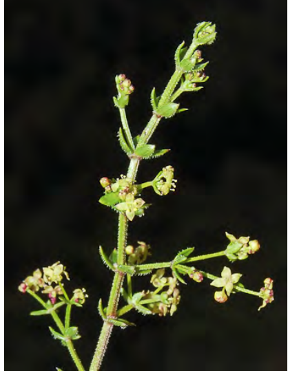
CLIMBING BEDSTRAW (Galium porrigens var. porrigens) Native Perennial - Madder Family -(May-Aug) - Among shrubs in chaparral, forest -Stem 4-59" long. Leaves 0.1-0.7" long, oval to egg-shaped, in whorls of 4. Flowers yellow to red, 4-lobed.