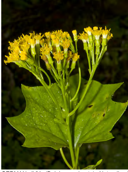
GERMAN IVY (Delairea odorata) Naturalized Perennial - Sunflower Family - (Nov–Mar) -Shady, ± disturbed places, riparian woodland, coastal scrub - Vine stem 3-20' long. Heads ~ 20 per cluster. Disk flowers bright yellow. NOXIOUS weed.