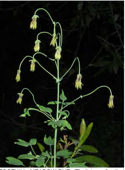
FOOTHILL MEADOW-RUE (Thalictrum fendleri var. polycarpum) Native Perennial - Buttercup Family - (Mar–Jun) - Moist, open to shaded places, woodland, forest - Plant 2-6'+ tall, male or female. Leaf 1-4x divided, 3-18" long, segments 0.3-0.8" long. No petals.