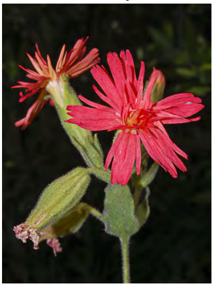
CALIFORNIA PINK (Silene laciniata subsp. californica) Native Perennial - Pink Family - (Spring-summer) - Chaparral, oak woodland, conifer forest, serpentine or not - Plant 8-28" tall. Petals 0.5-1" long, bright red.