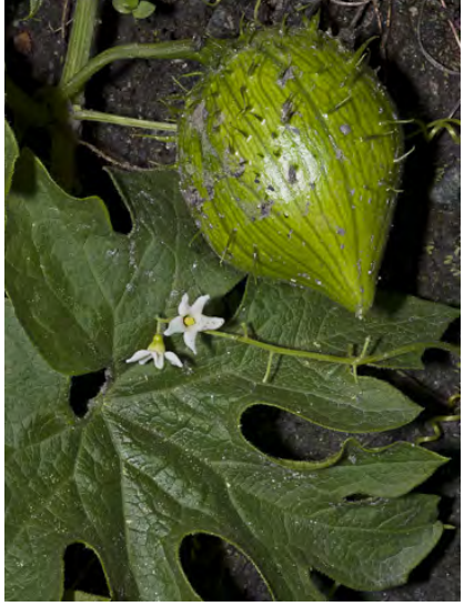
COAST MAN-ROOT (Marah oregana) Native Perennial - Gourd Family - (Mar–May) - Shrubby or open areas, forest edges - Vine 3-20' long. Leaves deeply lobed. Flowers white, deep cup-shaped, > 0.3" wide. Fruit smooth at end.