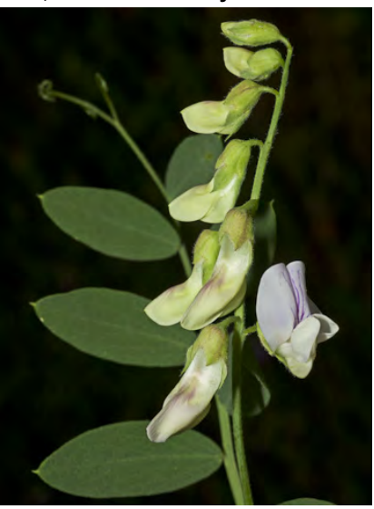
PACIFIC PEA (Lathyrus vestitus var. vestitus) Native Perennial - Pea Family - (Feb–Jul) - North: Conifer forest. South: chaparral & oak woodland Stem wings to 0.02" wide. Leaves gen elliptic. Flowers 0.5-0.7" long, pale lavender to purple.