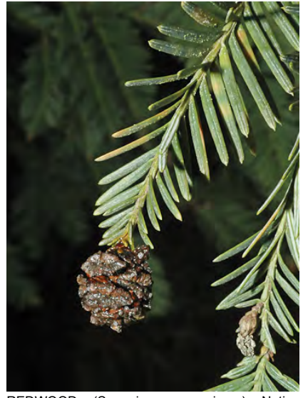
REDWOOD (Sequoia sempervirens) Native Perennial - Cypress Family - - - Redwood forest -Tree to 380' tall, evergreen. Leaves alternate: on rapidly growing stems awl-like, < 0.3" long; others flat, 0.2-1" long. Seed cone 0.5-1.4" diam, woody.