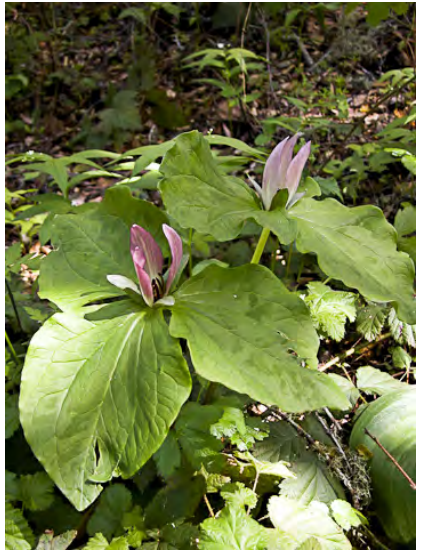
GIANT TRILLIUM (Trillium chloropetalum) Native Perennial - Bunchflower Family - (Apr–May) -Edges of redwood forest, chaparral, gen moist slopes, canyon banks in alluvial soils - Flowers dark purple to white, sessile. Petals 2.6-4" long, odor rose-like or spicy.