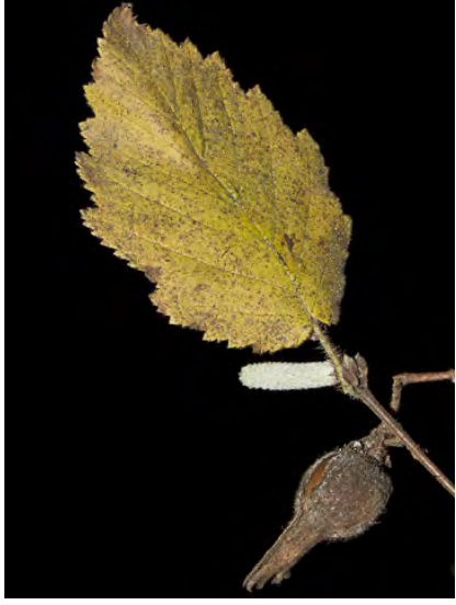
CALIFORNIA HAZELNUT (Corylus cornuta subsp. californica) Native Perennial - Birch Family - (Jan-Mar) - Common. Many habitats, esp moist, shady places - Shrub, small tree < 13' tall. Leaf velvetry-hairy. Fruits 0.8-1.2" long in papery bracts, 1-2/group.