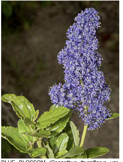
BLUE BLOSSOM (Ceanothus thyrsiflorus var. thyrsiflorus) Native Perennial - Buckthorn Family -(Mar–Jun) - Bluffs, slopes, canyons, chaparral, coastal scrub, closed-cone-pine forest - Leaves alternate, 3 main veins. Twigs angled, ridged lengthwise.