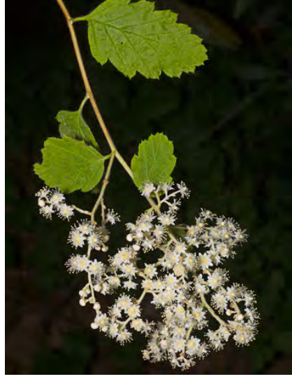
OCEANSPRAY (Holodiscus discolor var. discolor) Native Perennial - Rose Family -(May–Aug) - Moist woodland edges, rocky slopes - Shrub 5-20' tall. Leaf blade 0.6-3.1" long, toothed at end. Flower cluster 0.8-10" long. Petals white, ~0.07" long.