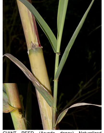
GIANT REED (Arundo donax) Naturalized Perennial - Grass Family - (Mar–Sep) - Moist places, seeps, ditchbanks - Stem 6-33' tall, matures woody. Leaves evenly spaced on stem. Flower cluster 8-28" tall, up to 5" wide. Spikelet ~0.5" long. NOXIOUS weed.