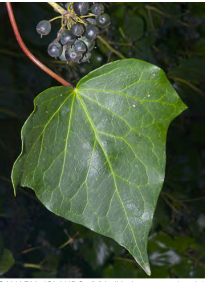
CANARY ISLANDS IVY (Hedera canariensis) Naturalized Perennial - Ginseng Family -(Aug-Nov) - Woodland, chaparral, disturbed areas - Woody vine. Leaves gen 3-pointed, > English Ivy. Flowers white to green. Fruit black, ~0.2" wide. INVASIVE weed.