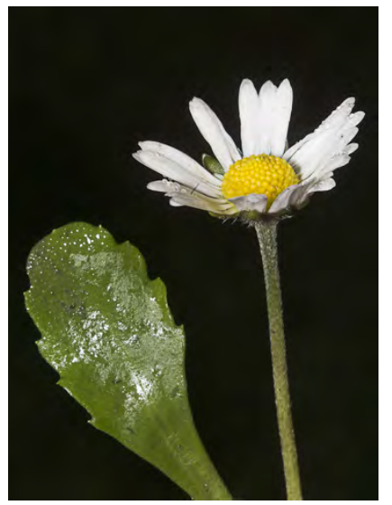
ENGLISH DAISY (Bellis perennis) Naturalized Perennial - Sunflower Family - (Dec–Sep) -Damp, grassy areas - Herbaceous lawn weed. Leaves 0.8-4" long, spoon-shaped. Ray flowers white, 0.3-0.4" long, narrow. Disk flowers yellow, ~ 0.1" long.