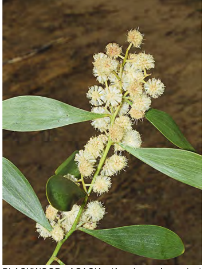
BLACKWOOD ACACIA (Acacia melanoxylon) Naturalized Perennial - Pea Family - (Feb-Mar) -Uncommon. Disturbed areas - Tree < 100' tall. Leaves simple, 0.2-1.2" wide, 3-5 main veins. Flowers pale yellow, 2-8 per head. INVASIVE weed.