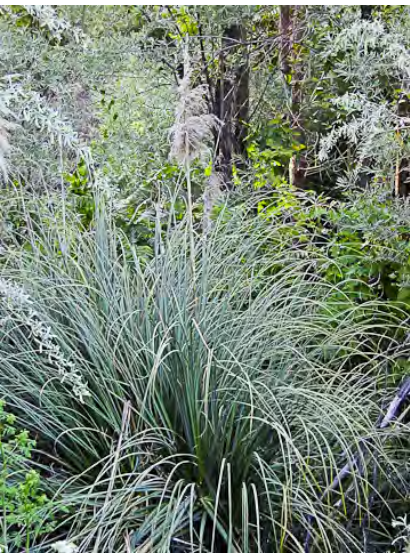
SMOOTH PAMPAS GRASS (Cortaderia selloana) Naturalized Perennial - Grass Family - (Sep-Mar) - Disturbed sites - Plant 6-13' tall. Leaf blades 0.1-0.5" wide, sheathes smooth. Cultivar, rarely escaped. INVASIVE weed.