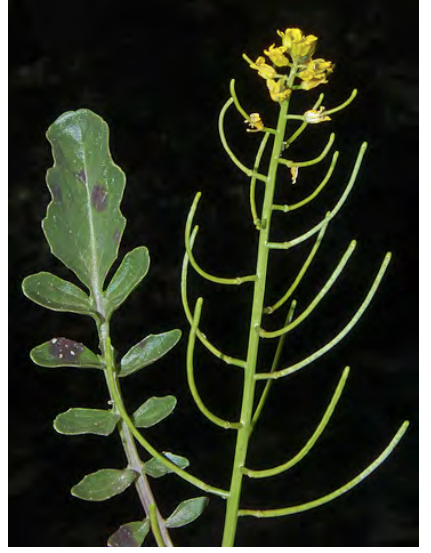
ERECT-POD WINTER CRESS (Barbarea orthoceras) Native Perennial - Mustard Family - (Mar–Jul) - Meadows, streambanks, moist woodland, grassland - Stem 8-24". Lower leaves w/large terminal lobe, upper clasping stem. Petals bright yellow, 0.2-0.3" long.