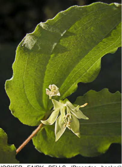
HOOKER FAIRY BELLS (Prosartes hookeri) Native Perennial - Lily Family - (Mar–Jun) -Montane conifer, mixed-evergreen forest, exposed roadside - Stem 12-32" tall. Leaf 1.2-6" long. Flower 0.3-0.6" long, white, hanging below the leaves, stamens > petals.