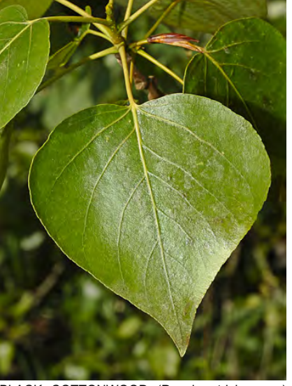
BLACK COTTONWOOD (Populus trichocarpa) Native Perennial - Willow Family - (Feb–Apr) -Alluvial bottomland, streamsides - Tree < 100' tall. Leaves egg-shaped, finely-scalloped edge, blade 1.2-2.8" long.