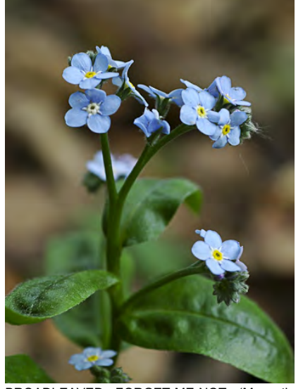
BROADLEAVED FORGET-ME-NOT (Myosotis latifolia) Naturalized Perennial - Borage Family -(Feb-Jul) - Moist, disturbed, shady places - Stem < 28" long, base woody. Leaves to 0.8" wide. Flowers light blue, 0.2-0.4" wide. INVASIVE weed.