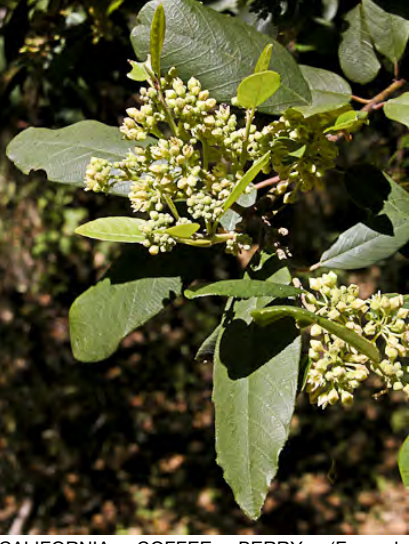
CALIFORNIA COFFEE BERRY (Frangula californica subsp. californica) Native Perennial - Buckthorn Family - (May–Jul) - Coastal-sage scrub, chaparral, forest, woodland - Shrub < 16' tall. Flowers greenish. Leaves smooth beneath.