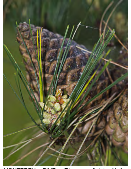
MONTEREY PINE (Pinus radiata) Native Perennial - Pine Family - - - Closed-cone-pine forest, oak woodland - Tree < 125' tall. Mature bark black, deep-grooved. Needles 3 per bundle, 2.4-5.9" long. Seed cone 2.4-6" long, asymmetric, opening 2nd year.