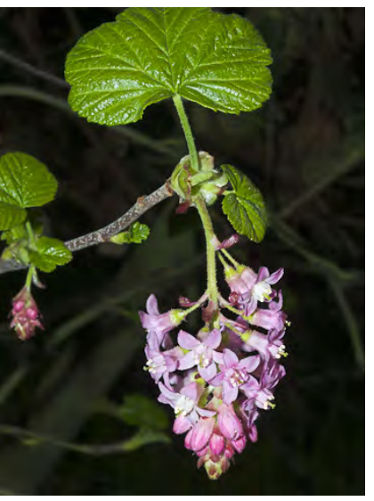
RED-FLOWERING CURRANT (Ribes sanguineum var. glutinosum) Native Perennial -Gooseberry Family - (Feb-Apr) - Many habitats -Shrub < 13' tall, no prickles. Sepals pink to white. Petals white to red, ~0.1" long. Styles smooth.