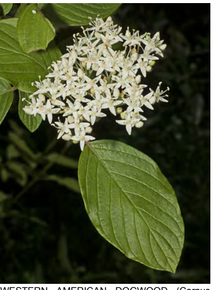
WESTERN AMERICAN DOGWOOD (Cornus sericea subsp. occidentalis) Native Perennial - Dogwood Family - (May–Jul) - Generally moist places - Shrub 5-13' tall. Leaf blades gen 2-4" long, rough-hairy below, veins in 4-7 pairs. Petals white, 0.1-0.2" long.