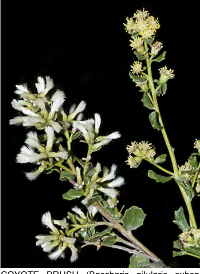
COYOTE BRUSH (Baccharis pilularis subsp. consanguinea) Native Perennial - Sunflower Family - (Jul-Dec) - Coastal bluffs, woodland, grassland, disturbed sites, occ on serpentine - Shrub < 15' tall, brittle, common. Leaves gen 0.6-1.6" long.