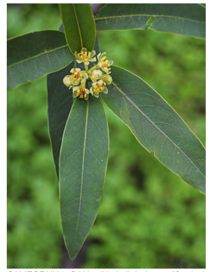
CALIFORNIA BAY (Umbellularia californica) Native Perennial - Laurel Family - (Nov-May) -Common. Canyons, valleys, chaparral - Tree < 150' tall. Leaf 1.2-4", 0.6-1.2" wide, aromatic. Cluster of 5-10 small, yellow or yellow-green flowers. Fruit 0.8-1" diam.