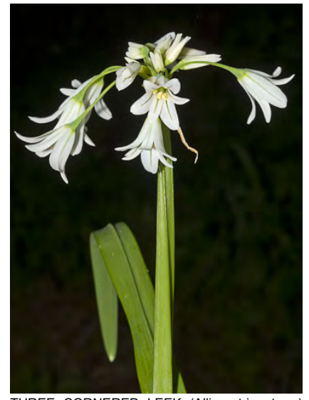
THREE CORNERED LEEK (Allium triquetrum) Naturalized Perennial - Onion or Garlic Family -(Mar-Apr) - Locally common. Shady ± disturbed places - Stem 4-16", sharply 3-angled. Flowers white, 3-15, 0.4-0.7" long, nodding. Escaped ornamentals.