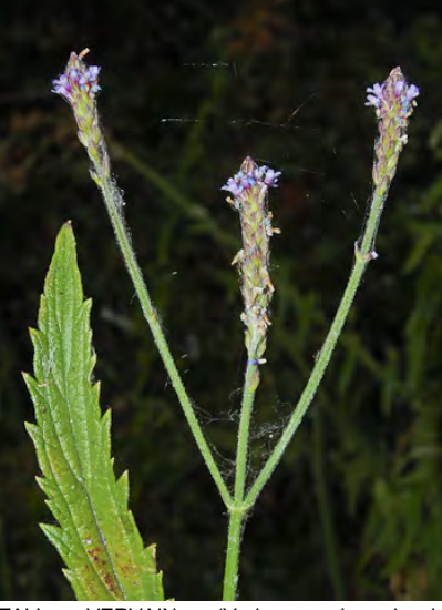
TALL VERVAIN (Verbena bonariensis) Naturalized Annual-Biennial - Vervain Family -(Jun–Oct) - Disturbed, often wet places, fields -Plant 20-60". Leaf 3-6" long, gen clasping stem. Flowers white or purple, 0.2-0.24" long; 8-17/cluster.