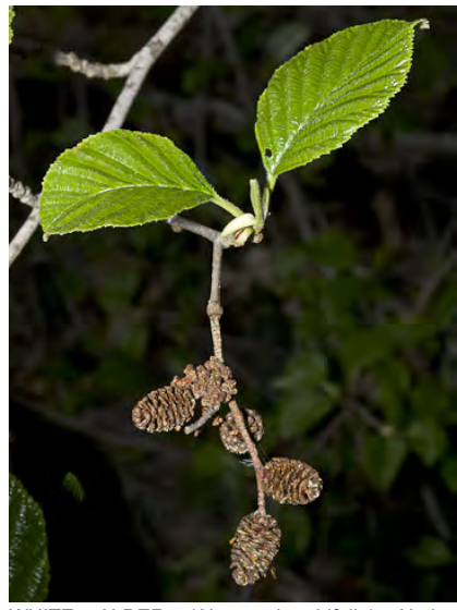
WHITE ALDER (Alnus rhombifolia) Native Perennial - Birch Family - (Apr–Jun) - Along permanent streams - Tree. Leaves flat, not rusty underneath, margins serrate, not rolled under. Female flowers cone-like. Wood used for furniture and for smoking meats.