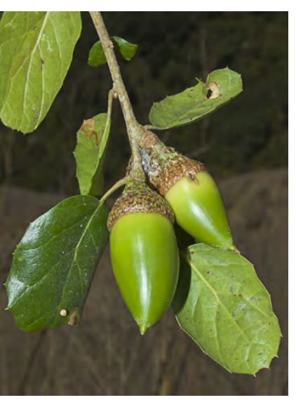
COAST LIVE OAK (Quercus agrifolia var. agrifolia) Native Perennial - Oak Family -(Mar–Apr) - Valleys, slopes, mixed-evergreen forest, woodland - Tree 30-80'. Leaves convex, hair-tuft below in vein axils. Acorns on 1st year twigs, shell glabrous inside.