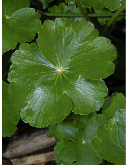
FLOATING MARSH PENNYWORT (Hydrocotyle ranunculoides) Native Perennial - Ginseng Family - (Mar-Aug) - Lake margins, ponds, slow-moving streams - Plant fleshy, floating-creeping. Leaf 0.8-2" wide, kidney-shaped, deep lobes, 1 reaching center.