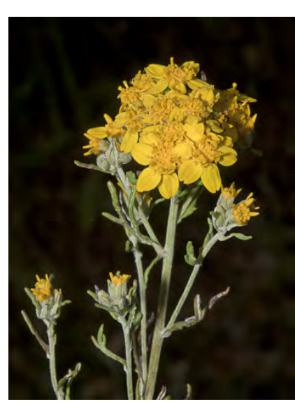
GOLDEN-YARROW (Eriophyllum confertiflorum var. confertiflorum) Native Perennial - Sunflower Family - (Apr-Aug) - Many dry habitats -Shrubby, 8-28" tall. Leaves 0.4-2" long, deeply 3-5 lobed. Flowers yellow; rays 4-6, 0.08-0.2" long; head bracts 4-7.