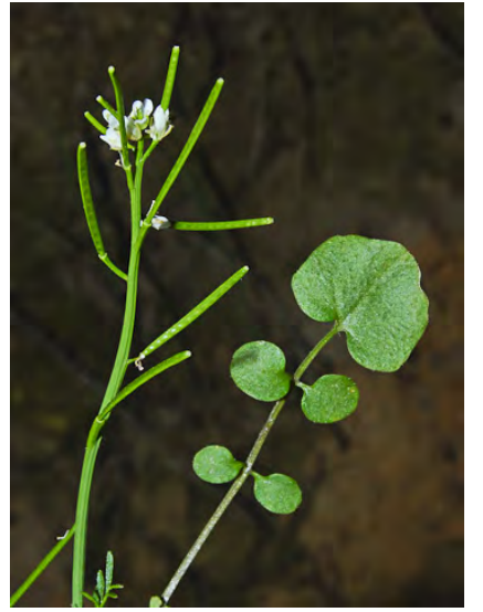
WESTERN BITTER-CRESS (Cardamine oligosperma) Native Annual - Mustard Family - (Mar-Jul) - Wet meadows, shady banks, damp areas - Plants < 16". Leaves divided into 5-9 leaflets. Flowers white, 0.1-0.2" long. Fruit < 0.1" wide.