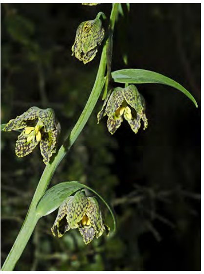
CHECKER LILY (Fritillaria affinis) Native Perennial - Lily Family - (Mar–Jun) - Common. Oak or pine scrub, grassland - Stem 4-47" tall. Leaves 1.6-6.3" long, whorled below. Petals mottled brown-purple and yellow-green, 0.4-1.6" long.