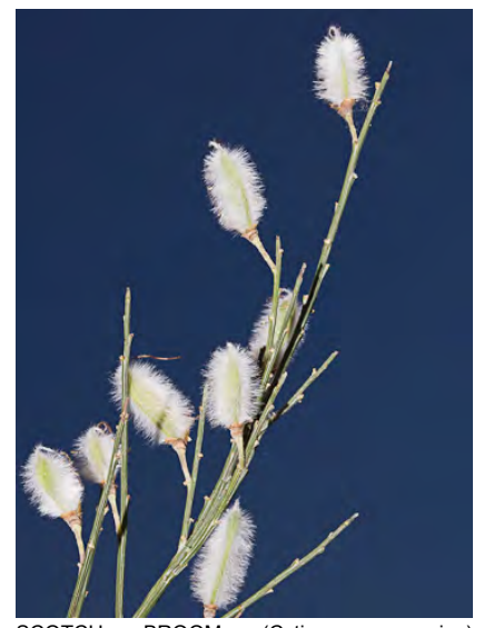
SCOTCH BROOM (Cytisus scoparius) Naturalized Perennial - Pea Family - (Apr–Jul) -Common. Disturbed places - Shrub 6.6-8' tall, deciduous. Stems sharply 5-angled, new twigs hairy. Flowers yellow, 1-2 at leaf bases, 0.6-0.8" long. NOXIOUS.