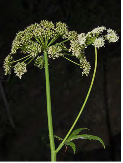
WESTERN WATER-HEMLOCK (Cicuta douglasii) Native Perennial - Carrot Family - (Jun-Sep) - Wet places, gen aquatic - Plants 5-10' tall. Leaves 1-3x divided, leaflets 1-10, serrate edges. Flowers white. Fruits round. The most lethally TOXIC native plant.