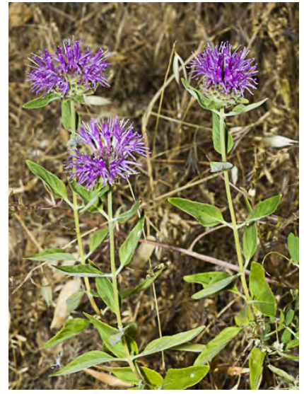
COYOTE-MINT (Monardella villosa subsp. villosa) Native Perennial - Mint Family -(May-Aug) - Dry rocky slopes, oak woods, chaparral - Plant < 20" tall. Leaves ovate, 0.4-0.9" mm long. Flower head 0.4-1.2" wide. Flowers pink to purple.