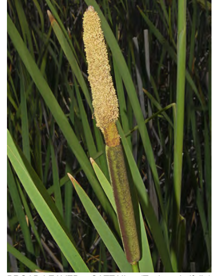
BROAD-LEAVED CATTAIL (Typha latifolia) Native Perennial - Cattail Family - (Jun-Jul) -Unpolluted to nutrient-rich freshwater (brackish) marshes - Plant 4.9-9.8' tall. Widest leaves 0.4-1.1" wide. Flower cluster with no gap between flower types.