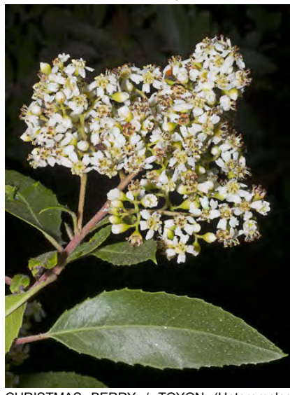
CHRISTMAS BERRY / TOYON (Heteromeles arbutifolia) Native Perennial - Rose Family -((May)Jun-Aug) - Chaparral, oak woodland, mixed-evergreen forest - Shrub-tree < 33' tall, evergreen. Leaf 2-4" long. Petals white, < 0.16" long. Fruit bright red.