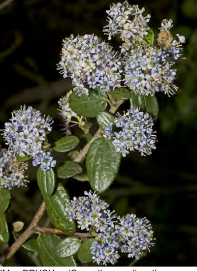
JIM BRUSH (Ceanothus oliganthus var. sorediatus) Native Perennial - Buckthorn Family -(Jan-May) - Slopes, ridges, chaparral, conifer forest - Shrub/tree < 11.5' tall. Twigs red-brown. Leaves alternate, 3 main veins. Flowers blue, purple-blue or whitish.