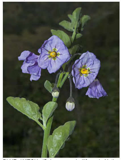
BLUE WITCH (Solanum umbelliferum) Native Perennial - Nightshade Family - (All year) -Shrubland, mixed-evergreen forest, woodland -Plant gen < 39", upper stem hairs branched, dense. Flowers 0.6-1" wide, purple, with green spots at the base.