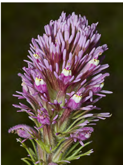
PURPLE OWL'S-CLOVER (Castilleja exserta subsp. exserta) Native Annual - Broom-rape Family - (Mar-May) - Open fields, grassland -Plant sticky, short-hairy. Flower cluster tipped white, pale yellow or rose. Flower upper lip hooked, fuzzy.