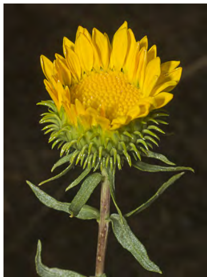
GREAT VALLEY GUMPLANT (Grindelia camporum) Native Perennial - Sunflower Family - (May-Nov) - Sandy or saline bottomland, roadsides - Stem non-woody, 2-8' tall, whitish. Leaves gen resinous. Head to 1.2" wide, bracts bend downward.