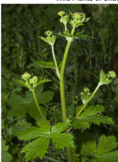
PACIFIC WOODLAND SANICLE (Sanicula crassicaulis) Native Perennial - Carrot Family - (Mar-May) - Open slopes, ravines, woodland - Plants stout, 9-47". Leaves 1-5" across with 3-5 deep, palmate lobes and serrate edges. Flowers yellow.