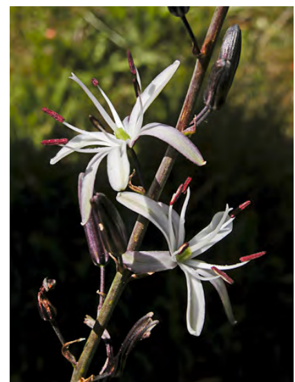
WAVYLEAF SOAP PLANT (Chlorogalum pomeridianum var. pomeridianum) Native Perennial - Century Plant Family - (May–Aug) - Common. Open grassland, chaparral, woodland - Plant 1-8' tall, flowers at night. Bulb juices lather in water.