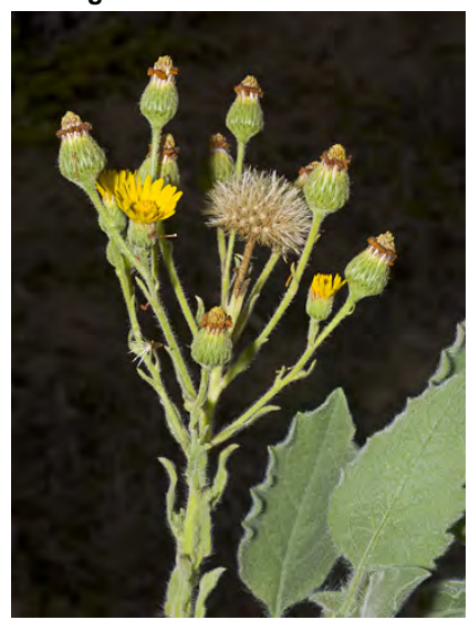
TELEGRAPH WEED (Heterotheca grandiflora) Native Annual - Sunflower Family - (Jun–Oct(± all year)) - Disturbed areas, dry streambeds, sand dunes - Plant 0.3-8' tall, bristly, sticky, branched above. Leaf 0.8-2.8" long, lower clasp stem. Rays 25-40, 0.2-0.3" long.