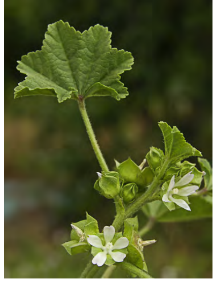
CHEESEWEED (Malva parviflora) Naturalized Annual - Mallow Family - (Mar–May) - Common. Disturbed places - Stem 8-32" long, gen erect, widely branched. Flower bractlets linear. Petals 0.1-0.2" long, pink to gen white. Fruit with flange from flower bracts.