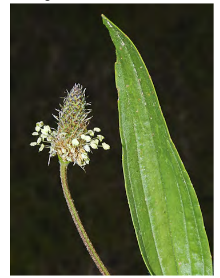
ENGLISH PLANTAIN (Plantago lanceolata) Naturalized Annual - Plantain Family - (Apr-Aug) - Common. Disturbed areas - Leaves basal, hairy, 2-10" long, <= 1" wide. Flowers + stem 8-31" tall, flower cluster 0.8-3" long. INVASIVE, lawn weed.