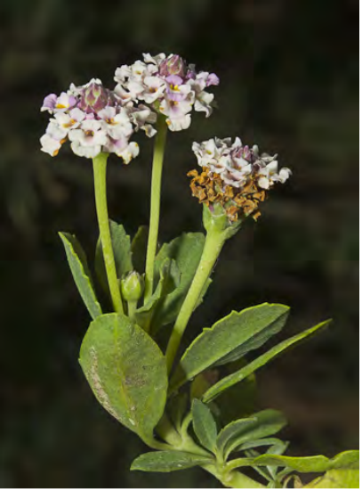
LEMON VERBENA (Phyla nodiflora) Native Perennial - Vervain Family - (May–Nov) - Wet places, pond margins - Mat-like. Leaf blade 0.2-1.2" long, < 0.4" wide, 5-11 teeth. Flowers white to red. Flower stem 0.6-3.5" tall. Ornamental.