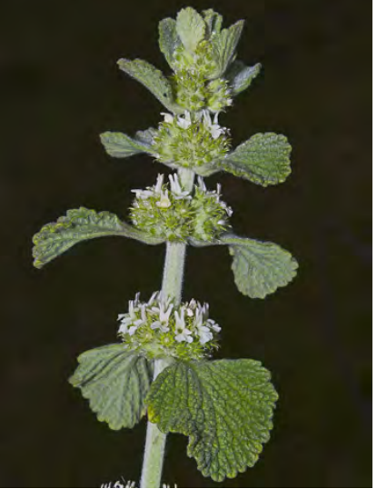
COMMON HOREHOUND (Marrubium vulgare) Naturalized Perennial - Mint Family - (Mar-Nov) - Disturbed sites, gen overgrazed pastures - Stem 4-24" long. Leaf blades 0.6-2.2" long. Flower bract w/10 hook-tipped teeth. Flowers white, ~0.2" long. INVASIVE.