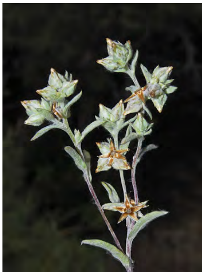
DAGGERLEAF COTTONROSE (Logfia gallica) Naturalized Annual - Sunflower Family (Mar-Jul) - Bare or grassy openings, burns Plant 1-20" tall, gen cobwebby. Leaves awl-shaped, stiff, > flower heads. Flowers brown to yellow.