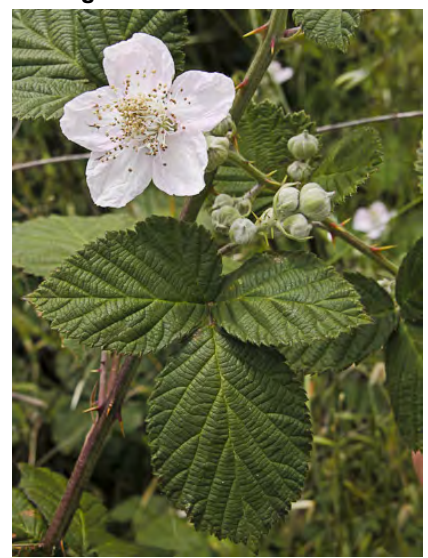
HIMALAYAN BLACKBERRY (Rubus armeniacus) Naturalized Perennial - Rose Family (Mar–Jun) - Common. Disturbed areas, roadsides - Shrub withorny 5-angled stem. Leaflets 3-5, white-hairy beneath. Blackberry-type fruit. INVASIVE.