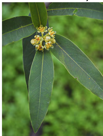
CALIFORNIA BAY (Umbellularia californica) Native Perennial - Laurel Family - (Nov-May) -Common. Canyons, valleys, chaparral - Tree < 150' tall. Leaf 1.2-4", 0.6-1.2" wide, aromatic. Cluster of 5-10 small, yellow or yellow-green flowers. Fruit 0.8-1" diam.