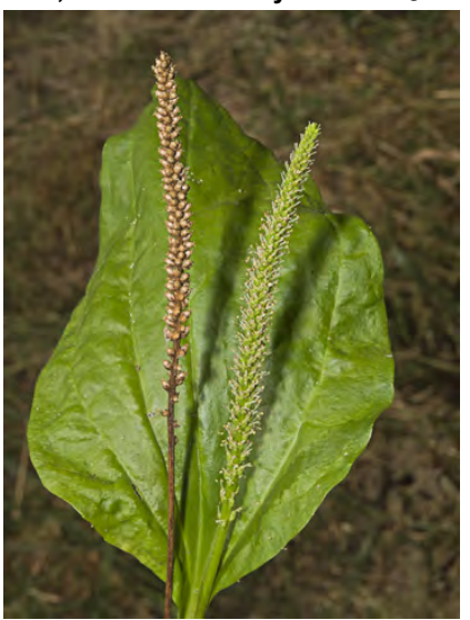
COMMON PLANTAIN (Plantago major) Naturalized Annual-Perennial - Plantain Family -(Apr–Sep) - Disturbed areas - Leaves basal, blades 5-18 cm long, broadly oval, not hairy. Flowers + stem 2-24" tall, flower cluster gen 1.2-8" long.