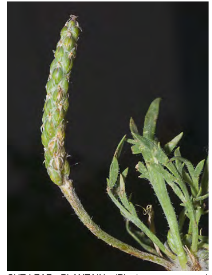
CUT-LEAF PLANTAIN (Plantago coronopus) Native Annual-Biennial - Plantain Family - (Apr–Jul) - Coastal bluffs, salt marshes, trampled places, chaparral, grassy flats - Leaves 1.6-10" long, tooth-like lobes. Flower: stems 1-6, 2-20" tall, cluster 0.8-8" long.