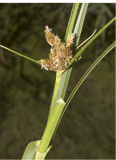
SEACOAST BULRUSH (Bolboschoenus robustus) Native Perennial - Sedge Family -(Summer) - Brackish to saline coastal marshes - Plant 20-60" tall. Stem sharply triangular. Flower cluster dense, stemless, just above bracts. Spikelets 5-25, 0.4-1.2" long.