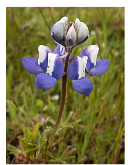
SKY LUPINE (Lupinus nanus) Native Annual -Pea Family - (Mar–Jun) - Abundant. Open or disturbed areas - Plant 4-24" tall, hairy. Flowers blue to pink to white, 0.2-0.6" long; banner as wide as long. Flower stalk gen > 0.12" long.