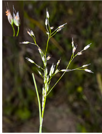
SILVER HAIR GRASS (Aira caryophyllea) Naturalized Annual - Grass Family - (Apr-Jun) - Sandy soils, open or disturbed sites - Flower cluster > 0.6" wide, diffuse with long slender branches. Spikelets about 0.1" long with 2 extended awns.