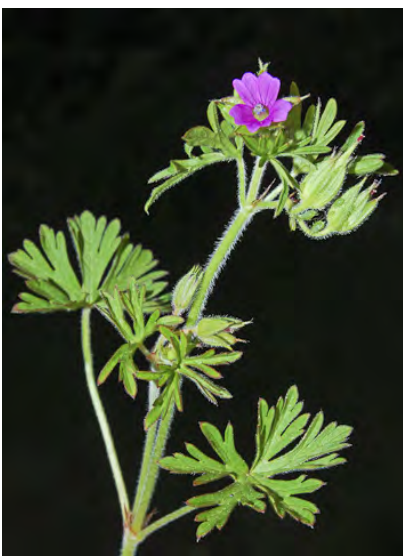
CUT-LEAVED GERANIUM (Geranium dissectum) Naturalized Annual - Geranium Family - (Mar–Jul) - Open, disturbed sites - Stem 3-28" tall, rough-hairy. Leaf blades deeply divided. Petals violet-red, 0.1-0.25" long w/notched tips. Flower stalk sticky. INVASIVE.