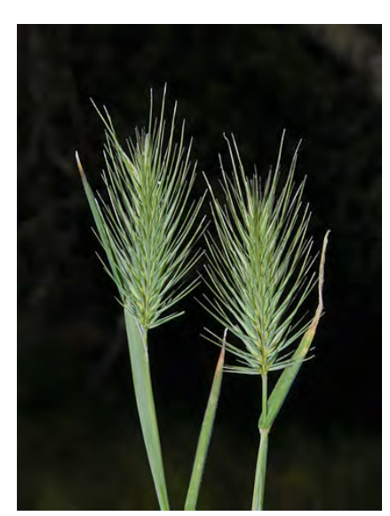
MEDITERRANEAN BARLEY (Hordeum marinum subsp. gussoneanum) Naturalized Annual - Grass Family - (Apr-Jun) - Dry to moist, disturbed sites - Stem 4-20". Leaf blades to 32" long, auricles < 0.08". Central lemma awn 0.25-0.7" long. INVASIVE weed.