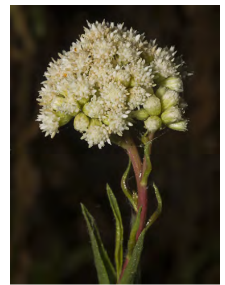
MARSH BACCHARIS (Baccharis glutinosa) Native Perennial - Sunflower Family - (Jul-Oct) -Coastal freshwater and saltwater marshes, streambanks - Plant herbaceous, sticky, 3-6' tall. Leaf blades lance-shaped, < 5" long, 0.5-1.2" wide.