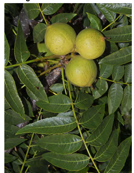
N. CALIFORNIA BLACK WALNUT (Juglans hindsii) Native Perennial - Walnut Family -(Apr–May) - Along streams, disturbed slopes -Tree 20-75'. Leaflets 13-21, 3-5". Fruit 1.4-2" wide. CNPS: SERIOUSLY ENDANGERED (unplanted).