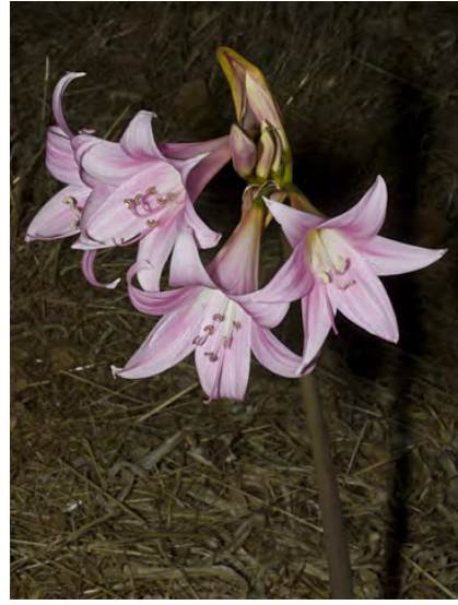
NAKED LADIES (Amaryllis belladonna) Naturalized Perennial - Amaryllis Family belladonna) (Jul-Sep) - Disturbed sites, often around abandoned home sites - Stems leafless, 1-2' tall. Flowers large and pink (sometimes white or yellow at the base). Escaped ornamentals.