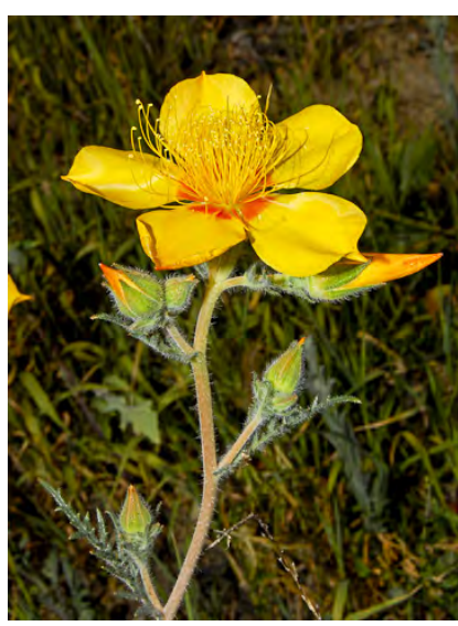
LINDLEY BLAZING STAR (Mentzelia lindleyi) Native Annual - Blazing-star Family - (May–Jun) -Rocky, open slopes, coastal-sage scrub, oak/pine woodland - Plant 4-28" tall. Leaves 0.8-6.7" long, gen deeply lobed. Petals 0.8-1.6" long, yellow w/orange base.