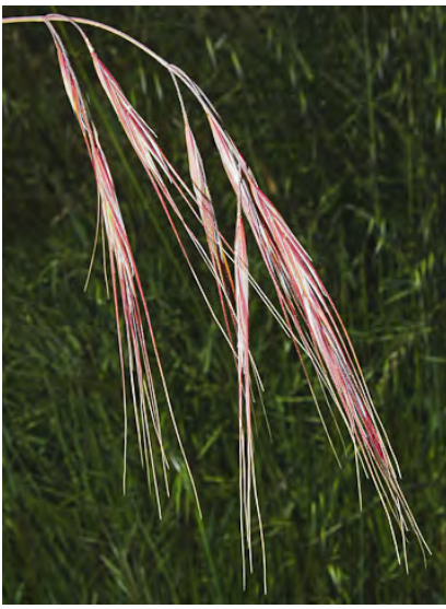
RIPGUT GRASS (Bromus diandrus) Naturalized Annual - Grass Family - (Apr–Jul) - Open, gen disturbed areas - Plant 6-40" tall. Spikelet 1-2.8" long. Lemma body 0.8-1.2" long, awn > 1.2" long. Barbed, seeds can stick in flesh of animals. INVASIVE weed.