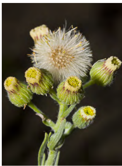
FLAX-LEAVED HORSEWEED (Erigeron bonariensis) Naturalized Annual - Sunflower Family - (All year) - Disturbed sites - Plant 4-39" all, gray-hairy. Upper leaves narrow. Disk flowers yellow, disk-like rays white. Head bracts 0.14-0.2"