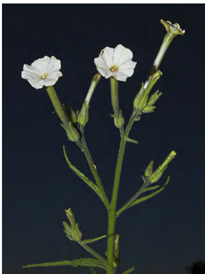
MANY-FLOWERED TOBACCO (Nicotiana acuminata var. multiflora) Naturalized Annual - Nightshade Family - (May—Oct) - Open, sandy or gravelly areas - Plant 20-60". Stem leaves w/stems. Flower bracts dark-striped. Flowers white, 0.4-0.8" wide. TOXIC.