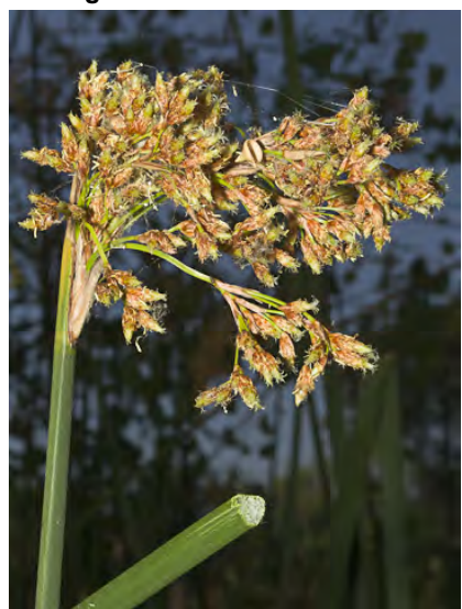
SOUTHERN BULRUSH (Schoenoplectus californicus) Native Perennial - Sedge Family - (Spring-summer) - Common. Brackish to fresh marshes, shores - Stem 3.3-13' tall, slender, bright green, bluntly 3-angled. Flower cluster somewhat open.