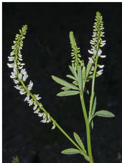
WHITE SWEETCLOVER (Melilotus albus) Naturalized Annual-Biennial - Pea Family (May-Sep) - Locally abundant. Pastures, open disturbed sites - Stem 1.6-6.6' long. Leaflets 3, 0.4-1" long, toothed. Flowers white, 0.14-0.2"