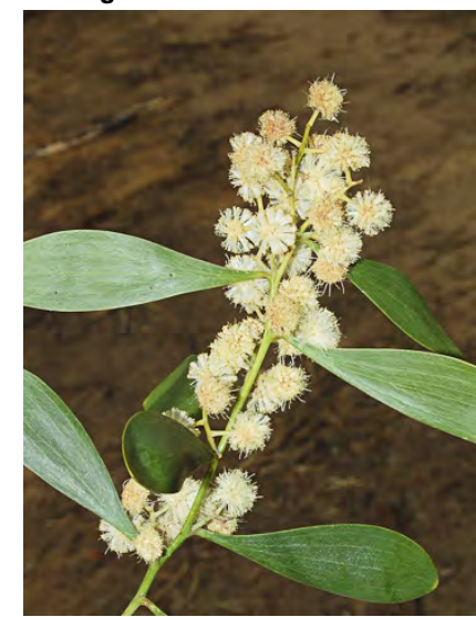
BLACKWOOD ACACIA (Acacia melanoxylon) Naturalized Perennial - Pea Family - (Feb-Mar) -Uncommon. Disturbed areas - Tree < 100' tall. Leaves simple, 0.2-1.2" wide, 3-5 main veins. Flowers pale yellow, 2-8 per head. INVASIVE