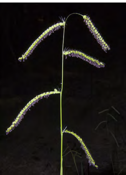
DALLIS GRASS (Paspalum dilatatum Naturalized Perennial - Grass Family dilatatum) (May–Nov) - Disturbed areas - Tufted, weedy. Stem 1.6-5.7' tall. Leaves to 14" long. Flowering stem w/3-6 branches. Spikelet groups 2-7, each 0.6-4.7" long. Spikelets ~0.14", paired.