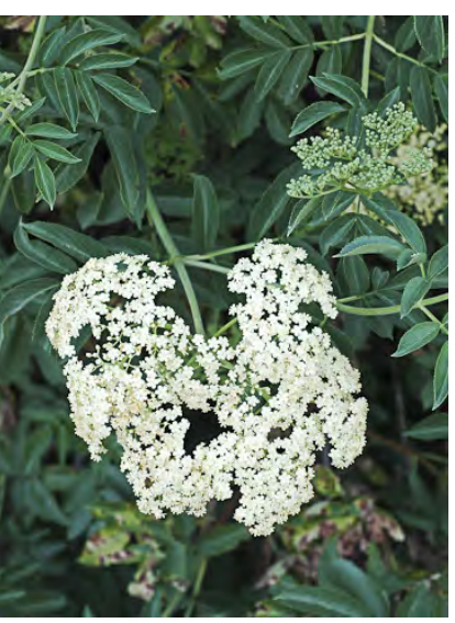
BLUE ELDERBERRY (Sambucus nigra subsp. caerulea) Native Perennial - Muskroot Family - (Mar-Sep) - Common. Streambanks, open places in forest - Shrub 7-26' tall. Flower cluster flat-topped, 1.6-13" diam, petals spreading. Fruits waxy blue-black.