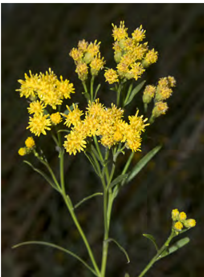
WESTERN GOLDENROD (Euthamia occidentalis) Native Perennial - Sunflower Family - (Jul-Nov) - Marshes, streambanks, meadows - Stem < 6.6', smooth. Leaves < 4" long, <= 0.24" wide, w/dark glandular pits. Flowers yellow, rays 0.06-0.1" long.