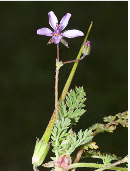
REDSTEM FILAREE (Erodium cicutarium) Naturalized Annual - Geranium Family (Feb-Sep) - Open, disturbed sites, grassland, scrub - Stem 4-20". Leaves compound, leaflets dissected. Sepal tip bristly. Petal pink to purple. Fruit beak 0.8-2". INVASIVE.