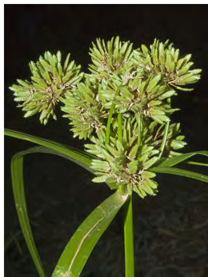
TALL NUTSEDGE (Cyperus eragrostis) Native Perennial - Sedge Family - (May-Nov) - Vernal pools, streambanks - Leaves basal. Flower cluster bracts 4-8. Spikelets 0.2-0.8" long, oblong, in heads to 1.6" wide. Seeds short-stalked.