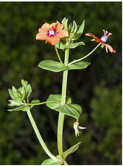
SCARLET PIMPERNEL (Anagallis arvensis) Naturalized Annual - Myrsine Family - (Mar–May) - Common. Disturbed places, ocean beaches - Plants 2-16" tall. Flowers 0.2-0.3" long, salmon or occasionally blue. Leaves TOXIC, can cause dermittis.