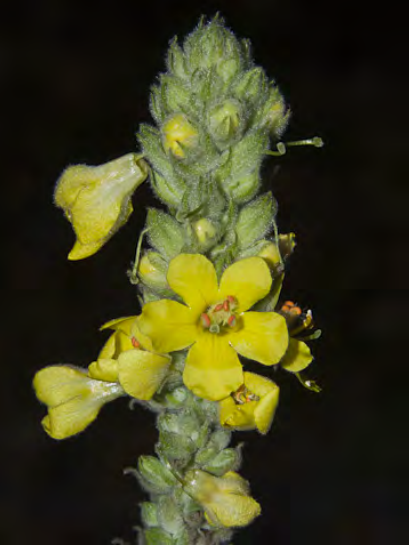
WOOLLY MULLEIN (Verbascum thapsus) Naturalized Biennial - Snapdragon Family -(May-Sep) - Roadsides, streambanks, disturbed areas - Plant woolly It-green. Stem 1-6.6' tall. Leaves 2-20" long. Flowers yellow, 0.6-1" wide, sticky.