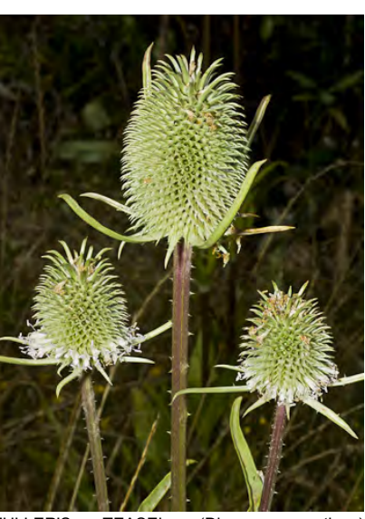
FULLER'S TEASEL (Dipsacus sativus) Naturalized Biennial - Teasel Family - (May–Jul) - Disturbed areas, fields, vacant lots, pastures - Plant gen < 6' tall. Leaf pairs fused around stem. Flower cluster lavender, 5-10 cm long, bracts spreading, INVASIVE weed.