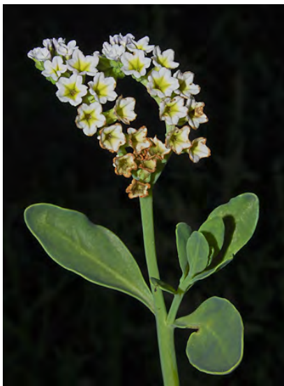
SEASIDE HELIOTROPE (Heliotropium curassavicum var. oculatum) Native Perennial - Borage Family - (Feb-Oct) - Moist to dry, saline to alkaline soils, gen near water - Plant fleshy. Leaf 0.4-2.4 cm long. Flowers white w/ yellow center, 0.12-0.2" long.