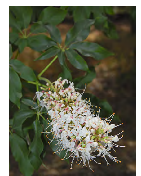
CALIFORNIA BUCKEYE (Aesculus californica) Native Perennial - Soapberry Family - (May–Jun) - Dry slopes, canyons, borders of streams - Large shrub or tree 13-39' tall. 5-7 leaflets. Flowers white to pale rose. Large seeds toxic but edible after leaching out saponins.