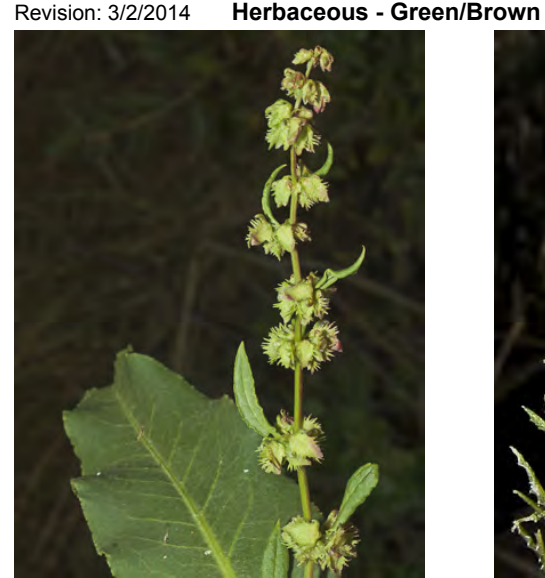
FIDDLE DOCK (Rumex pulcher) Naturalized Perennial - Buckwheat Family - (May–Sep) -Disturbed places, meadows, moist or dry habitats - Stem 8-24" long, branches widely spreading. Leaf blades 1.6-4" long, 1.2-2" wide. Valves w/2-5 teeth.