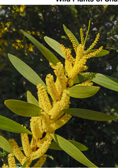
SYDNEY GOLDEN WATTLE (Acacia longifolia) Naturalized Perennial - Pea Family - (Jan-Apr) -Uncommon. Disturbed places, especially sandy coastal areas - Shrub-small tree, spineless. Leaves simple, 2-6" long with 2-4 main veins. Flowers bright yellow.