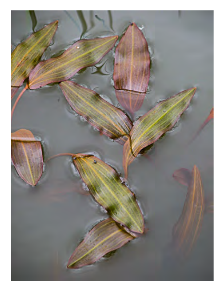
LONG-LEAVED PONDWEED (Potamogeton nodosus) Native Perennial - Pondweed Family -(May–Aug) - Shallow water, lakes, ponds, streams - Stem gen < 13' long. Leaves both submersed (narrow) and floating (broad, elliptic). Inflor < 2" long.