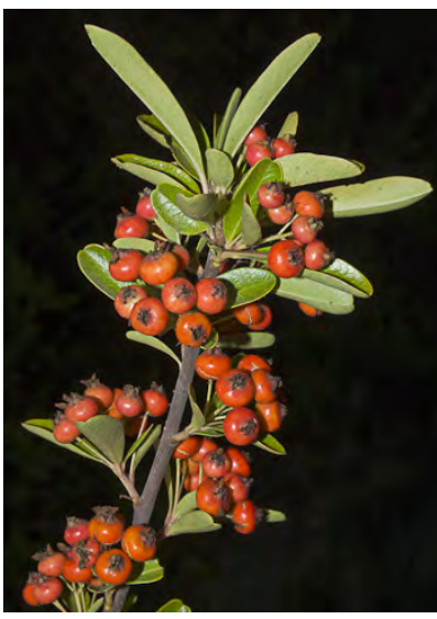
WOOLLY FIRETHORN (Pyracantha angustifolia) Naturalized Perennial - Rose Family - (Feb-Jun) - Disturbed areas, fencerows, abandoned fields, roadsides - Plant < 13', gray-hairy. Leaves narrow, entire. Calyx and below leaves often woolly. INVASIVE.