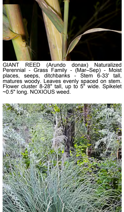
PAMPAS GRASS SMOOTH (Cortaderia selloana) Naturalized Perennial - Grass Family -(Sep–Mar) - Disturbed sites - Plant 6-13' tall. Leaf blades 0.1-0.5" wide, sheathes smooth. Cultivar, rarely escaped. INVASIVE weed.