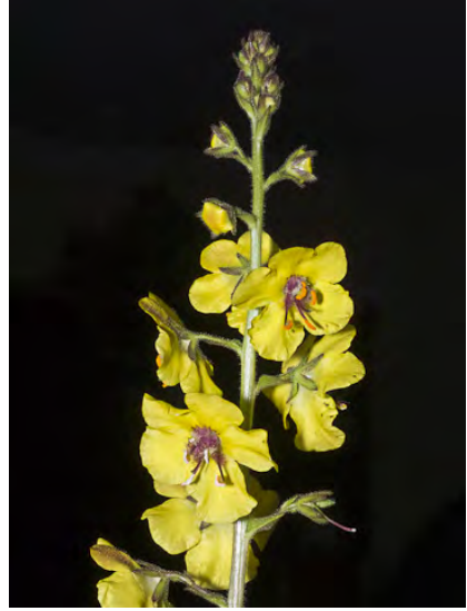
MOTH MULLEIN (Verbascum blattaria) Native Biennial - Snapdragon Family - (May–Aug) -Roadsides, seeps, streambanks, disturbed grassland, foothill woodland, chaparral - Stem 1-4' tall. Flowers yellow or white, 1-1.2" wide, filaments purple-hairy.