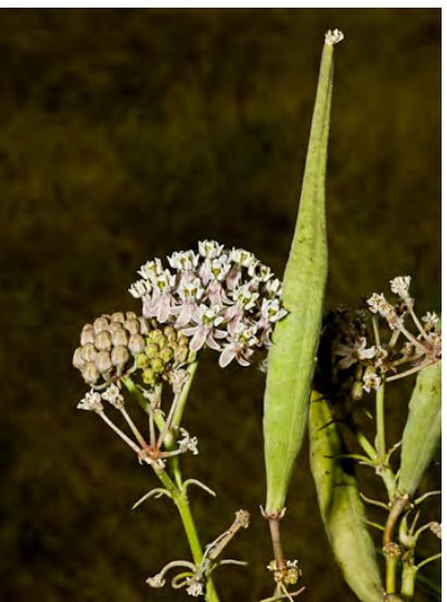
NARROW-LEAF MILKWEED (Asclepias fascicularis) Native Perennial - Dogbane Family - (May-Oct) - Dry ground, valleys, foothills - Plant gen hairless. Stem leaves narrow, 3-5 in whorts. Flowers green-white to purple-tinged, ~0.25" long.