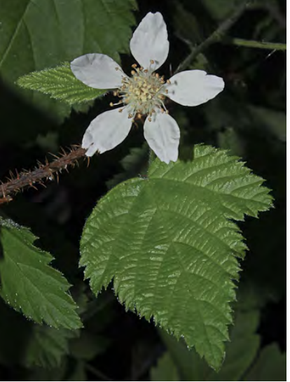
CALIFORNIA BLACKBERRY (Rubus ursinus) Native Perennial - Rose Family - (Mar-Jul) -Open, disturbed areas - Stem round, bristly/prickly. Leaves simple to 3 leaflets, underside green. Plants unisexual. Petals 0.24-0.6" long, white. Blackberry-type fruit.