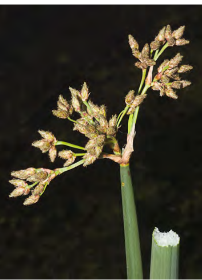
COMMON TULE (Schoenoplectus acutus var. occidentalis) Native Perennial - Sedge Family -(Summer) - Common. Marshes, shores, fens, shallow lakes, often emergent - Stem 3.3-13' tall, fat, round x-section, blue-green.