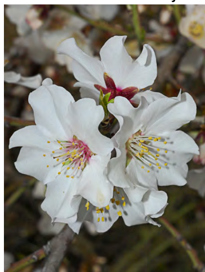
ALMOND (Prunus dulcis) Naturalized Perennial -Rose Family - (Feb-Mar) - Canyons, roadsides, grassland (as waif) - Tree 16-26' tall. Leaf blades 1-4" long. Flowers 1-3/cluster. Petals pink to nearly white, 0.5-1" long. Fruit 1-1.6" long, hairy. Cultivar.