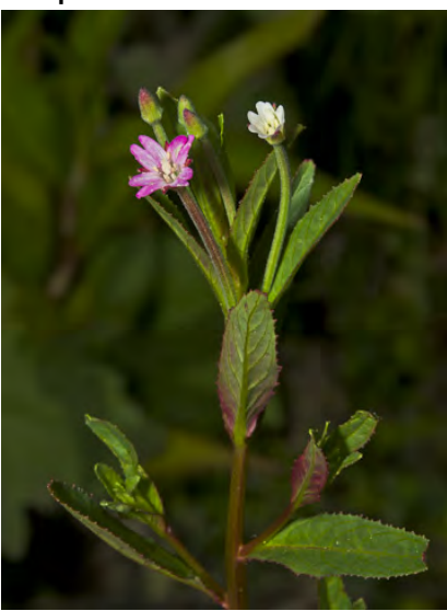
COMMON WILLOWHERB (Epilobium ciliatum subsp. ciliatum) Native Perennial - Evening Primrose Family - (Jun-Oct) - Common. Disturbed places, moist meadows, streambanks, roadsides - Plant 20-48" tall, smooth or short-hairy. Petals 2-6 mm, white to pink.