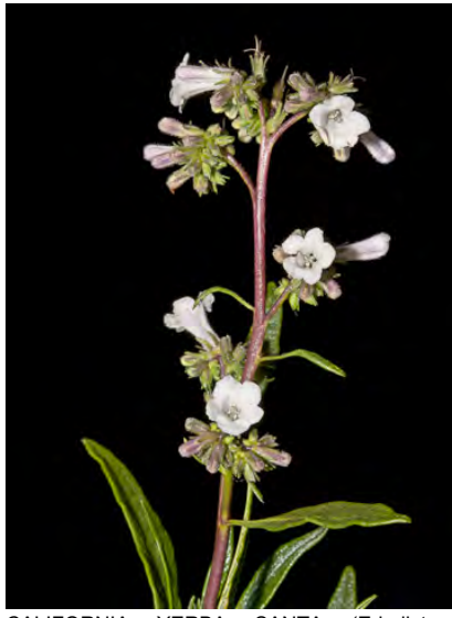
CALIFORNIA YERBA SANTA (Eriodictyon californicum) Native Perennial - Borage Family - (Apr-Jul) - Slopes, fields, roadsides, woodland, chaparral - Shrub 3.3-10' tall. Leaf blade sticky, <= 6" long, 1.6-2" wide. Flowers white to purple, 0.3-0.5" long.