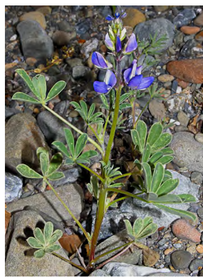
ARROYO LUPINE (Lupinus succulentus) Native Annual - Pea Family - (Feb-May) - Abundant. Open or disturbed areas, often seeded on roadbanks - Plant 8-40" tall, fleshy, sparsely hairy. Flowers 0.5-0.7" long, whorled, gen blue-purple, petal claws short-hairy.