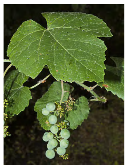
CALIFORNIA WILD GRAPE (Vitis californica) Native Perennial - Grape Family - (May—Jun) - Streamsides, springs, canyons - Woody vine to 33'+long. Leaves deciduous, heart-shaped to kidney-shaped. Fruit purple when mature, gen > 0.3" wide.