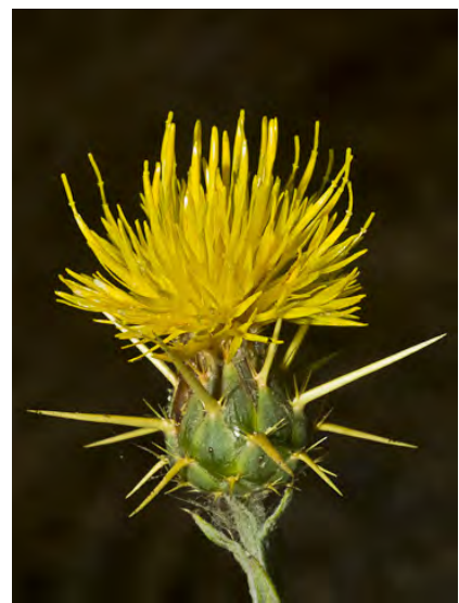
YELLOW STAR-THISTLE (Centaurea solstitialis) Naturalized Annual - Sunflower Family (May-Oct) - Invasive, roadsides, disturbed grassland or woodland - Plant 4-39" tall. Leaves woolly, extend down the stem. Flower bract spines 0.4-1" long. NOXIOUS weed.