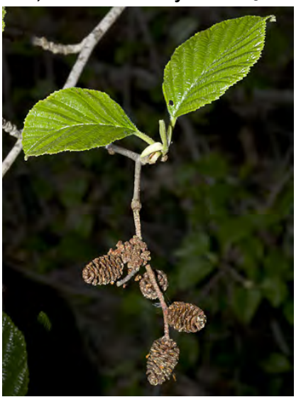
WHITE ALDER (Alnus rhombifolia) Native Perennial - Birch Family - (Apr–Jun) - Along permanent streams - Tree. Leaves flat, not rusty underneath, margins serrate, not rolled under. Female flowers cone-like. Wood used for furniture and for smoking meats.