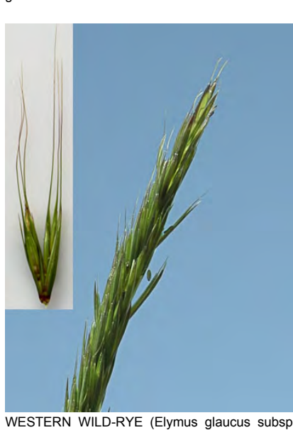
WESTERN WILD-RYE (Elymus glaucus subsp. glaucus) Native Perennial - Grass Family - (Jun-Aug) - Open areas, chaparral, woodland, forest - Tufted. Stem 12-55" tall. Leaf 0.2-0.5" wide, flat. Spikelets0.3-0.6" long, 2-4 per node. Lemma awn 0.4-1.2" long.