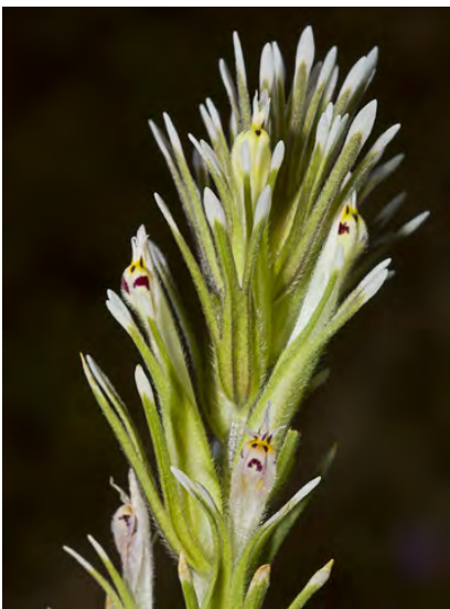
VALLEY TASSELS (Castilleja attenuata) Native Annual - Broom-rape Family - (Mar–May) - Grassland - Plant 4-20" tall, hairy, non-sticky. Leaves 0.8-3.1" long, narrow, 0-3 lobes. Flower cluster 1-12" long, narrow, tips white or pale yellow.