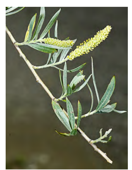
HINDS' WILLOW (Salix exigua var. hindsiana) Native Perennial - Willow Family - (Apr-May) -Common. Floodplains, sandy gravel - Shrub or tree < 17' tall. Leaf blades 1.2-6" long, linear, mature dense soft-hairy below. Ovary hairy.