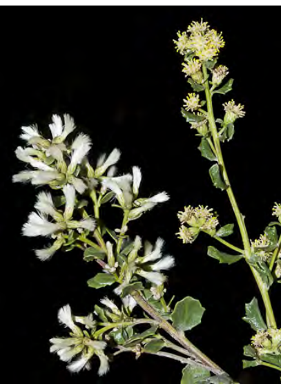
COYOTE BRUSH (Baccharis pilularis subsp. consanguinea) Native Perennial - Sunflower Family - (Jul-Dec) - Coastal bluffs, woodland, grassland, disturbed sites, occ on serpentine - Shrub < 15' tall, brittle, common. Leaves gen 0.6-1.6" long.