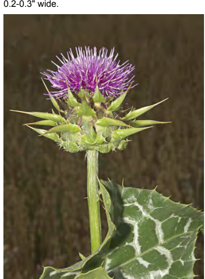
MILK THISTLE (Silybum marianum) Naturalized Annual-Biennial - Sunflower Family - (Feb–Jun) - Roadsides, pastures, disturbed areas - Stem 1-10', stout. Leaves spiny, shiny green wiwhite veins and spots. Flowers red-purple. INVASIVE weed.