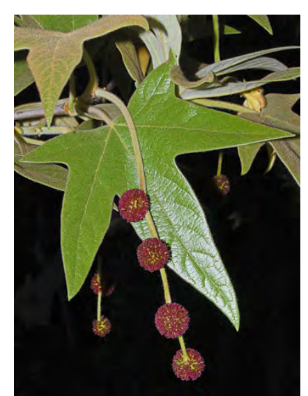
WESTERN SYCAMORE (Platanus racemosa) Native Perennial - Sycamore Family - (Feb-Apr) -Common. Streamsides, canyons, arroyos - Tree 33-115' tall. Bark peeling pale. Leaf blades 4-10" long, palmately lobed, smooth to hairy above, short-woolly under.