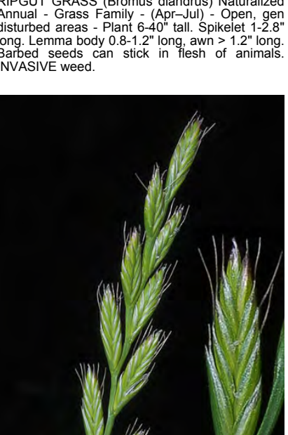
RYE GRASS (Festuca perennis) Naturalized Perennial - Grass Family - (May-Sep) - Dry to moist disturbed sites, abandoned fields - Stem 20-40" tall. Spikelet 0.2-0.9" long, > glume, awned or awnless. Sterile shoots at base. INVASIVE weed.