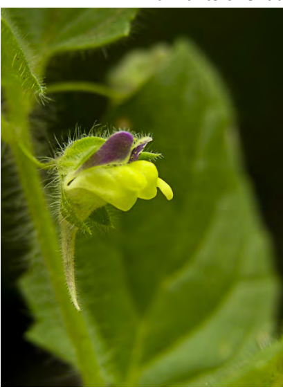
SHARP POINT FLUVELLIN (Kickxia elatine) Naturalized Annual - Plantain Family - (Apr–Oct) - Disturbed, open places - Plant low, sticky-hairy. Some or all leaves arrow-shaped. Flowers yellow or blue, with violet upper lip; 0.3-0.6" long.