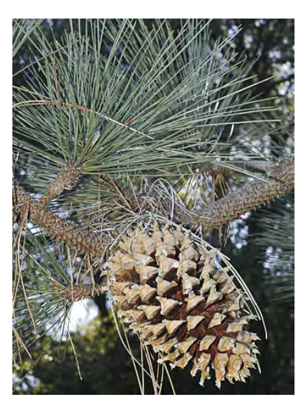
GRAY PINE (Pinus sabiniana) Native Perennial - Pine Family - - - Foothill woodland, n oak woodland, chaparral, infertile soils in mixed-conifer and hardwood forests - Tree < 125' tall. Needles in 3s, 3.5-15" long, gray-green. Cone brownish, seed > wing.