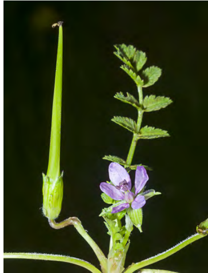
LONG-BEAKED FILAREE (Erodium botrys) Naturalized Annual - Geranium Family - (Mar–Jul) - Dry, open or disturbed sites - Stem 4-35" tall, coarse-hairy. Leaves lobed. Petals pink, 0.3-0.5" long. Sepals w/reddish tip. Fruit beak 2-4.7" long.