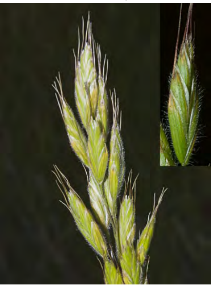
SOFT CHESS (Bromus hordeaceus) Naturalized Annual - Grass Family - (Apr-Jul) - Fields, disturbed areas - Plant 4-26" tall. Leaf hairy. Flower cluster 1-5" long, dense, some stalks > spikelet. Spikelet 0.5-0.9". Lemma 0.26-0.4", awn 0.16-0.4". INVASIVE weed.