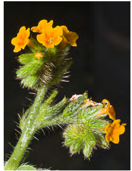
COMMON FIDDLENECK (Amsinckia intermedia) Native Annual - Borage Family - (Mar–Jun) - Abundant. Open, generally disturbed places - Plant 0.5-3' tall. Flowers orange with 5 red spots, 0.3-0.4" long, 0.2-0.4" wide, tube straight.