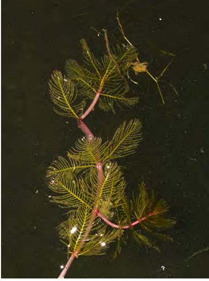
EURASIAN WATER-MILFOIL (Myriophyllum spicatum) Naturalized Perennial - Water-milfoil Family - (Jul-Sep) - Uncommon. Ditches, lake margins - Aquatic. Stem > 39" long. Leaf divisions > 28, paired, 0.4" long. Inflor leaves < 0.12" long. INVASIVE.