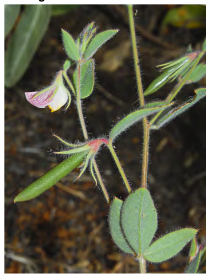
SPANISH CLOVER (Acmispon americanus var. americanus) Native Annual - Pea Family - (May-Oct) - Coast, chaparral, waterways, roadsides, disturbed areas - Plant 2-24", hairy. Flowers white to pink, solitary, bract lobes >> flower tube.