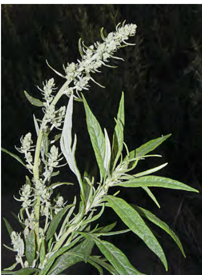
MUGWORT (Artemisia douglasiana) Native Perennial - Sunflower Family - (May–Nov) - Common. Open to shady areas, often in drainages - Plant 20-60" tall. Leaves gen 0.4-4" long, densely hairy below, some 3-5 lobed. Flower bracts hairy.