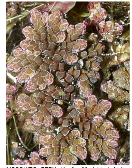
MOSQUITO FERN (Azolla filiculoides) Native Perennial - Mosquito Fern Family - - Common. Ponds, slow streams - Floating aquatic fern, green to red. Stem gen 0.4-1.2" long. Leaves oval, gen ~0.06" long by 0.04" wide. NITROGEN fixing