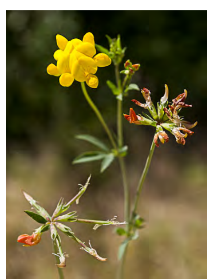
BIRD'S-FOOT TREFOIL (Lotus corniculatus) Naturalized Perennial - Pea Family - (Jun—Sep) - Open, disturbed areas - Leaflets 5, 0.16-0.9" long. Flower cluster 3-7 flowered on0.6-4.7" stalk. Flowers bright yellow, 0.4-0.55" long, banner often reddish.