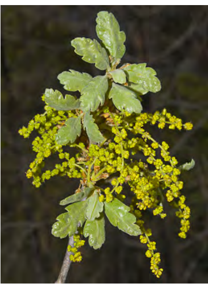
BLUE OAK (Quercus douglasii) Native Perennial - Oak Family - (Apr-May) - Dry slopes, interior foothills, woodland - Tree 20-66', deciduous. Bark checkered into scales. Leaves 1.2-2.4" long, bluish green, unlobed to shallowly lobed, lacking brietles.