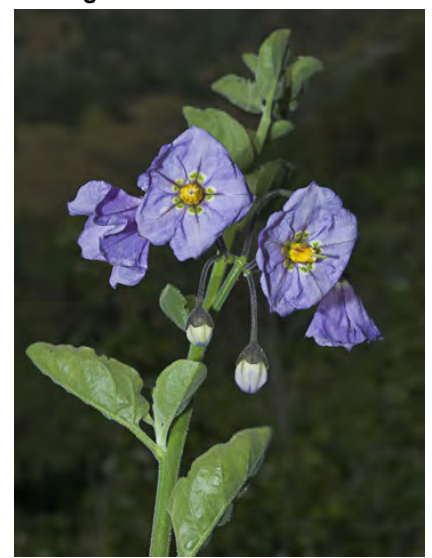
BLUE WITCH (Solanum umbelliferum) Native Perennial - Nightshade Family - (All year) -Shrubland, mixed-evergreen forest, woodland -Plant gen < 39", upper stem hairs branched, dense. Flowers 0.6-1" wide, purple, with green spots at the base.