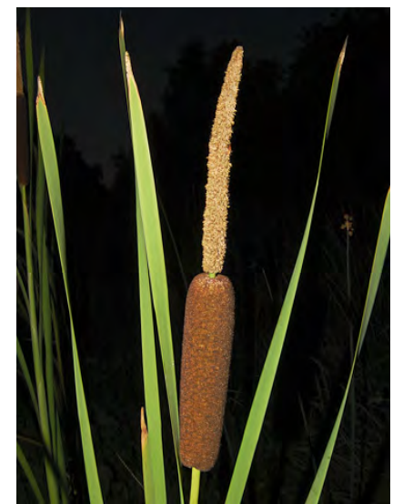
NARROW-LEAVED CATTAIL (Typha angustifolia) Native Perennial - Cattail Family - (May-Aug) - Nutrient-rich freshwater to brackish marshes, wet disturbed places - Plant 4.9-9.8' tall. Leaves gen < 0.4" wide. Flower cluster gap > 4"