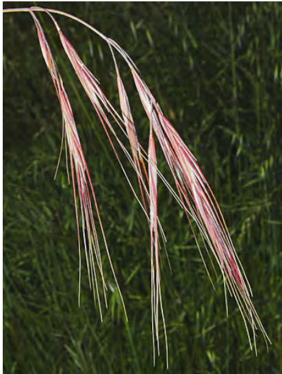
RIPGUT GRASS ( Bromus diandrus ) Naturalized Annual - Grass Family - (Apr-Jul) - Open, gen disturbed areas - Plant 6-40" tall. Spikelet 1-2.8" long. Lemma body 0.8-1.2" long, awn > 1.2" long. Barbed seeds can stick in flesh of animals. INVASIVE weed.