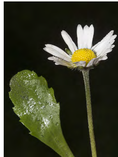
ENGLISH DAISY ( Bellis perennis ) Naturalized Perennial - Sunflower Family - (Dec-Sep) - Damp, grassy areas - Herbaceous lawn weed. Leaves 0.8-4" long, spoon-shaped. Ray flowers white, 0.3-0.4" long, narrow. Disk flowers yellow, ~0.1" long.