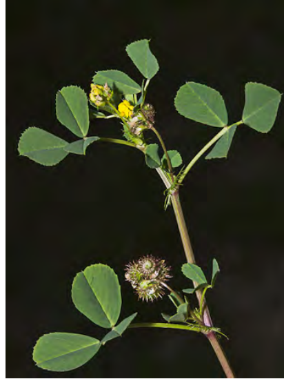
CALIFORNIA BURCLOVER ( Medicago polymorpha ) Naturalized Annual - Pea Family - (Mar-Jul) - Common. Chaparral, oak woodland, streambanks, roadsides, disturbed areas - Stem 4-20". Flower yellow, 0.14-0.24" long. Spiny spiral fruits. INVASIVE.