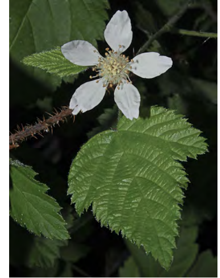
CALIFORNIA BLACKBERRY ( Rubus ursinus ) Native Perennial - Rose Family - (Mar-Jul) - Open, disturbed areas - Stem round, bristly/prickly. Leaves simple to 3 leaflets, underside green. Plants unisexual. Petals 0.24-0.6" long, white. Blackberry-type fruit.