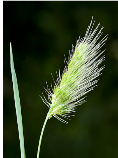
BRISTLY DOGTAIL GRASS ( Cynosurus echinatus ) Naturalized Annual - Grass Family - (May-Jul) - Open, disturbed sites - Tufted. Stem 4-28" long. Leaf blade 0.1-0.6" wide. Flower cluster 0.4-1.6" long, 1-sided. Fertile and sterile spikelets. INVASIVE weed.