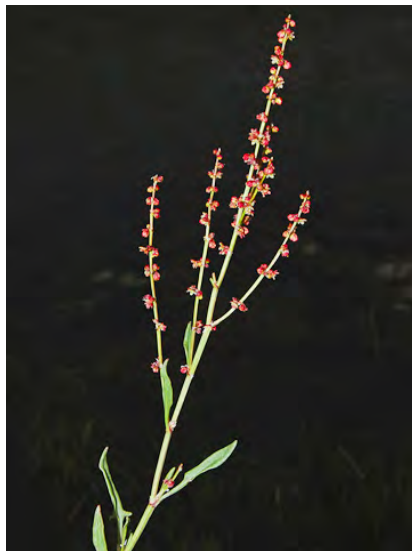
SHEEP SORREL ( Rumex acetosella ) Naturalized Perennial - Buckwheat Family - (Apr–Jul) - ± Disturbed, often acidic places - Stem < 16". Leaf gen basal, blade 0.8-2.4" long, lower arrowhead-shaped w/2 lobes. Flowers yellowish, turn reddish. INVASIVE .