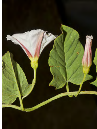
BINDWEED ( Convolvulus arvensis ) Naturalized Perennial - Morning-glory Family - (Mar-Oct) - Roadsides, open areas in many pl communities - Trailing. Leaf 0.8-1.2" long, w/round tip, pointed lobes. Flowers white to pink, 0.8-1" long. NOXIOUS.