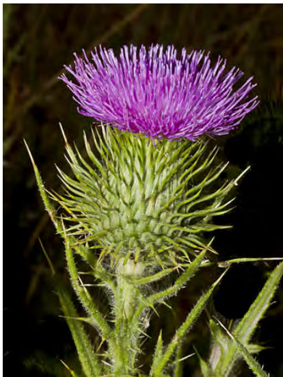
BULL THISTLE ( Cirsium vulgare ) Naturalized Biennial - Sunflower Family - (May–Oct) - Common. Disturbed areas - Plant 12-79" tall. Top of leaves bristly; leaf base forming decurrent wings on stem. Flowers purple, gen 1-2" wide. NOXIOUS weed.