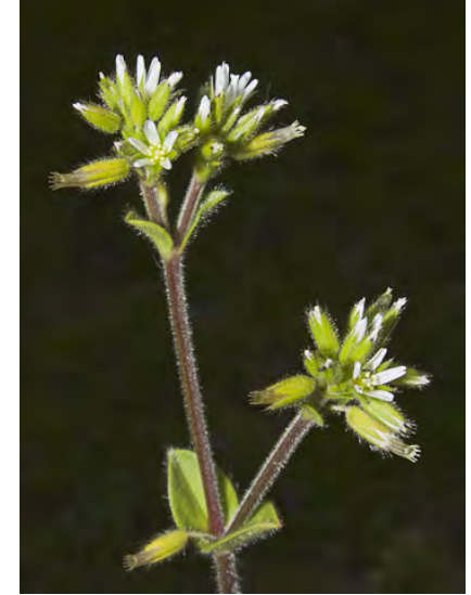
STICKY MOUSE-EAR CHICKWEED ( Cerastium glomeratum ) Naturalized Annual - Pink Family - (Spring) - Dry hillsides, grassland, chaparral, disturbed areas - Flowers 0.1-0.2" long, white, sticky-hairy. Flower bract hairs extend beyond tip; bracts herbaceous.