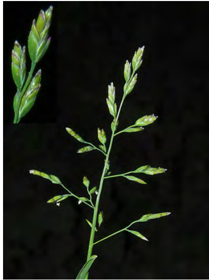
ANNUAL BLUE GRASS ( Poa annua ) Naturalized Annual - Grass Family - (Feb–Sep) - Abundant. Disturbed moist ground - Plant 1-8" tall. Leaf blade 0.04-0.12" wide, soft. Flower cluster 0.4-4" long, triangular. Lemmas 0.1-0.16" long.