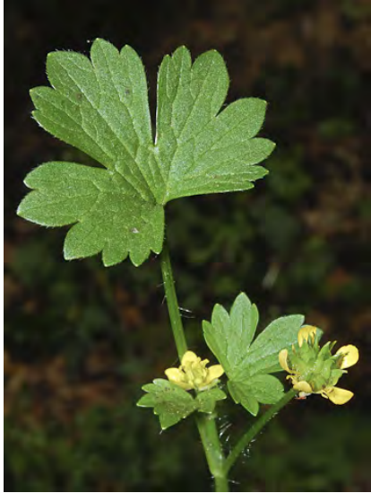
PRICKLESEED BUTTERCUP ( Ranunculus muricatus ) Naturalized Annual - Buttercup Family - (Apr-Jun) - Stream-banks, drainages, low meadows - Plant 6-20". Leaves gen 3-lobed. Petals yellow, 5, 0.16-0.3" long. Fruits 0.2" long with curved bristles.