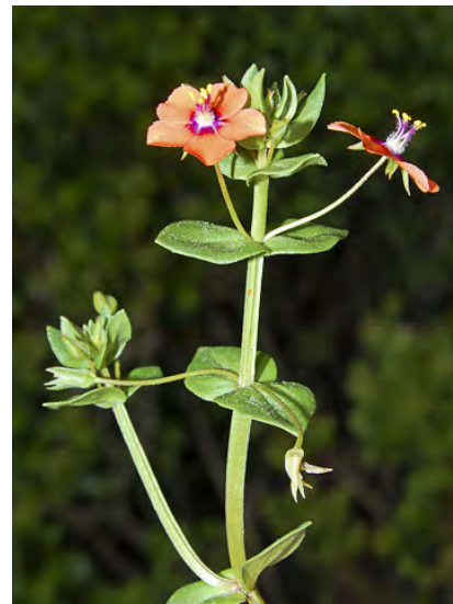
SCARLET PIMPERNEL ( Anagallis arvensis ) Naturalized Annual - Myrsine Family - (Mar–May) - Common. Disturbed places, ocean beaches - Plants 2-16" tall. Flowers 0.2-0.3" long, salmon or occasionally blue. Leaves TOXIC , can cause dermatitis.