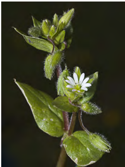
COMMON CHICKWEED ( Stellaria media ) Naturalized Annual - Pink Family - (Feb-Sep) - Oak woodland, meadows, disturbed areas - Plant 2.8-20" tall. Stem w/line of hairs on 1 side. Sepals 0.12-0.18" long. Petals white, 2-lobed, 0.7-0.9x sepals.