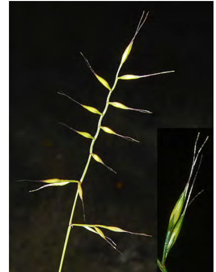
HAIRY FESCUE ( Festuca microstachys ) Native Annual - Grass Family - (Apr-Jun) - Disturbed, open, gen sandy soils - Stem 6-29". Spikelet 0.2-0.4" long, awn 0.1-0.5" long. Glumes & lemma smooth or hairy.