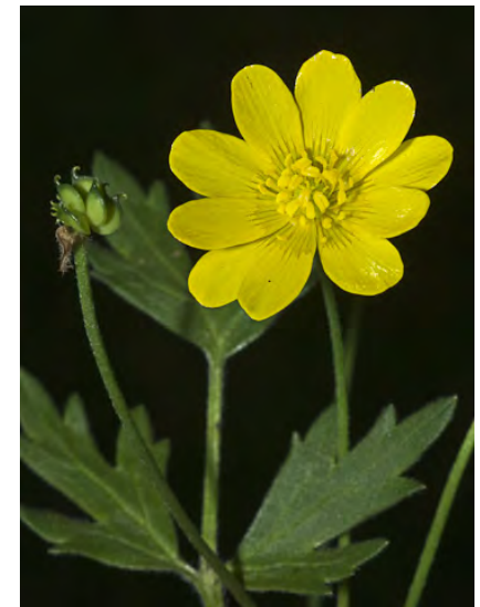
CALIFORNIA BUTTERCUP ( Ranunculus californicus var. californicus ) Native Perennial - Buttercup Family - (Mar-Aug) - Grassland, open woodland - Petals 9-17, 0.28-0.55" long, often > 2x width. Fruit body 0.07-0.13" long, 0.05-0.09" wide, smooth.