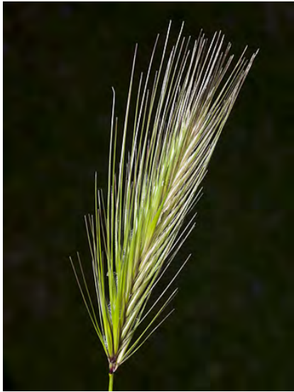
WALL BARLEY ( Hordeum murinum subsp. murinum ) Naturalized Annual - Grass Family - (Feb–May) - Moist, gen disturbed sites - Stem 1-2'. Leaf auricles notable. Central spikelet stalk 0-0.02". Central floret gen = lateral florets. INVASIVE weed.