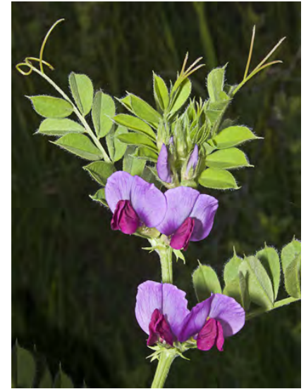
SPRING VETCH ( Vicia sativa subsp. sativa ) Naturalized Annual - Pea Family - (Mar–Jun) - Roadsides, disturbed areas, grassland, open areas in oak and riparian woodlands - Flowers 1-2 at leaf bases, pink-purple to white, 0.7-1.2" long. Leaflets 0.16-0.4" wide.