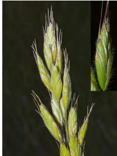
SOFT CHESS ( Bromus hordeaceus ) Naturalized Annual - Grass Family - (Apr-Jul) - Fields, disturbed areas - Plant 4-26" tall. Leaf hairy. Flower cluster 1-5" long, dense, some stalks > spikelet. Spikelet 0.5-0.9". Lemma 0.26-0.4", awn 0.16-0.4". INVASIVE weed.