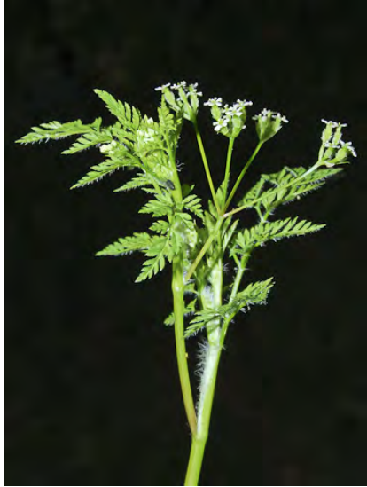
BUR-CHERVIL ( Anthriscus caucalis ) Naturalized Annual - Carrot Family - (Apr-Jun) - Generally shady places - Plant 18-40" tall. Flowers white; flower stalk \geq fruit length. Fruits 0.1-0.2" long with curved "velcro" bristles. Leaves fern-like, triangular outline.