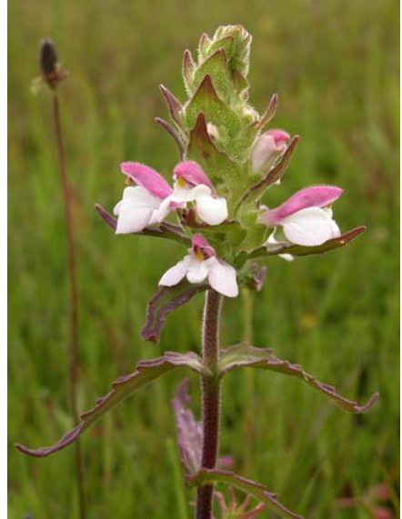
Bellardia Bellardia trixago Introduced Annual Snapdragon Family