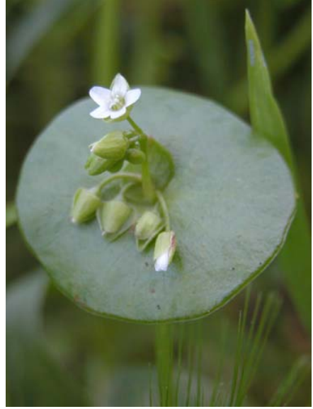
Common Miner's Lettuce Claytonia perfoliata ssp. perfoliata Native Annual Purslane Family