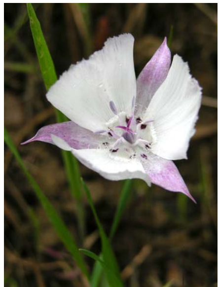
Oakland Star Tulip Calochortus umbellatus Native Perennial Lily Family