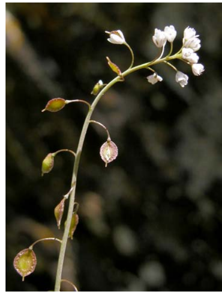
Hairy Fringepod Thysanocarpus curvipes Native Annual Mustard Family