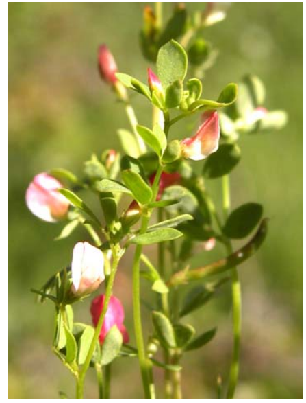
Spanish Clover Lotus purshianus var. purshianus Native Annual Pea Family