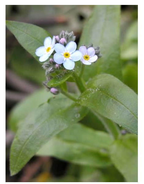
Forget-me-not Myosotis latifolia Introduced Perennial Borage Family