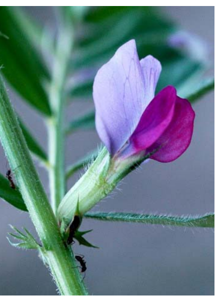
Spring Vetch Vicia sativa ssp. sativa Introduced Annual Pea Family