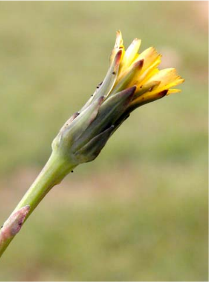
Smooth Cat's-ear Hypochaeris glabra Introduced Annual Sunflower Family