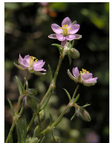
Ruby Sand Spurry Spergularia rubra Introduced Annual-Perennial Pink Family