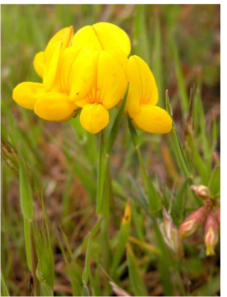
Bird's-foot Deerweed Lotus corniculatus Introduced Perennial Pea Family