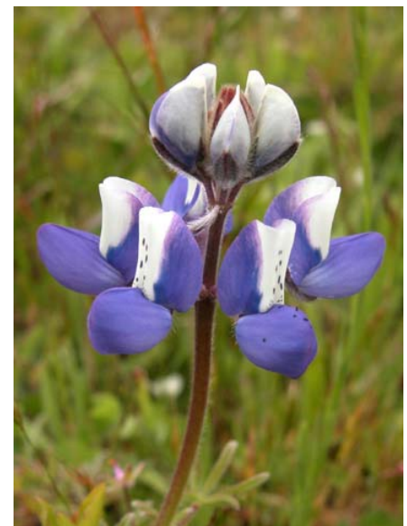
Douglas Sky Lupine Lupinus nanus Native Annual Pea Family