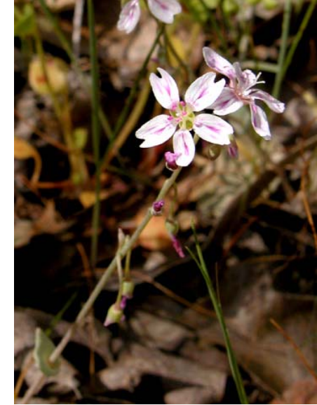
Common Pale Claytonia Claytonia exigua ssp. exigua Native Annual Purslane Family