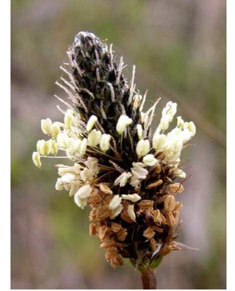
English Plantain Plantago lanceolata Introduced Annual Plantain Family