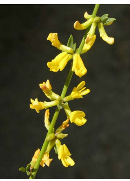
Deerweed Lotus scoparius var. scoparius Native Perennial Pea Family