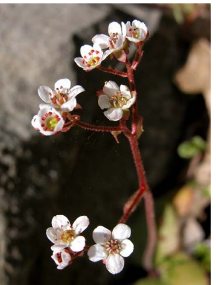
California Saxifrage Saxifraga californica Native Perennial Saxifrage Family