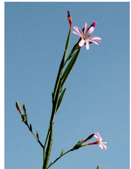
Panicled / Weedy Willowherb Epilobium brachycarpum Native Annual Evening Primrose Family