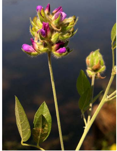
California Tea Rupertia physodes Native Perennial Pea Family