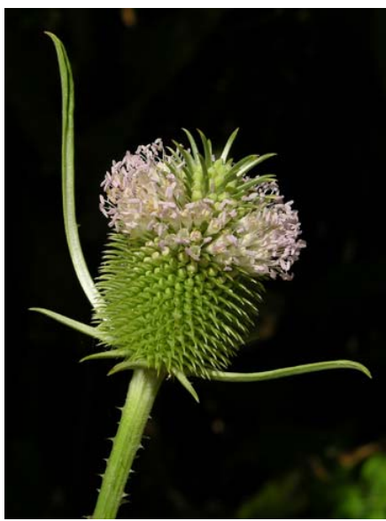
Wild Teasel Dipsacus sativus Introduced Biennial Teasel Family