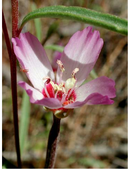
Presidio Clarkia Clarkia franciscana Native Annual Evening Primrose Family