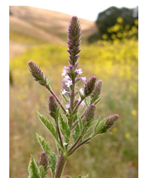
Robust Vervain Verbena lasiostachys var. scabrida Native Perennial Vervain Family