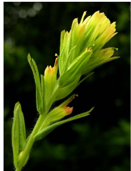
Seaside / Coastal Paintbrush Castilleja wightii Native Perennial Snapdragon Family