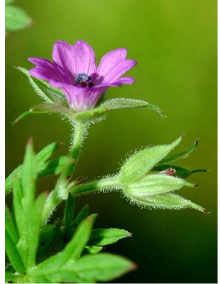
Purpletip Cut-leaf Geranium Geranium dissectum Introduced Annual Geranium Family