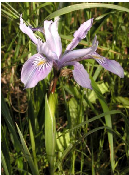
Douglas Iris Iris douglasiana Native Perennial Iris Family