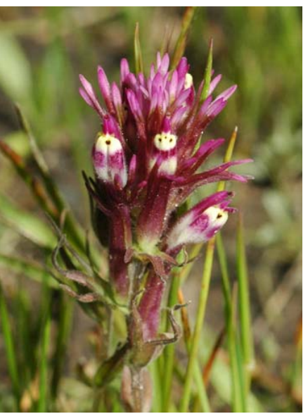
Common Owl's Clover Castilleja densiflora ssp. densiflora Native Annual Snapdragon Family