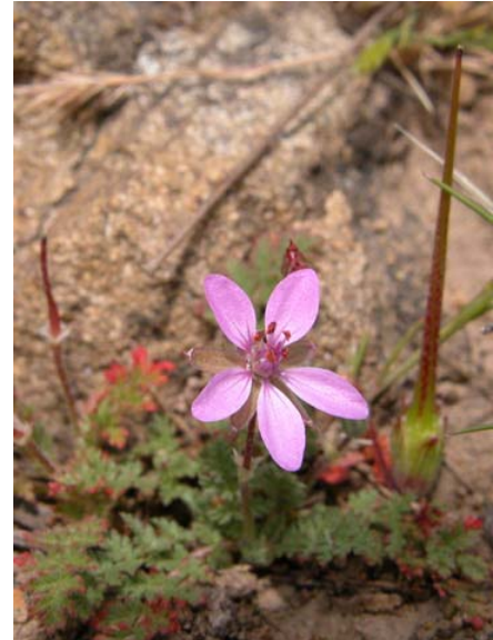
Red-stem Filaree Erodium cicutarium Introduced Annual Geranium Family