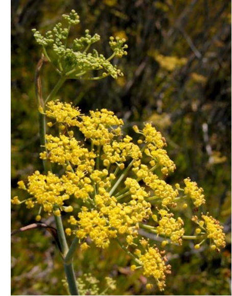
Sweet Fennel Foeniculum vulgare Introduced Perennial Carrot Family