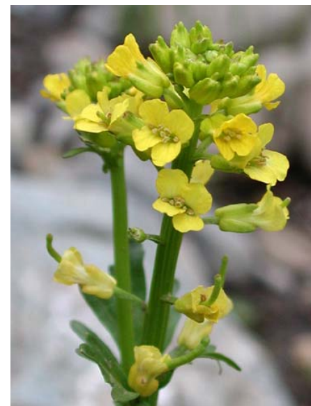
Erect-pod Winter Cress Barbarea orthoceras Native Perennial Mustard Family