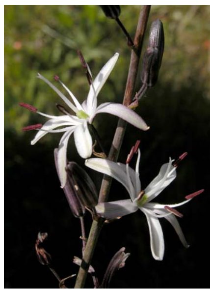
Common Soap Plant Chlorogalum pomeridianum var. pomeridianum Native Perennial Lily Family