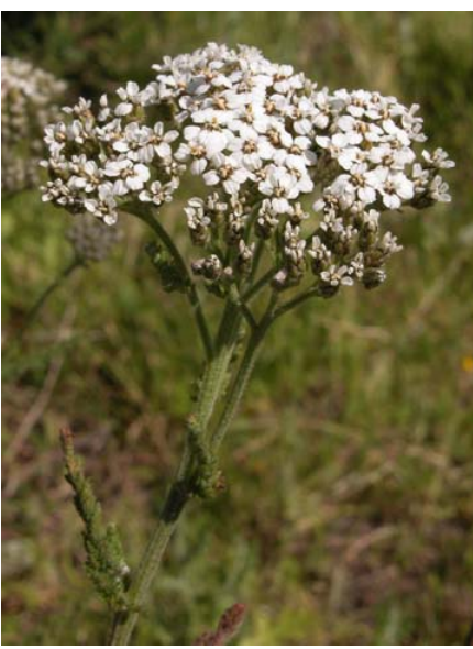
Yarrow Achillea millefolium Native Perennial Sunflower Family