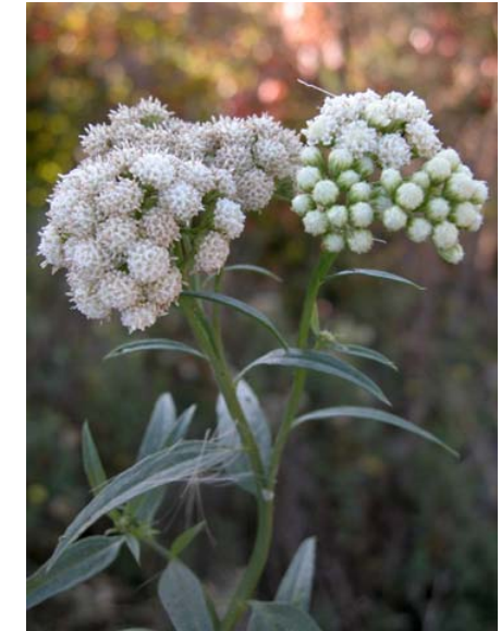
Douglas/Salt Marsh Baccharis Baccharis douglasii Native Perennial Sunflower Family