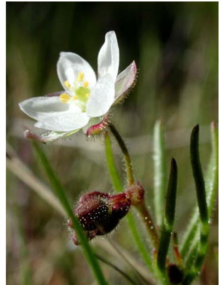
Stickwort Spergula arvensis ssp. arvensis Introduced Annual Pink Family