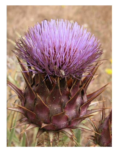
Cardoon / Artichoke Thistle Cynara cardunculus Introduced Perennial Sunflower Family