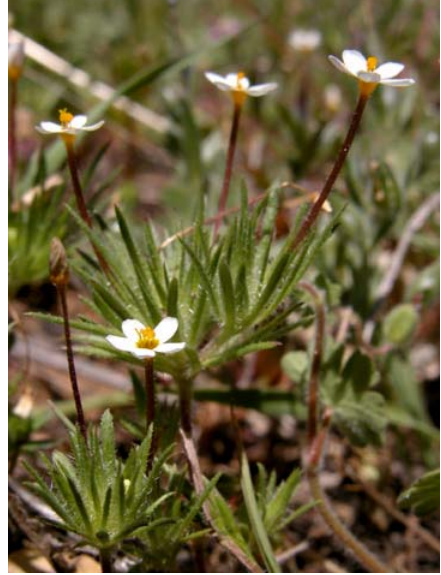
Bicolor Linanthus Linanthus bicolor Native Annual Phlox Family