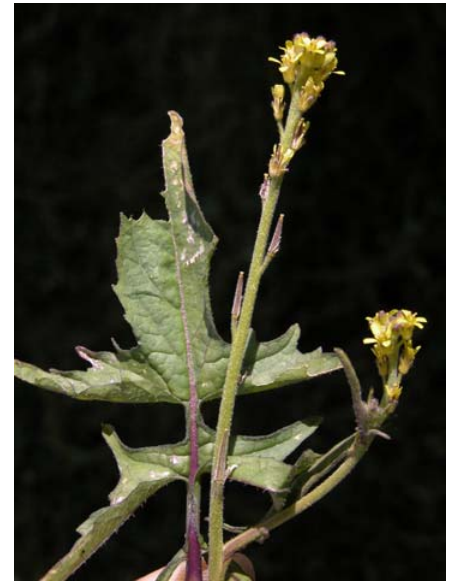
Black Mustard Brassica nigra Introduced Annual Mustard Family