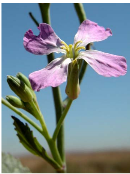
Wild Radish Raphanus sativus Introduced Annual Mustard Family