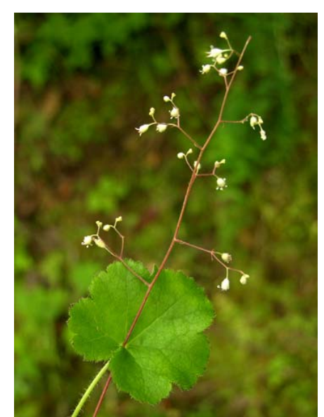
Small-flower Alumroot Heuchera micrantha Native Perennial Saxifrage Family