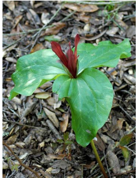
Giant Trillium Trillium chloropetalum Native Perennial Lily Family