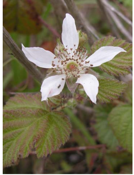
Native California Blackberry Rubus ursinus Native Perennial Rose Family