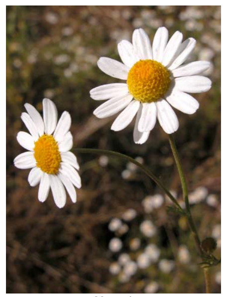
Mayweed Anthemis cotula Introduced Annual Sunflower Family