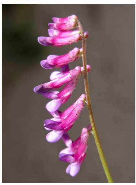
Winter Vetch Vicia villosa ssp. varia Introduced Annual-Biennial Pea Family