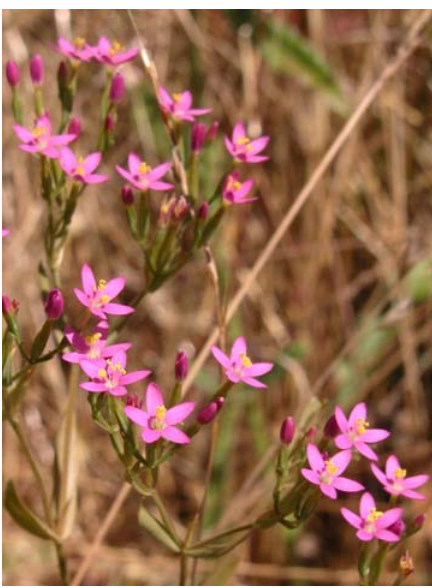
Monterey Centaury Centaurium muhlenbergii Native Annual-Biennial Gentian Family