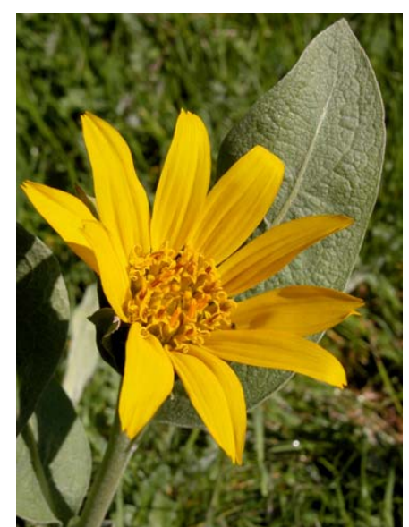
Gray Mule's Ear Wyethia helenioides Native Perennial Sunflower Family