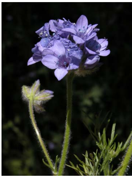
California Blue Gilia Gilia achilleifolia ssp. achilleifolia Native Annual Phlox Family