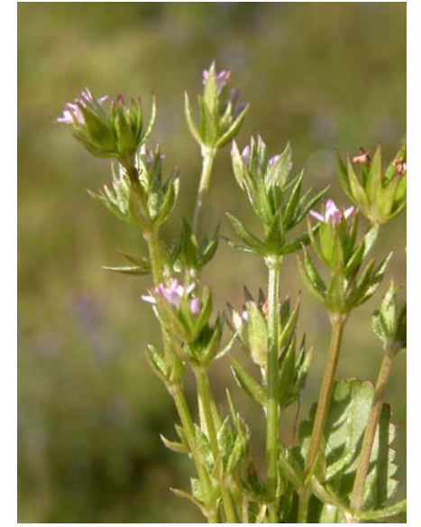
Blue Field Madder Sherardia arvensis Introduced Annual Madder Family