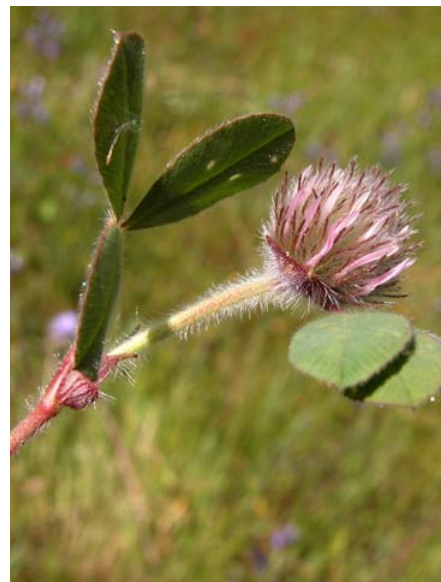
Rose Clover Trifolium hirtum Introduced Annual Pea Family