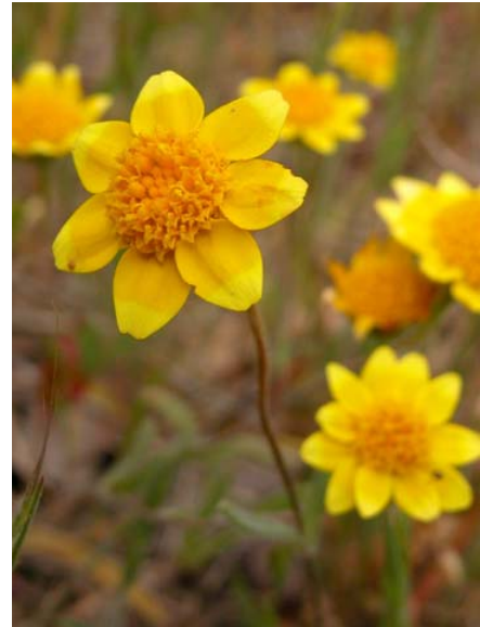
Goldfields Lasthenia californica Native Annual Sunflower Family