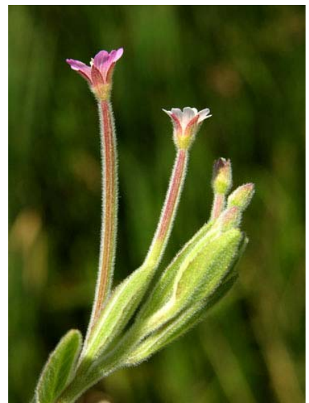
Common Willowherb Epilobium ciliatum ssp. ciliatum Native Perennial Evening Primrose Family