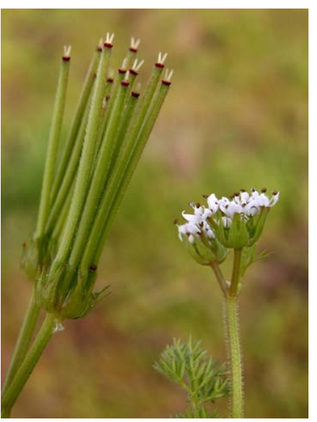
Shepherd's Needle Scandix pecten-veneris Introduced Annual Carrot Family