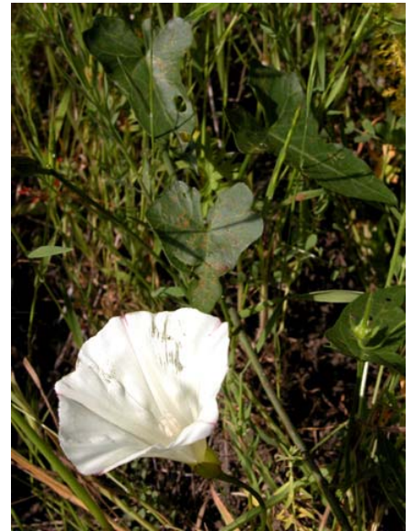
Climbing Morning Glory Calystegia purpurata ssp. purpurata Native Perennial Morning-Glory Family