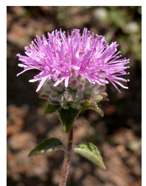
Common Coyotemint Monardella villosa ssp. villosa Native Perennial Mint Family