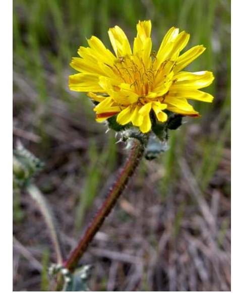
Bristly Ox-tongue Picris echioides Introduced Annual-Biennial Sunflower Family