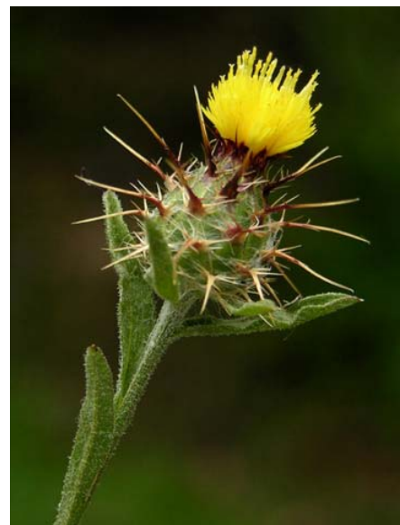
Tocalote Centaurea melitensis Introduced Annual Sunflower Family