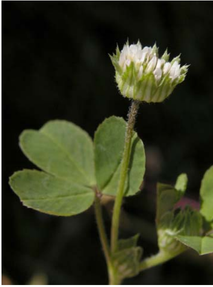
Thimble Clover Trifolium microdon Native Annual Pea Family