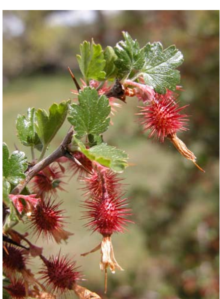
Hillside Gooseberry Ribes californicum var. californicum Native Perennial Gooseberry Family