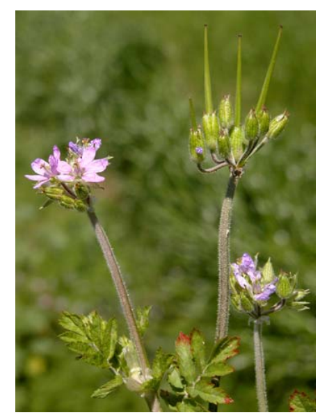
White-stem Filaree Erodium moschatum Introduced Annual Geranium Family