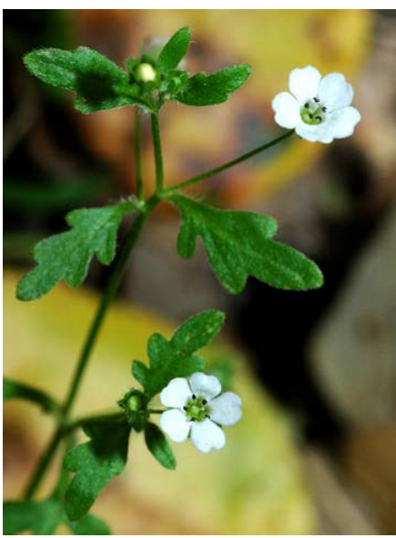
Variable-leaf Nemophila Nemophila heterophylla Native Annual Waterleaf Family