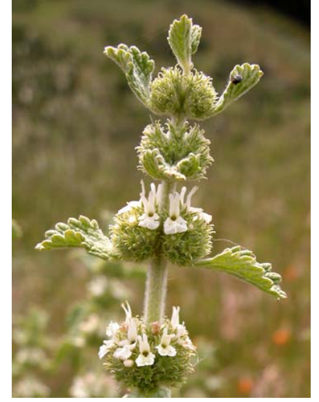
Common Horehound Marrubium vulgare Introduced Perennial Mint Family