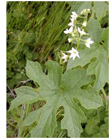
Oregon / Coast Manroot Marah oreganus Native Perennial Gourd Family