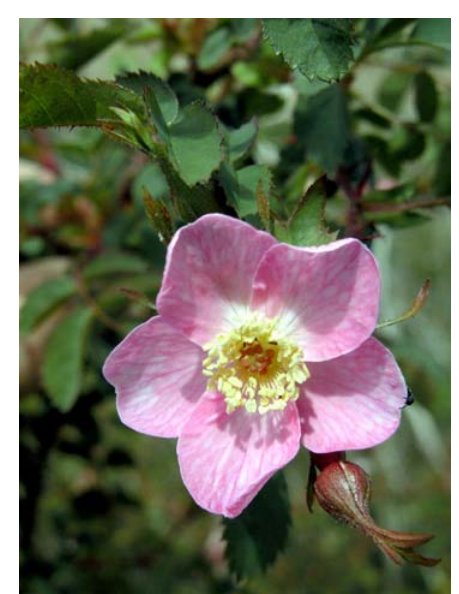
California Wild Rose Rosa californica Native Perennial Rose Family