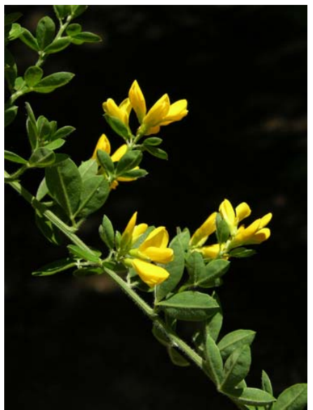
French Broom Genista monspessulana Introduced Perennial Pea Family