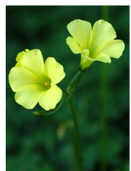
Bermuda Buttercup Oxalis pes-caprae Introduced Perennial Oxalis Family