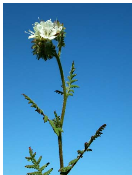
Wild Heliotrope Phacelia Phacelia distans Native Annual Waterleaf Family