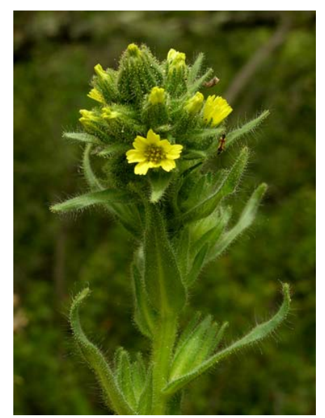
Common / Coast Tarweed Madia sativa Native Annual Sunflower Family