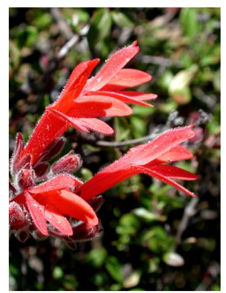
California Fuchsia Epilobium canum ssp. canum Native Perennial Evening Primrose Family