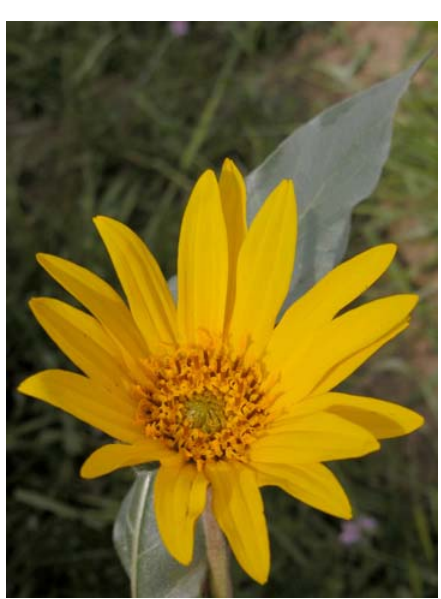
Narrow-leaf Mule's Ear Wyethia angustifolia Native Perennial Sunflower Family