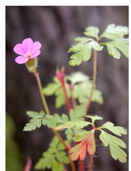
Herb Robert Geranium robertianum Introduced Annual-Biennial Geranium Family