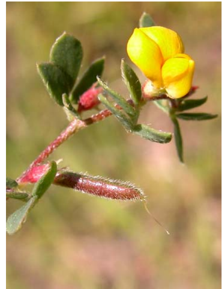
California Lotus Lotus wrangelianus Native Annual Pea Family