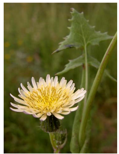
Common Sow Thistle Sonchus oleraceus Introduced Annual Sunflower Family