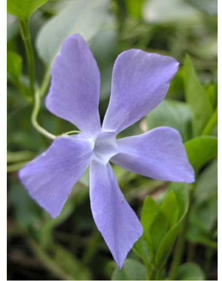
Greater Periwinkle Vinca major Introduced Perennial Dogbane Family