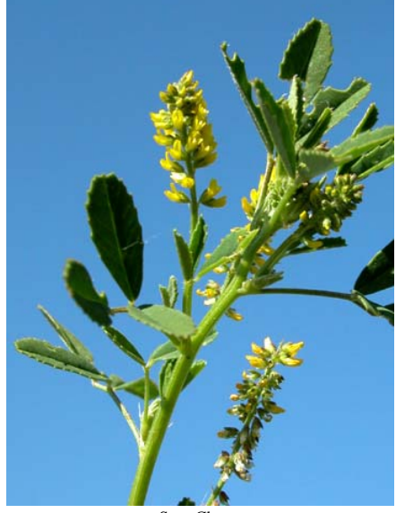
Sour Clover Melilotus indica Introduced Annual-Biennial Pea Family