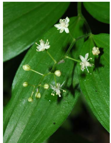
Starry False Solomon's Seal Smilacina stellata Native Perennial Lily Family