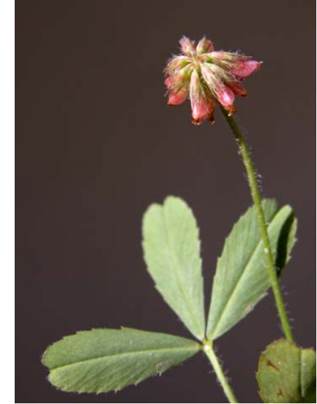
Tree Clover Trifolium ciliolatum Native Annual Pea Family