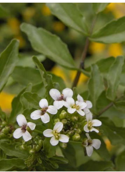
White Water Cress *Rorippa nasturtium-aquaticum Native Perennial Mustard Family