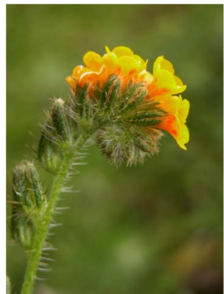
Common Fiddleneck Amsinckia menziesii var. intermedia Native Annual Borage Family