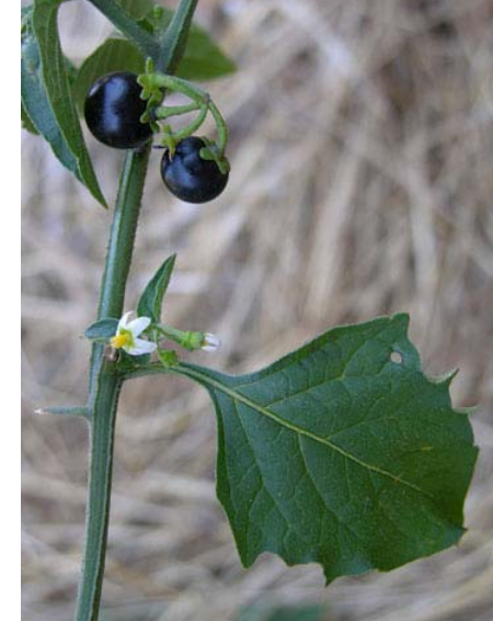
Small-flower Nightshade Solanum americanum Native Annual-Perennial Nightshade Family