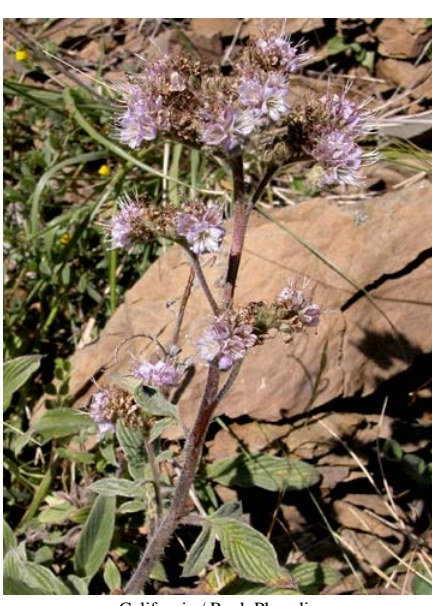
California / Rock Phacelia Phacelia californica Native Perennial Waterleaf Family