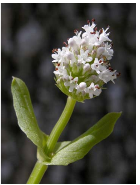
Longhorn Plectritis Plectritis macrocera Native Annual Valerian Family