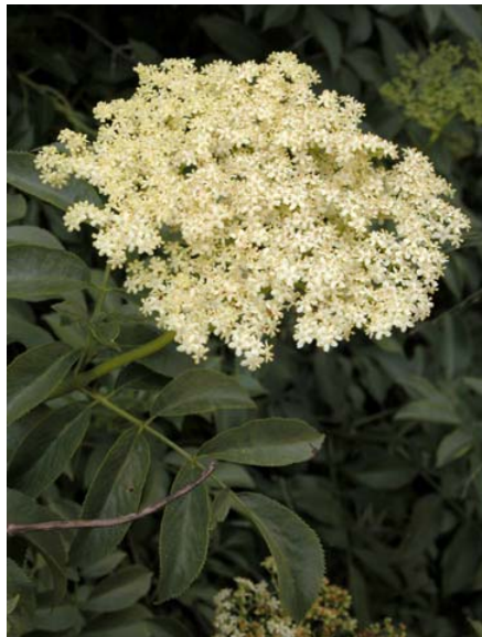
Blue Elderberry Sambucus mexicana Native Perennial Honeysuckle Family