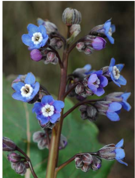
Large Hound's Tongue Cynoglossum grande Native Perennial Borage Family