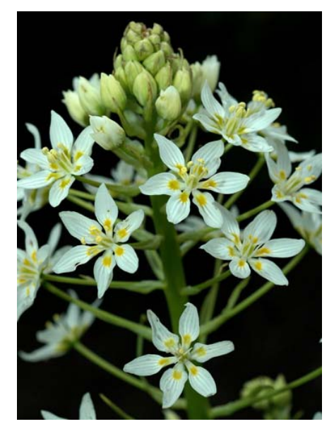
Common Star Lily Zigadenus fremontii Native Perennial Lily Family