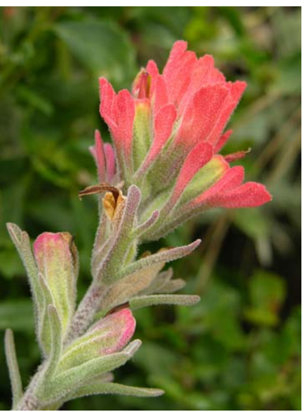
Woolly Paintbrush Castilleja foliolosa Native Perennial Snapdragon Family