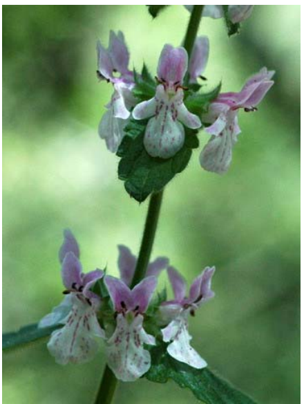
Common Rigid Hedge Nettle Stachys ajugoides var. rigida Native Perennial Mint Family