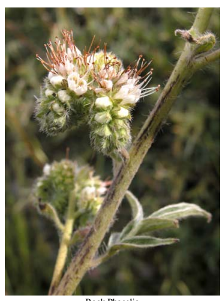
Rock Phacelia Phacelia imbricata ssp. imbricata Native Perennial Waterleaf Family