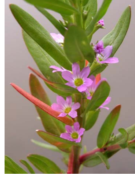
Grass Poly Loosestrife Lythrum hyssopifolium Introduced Annual-Perennial Loosestrife Family