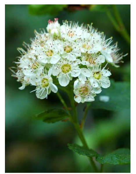
Pacific Ninebark Physocarpus capitatus Native Perennial Rose Family