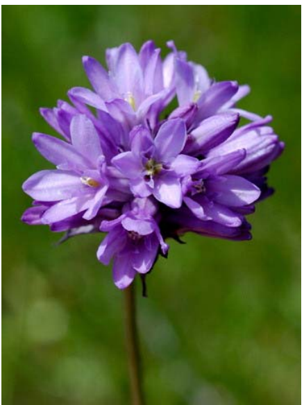
Ookow Dichelostemma congestum Native Perennial Lily Family