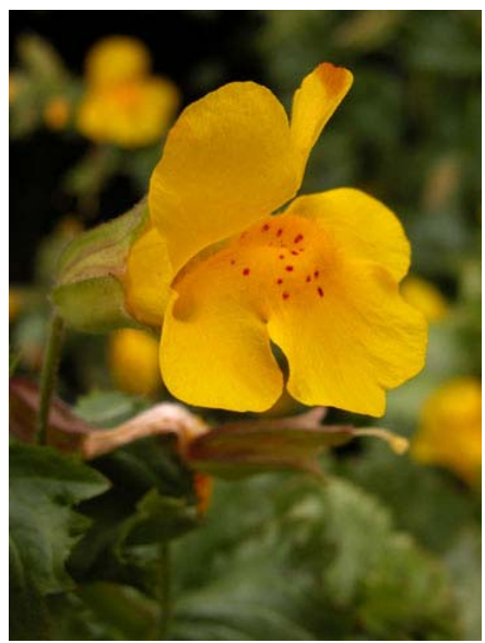
Golden Monkey Flower Minulus guttatus Native Perennial Snapdragon Family