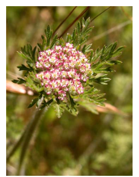
Rattlesnake Weed Daucus pusillus Native Annual Carrot Family