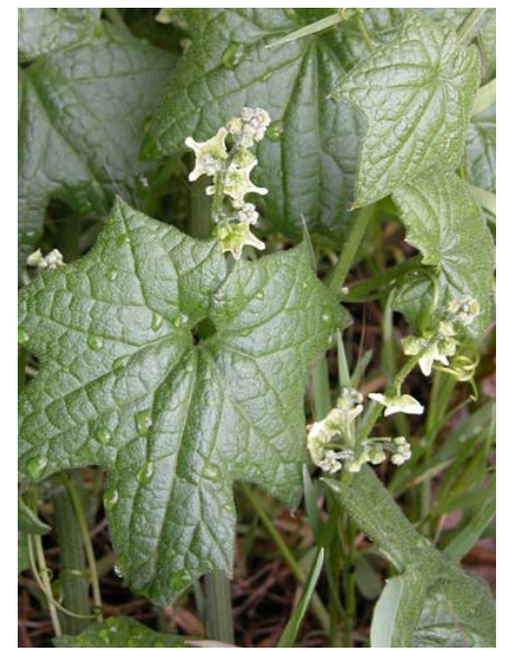
Common / California Manroot Marah fabaceus Native Perennial Gourd Family