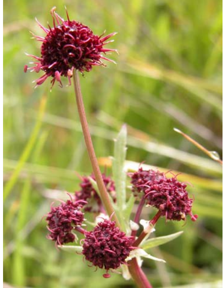
Purple Sanicle Sanicula bipinnatifida Native Perennial Carrot Family