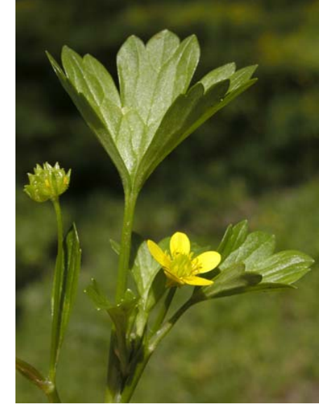
Prickleseed Buttercup Ranunculus muricatus Introduced Annual Buttercup Family