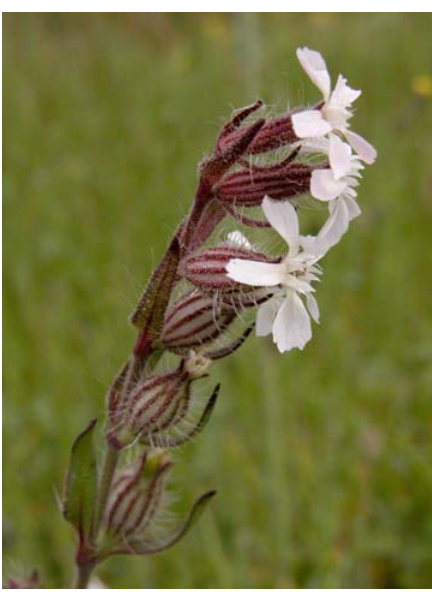
Windmill Pink Silene gallica Introduced Annual Pink Family