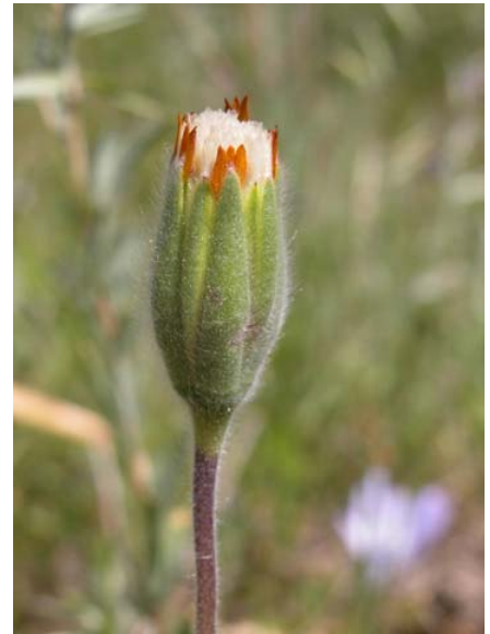
Blow Wives Achyrachaena mollis Native Annual Sunflower Family