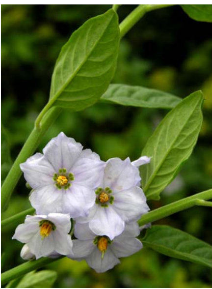
Blue Witch Solanum umbelliferum Native Perennial Nightshade Family