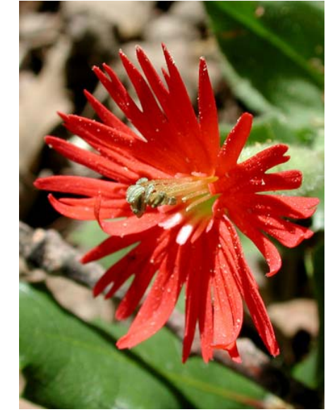
Indian Pink Silene californica Native Perennial Pink Family