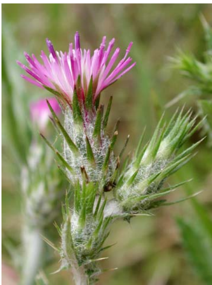
Italian Thistle Carduus pycnocephalus Introduced Annual Sunflower Family