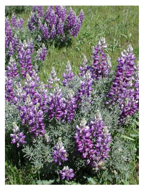
Blue Bush / Silver Lupine Lupinus albifrons var. albifrons Native Perennial Pea Family