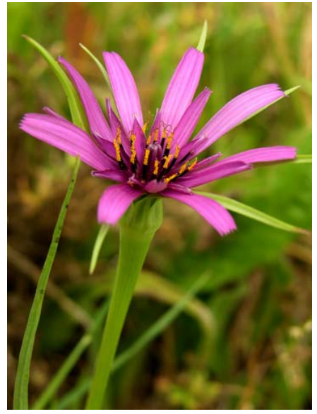
Purple Salsify Tragopogon porrifolius Introduced Biennial-Perennial Sunflower Family