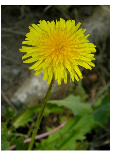
Common Dandelion Taraxacum officinale Introduced Biennial-Perennial Sunflower Family