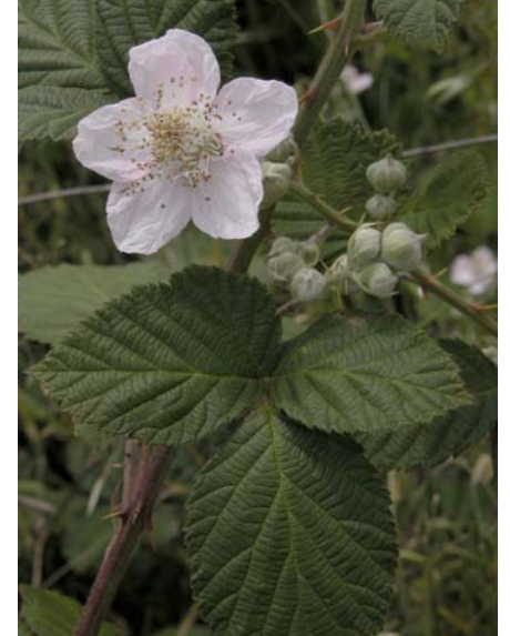
Himalayan Blackberry Rubus discolor Introduced Perennial Rose Family