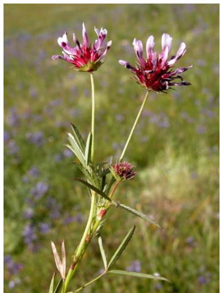
Tomcat Clover Trifolium willdenovii Native Annual Pea Family