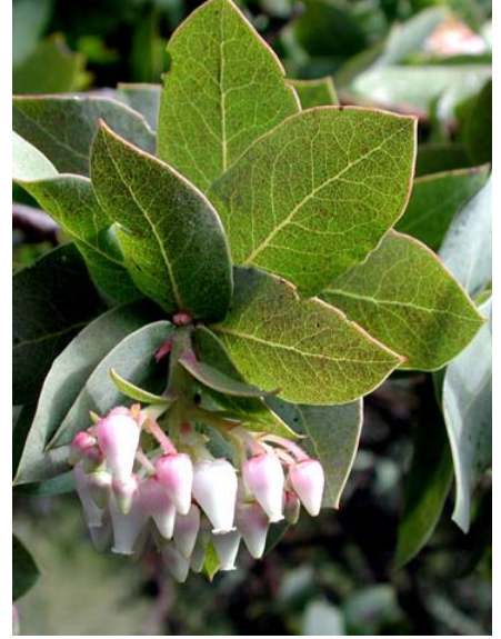
Pallid Manzanita Arctostaphylos pallida Native Perennial Heath Family