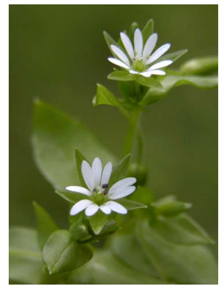
Common Chickweed Stellaria media Introduced Annual Pink Family