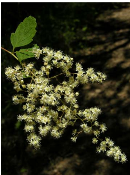
Creambush / Ocean Spray Holodiscus discolor Native Perennial Rose Family