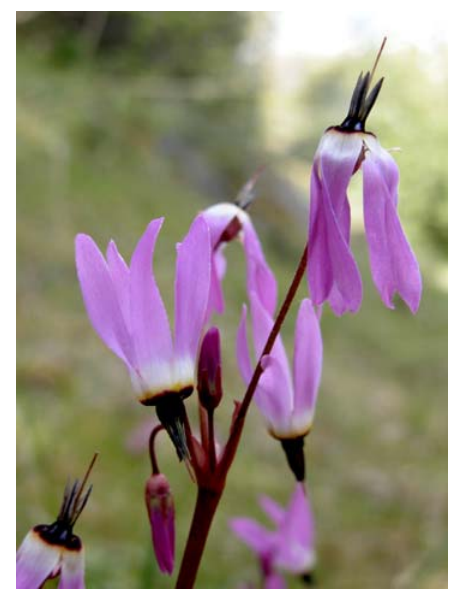
Mosquitobills Shooting Star Dodecatheon hendersonii Native Perennial Primrose Family