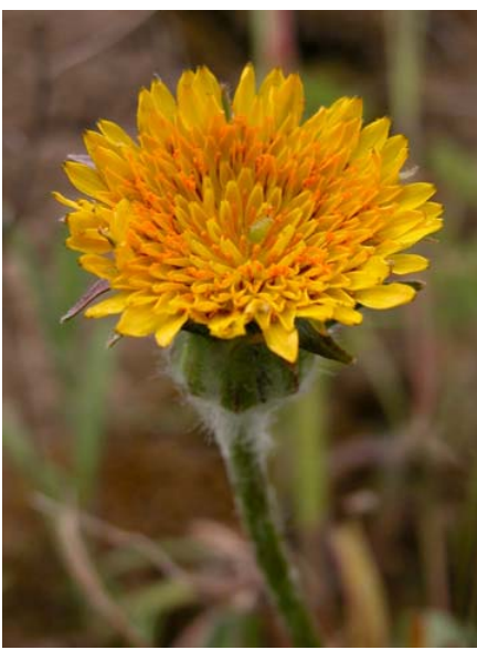
Large-flower Native Dandelion Agoseris grandiflora Native Perennial Sunflower Family