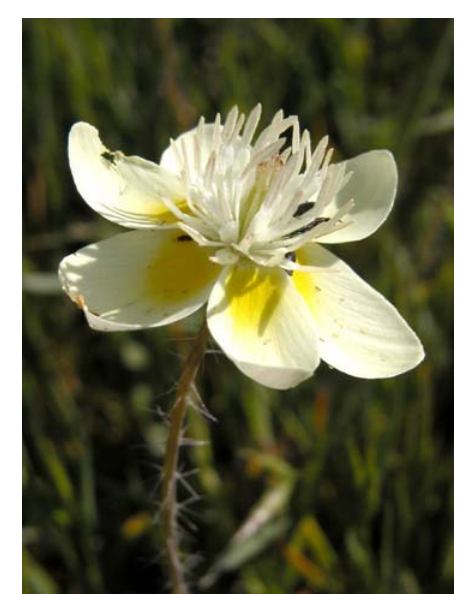
Cream Cups Platystemon californicus Native Annual Poppy Family