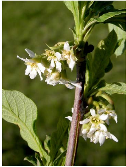
Oso Berry Oemleria cerasiformis Native Perennial Rose Family