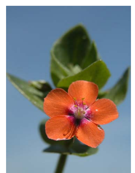
Scarlet Pimpernel Anagallis arvensis Introduced Annual Primrose Family