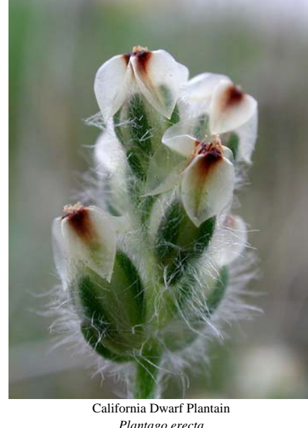
California Dwarf Plantain Plantago erecta Native Annual Plantain Family