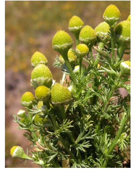
Pineapple Weed Chamomilla suaveolens Introduced Annual Sunflower Family