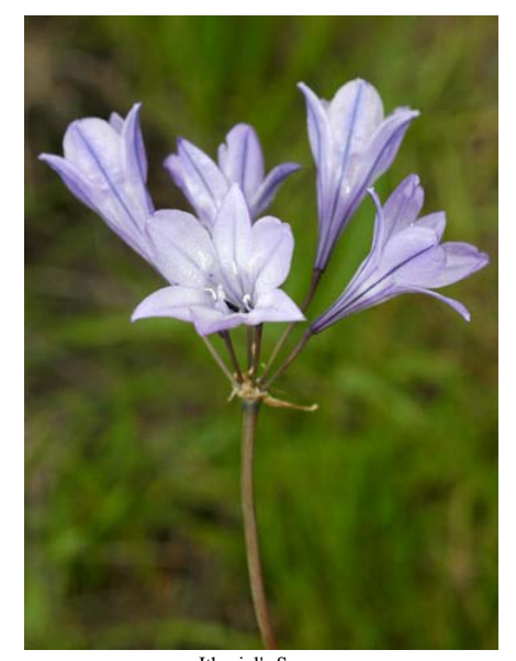
Ithuriel's Spear Triteleia laxa Native Perennial Lily Family