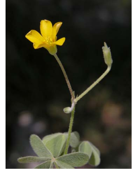
Creeping Wood Sorrel Oxalis corniculata Introduced Perennial Oxalis Family