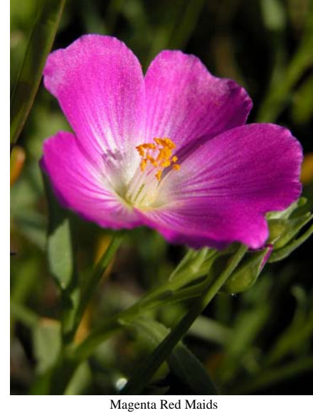
Magenta Red Maids Calandrinia ciliata Native Annual Purslane Family