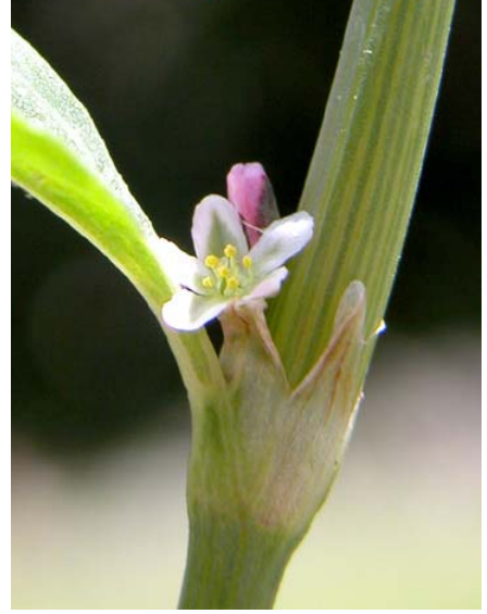
Common Yard Knotweed Polygonum arenastrum Introduced Annual Buckwheat Family