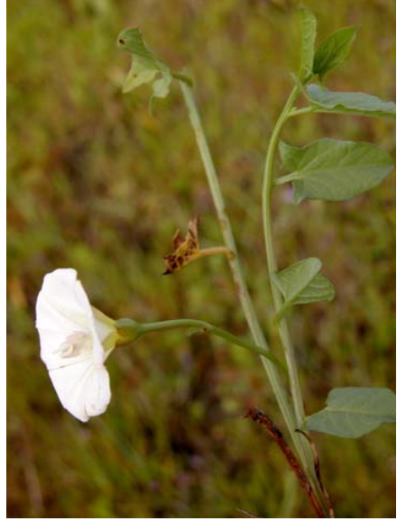
Field Bindweed Convolvulus arvensis Introduced Perennial Morning-Glory Family