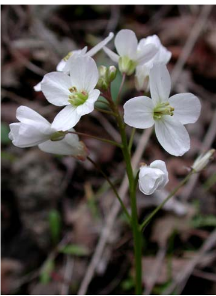
Milkmaids Cardamine californica Native Perennial Mustard Family