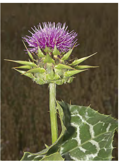
MILK THISTLE (Silybum marianum) Naturalized Annual-Biennial - Sunflower Family - (Feb-Jun) - Roadsides, pastures, disturbed areas - Stem 1-10', stout. Leaves spiny, shiny green w/white veins and spots. Flowers red-purple. INVASIVE weed