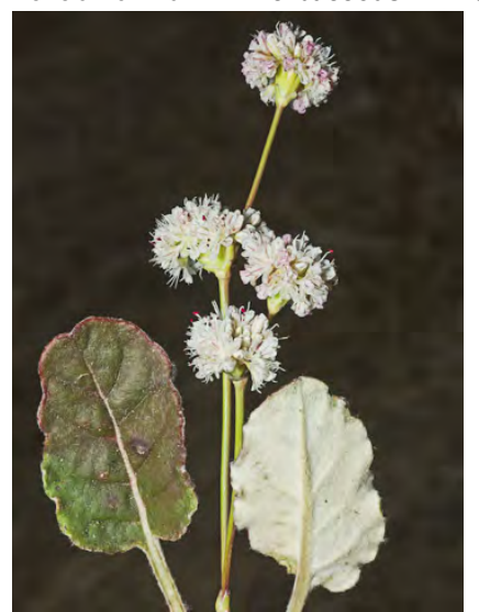
EAR-SHAPED WILD BUCKWHEAT (Eriogonum nudum var. auriculatum) Native Perennial - Buckwheat Family - (May-Oct) - Common. Sand or gravel - Plant 5-15 dm. Leaves on stem, curled. Inflor smooth. Flowers white to pink, smooth.