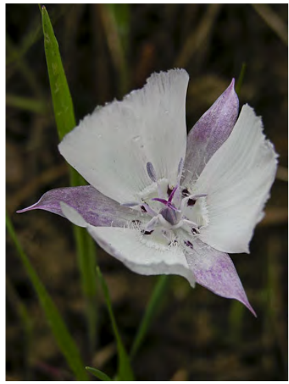
OAKLAND STAR-TULIP (Calochortus umbellatus) Native Perennial - Lily Family -(Calochortus (Mar–May) - Open chaparral or woodland, gen on serpentine - Stem 3-10". Petals white or pink, 0.5-0.7" long, square tip, purple-spotted base. CNPS: FAIRLY ENDANGERED.