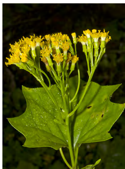
GERMAN IVY (Delairea odorata) Naturalized Perennial - Sunflower Family - (Nov-Mar) - Shady, ± disturbed places, riparian woodland, coastal scrub - Vine stem 3-20' long. Heads ~ 20 per cluster. Disk flowers bright yellow. NOXIOUS weed.