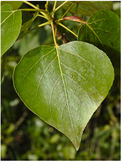
BLACK COTTONWOOD (Populus trichocarpa) Native Perennial - Willow Family - (Feb-Apr) - Alluvial bottomland, streamsides - Tree < 100' tall. Leaves egg-shaped, finely-scalloped edge, blade 1.2-2.8" long.