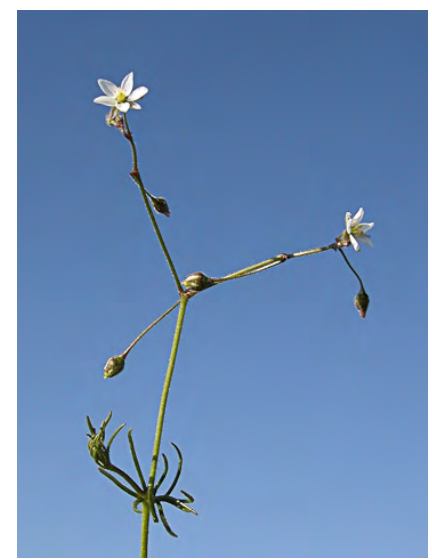
STICKWORT (Spergula arvensis) Naturalized Annual - Pink Family - (Spring-early summer) - Open slopes, pine woodland, sand dunes, fields, disturbed areas - Stem 4-16"+. Leaves 0.4-2" long, linear, in whorls.