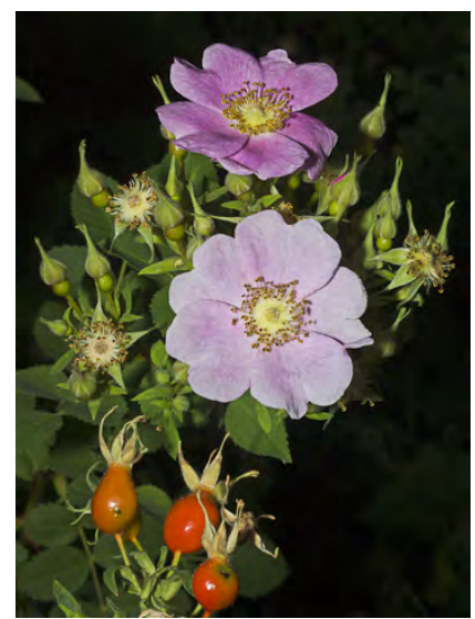
CALIFORNIA ROSE (Rosa californica) Native Perennial - Rose Family - (Feb-Nov) - Gen ± moist areas in sun, esp streambanks - Shrub 2.6-8.2' tall w/thick curved spines, forming thickets. Petals pink, 0.6-1" long; sepals unlobed.