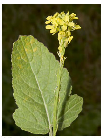
BLACK MUSTARD (Brassica nigra) Naturalized Annual - Mustard Family - (Apr-Sep) - Common. Disturbed areas, fields - Plant 1-6' tall. Petals bright yellow, 0.3-0.4" long. Fruit upright, pressed against stem. INVASIVE weed.