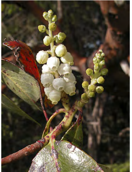
PACIFIC MADRONE (Arbutus menziesii) Native Perennial - Heath Family - (Mar–May) - Conifer, oak forests - Tree < 130' tall, evergreen, peeling red bark. Leaf blades < 5" long. Flowers yellow-white or pink, < 3.1" long. Berries red, < 0.5" diam, round.