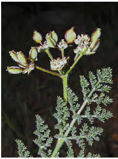
WOOLLY FRUITED DESERTPARSLEY (Lomatium dasycarpum subsp. dasycarpum) Native Perennial - Carrot Family - (Mar–Jun) - Rocky (gen serpentine), chaparral, woodland - Plant 4-20", short-hairy. Flowers greenish-white, petals and fruit hairy.