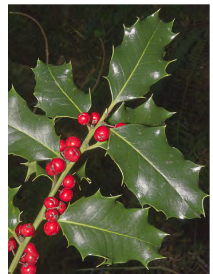
ENGLISH HOLLY (llex aquifolium) Naturalized Perennial - Holly Family - (May-Jun) - Cool, wooded areas - Shrub or tree < 66' tall. Leaves 1-2.4" long, edges smooth or w/spine-like teeth. Flower petals ~0.1" long, dull white. Fruits red, ~0.3" wide, smooth.