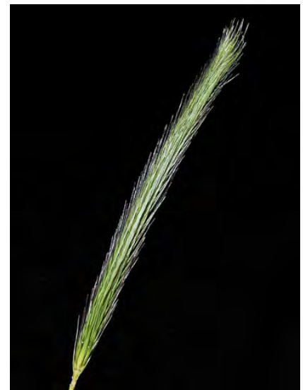
CALIFORNIA BARLEY (Hordeum brachyantherum subsp. californicum) Native Perennial - Grass Family - (Mar–Jul) - Meadows, pastures, streambanks - Stem 8-37" tall, gen slender. Leaf sheaths gen densly hairy, blade <= 4.5" long. Lemma awn < 0.3" long.