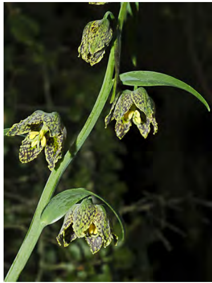
CHECKER LILY (Fritillaria affinis) Native Perennial - Lily Family - (Mar—Jun) - Common. Oak or pine scrub, grassland - Stem 4-47" tall. Leaves 1.6-6.3" long, whorled below. Petals mottled brown-purple and yellow-green, 0.4-1.6" long