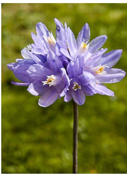
BLUE DICKS (Dichelostemma capitatum subsp. capitatum) Native Perennial - Brodiaea Family - (Mar-Jun) - Open woodland, scrub, desert, grassland - Plant 2-28" tall. Flowers blue-purple, not narrowed in the middle. Stamens 6. Early spring bloomer.