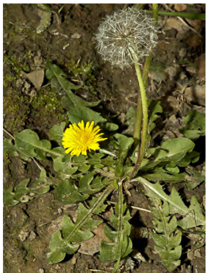
COMMON DANDELION (Taraxacum officinale) Naturalized Biennial-Perennial - Sunflower Family - (All year) - Abundant. Esp disturbed areas -Stem hollow. Leaves bright green with sharp down-pointing lobes. Outer head bracts reflexed. Fruit ~ brown.