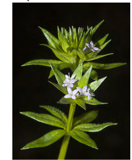
FIELD MADDER (Sherardia arvensis) Naturalized Annual - Madder Family - (Mar–Jul) -Pastures, disturbed areas, grassland, dry meadows, oak woodland - Stem 2.8-6.3" long. Leaves in whorls of 5-6, 0.2-0.5" long. Flowers pink or lavender, the 4 lobes < tube.