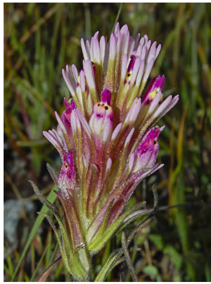
COMMON OWL'S-CLOVER (Castilleja densiflora subsp. densiflora) Native Annual - Broom-rape Family - (Mar-May) - Grassland - Plant 4-16" tall. Leaves 0.8-3.1" long, narrow-lobed. Flower cluster gen rose-purple. Flower upper lip straight.