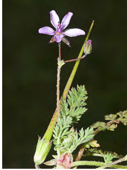
REDSTEM FILAREE (Erodium cicutarium) Naturalized Annual - Geranium Family (Feb-Sep) - Open, disturbed sites, grassland, scrub - Stem 4-20". Leaves compound, leaflets dissected. Sepal tip bristly. Petal pink to purple. Fruit beak 0.8-2". INVASIVE.