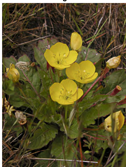
GOLDEN EGGS SUNCUP (Taraxia ovata) Native Perennial - Evening Primrose Family - (Mar–Jun) - Grassy fields, gen clay soil - Stemless. Leaf blade oval, 1.2-6" long w/long stalks. Flower stalks leafless. Petals yellow, 0.3-0.9" long. Ovary hidden.