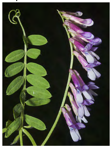
SPARSELY HAIRY VETCH (Vicia villosa subsp. varia) Naturalized Annual-Biennial - Pea Family - (Mar-Jun) - Grassland, roadside, disturbed areas - Stems w/few hairs. Flowers 10-20, blue-purple to white, 0.4-0.55" long. Lower bract lobes 0.04-0.1" long.