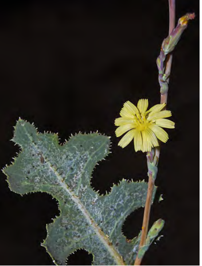
PRICKLY LETTUCE (Lactuca serriola) Naturalized Annual - Sunflower Family - (May-Oct) - Abundant. Disturbed places - Stem 1.6-10' tall, prickly-bristly. Leaves deeply-lobed, midvein and edges prickly-bristly. Flowers pale yellow, 0.16-0.2" wide.