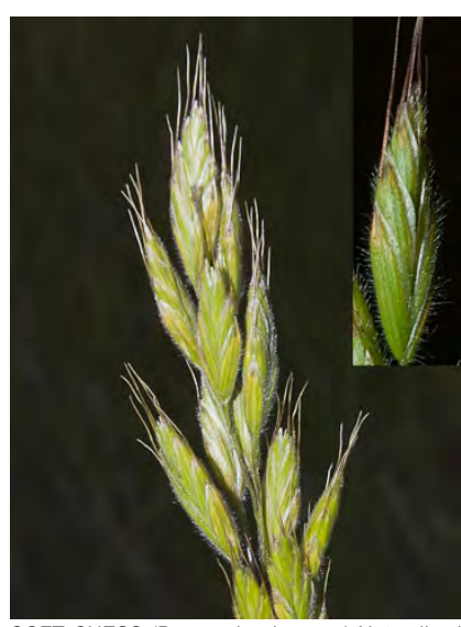
SOFT CHESS (Bromus hordeaceus) Naturalized Annual - Grass Family - (Apr-Jul) - Fields, disturbed areas - Plant 4-26" tall. Leaf hairy. Flower cluster 1-5" long, dense, some stalks > spikelet. Spikelet 0.5-0.9". Lemma 0.26-0.4", awn 0.16-0.4". INVASIVE weed.