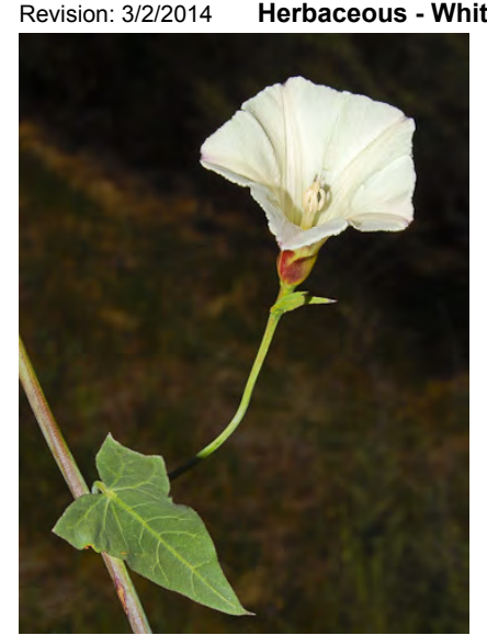
CLIMBING MORNING-GLORY (Calystegia purpurata subsp. purpurata) Native Perennial -Morning-glory Family - (May–Jun) - Chaparral, coastal scrub - Stem strongly climbing. Leaf triangular, lobes strongly angled. Bractlets smooth, small, distant.