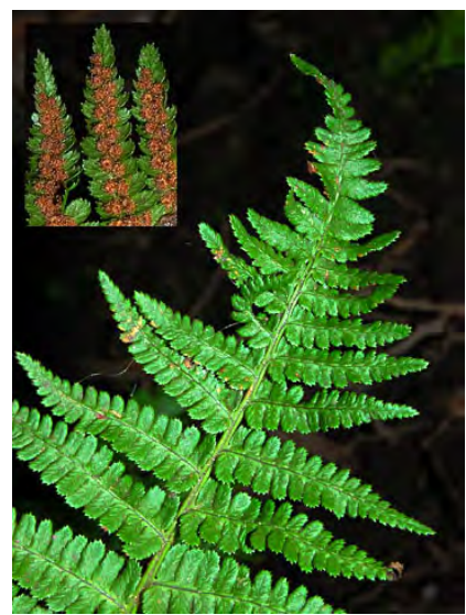
WESTERN LADY FERN (Athyrium filix-femina var. cyclosorum) Native Perennial - Cliff Fern Family - - - Woodland, along streams, seepage area - Leaves gen 12-39" long, broadest near middle, 1-2 divided, ultimate divisions rounded.