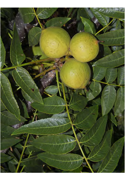
N. CALIFORNIA BLACK WALNUT (Juglans hindsii) Native Perennial - Walnut Family -(Apr–May) - Along streams, disturbed slopes -Tree 20-75'. Leaflets 13-21, 3-5". Fruit 1.4-2" wide. CNPS: SERIOUSLY ENDANGERED (unplanted).