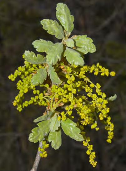
BLUE OAK (Quercus douglasii) Native Perennial - Oak Family - (Apr-May) - Dry slopes, interior foothills, woodland - Tree 20-66', deciduous. Bark checkered into scales. Leaves 1.2-2.4" long, bluish green, unlobed to shallowly lobed, lacking