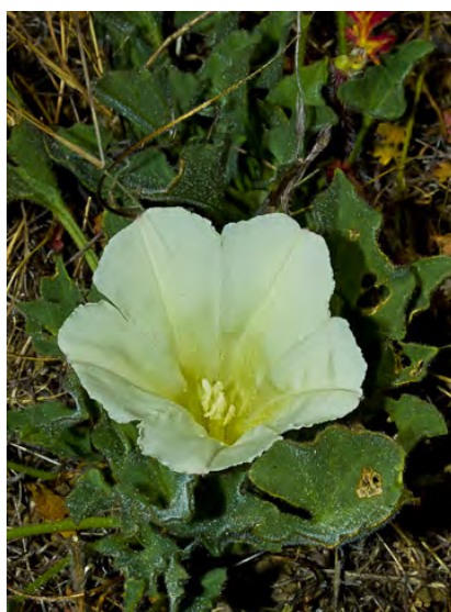
SHORTSTEM MORNING-GLORY (Calystegia subacaulis subsp. subacaulis) Native Perennial -Morning-glory Family - (Apr-Jun) - Dry, open scrub or woodland - Stem gen ~0.8" long. Flowers 1.3-2.4" long, white or cream. Bractlets concealing flower bracts.