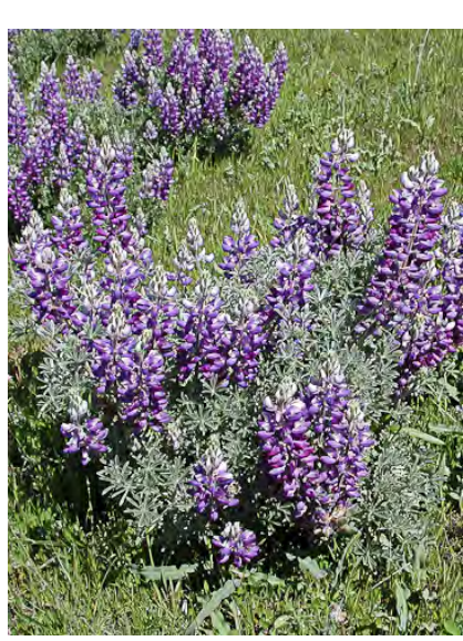
BUSH LUPINE (Lupinus albifrons var. albifrons) Native Perennial - Pea Family - (Mar–Jun) -Common. Chaparral, foothill woodland - Shrub 2-16' tall, gen distinct trunk, green to silvery. Flowers 0.35-0.6" long, purple, banner back hairy, keel top ciliate mid to tip.