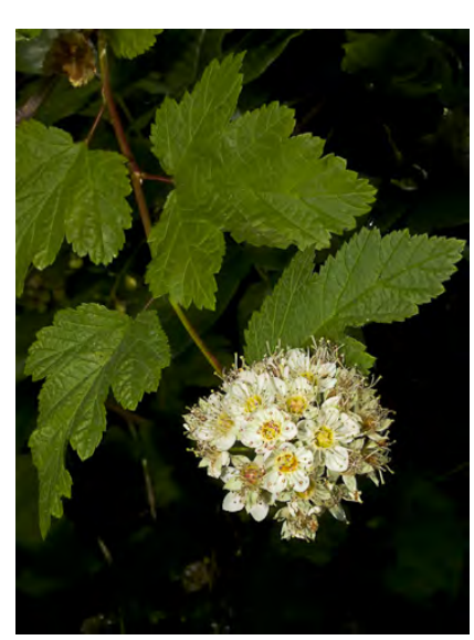
PACIFIC NINEBARK (Physocarpus capitatus) Native Perennial - Rose Family - (May—Jul) - Moist banks, n-facing slopes, mixed-conifer forest - Shrub 3.3-8'. Leaf blades gen < 4" wide, 3-5 lobed. Petals white, ~0.1" long. Fruits reddish, 0.3-0.4" long.