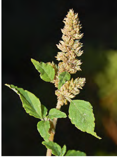
LOW AMARANTH (Amaranthus deflexus) Naturalized Annual - Amaranth Family -(May–Nov) - Railroad right-of-ways, disturbed areas - Stems low, 4-20", mostly lying on ground. Dense flower clusters at stem sides and ends, 1-3" long, green or brown.