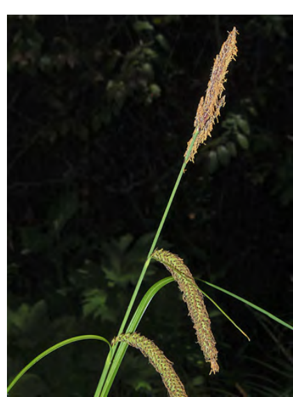
SANTA BARBARA SEDGE (Carex barbarae) - Native Perennial - Sedge Family - (May-Aug) - Seasonally wet places - Stem 6-36" tall, base brown to purple. Lowest flower cluster "leaves" < 4" long. Spikelets brown, 1-3" long, 0.2-0.3" wide.