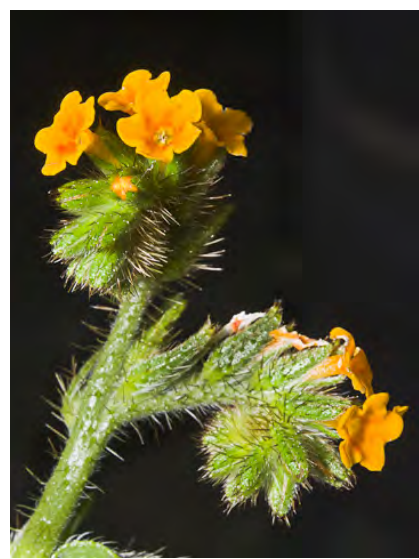
COMMON FIDDLENECK (Amsinckia intermedia) Native Annual - Borage Family - (Mar–Jun) -Abundant. Open, generally disturbed places -Plant 0.5-3' tall. Flowers orange with 5 red spots, 0.3-0.4" long, 0.2-0.4" wide, tube straight.