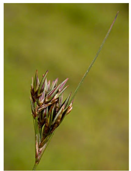
WESTERN RUSH (Juncus occidentalis) Native Perennial - Rush Family - (May–Sep) - Moist gen sunny areas - Plant 1-2' tall, tufted, stiff. Flower cluster gen tightly clustered. Leaves basal, < 1/2 stem length, 'petals' > 0.16".