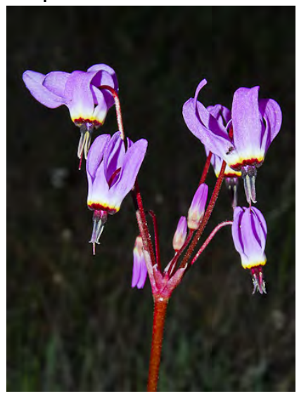
MOSQUITOBILLS SHOOTING STAR (Dodecatheon hendersonii) Native Perennial - Primrose Family - (Mar—Jul) - Gen in shady sites - Leaf blade length generally <2x width. Flower parts 4s or 5s. Filament tube solid black.