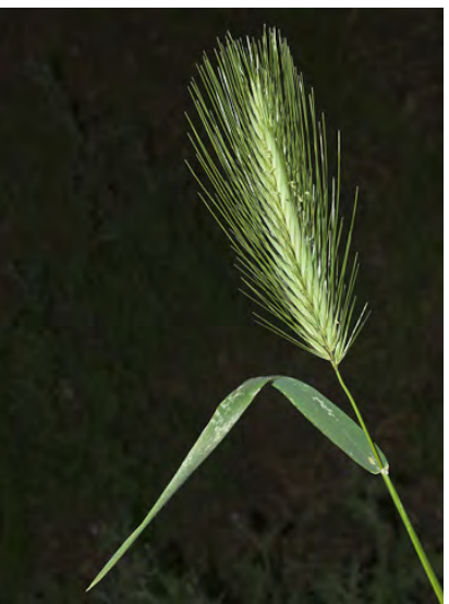
HARE BARLEY (Hordeum murinum subsp. leporinum) Naturalized Annual - Grass Family - (Feb-May) - Moist, gen disturbed sites. Common - Stem 12-43" tall. Central spikelet stalk ~0.06" long. Central floret << lateral florets. INVASIVE weed