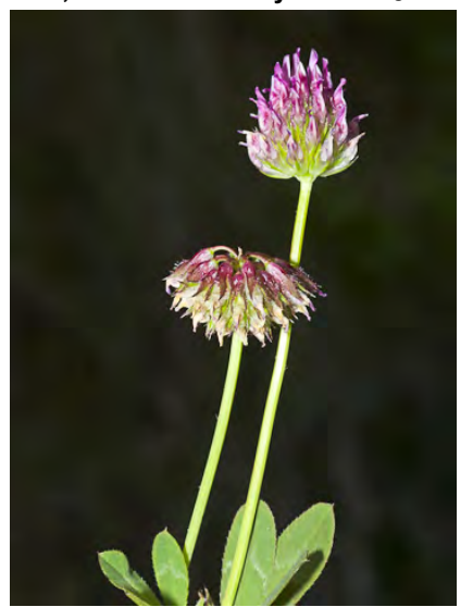
FOOTHILL CLOVER (Trifolium ciliolatum) Native Annual - Pea Family - (Mar–Jun) - Locally common. Grassland, chaparral, disturbed areas - Flower head 0.3-0.8" wide w/vestigial bract. Flowers pink to purple, soon reflexed, bracts w/short, flat bristles.