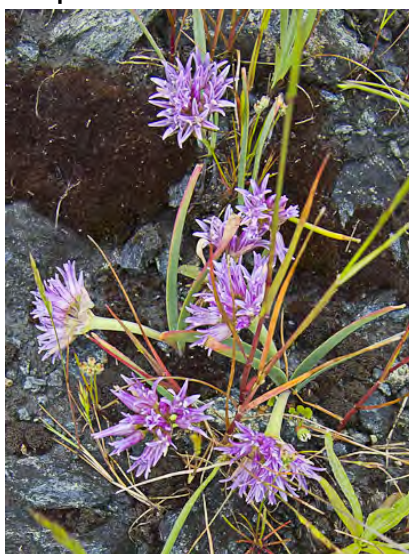
SICKLE LEAF ONION (Allium falcifolium) Native Perennial - Onion or Garlic Family - (Apr–Jun) - Common. Heavy clays including serpentine - Leaves 2, flat, curved. Stem flat, winged. Flowers rose-purple or dingy white, 10-30, 0.4-0.6" long.