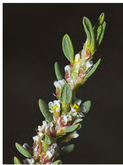
KNOTWEED (Polygonum aviculare subsp. depressum) Naturalized Annual - Buckwheat Family - (May–Nov) - Disturbed places - Stem 4-20", mat-forming. Flowers 2-8/leaf axil, ~0.1" long, fused 1/2 length, w/white or pink margins.