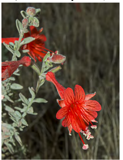
CALIFORNIA FUCHSIA (Epilobium canum subsp. canum) Native Perennial - Evening Primrose Family - (Jun-Dec) - Dry slopes, ridges - Plant hairy, gen sticky with a woody base. Leaf 0.3-2.8" long, gray to green. Flowers red-orange, floral tube 0.8-1.2" long.