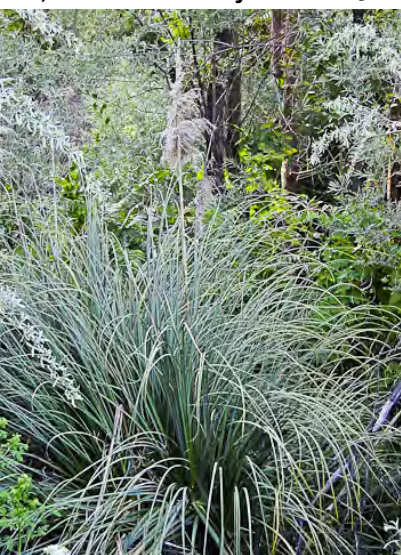
SMOOTH PAMPAS GRASS (Cortaderia selloana) Naturalized Perennial - Grass Family - (Sep-Mar) - Disturbed sites - Plant 6-13' tall. Leaf blades 0.1-0.5" wide, sheathes smooth. Cultivar, rarely escaped. INVASIVE weed.