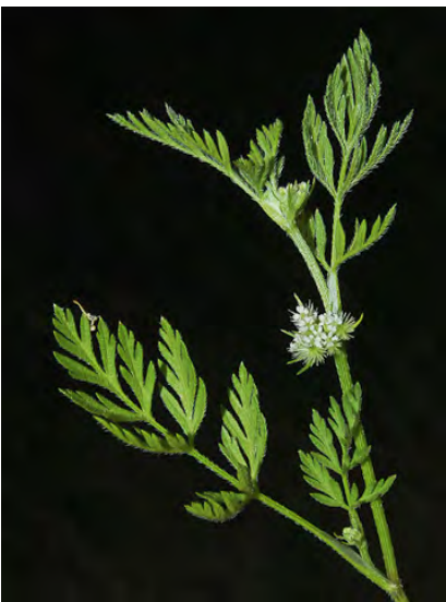
SHORT SOCK-DESTROYER (Torilis nodosa) Naturalized Annual - Carrot Family - (Apr—Jun) - Disturbed places - Plant spreading, 4-20" tall. Flowers white to red, clusters dense, < leaf. Fruit ~ 0.1" long, uncurved bristles on outer surface, bumps inside.