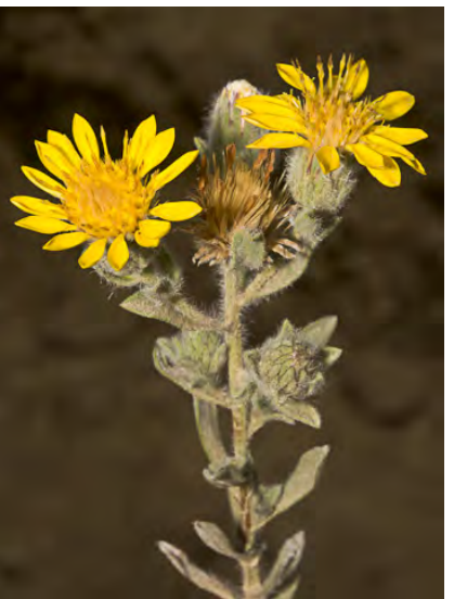
BRISTLY GOLDENASTER (Heterotheca sessiliflora subsp. echioides) Native Perennial - Sunflower Family - (Jul-Oct) - Grassland, scrub, woodland, open forest, disturbed sites - Plant 2-7 dm, bristly. Leaves flat, to 5 cm long, upper reduced. Head bracts not leafy.