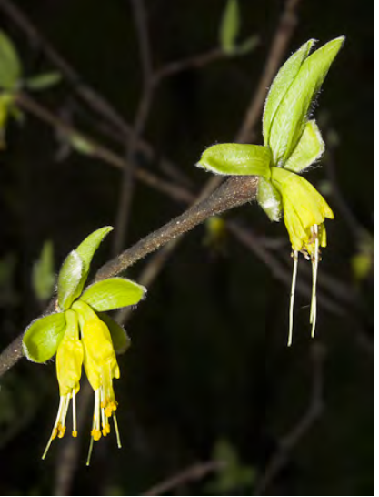
WESTERN LEATHERWOOD (Dirca occidentalis) Native Perennial - Daphne Family - (Nov-Mar) - Gen n facing slopes, mixed-evergreen forest to chaparral, gen fog belt - Shrub 3-10'. Flowers yellow, 1-4 per group, open before/with leaves. CNPS: Fairly ENDANGERED.