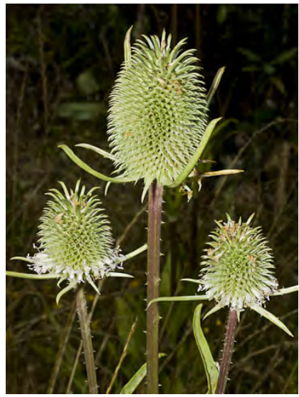
FULLER'S TEASEL (Dipsacus sativus) Naturalized Biennial - Teasel Family - (May–Jul) - Disturbed areas, fields, vacant lots, pastures - Plant gen < 6' tall. Leaf pairs fused around stem. Flower cluster lavender, 5-10 cm long, bracts spreading. INVASIVE weed.