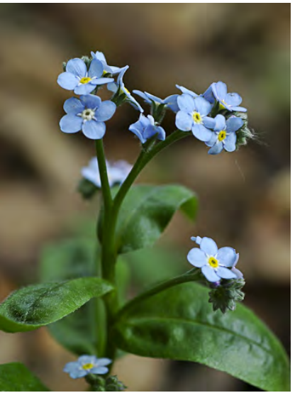
BROADLEAVED FORGET-ME-NOT (Myosotis latifolia) Naturalized Perennial - Borage Family - (Feb-Jul) - Moist, disturbed, shady places - Stem < 28" long, base woody. Leaves to 0.8" wide. Flowers light blue, 0.2-0.4" wide. INVASIVE weed