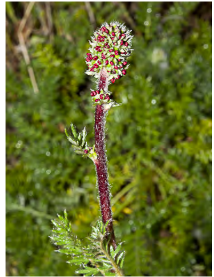
CALIFORNIA ACAENA (Acaena pinnatifida var. californica) Native Perennial - Rose Family - (Mar–May) - Coastal grassland, open, rocky slopes - Stem 4-24" long. Flowers with no petals and purple-black stamens. Leaves finely divided.