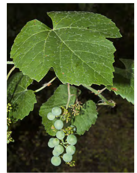
CALIFORNIA WILD GRAPE (Vitis californica) Native Perennial - Grape Family - (May-Jun) - Streamsides, springs, canyons - Woody vine to 33'+long. Leaves deciduous, heart-shaped to kidney-shaped. Fruit purple when mature, gen > 0.3" wide.