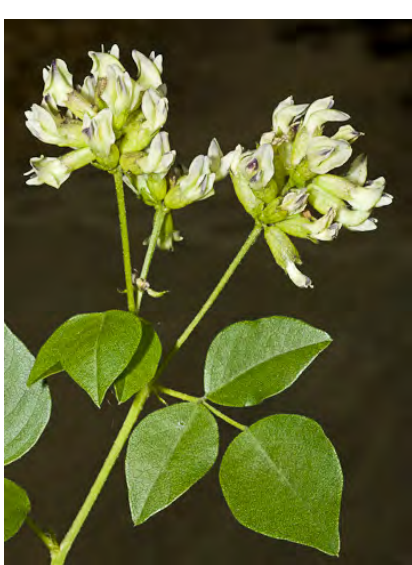
CALIFORNIA TEA (Rupertia physodes) Native Perennial - Pea Family - (May—Sep) - Woodland - Stem ~1.6'. Leaflets 3, triangular to lance-shaped, 1.4-2.8" long, sticky. Flower bracts not hairy, lobes = Flowers white or yellow, banner 0.4-0.55" long.