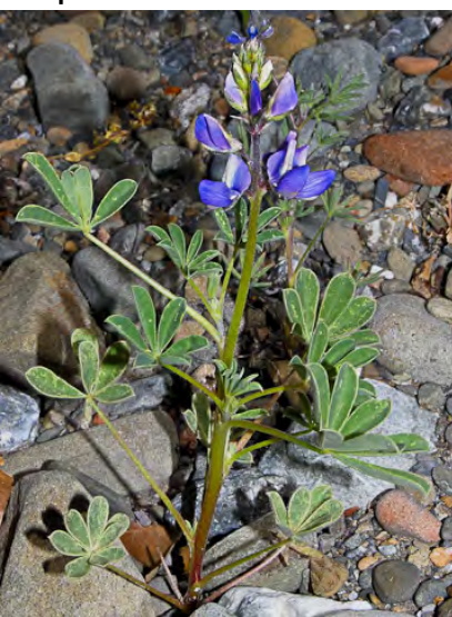
ARROYO LUPINE (Lupinus succulentus) Native Annual - Pea Family - (Feb–May) - Abundant. Open or disturbed areas, often seeded on roadbanks - Plant 8-40" tall, fleshy, sparsely hairy. Flowers 0.5-0.7" long, whorled, gen blue-purple, petal claws short-hairy.