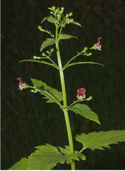
CALIFORNIA FIGWORT (Scrophularia californica) Native Perennial - Snapdragon Family - (Mar—Jul) - Common; damp places, chaparral, roadsides - Stem 2.6-4' tall, square x-section. Leaves opposite, to 7" long, triangular, toothed. Flowers 0.3-0.5" long, upper lips red to maroon, lower paler or yellowish.