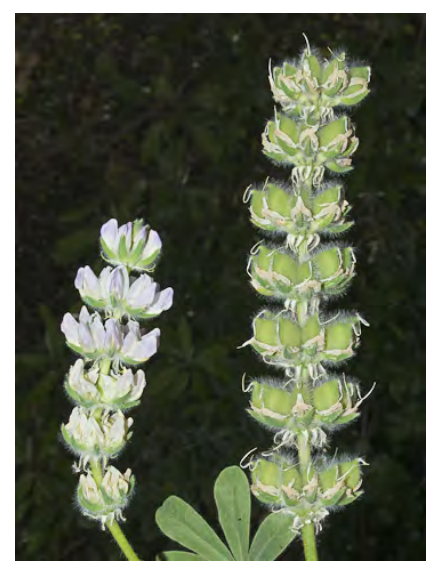
CHICK LUPINE (Lupinus microcarpus var. microcarpus) Native Annual - Pea Family - (Mar–Jun) - Abundant. Open or disturbed areas, occ seeded on roadbanks - Plant 4-32", hairy. Leaves smooth above. Flowers gen pink to purple. Flower bracts shaggy.