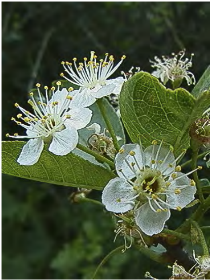
BITTER CHERRY (Prunus emarginata) Native Perennial - Rose Family - (Apr–Jun) - Rocky slopes, canyons, chaparral, mixed-evergreen, conifer forest - Shrub/tree < 50'. Leaf: stem 0.1-0.5", blade 0.6-2.4" long. Petals white, 0.12-0.3" long. Fruit red to purple.