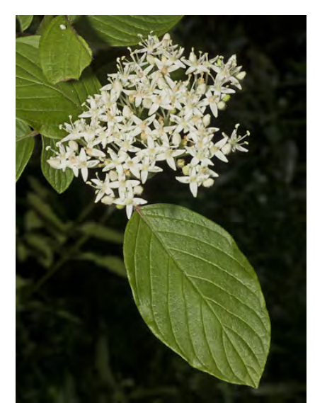
WESTERN AMERICAN DOGWOOD (Cornus sericea subsp. occidentalis) Native Perennial - Dogwood Family - (May-Jul) - Generally moist places - Shrub 5-13' tall. Leaf blades gen 2-4" long, rough-hairy below, veins in 4-7 pairs. Petals white, 0.1-0.2" long.