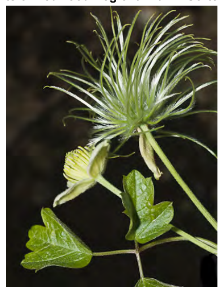
CHAPARRAL CLEMATIS (Clematis lasiantha) Native Perennial - Buttercup Family - (Jan–Jun) - Hillsides, chaparral, open woodland - Woody vine. Leaflets 3-5, +-3-lobed. Flowers gen 1, in spring; sepals white to cream, 0.4-0.8" long.