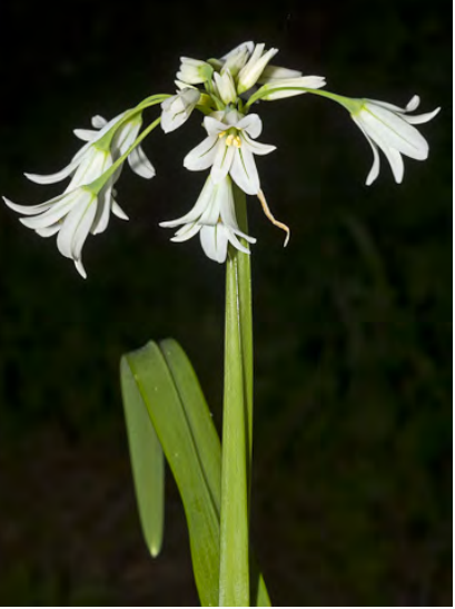
THREE CORNERED LEEK (Allium triquetrum) Naturalized Perennial - Onion or Garlic Family - (Mar-Apr) - Locally common. Shady ± disturbed places - Stem 4-16", sharply 3-angled. Flowers white, 3-15, 0.4-0.7" long, nodding. Escaped ornamentals.