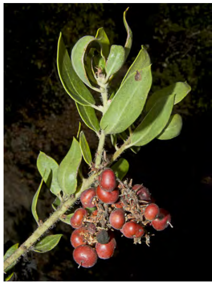
EASTWOOD MANZANITA (Arctostaphylos glandulosa subsp. glandulosa) Native Perennial - Heath Family - (Jan-Apr) - Chaparral, conifer forest - Shrub 3-13' tall. Twigs w/gland-tipped hairs, leafy bracts, 0.1-0.2" leaf stalk, burl. Upper leaf surface not shiny.