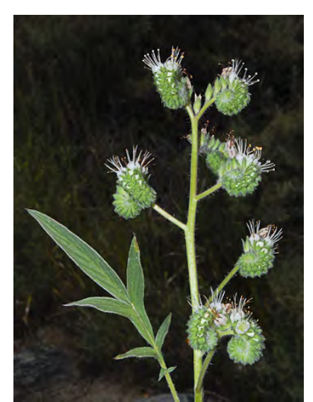
ROCK PHACELIA (Phacelia imbricata subsp. imbricata) Native Perennial - Borage Family - (Apr-Jul) - Slopes, roadsides, flats, canyons, chaparral, woodland - Plant 8-47", tufted. Leaf segments 7-15. Flowers 0.2-0.3", white. Flower bracts often sticky.