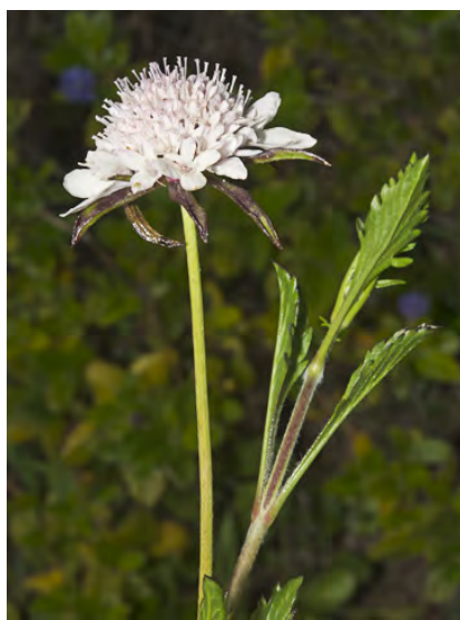
PINCUSHION FLOWER (Scabiosa atropurpurea) Naturalized Annual - Teasel Family - (Mar-Nov) - Disturbed areas - Stem < 2' tall. Leaves opposite, pinnately dissected. Flower clusters < 1.2" wide, flowers gen blue, pink, purple or white. Ornamental.