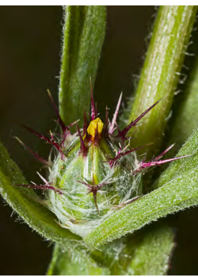
TOCALOTE (Centaurea melitensis) Naturalized Annual - Sunflower Family - (Apr-Jul) - Disturbed fields, open woodland - Plant 4-39", gray-hairy, resinous. Leaves 0.8-6" long. Flowers yellow, 0.4-0.8" long, bracts tipped w/purple spines. NOXIOUS weed.