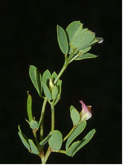
SMALL-FLOWER LOTUS (Acmispon parviflorus) Native Annual - Pea Family - (Mar–May) - Abundant. Coastal bluffs to oak/pine or fir woodland, open or disturbed areas - Flowers pinkish, solitary, 0.2" long, on stalk with bracts. Not hairy.