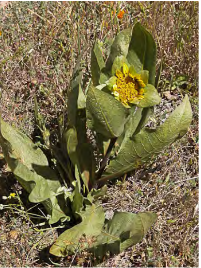
SMOOTH MULE'S EARS (Wyethia glabra) Native Perennial - Sunflower Family - (Mar–Jun) - Gen shady sites - Plant 4-16" tall, shiny green, no woolly hairs. Leaf basal blades 10-18" long, lance-shaped to oval, shiny. Ray flowers 1-2" long.