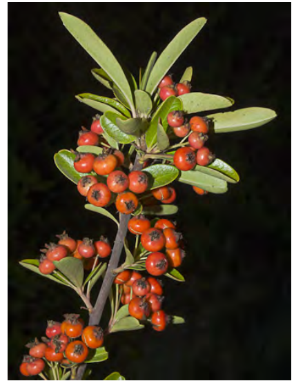
WOOLLY FIRETHORN (Pyracantha angustifolia) Naturalized Perennial - Rose Family - (Feb-Jun) - Disturbed areas, fencerows, abandoned fields, roadsides - Plant < 13', gray-hairy. Leaves narrow, entire. Calyx and below leaves often woolly. INVASIVE.