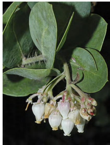
PALLID MANZANITA (Arctostaphylos pallida) Native Perennial - Heath Family - (Jan-Mar) -Siliceous shales, slopes, ridges, chaparral -Leaves clasping, smooth. Flower stalk and fruit w/sticky hairs. Fed: THREATENED, Calif: ENDANGERED.