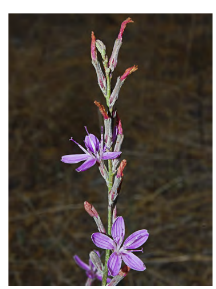
TWIGGY WREATH PLANT (Stephanomeria virgata subsp. pleurocarpa) Native Annual - Sunflower Family - (Jun-Nov) - Chaparral openings, grassland - Plant 20-79". Stem leaves oblong, bract-like. Flower bracts not spreading. Flowers 5-6, white to dark pink.