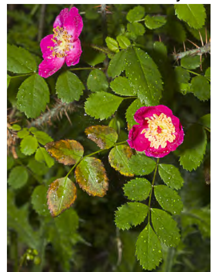
WOOD ROSE (Rosa gymnocarpa var. gymnocarpa) Native Perennial - Rose Family gyninocalpa) reduce Peterinial - Rose Family - ((Feb)Apr–Jul) - Common. Gen in shade of forest, scrub - Shrub wistraight thorns. Flowers gen solitary, stalks sticky, fruit smooth, sepals deciduous.