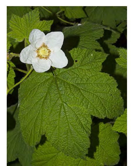
THIMBLEBERRY (Rubus parviflorus) Native Perennial - Rose Family - (Mar–Aug) - Common; moist semi-shaded areas, esp edges of woodland - Shrub 0.5-2 m tall, not prickly. Petals 0.5-0.9" long, white. Leaves simple, 3-5 lobed. Raspberry-type fruit.