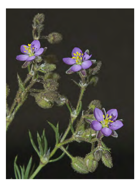
RED SAND-SPURRY (Spergularia rubra) Naturalized Annual-Perennial - Pink Family -(Spring-fall) - Forest, meadows, mud flats, disturbed - Plant 1.6-10". Leaf non-fleshy, whorls w/large white bracts. Petals pink. Stamens 6-10. Sepals < 0.16".