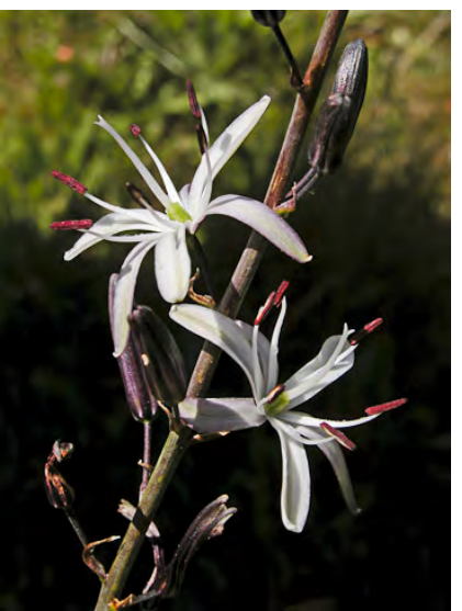
WAVYLEAF SOAP PLANT (Chlorogalum pomeridianum var. pomeridianum) Native Perennial - Century Plant Family - (May–Aug) - Common. Open grassland, chaparral, woodland - Plant 1-8' tall, flowers at night. Bulb juices lather in water.