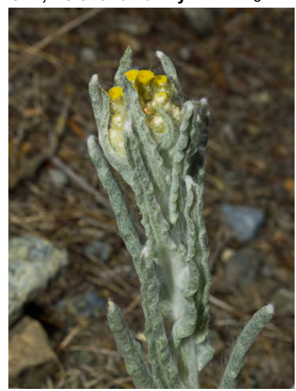
COTTON-BATTING PLANT (Pseudognaphalium stramineum) Native Annual - Sunflower Family - (Mar–Aug) - Many habitats, dunes, chaparral slopes, roadsides - Heads 0.16-0.2" long, female flowers > 0.08" long, pappus bristles free.