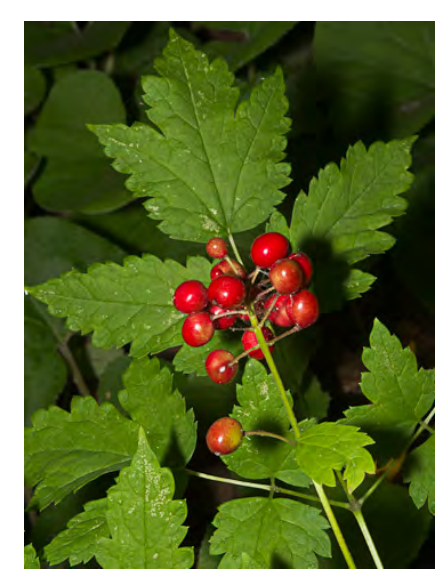
BANEBERRY (Actaea rubra) Native Perennial -Buttercup Family - (May–Sep) - Deep soils, moist, open to shaded sites, mixed-evergreen or conifer forests - Plant 8-40" tall. Flowers white. Fruits shiny red or white, 0.2-0.4" long. All plant parts TOXIC to humans.