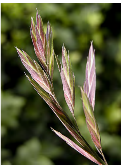
RESCUE GRASS (Bromus catharticus var. catharticus) Naturalized Annual-Perennial - Grass Family - (Apr-Nov) - Open, disturbed places - Plant 8-48" tall. Flower cluster 3-12" long, ~ open. Spikelet flattened, 0.6-1.2" long. Lemma 0.4-0.7" long, awn < 0.2" long.