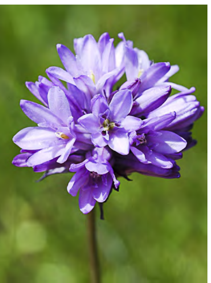
FORK-TOOTHED OOKOW (Dichelostemma congestum) Native Perennial - Brodiaea Family - (Apr-Jun) - Open woodland, grassland - Plant 12-35" tall. Flowers blue-purple, narrowed above ovary. Stamens 3. Late spring bloomer.