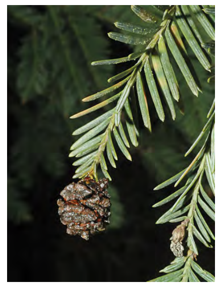
REDWOOD (Sequoia sempervirens) Native Perennial - Cypress Family - - - Redwood forest - Tree to 380' tall, evergreen. Leaves alternate: on rapidly growing stems awl-like, < 0.3" long; others flat, 0.2-1" long. Seed cone 0.5-1.4" diam, woody.