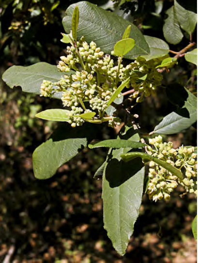
CALIFORNIA COFFEE BERRY (Frangula californica subsp. californica) Native Perennial -Buckthorn Family - (May–Jul) - Coastal-sage scrub, chaparral, forest, woodland - Shrub < 16' tall. Flowers greenish. Leaves smooth beneath.