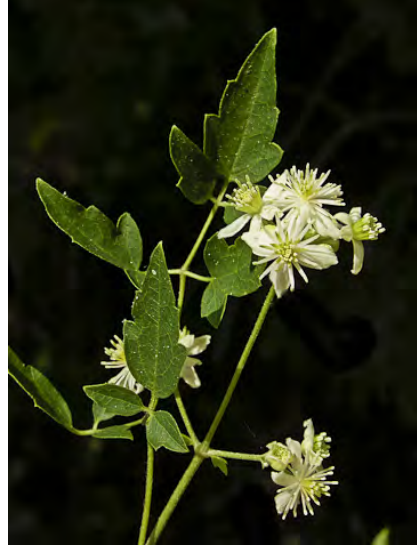
WESTERN VIRGIN'S BOWER (Clematis ligusticifolia) Native Perennial - Buttercup Family - (Jun-Sep) - Along streams, wet places - Leaflets 5-15, irregularly lobed. Flowers many, in fall. Sepals white to cream, 0.2-0.24" long.