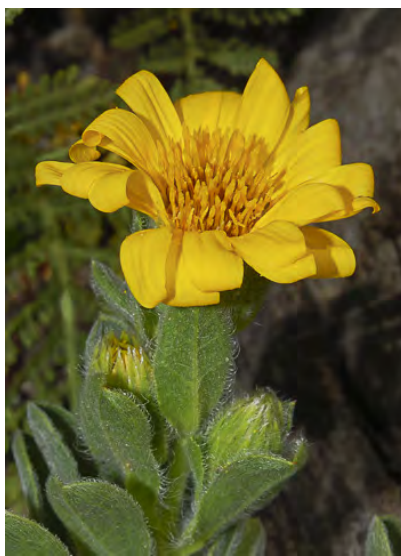
BOLANDER GOLDENASTER (Heterotheca sessiliflora subsp. bolanderi) Native Perennial - Sunflower Family - (Jun-Sep) - Dunes, headlands, grassy coastal slopes - Plant gen 8-28", unbranched. Leaves wide, soft-hairy. Heads clustered, rays 0.3-0.6".