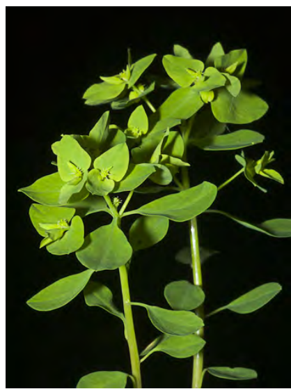
PETTY SPURGE (Euphorbia peplus) Naturalized Annual - Spurge Family - (Feb-Aug) - Common. Disturbed areas - Stem 4-18" cm tall, smooth. Leaves 0.4-1.4" long, entire. Gland crescent-shaped. Seeds dotted. Fruit 2-keeled on angles.