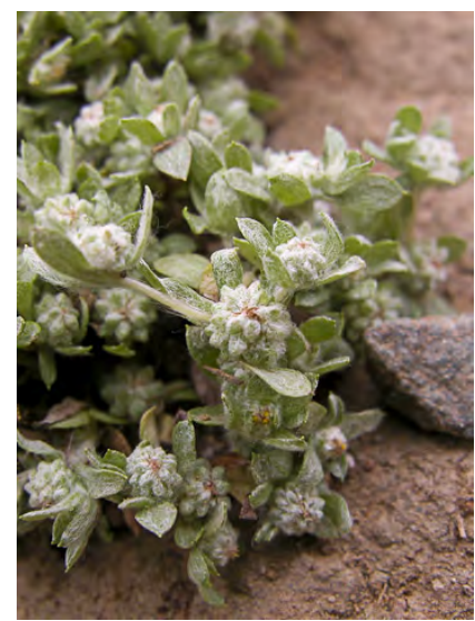
SLENDER WOOLLY-MARBLES (Psilocarphus tenellus) Native Annual - Sunflower Family - (Mar–Jul) - Common. Dry, seasonally moist slopes, flats, burns, trails, rarely vernal pools - Plant hairy. Leaves spoon-shaped. Disk flowers 4-lobed.