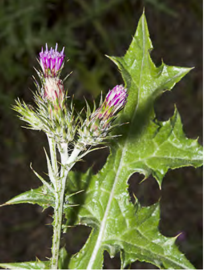
ITALIAN THISTLE (Carduus pycnocephalus subsp. pycnocephalus) Naturalized Annual -Sunflower Family - (Mar–Jul) - Roadsides, pastures, disturbed areas - Stems 8-79", narrow spiny-wings. Lower leaves 4-10 lobed, heads 2-5, flower bracts woolly. NOXIOUS.