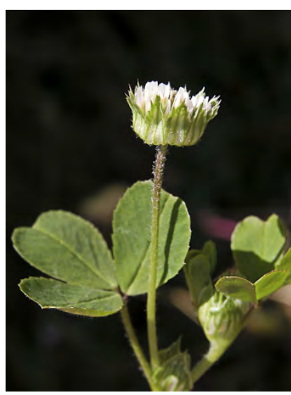
THIMBLE CLOVER (Trifolium microdon) Native Annual - Pea Family - (Mar–Jun) - Common locally. Open, moist or dry, gen disturbed areas - Short-hairy. Head bract w/flat base. Flowers white to pink. Calyx lobes < 1/2 flower tube length, < flowers.