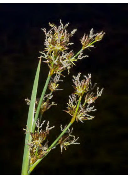
IRIS-LEAVED RUSH (Juncus xiphioides) Native Perennial - Rush Family - (Jul-Oct) - Wet places - Plant 16-32" tall. Leaf blades 0.2-0.5" wide, flat, Iris-like. Heads many, few-flowered. Anthers 6, < filaments, flowers self-pollinating.