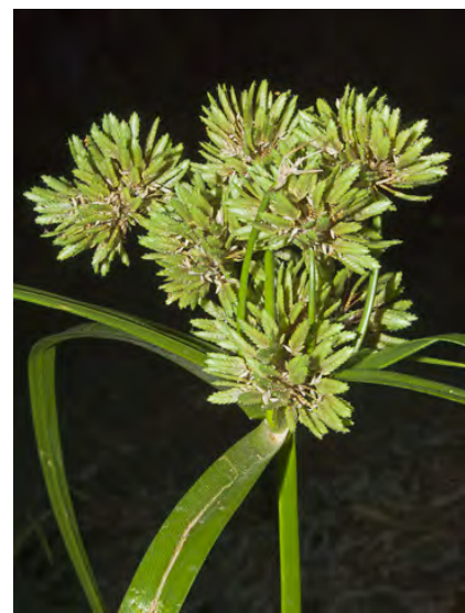
TALL NUTSEDGE (Cyperus eragrostis) Native Perennial - Sedge Family - (May–Nov) - Vernal pools, streambanks - Leaves basal. Flower cluster bracts 4-8. Spikelets 0.2-0.8" long, oblong, in heads to 1.6" wide. Seeds short-stalked.