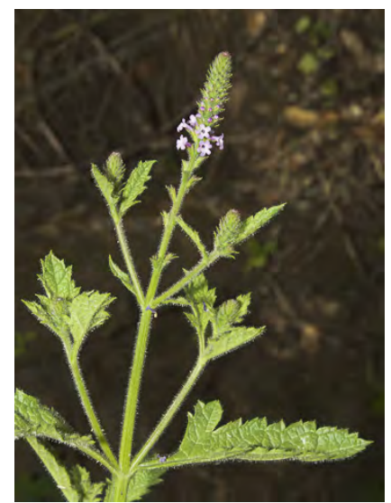
ROBUST VERVAIN (Verbena lasiostachys var. scabrida) Native Perennial - Vervain Family - (May-Sep) - Open, dry to wet places - Plant 14-32" tall. Leaves green, narrow, 3-lobed, stiff-haired above. Flowers blue to purple on long stalk.