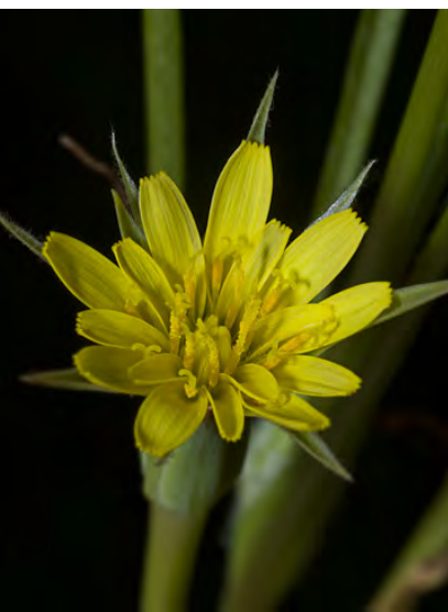
SILVERPUFFS (Uropappus lindleyi) Native Annual - Sunflower Family - (Mar–May) - Common. Open grassland, woodland, chaparral, deserts, gen in loose soils - Heads pale yellow, never nod. Outer head bracts always > 1/4 inner length. Pappus scale notched.