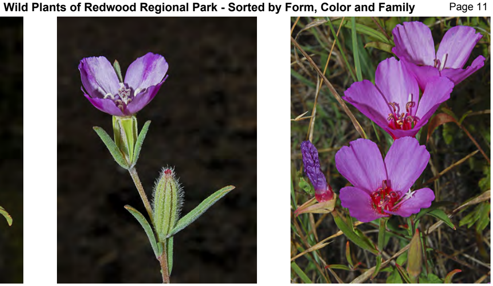
RUBY CHALICE CLARKIA (Clarkia rubicunda) Native Annual - Evening Primrose Family -(May-Aug) - Openings in woodland, forest, chaparral near coast - Stem < 5' long. Buds erect. Petals 0.4-1.2", rose w/red base. Sepals united. Stigma > anthers.