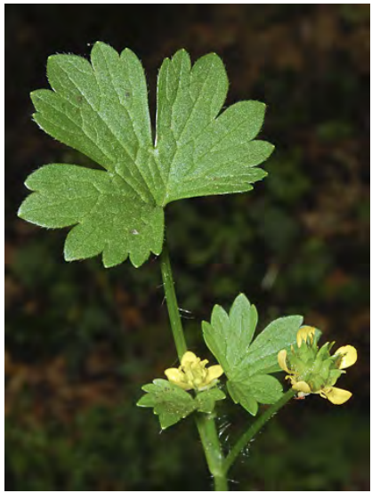
PRICKLESEED BUTTERCUP (Ranunculus muricatus) Naturalized Annual - Buttercup Family - (Apr–Jun) - Stream-banks, drainages, low meadows - Plant 6-20". Leaves gen 3-lobed. Petals yellow, 5, 0.16-0.3" long. Fruits 0.2" long with curved bristles.