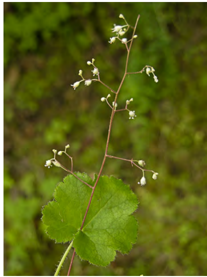
SMALL-FLOWER ALUMROOT (Heuchera micrantha) Native Perennial - Saxifrage Family - (Apr-Jul) - Moist, rocky banks and cliffs - Plant 4-40" tall. Leaf blade 0.8-4.7" long, 5-7 lobed, generally hairy. Petals white, ~ 0.1" long.