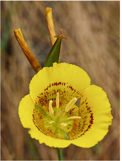
YELLOW MARIPOSA LILY (Calochortus luteus) Native Perennial - Lily Family - (Apr–Jun) - Heavy soils in grassland, woodland, mixed-evergreen forest - Stem 8-20" long. Flowers bell-shaped, deep yellow, 0.8-1.6" long, gen w/inner central red-brown spot.