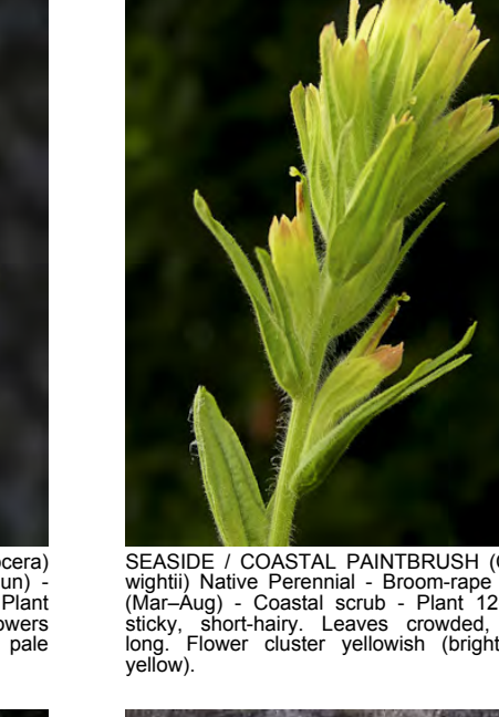
SEASIDE / COASTAL PAINTBRUSH (Castilleja wightii) Native Perennial - Broom-rape Family - (Mar-Aug) - Coastal scrub - Plant 12-32" tall, sticky, short-hairy. Leaves crowded, 0.8-2.4" long, Flower cluster yellowish (bright red to