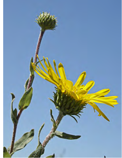
MARSH GUMPLANT (Grindelia stricta var. angustifolia) Native Perennial - Sunflower Family - (May-Dec) - Tidal wetlands - Plant 3.3-6.6' tall, woody base, evergreen. Leaves 0.4-6" long, fleshy, not resinous. Flower rays yellow, 16-56, 0.5-0.7" long.