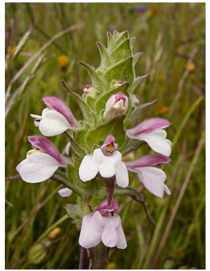
MEDITERRANEAN LINSEED (Bellardia trixago) Naturalized Annual - Broom-rape Family (Apr-Jun) - Disturbed grassland. - Plant sticky-hairy. Stem 6-32" tall. Leaves lance-shaped, toothed. Flowers 0.8-1" long, 2-lipped: upper lip pink, lower lip white. INVASIVE.