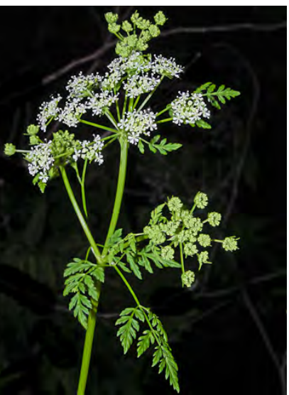
POISON HEMLOCK (Conium maculatum) Naturalized Biennial - Carrot Family - (Apr-Jul) -Common. Moist, esp disturbed places - Plants 2-10' tall. Stems purple-spotted. Leaves fern-like, gen 2x divided. Flowers white. TOXIC. INVASIVE weed