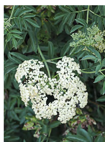
BLUE ELDERBERRY (Sambucus nigra subsp. caerulea) Native Perennial - Muskroot Family - (Mar–Sep) - Common. Streambanks, open places in forest - Shrub 7-26' tall. Flower cluster flat-topped, 1.6-13" diam, petals spreading. Fruits waxy blue-black.