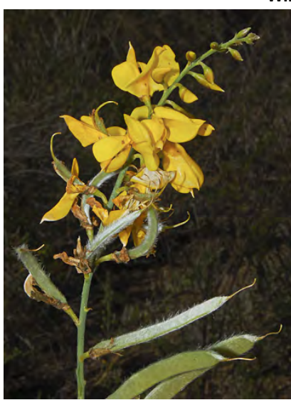
SPANISH BROOM (Spartium junceum) Naturalized Perennial - Pea Family - (Apr—Jun) - Disturbed areas - Shrub, < 10' tall, gen leafless. Leaves simple, very sparse. Flowers yellow, several at stem tips, 0.8-1.2" long. Fruits 2-4" long. INVASIVE weed.