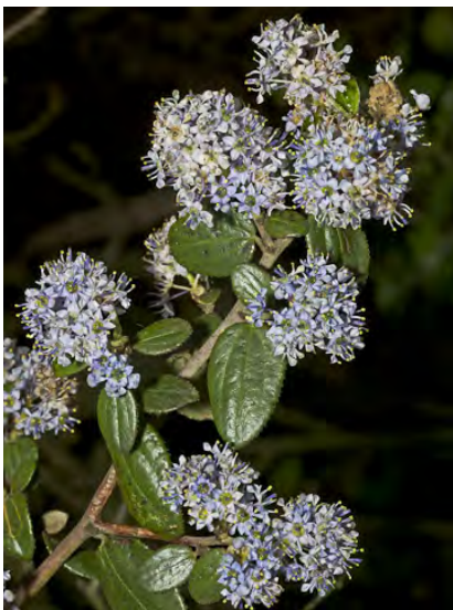
JIM BRUSH (Ceanothus oliganthus var. sorediatus) Native Perennial - Buckthorn Family - (Jan–May) - Slopes, ridges, chaparral, conifer forest - Shrub/tree < 11.5' tall. Twigs red-brown. Leaves alternate, 3 main veins. Flowers blue, purple-blue or whitish.