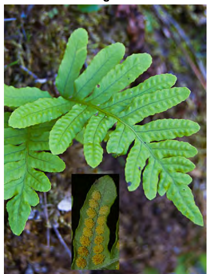
POLYPODY FERN (Polypodium calirhiza) Native Perennial - Polypody Family - - - On plants, rocky cliffs or outcrops, roadcuts, often granitic or volcanic, rarely dunes - Leaf blades 4-8" long, often widest above base, deeply lobed.