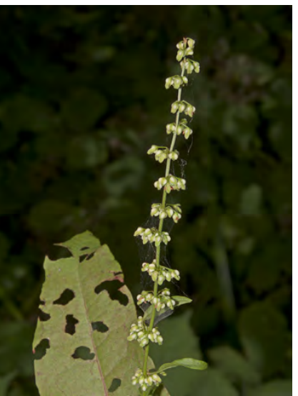
GREEN DOCK (Rumex conglomeratus) Naturalized Perennial - Buckwheat Family (May-Aug) - Common. Moist places - Stem 12-32" tall, unbranched below. Flower cluster open. Fruit valves ~0.1" long, scarcely winged around the 3 tubercles, smooth edged.