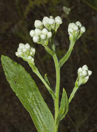
CALIFORNIA EVERLASTING (Pseudognaphalium californicum) Native Biennial - Sunflower Family - (Apr-Jul) - Sandy canyons, dry hills, coastal chaparral - Stem 8-51" tall. Leaves green + glandular on both sides. Heads white, spheric, 0.2-0.24" long.