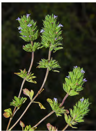
THYMELEAF BEARDSTYLE (Pogogyne serpylloides) Native Annual - Mint Family - (Mar–Jun) - Grassy, brushy areas - Plant inconspicuous. Stem 1-8" long, low-growing. Flowers 0.1-0.2" long, lavender, in dense clusters.