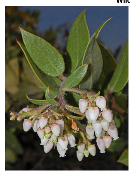
BRITTLE-LEAF MANZANITA (Arctostaphylos crustacea subsp. crustacea) Native Perennial - Heath Family - (Feb-Apr) - Chaparral, conifer forest - Twigs bristly, leaf stalk 0.1-0.2", upper leaf surface shiny.