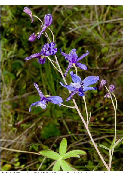
COAST LARKSPUR (Delphinium decorum subsp. decorum) Native Perennial - Buttercup Family - (Mar–May) - Open coastal grassland, chaparral - Stems 3-14" tall. Leaves short-hairy under, with few-toothed lobes. Flowers few, dark blue-purple.