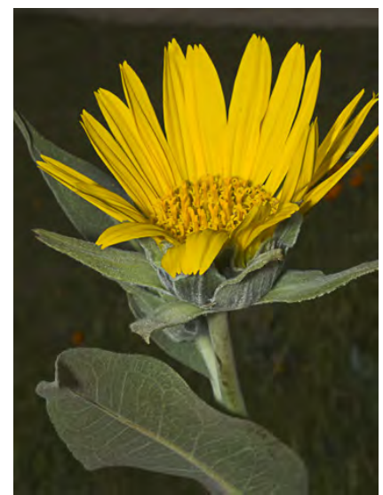
GRAY MULE'S EARS (Wyethia helenioides) Native Perennial - Sunflower Family (Mar–May(Aug)) - Open grassland, woodland, scrub - Plant 8-28" tall, densely woolly, often becoming smooth. Some woolly hairs remain on leaf stalks and floral bracts.