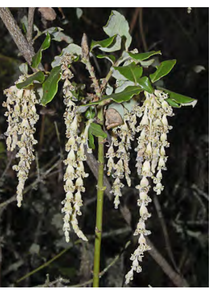
COAST SILK TASSEL (Garrya elliptica) Native Perennial - Silk Tassel Family - (Jan-Mar) -Seacliffs, sand dunes, chaparral, foothill-pine woodland - Shrub or small tree, < 26' tall. Leaves wavy-margined, underside hairs felt-like, interwoven. Fruit hairy.