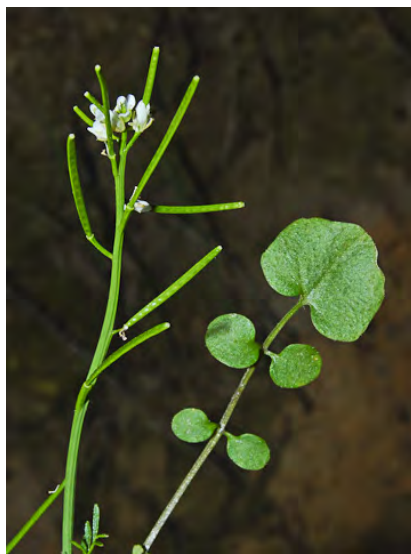
WESTERN BITTER-CRESS (Cardamine oligosperma) Native Annual - Mustard Family -(Cardamine oligosperinia i Native Arillida - I Mustatu rallinji - (Mar–Jul) - Wet meadows, shady banks, damp areas - Plants < 16". Leaves divided into 5-9 leaflets. Flowers white, 0.1-0.2" long. Fruit < 0.1"