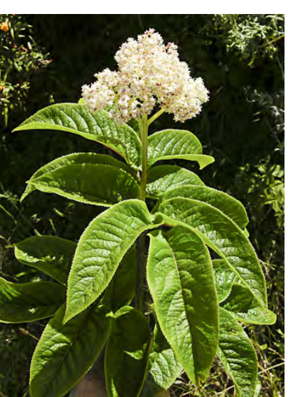
RED ELDERBERRY (Sambucus racemosa var. racemosa) Native Perennial - Muskroot Family - (May-Jul) - Moist places - Shrub/tree 3-20' tall. Leaflets 5-7, 1.6-6.3" long. Flower cluster dome-shaped, gen 6-12 cm diam, petals often reflexed. Fruits red.