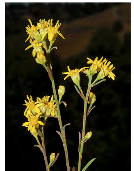
CALIFORNIA MATCHWEED (Gutierrezia californica) Native Perennial - Sunflower Family - (Jul-Nov) - Grassland, arid woodland and shrubland, serpentine - Stem 8-40" long, woody base. Leaf narrow, flat, <= 2" long. Ray flowers 4-13, 0.1-0.3" long.