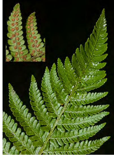
COASTAL WOOD FERN (Dryopteris arguta) Native Perennial - Wood Fern Family - - - Locally common. Open, wooded slopes, caves - Leaf 12-24" long,5-12" wide, divided 1-2 times. Segments generally with spine-tipped teeth.