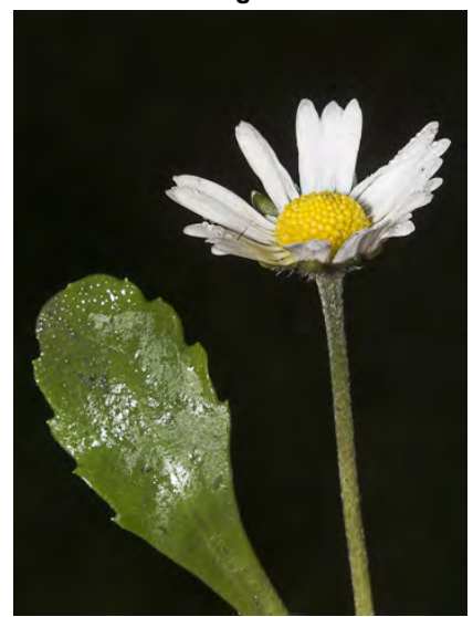
ENGLISH DAISY (Bellis perennis) Naturalized Perennial - Sunflower Family - (Dec-Sep) - Damp, grassy areas - Herbaceous lawn weed. Leaves 0.8-4" long, spoon-shaped. Ray flowers white, 0.3-0.4" long, narrow. Disk flowers yellow, ~ 0.1" long.