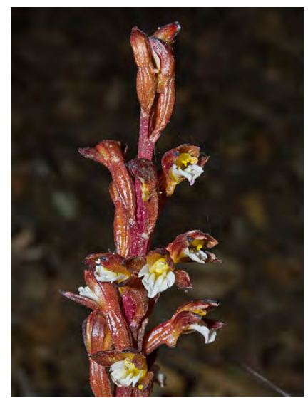
SPOTTED CORALROOT (Corallorhiza maculata var. maculata) Native Perennial - Orchid Family - (May-Aug) - Shaded mixed-evergreen or conifer forest, in decomposing If litter - Flower lip white, not widest at tip, w/2 rounded side lobes.