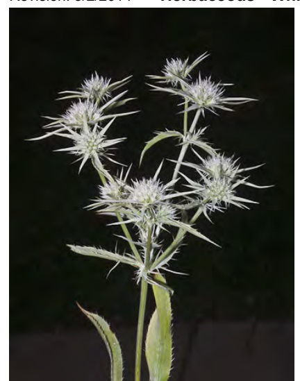
BUTTON CELERY (Eryngium jepsonii) Native Perennial - Carrot Family - (Apr-Aug) - Moist clay soil, vernal pools, lake shores, drying lakes, wet depressions - Leaf blade toothed-irreg lobed. Sepals 0.1", smooth-edged. Flowers white to blue or purple.