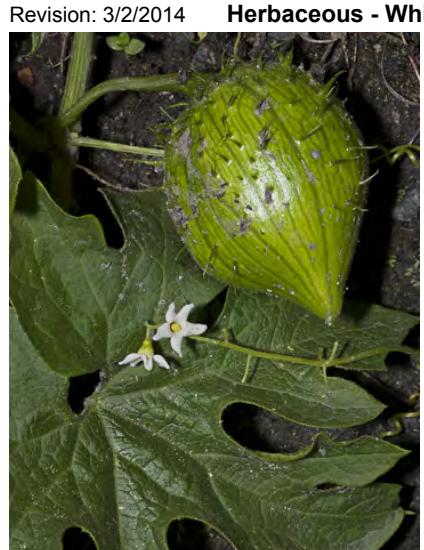
COAST MAN-ROOT (Marah oregana) Native Perennial - Gourd Family - (Mar-May) - Shrubby or open areas, forest edges - Vine 3-20' long. Leaves deeply lobed. Flowers white, deep cup-shaped, > 0.3" wide. Fruit smooth at end.