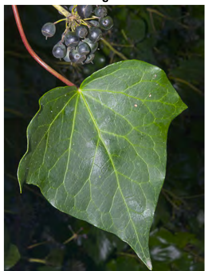
CANARY ISLANDS IVY (Hedera canariensis) Naturalized Perennial - Ginseng Family - (Aug-Nov) - Woodland, chaparral, disturbed areas - Woody vine. Leaves gen 3-pointed, > English Ivy. Flowers white to green. Fruit black, ~0.2" wide. INVASIVE weed.