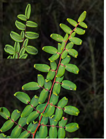
COFFEE FERN (Pellaea andromedifolia) Native Perennial - Brake Fern Family - - - Generally rocky or dry areas - Fronds 6-30" long, stem light brown. Leaf segments blunt, 0.24-0.6" long, 0.12-0.4" wide.