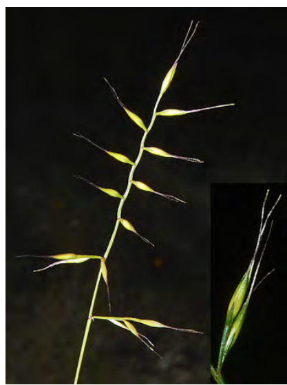
HAIRY FESCUE (Festuca microstachys) Native Annual - Grass Family - (Apr-Jun) - Disturbed, open, gen sandy soils - Stem 6-29". Spikelet 0.2-0.4" long, awn 0.1-0.5" long. Glumes & lemma smooth or hairy.