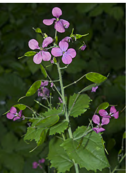
MONEY PLANT (Lunaria annua) Naturalized Annual - Mustard Family - (Apr—Jun) - Disturbed areas - Stem 16-39" tall. Leaves heart-shaped. Petals 0.7-1" long, purple to lavender (white). Fruits oblong-round, 1.2-2" long. Escaped cultivar.