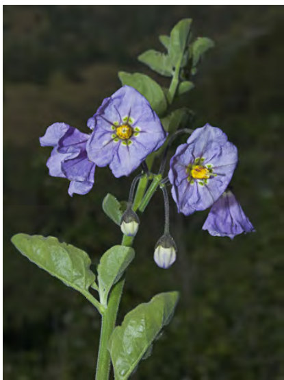
BLUE WITCH (Solanum umbelliferum) Native Perennial - Nightshade Family - (All year) -Shrubland, mixed-evergreen forest, woodland Plant gen < 39", upper stem hairs branched, dense. Flowers 0.6-1" wide, purple, with green spots at the base.