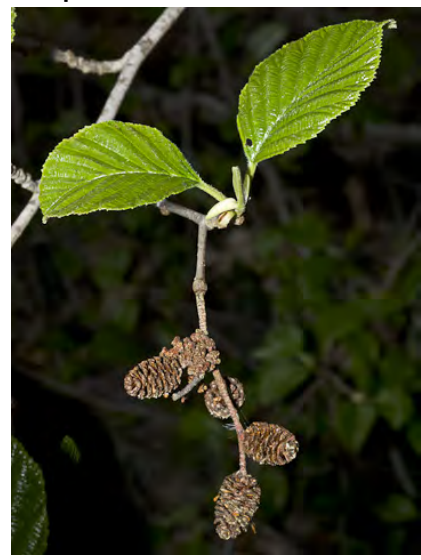
WHITE ALDER (Alnus rhombifolia) Native Perennial - Birch Family - (Apr-Jun) - Along permanent streams - Tree. Leaves flat, not rusty underneath, margins serrate, not rolled under. Female flowers cone-like. Wood used for furniture and for smoking meats.