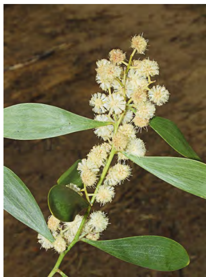
BLACKWOOD ACACIA (Acacia melanoxylon) Naturalized Perennial - Pea Family - (Feb-Mar) -Uncommon. Disturbed areas - Tree < 100' tall. Leaves simple, 0.2-1.2" wide, 3-5 main veins. Flowers pale yellow, 2-8 per head. INVASIVE weed.