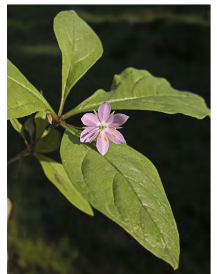
STARFLOWER (Trientalis latifolia) Native Perennial - Myrsine Family - (Apr–Jul) - Shaded places, esp woodland - Stem 2-12". Leaves 1-3.5" long, 0.4-2" wide, egg-shaped; stem leaves in 1 whorl near stem tip. Flower gen pink to rose, 0.3-0.6" wide.