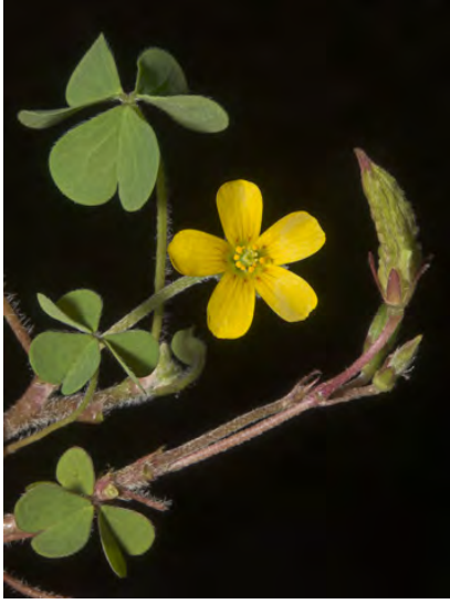
CREEPING WOOD SORREL (Oxalis corniculata) Naturalized Perennial - Oxalis Family - (Most of Year) - Disturbed areas - Plant < 20" tall, rooting at nodes. Leaflets < 0.8" long, in 3s. Petals yellow, < 8 mm long. Fruit 0.24-1" long. Possibly TOXIC to sheep.