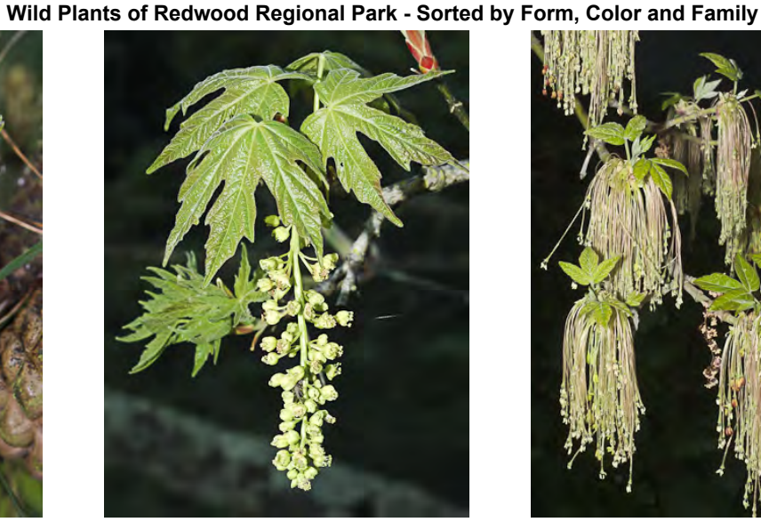
BIG-LEAF MAPLE (Acer macrophyllum) Native Perennial - Soapberry Family - (Mar–Jun) -Common. Streambanks, canyons - Tree < 100'. Leaves 5-lobed, 3-6" long, 4-10" wide. Group of 20-90 hanging flowers appear after leaves. Winged seeds.