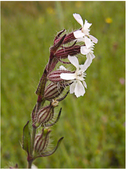
SMALL-FLOWER CATCHFLY (Silene gallica) Naturalized Annual - Pink Family - (Spring-early summer) - Fields, disturbed areas - Plant 4-16". Leaves < 1.4" long. Flower cluster short-hairy, bracts sticky-hairy, petal blade 0.2-0.5" long, smooth to notched, white to pink.