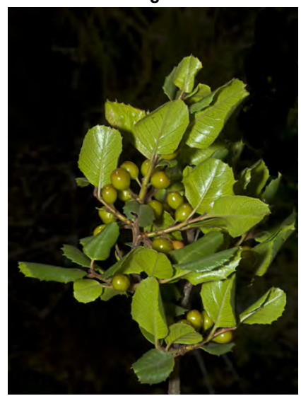
HOLLYLEAF REDBERRY (Rhamnus ilicifolia) Native Perennial - Buckthorn Family - (Mar–Jun) - Chaparral, montane forest - Shrub < 13' tall, evergreen w/stiff branches. Leaf blades 0.8-1.6" long, toothed. Fruits 0.2-0.3" wide, red.