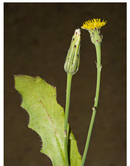
SMOOTH CAT'S-EAR (Hypochaeris glabra) Naturalized Annual - Sunflower Family - (Mar–Jun) - Common. Disturbed areas, grassland, open woodland - Plant 4-24" tall, smooth. Rays 0.2-0.3" long, barely > head bracts. Only inner fruit beaked. INVASIVE.