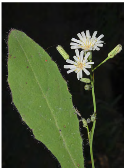
WHITE HAWKWEED (Hieracium albiflorum) Native Perennial - Sunflower Family - (May–Sep) - Forest - Stem 8-47" tall, densely long-hairy. Leaves mostly at base, 3-6" long, not lobed. Flower cluster widely branched, heads few-haired. Rays white. Milky sap.