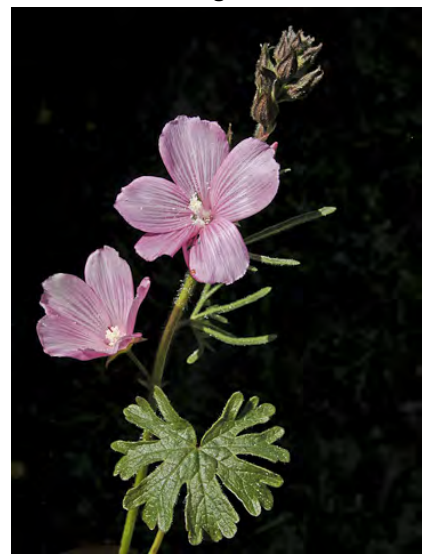
GERANIUM-LEAVED CHECKERBLOOM (Sidalcea malviflora subsp. laciniata) Native Perennial - Mallow Family - (Mar–Jun) - Grassland, open woodland - Plant 6-39" tall. Middle leaves linear-lobed. Petals 0.4-0.8" long, pink-lavender, gen white veined.