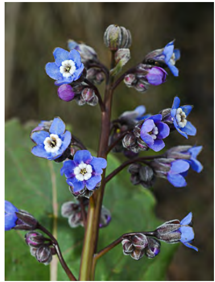
GRAND HOUND'S TONGUE (Cynoglossum grande) Native Perennial - Borage Family - (Feb-May) - Chaparral, woodland - Stem 1-3'. Leaf stalk 3-6". Leaf blade 3-6" cm long, broadly oval. Flowers bright blue w/inner white teeth.