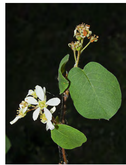
SIERRA PLUM (Prunus subcordata) Native Perennial - Rose Family - (Mar–May) - Mixed-evergreen or conifer forest - Shrub < 10'. Leaf: stem 0.16-0.6", blade 1-2", elliptic to wide egg-shaped, base round heart-shaped, tip round. Petals 0.2-0.4" long, white.