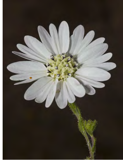
HAYFIELD TARWEED (Hemizonia congesta subsp. luzulifolia) Native Perennial - Sunflower Family - (Mar–Dec) - Disturbed, open, or grassy sites, often clayey soils, serpentine - Plant 2-32" tall. Flowers white, rays 0.2-0.5" long; head bract tips < body.