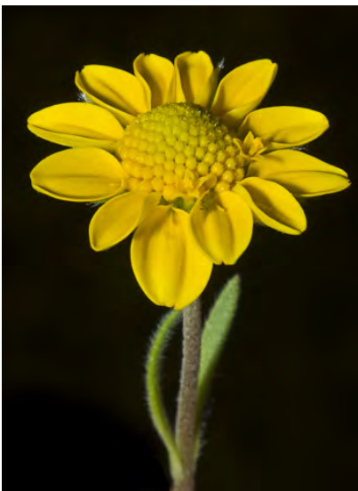
CALIFORNIA GOLDFIELDS (Lasthenia californica subsp. californica) Native Annual -Sunflower Family - (Feb-Jun) - Many habitats - Stem < 16" tall, hairy. Leaves 0.3-2.8" long, <0.25" wide, smooth edged. Head bracts 4-13, not joined. Rays 0.2-0.7" long.