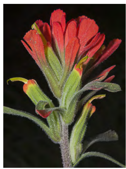
WOOLLY PAINTBRUSH (Castilleja foliolosa) Native Perennial - Broom-rape Family -(Mar-Jun) - Dry, open, rocky slopes, edges of chaparral - Plant 1-2' tall, base slightly woody, much branched, woolly. Flower cluster orange-red (occas. yellow-green).