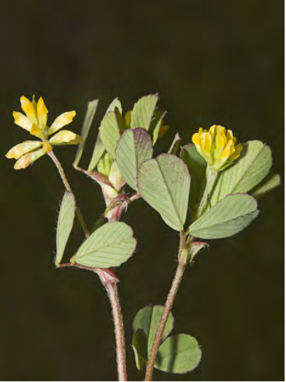
LITTLE HOP CLOVER (Trifolium dubium) Naturalized Annual - Pea Family - (Spring) -Agricultural, disturbed areas, lawns - Heads 0.16-0.3" wide. Flowers bright yellow, age brown, quickly reflex, smooth.