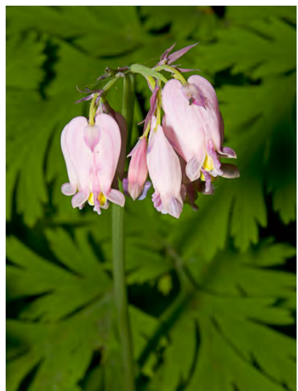
PACIFIC BLEEDING HEART (Dicentra formosa) Native Perennial - Poppy Family - (Mar–Jul) - Damp, shaded areas - Plant 8-18" tall. Leaves dissected, 8-20" long. Flowers heart-shaped, rose-pink, nodding, 2-30 per cluster, 0.5-1.2" long.