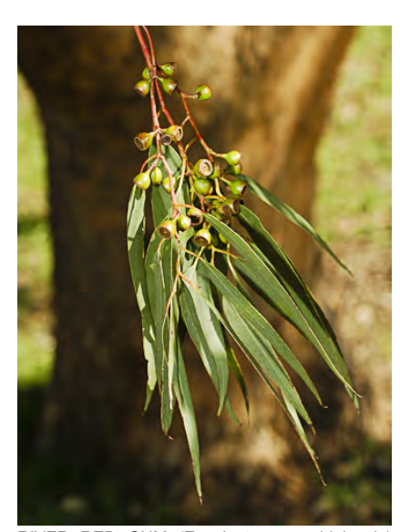
RIVER RED GUM (Eucalyptus camaldulensis) Naturalized Perennial - Myrtle Family - (Apr-Jul) - Common. Disturbed areas - Tree to 80' tall. Leaves 2-8" long, 0.6-1" wide. Flowers 5-10 in simple umbel, small, white; bud cap <0.25". INVASIVE.