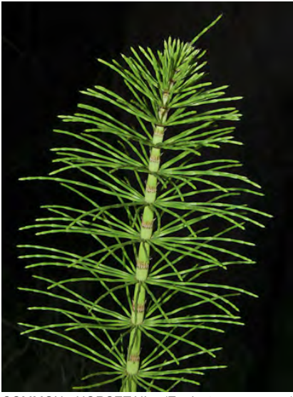
COMMON HORSETAIL (Equisetum arvense) Native Perennial - Horsetail Family - - Streambanks, wet meadows, springs, other wet, shaded places - Sterile stems 4-24" tall, 6-14 sheath teeth. Fertile stems 4-13" tall, 6-10 sheath teeth.