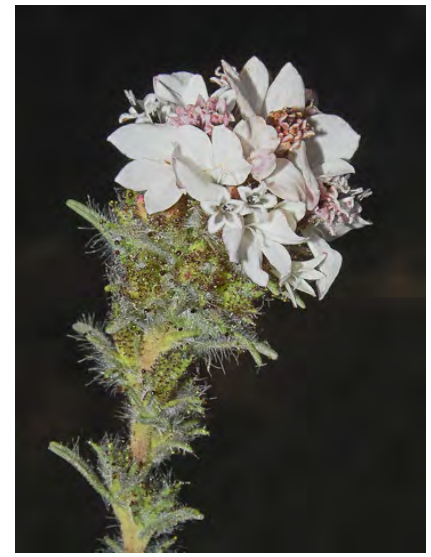
STICKY ROSINWEED (Calycadenia multiglandulosa) Native Annual - Sunflower Family - (May–Oct) - Common. Gen dry, open valleys, hillsides, rocky ridges - Stem hairy, sticky, 4-28" tall. Leaves 1.2-3.1" long. Flowers white or cream to rose or yellow.