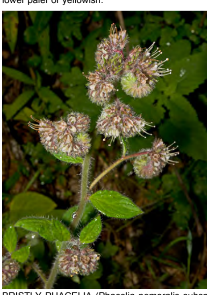
BRISTLY PHACELIA (Phacelia nemoralis subsp. nemoralis) Native Biennial-Perennial - Borage Family - (Apr_Jul) - Moist slopes, streambanks, mixed-evergreen forest - Short-lived. Upper leaves egg-shaped, lower divided. Flowers green-white, 0.16-0.2".