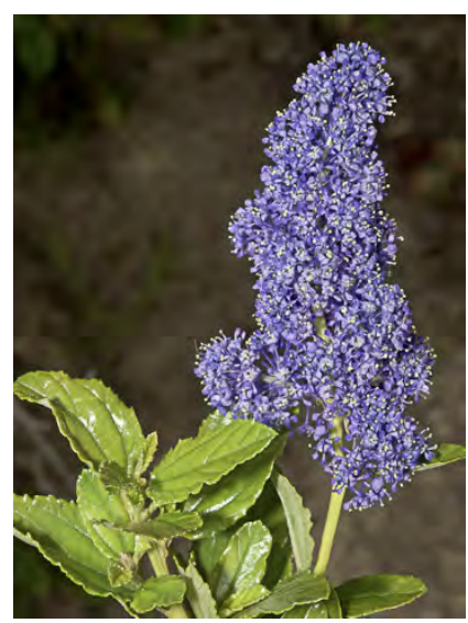
BLUE BLOSSOM (Ceanothus thyrsiflorus var. thyrsiflorus) Native Perennial - Buckthorn Family - (Mar–Jun) - Bluffs, slopes, canyons, chaparral, coastal scrub, closed-cone-pine forest - Leaves alternate, 3 main veins. Twigs angled, ridged lengthwise.