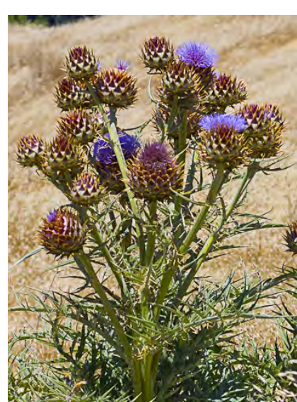
ARTICHOKE THISTLE (Cynara cardunculus subsp. flavescens) Naturalized Perennial - Sunflower Family - (Apr–Jul) - Disturbed places - Plant 1.6-8' tall. Artichoke head 1.6-6" diam, spine-tipped. Flowers blue or purple, 1.2-2" long. NOXIOUS weed.