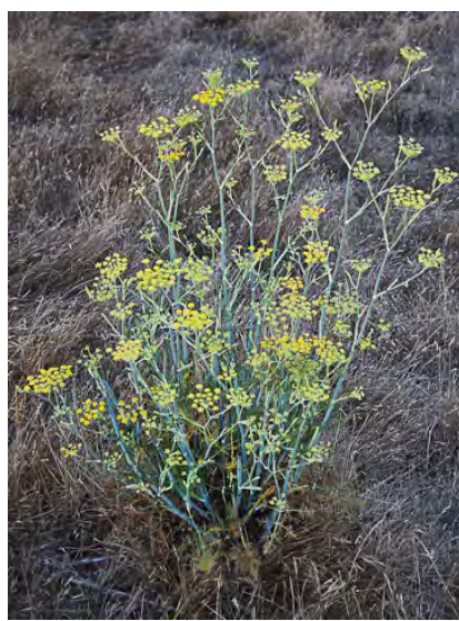
FENNEL (Foeniculum vulgare) Naturalized Perennial - Carrot Family - (May-Sep) - Roadsides, disturbed sites - Plants 3-6.5' tall, anise-scented. Stems waxy-blue, canelike. Flowers yellow Leaf segments thread-like, edible when young. INVASIVE weed.