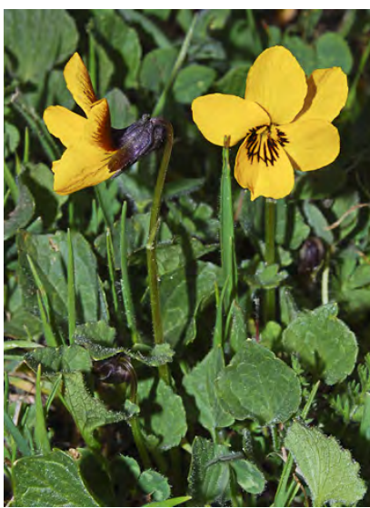
JOHNNY-JUMP-UP (Viola pedunculata) Native Perennial - Violet Family - (Feb-Apr) - Open, grassy slopes, hillsides, chaparral, oak woodland, gen full sun - Plant 2-15" tall. No basal leaves. Petals gold-yellow, lower 3 brown-veined, upper 2 red-brown on back.