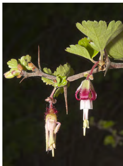
HILLSIDE GOOSEBERRY (Ribes californicum var. californicum) Native Perennial - Gooseberry Family - (Feb-Mar) - Forest openings, woodland - Shrub < 5' tall. Leaf blades 0.4-1.2" long, not sticky. Sepals greenish, petals 0.12" long, white.