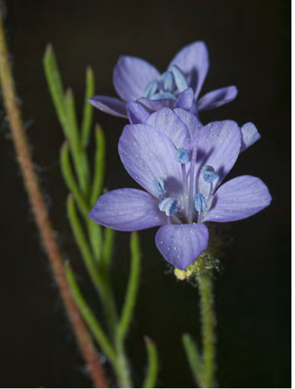
MANY-STEM CALIFORNIA GILIA (Gilia achilleifolia subsp. multicaulis) Native Annual - Phlox Family - (Feb–Jun) - Open or shaded, gen grassy places, sandy or rocky soil - Leaves linear-lobed. Flowers white to lavender, 0.2-0.4" long, not in heads.