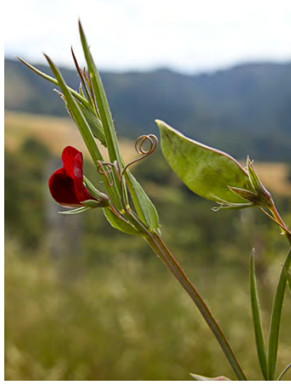
FLATPOD PEAVINE (Lathyrus cicera) Naturalized Annual - Pea Family - (Apr—Jun) - Uncommon. Disturbed areas - Stem narrowly winged. Leaflets 2, 1.2-2.4" long, very narrow. Tendril branched and coiled. Flowers red-purple, solitary, 0.4-0.6" long.