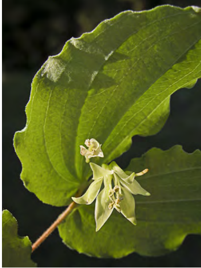
HOOKER FAIRY BELLS (Prosartes hookeri) Native Perennial - Lily Family - (Mar-Jun) -Montane conifer, mixed-evergreen forest, exposed roadside - Stem 12-32" tall. Leaf 1.2-6" long. Flower 0.3-0.6" long, white, hanging below the leaves, stamens > petals.