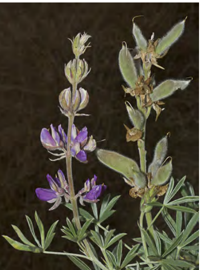
SUMMER LUPINE (Lupinus formosus var. formosus) Native Perennial - Pea Family - (Apr—Sep) - Dry clay soils, grassland, open areas under pines, gen in valleys - Plant 8-32", low growing. Leaves hairy. Flowers purple, hairless, summer/fall blooming.