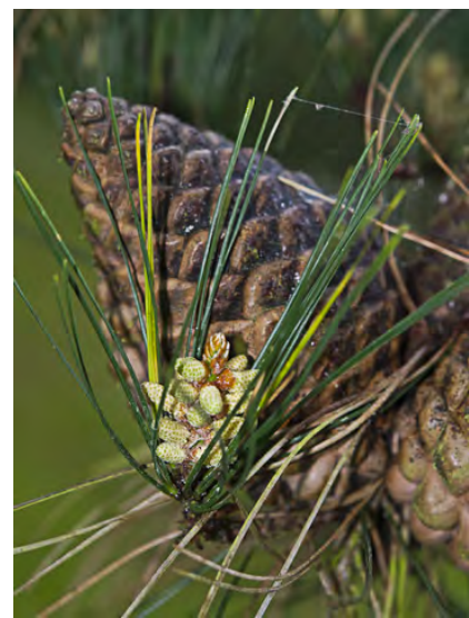
MONTEREY PINE (Pinus radiata) Native Perennial - Pine Family - - - Closed-cone-pine forest, oak woodland - Tree < 125' tall. Mature bark black, deep-grooved. Needles 3 per bundle, 2.4-5.9" long. Seed cone 2.4-6" long, asymmetric, opening 2nd year.