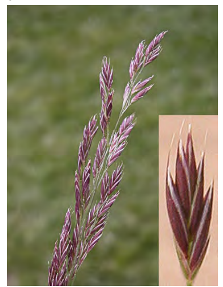
RED FESCUE (Festuca rubra) Native Perennial-Grass Family - (May–Jul) - Sand dunes, grassland, subalpine forest - Plant 12-32", hairy, clumped, w/closed sheath. Generally with rhizomes. Spikelets 0.4-0.5", florets 3-10, awns < 0.16" long.