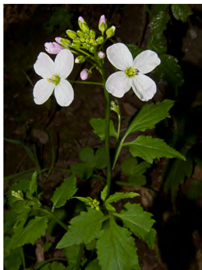
MILK MAIDS (Cardamine californica) Native Perennial - Mustard Family - (Jan-May) - Gen shaded sites, canyons, woodland. One of first spring flowers - Stem 10-24" long. Leaves lobed to compound w/sharp teeth. Petals white or pale rose, 0.3-0.5" long.