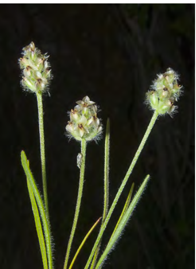
CALIFORNIA DWARF PLANTAIN (Plantago erecta) Native Annual - Plantain Family - (Mar–May) - Sandy, clay, serpentine soil; grassy slopes, flats, open woodland - Leaf 1.2-5" long, linear, hairy. Flowers + stem 1.2-12" tall, cluster 0.2-1.2" long.