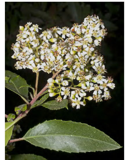
CHRISTMAS BERRY / TOYON (Heteromeles arbutifolia) Native Perennial - Rose Family - ((May)Jun-Aug) - Chaparral, oak woodland, mixed-evergreen forest - Shrub-tree < 33' tall, evergreen. Leaf 2-4" long. Petals white, < 0.16" long. Fruit bright red.