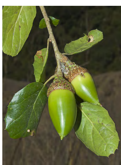
COAST LIVE OAK (Quercus agrifolia var. agrifolia) Native Perennial - Oak Family - (Mar-Apr) - Valleys, slopes, mixed-evergreen forest, woodland - Tree 30-80'. Leaves convex, hair-tuft below in vein axils. Acorns on 1st year twigs, shell glabrous inside.