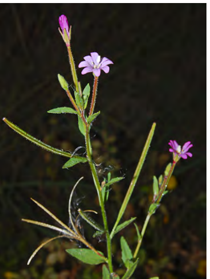
CHAPARRAL WILLOWHERB (Epilobium minutum) Native Annual - Evening Primrose Family - (Apr-Sep) - Dry, open, disturbed areas, vernal pools, often after fire - Plant < 16" tall. Flower cluster open. Petals 0.1-0.2" long, white or pink. Leaves flat, not clustered.