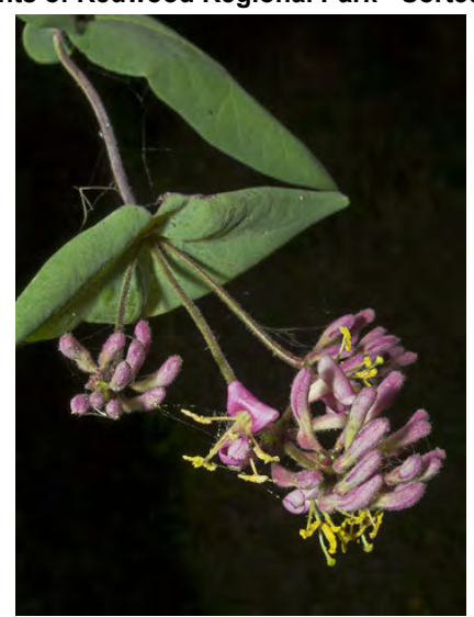
HAIRY VINE HONEYSUCKLE (Lonicera hispidula) Native Perennial - Honeysuckle Family (May–Jun) - Canyons, streamsides, woodland -Shrub sprawling-climbing, 6-10' long, short-hairy. Flower cluster densely sticky. Flowers pink, 0.5-0.6" long, sticky-hairy.