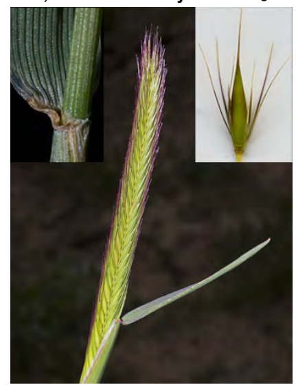
NORTHERN BARLEY (Hordeum brachyantherum subsp. brachyantherum) Native Perennial - Grass Family - (May-Aug) - Meadows, pastures, streambanks - Stem 1-3' tall, gen robust. Leaf sheaths gen smooth, blade < 7.5" long. Lemma awn < 0.25".