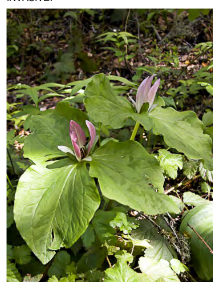
GIANT TRILLIUM (Trillium chloropetalum) Native Perennial - Bunchflower Family - (Apr–May) -Edges of redwood forest, chaparral, gen moist slopes, canyon banks in alluvial soils - Flowers dark purple to white, sessile. Petals 2.6-4" long, odor rose-like or spicy.