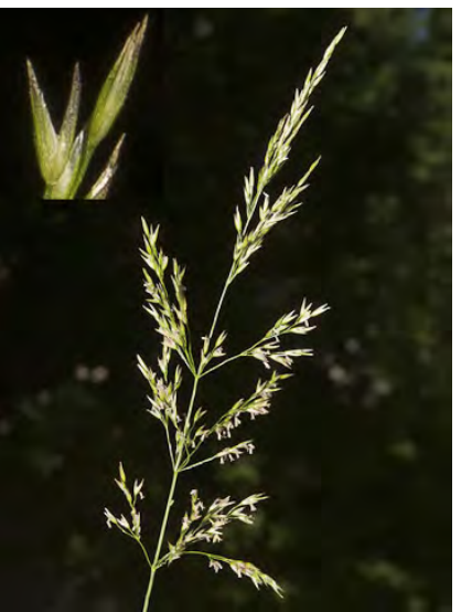
DUNE BENT GRASS (Agrostis pallens) Native Perennial - Grass Family - (Jun-Aug) - Common. Open meadows, woodland, forest, subalpine - Lower leaf blades <= 0.2" wide, flat to inrolled. Flower cluster 2-8" long, < 0.8" wide; narrow and arching when young.