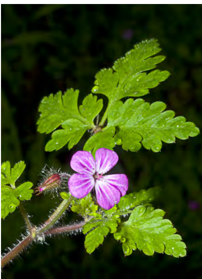
HERB ROBERT (Geranium robertianum) Naturalized Annual-Biennial - Geranium Family -(Apr–Sep) - Open to shaded sites - Stem 4-20" long. Leaflets in 3s, deeply lobed. Petals pink to red-purple, 0.4-0.55" long.