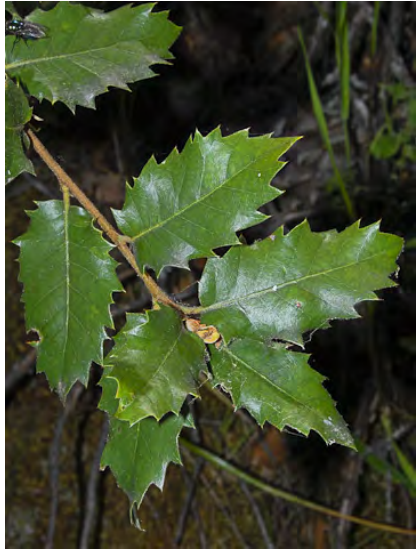
INTERIOR LIVE OAK (Quercus wislizeni var. wislizeni) Native Perennial - Oak Family -Wisizerii) Aduve Feliniai - Oak Tailiiy - (Mar-May) - Interior canyons, slopes, pine/oak woodland - Tree < 75'. Leaf blades 0.8-2" long, hairless, flat. Acorns on 2nd year twigs, shell woolly inside.