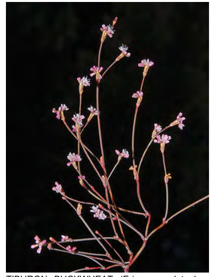
TIBURON BUCKWHEAT (Eriogonum luteolum var. caninum) Native Annual - Buckwheat Family - (May-Oct) - Serpentine - Plant 2-12" tall. Leaf blades wide. Flowers <= 0.1" long, reddish, mostly terminal. CNPS: FAIRLY ENDANGERED.