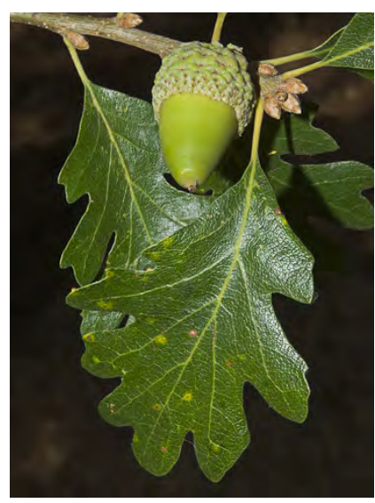
VALLEY OAK (Quercus lobata) Native Perennial Oak Family - (Mar–Apr) - Slopes, valleys, savanna - Tree < 115' tall, deciduous. Leaves 2-5" long, not leathery, deeply lobed, lobes without bristles. Acorns 1.2-2" long, slender, cup 0.4-1.2" deep.