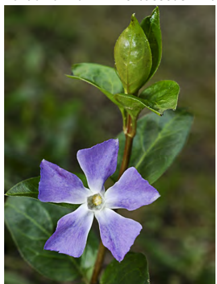
GREATER PERIWINKLE (Vinca major) Naturalized Perennial - Dogbane Family - (Mar-Jun(Jan)) - Coastal bluffs, sheltered places, esp along stream beds - Plant sprawling. Leaf blade ~ 2.8" long, oval. Flower purple-blue, 1.2-2" wide at top. INVASIVE weed.