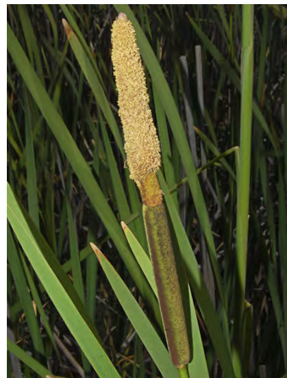
BROAD-LEAVED CATTAIL (Typha latifolia) Native Perennial - Cattail Family - (Jun-Jul) - Unpolluted to nutrient-rich freshwater (brackish) marshes - Plant 4.9-9.8' tall. Widest leaves 0.4-1.1" wide. Flower cluster with no gap between flower types.