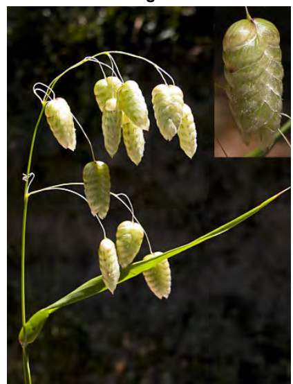
RATTLESNAKE GRASS (Briza maxima) Naturalized Annual - Grass Family - (Apr-Jul) - Shaded sites, roadsides, pastures, weedy on coastal dunes - Stem 8-35" tall. Spikelets 0.4-0.75" long, resemble rattlesnake rattles. INVASIVE weed.