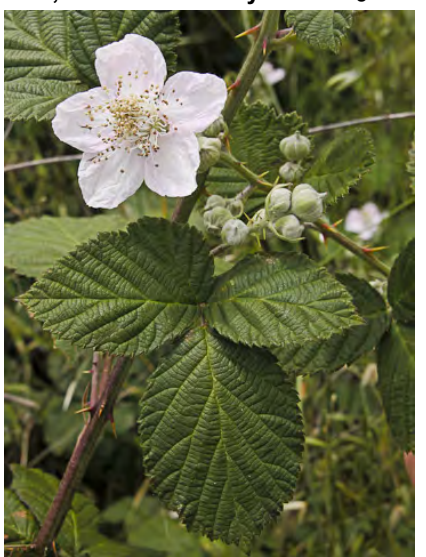
HIMALAYAN BLACKBERRY (Rubus armeniacus) Naturalized Perennial - Rose Family - (Mar–Jun) - Common. Disturbed areas, roadsides - Shrub w/thorny 5-angled stem. Leaflets 3-5, white-hairy beneath. Blackberry-type fruit. INVASIVE.