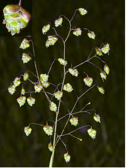
LITTLE QUAKING GRASS (Briza minor) Naturalized Annual - Grass Family - (Apr–Jul) -Shaded or moist, open sites - Stem 3-20" tall. Spikelets 0.1-0.2" long, resemble tiny rattlesnake rattles