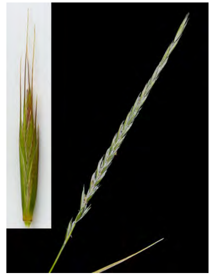
SLENDER WHEAT GRASS (Elymus trachycaulus subsp. trachycaulus) - Dry to moist, open areas, forest, woodland - Tufted. Stem 1-5' tall. Spikelet 0.4-0.8" long, 1 per node. Lemma awn < 0.3" long.