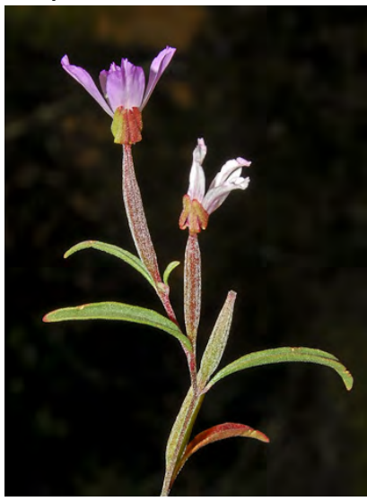
PRESIDIO CLARKIA (Clarkia franciscana) Native Annual - Evening Primrose Family - (May–Jun) - Serpentine soil - Plant < 16". Buds erect. Petals 0.2-0.5", pink w/red base. Stigma = anthers. Ovary 4-grooved. Sepals united. Fed & Calif: ENDANGERED.