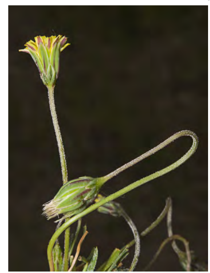
SIERRA FOOTHILL SILVERPUFFS (Microseris acuminata) Native Annual - Sunflower Family - (Apr–Jun) - Grassy, open rocky or clay soil - Plant 2-14". Leaves 1-8" long, basal, linear-lobed. Rays 5-50, yellow. Pappus scale > 0.2" long, no notch.