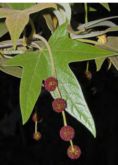
WESTERN SYCAMORE (Platanus racemosa) Native Perennial - Sycamore Family - (Feb-Apr) - Common. Streamsides, canyons, arroyos - Tree 33-115' tall. Bark peeling pale. Leaf blades 4-10" long, palmately lobed, smooth to hairy above, short-woolly under.