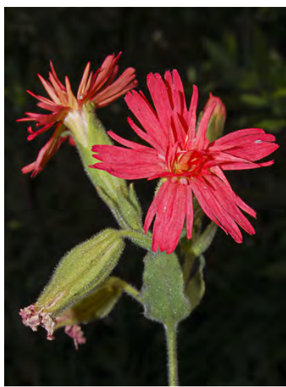
CALIFORNIA PINK (Silene laciniata subsp. californica) Native Perennial - Pink Family - (Spring-summer) - Chaparral, oak woodland, conifer forest, serpentine or not - Plant 8-28" tall. Petals 0.5-1" long, bright red.