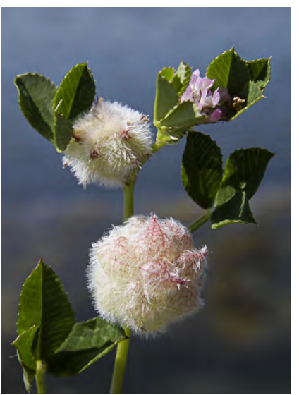
STRAWBERRY CLOVER (Trifolium fragiferum) Naturalized Perennial - Pea Family - (Late spring) - Roadsides, gen in saline soil - Head bracts 0.08" long, green. Flowers pink, 0.2-0.24" long, quickly hidden by hairy inflated flower bracts.