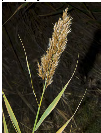
COMMON REED (Phragmites australis) Native Perennial - Grass Family - (Jul-Nov) - Pond & lake margins, sloughs, marshes - Stem 6.6-13', gen < 0.4" diam. Leaf blades gen 8-18" long, base gradually narrowed. Flower cluster 6-20". Spikelet 0.4-0.6", lemmas smooth.