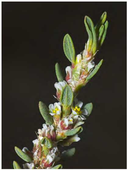
KNOTWEED (Polygonum aviculare subsp. depressum) Naturalized Annual - Buckwheat Family - (May–Nov) - Disturbed places - Stem 4-20", mat-forming, Flowers 2-8/leaf axil, ~0.1" long, fused 1/2 length, w/white or pink margins.