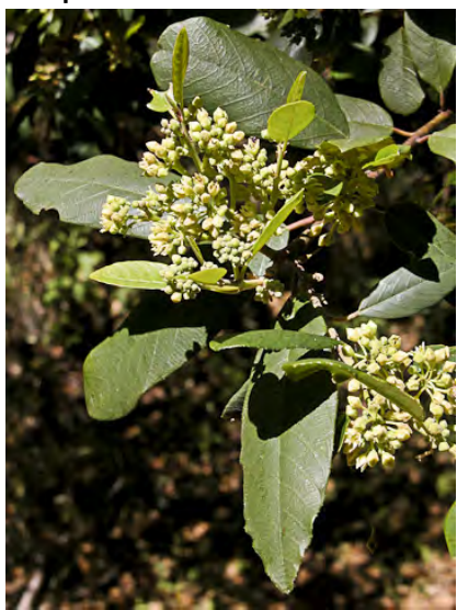
CALIFORNIA COFFEE BERRY (Frangula californica subsp. californica) Native Perennial - Buckthorn Family - (May-Jul) - Coastal-sage scrub, chaparral, forest, woodland - Shrub < 16' tall. Flowers greenish. Leaves smooth beneath.