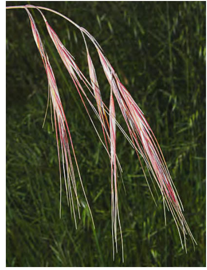
RIPGUT GRASS (Bromus diandrus) Naturalized Annual - Grass Family - (Apr—Jul) - Open, gen disturbed areas - Plant 6-40" tall. Spikelet 1-2.8" long. Lemma body 0.8-1.2" long, awn > 1.2" long. Barbed seeds can stick in flesh of animals. INVASIVE weed.