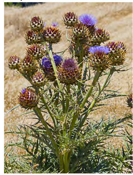
ARTICHOKE THISTLE (Cynara cardunculus subsp. flavescens) Naturalized Perennial - Sunflower Family - (Apr–Jul) - Disturbed places - Plant 1.6-8' tall. Artichoke head 1.6-6" diam, spine-tipped. Flowers blue or purple, 1.2-2" long. NOXIOUS weed.