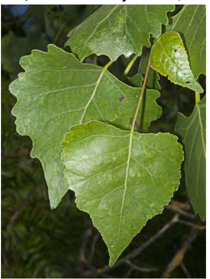
FREMONT COTTONWOOD (Populus fremontii subsp. fremontii) Native Perennial - Willow Family - (Mar–Apr) - Scattered. Alluvial bottomland, streamsides - Tree < 66' tall. Leaves heart-shaped to triangular, coarsely scalloped, blade 1.2-2.8" long.