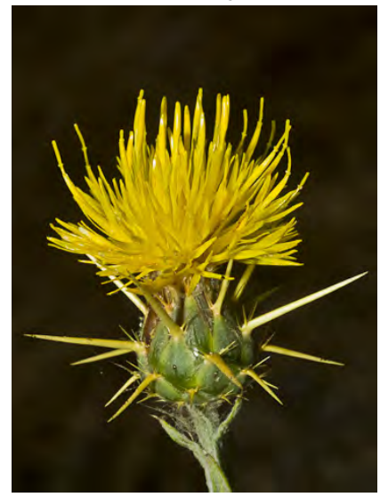
YELLOW STAR-THISTLE (Centaurea solstitialis) Naturalized Annual - Sunflower Family (May-Oct) - Invasive, roadsides, disturbed grassland or woodland - Plant 4-39" tall. Leaves woolly, extend down the stem. Flower bract spines 0.4-1" long. NOXIOUS weed.