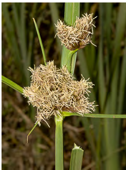
OLNEY'S THREE-SQUARE BULRUSH (Schoenoplectus americanus) Native Perennial - Sedge Family - (Summer) - Mineral-rich or brackish marshes, shores, fens, springs - Stem 1.2-8.2' tall, sharply 3-angled, not leafy. Flower cluster head-like.