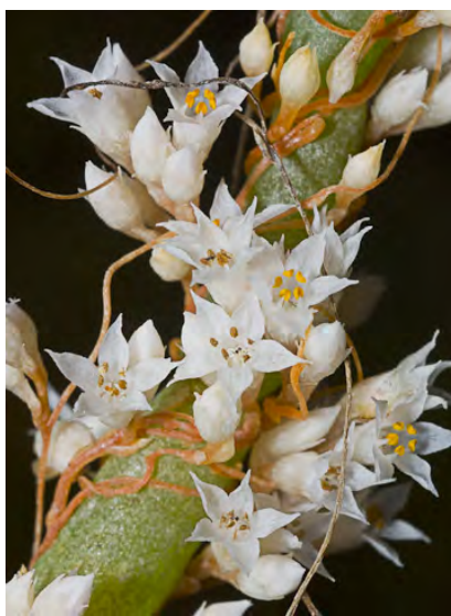
GOLDENTHREAD (Cuscuta pacifica var. pacifica) Native Annual - Morning-glory Family - (Jul-Oct) - Gen on Salicornia, Jaumea in coastal salt marshes, tidal flats - Vine. Stem thread-like. Flowers white, ~0.2" long.