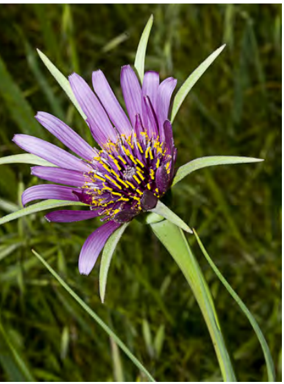
PURPLE SALSIFY (Tragopogon porrifolius) Naturalized Biennial-Perennial - Sunflower Family - (Mar–Nov) - Common. Disturbed places - Plant 16-39" tall, milky sap. Leaves 0.8-1.6" long, very narrow, waxy blue. Flowers purple.