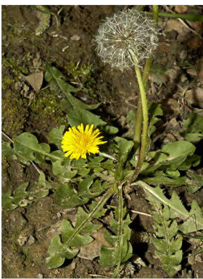
COMMON DANDELION (Taraxacum officinale) Naturalized Biennial-Perennial - Sunflower Family - (All year) - Abundant. Esp disturbed areas -Stem hollow. Leaves bright green with sharp down-pointing lobes. Outer head bracts reflexed. Fruit ~ brown.