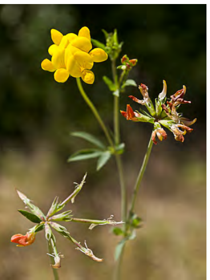
BIRD'S-FOOT TREFOIL (Lotus corniculatus) Naturalized Perennial - Pea Family - (Jun—Sep) -Open, disturbed areas - Leaflets 5, 0.16-0.9" long. Flower cluster 3-7 flowered on0.6-4.7" stalk. Flowers bright yellow, 0.4-0.55" long, banner often reddish.