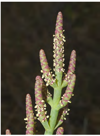
PACIFIC PICKLEWEED (Salicornia pacifica) Native Perennial - Goosefoot Family - (Jul-Nov) - Salt marshes, alkaline flats - Plant 4-28" tall, branching from base, branches opposite. Flower clusters 0.8-3.3" long, 0.1-0.2" wide.