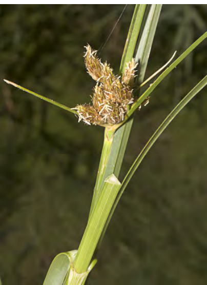
SEACOAST BULRUSH (Bolboschoenus robustus) Native Perennial - Sedge Family - (Summer) - Brackish to saline coastal marshes - Plant 20-60" tall. Stem sharply triangular. Flower cluster dense, stemless, just above bracts. Spikelets 5-25, 0.4-1.2" long.