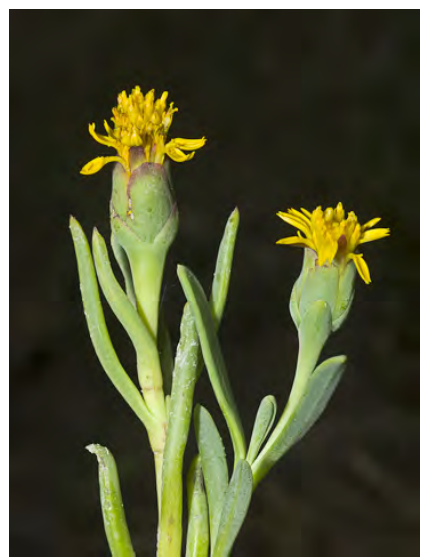
FLESHY JAUMEA (Jaumea carnosa) Native Perennial - Sunflower Family - (Apr–Dec) - Coastal salt marshes, bases of sea cliffs - Stem trailing. Leaf gen 0.6-2" long, fleshy. Flower head yellow, 0.5-0.8" long; rays 0.4-0.2" long, disks ~ 0.25" long. Aromatic.