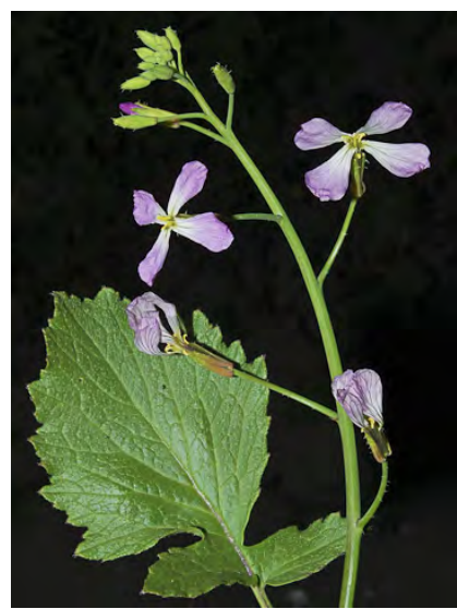
RADISH (Raphanus sativus) Naturalized Annual - Mustard Family - (May-Jul) - Disturbed areas, fields - Stem 16-51" long. Petals 0.6-1" long, white to purple. Fruit a fat cylinder w/constrictions between seeds. INVASIVE weed.