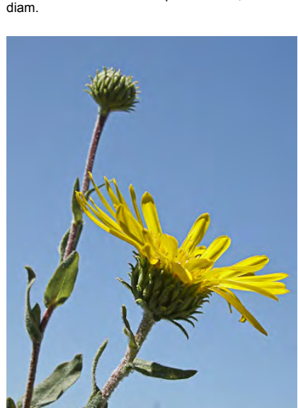
MARSH GUMPLANT (Grindelia stricta var. angustifolia) Native Perennial - Sunflower Family - (May-Dec) - Tidal wetlands - Plant 3.3-6.6' tall, woody base, evergreen. Leaves 0.4-6" long, fleshy, not resinous. Flower rays yellow, 16-56, 0.5-0.7" long.