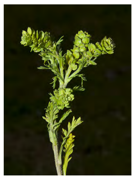
PROSTRATE PEPPERGRASS (Lepidium strictum) Naturalized Annual - Mustard Family - (Apr-Jun) - Uncommon. Disturbed areas, woodland, slopes - Stem 2.8-6.7", gen crawling. Leaves pinnately lobed. Flower cluster crowded, stallk < fruit, sepals stay.