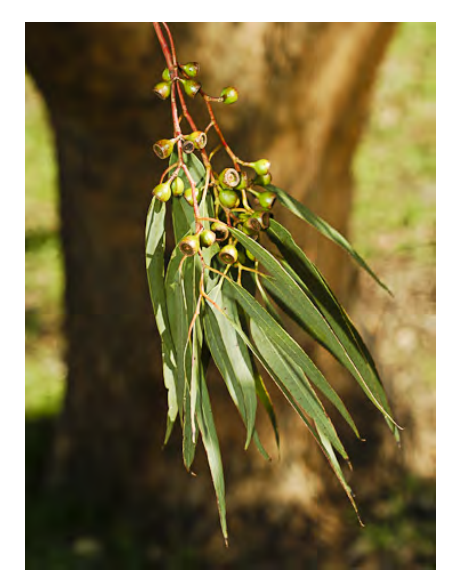
RIVER RED GUM (Eucalyptus camaldulensis) Naturalized Perennial - Myrtle Family - (Apr-Jul) - Common. Disturbed areas - Tree to 80' tall. Leaves 2-8" long, 0.6-1" wide. Flowers 5-10 in simple umbel, small, white; bud cap <0.25". INVASIVE.