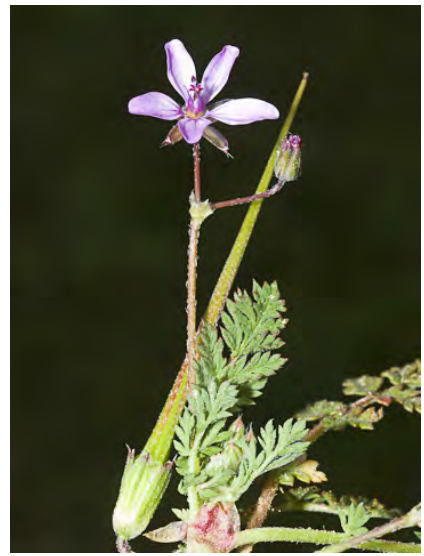
REDSTEM FILAREE (Erodium cicutarium) Naturalized Annual - Geranium Family -(Feb-Sep) - Open, disturbed sites, grassland, scrub - Stem 4-20". Leaves compound, leaflets dissected. Sepal tip bristly. Petal pink to purple. Fruit beak 0.8-2". INVASIVE.