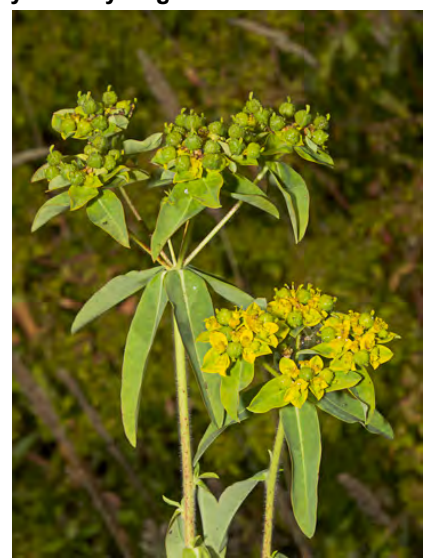
EUROPEAN SPURGE (Euphorbia oblongata) Naturalized Perennial - Spurge Family - (Jun-Aug) - Disturbed areas - Stem 20-32" tall, densely hairy. Leaves 1.6-2.4" long, alternate, oblong. Flower cluster umbrella-like, gland <0.1", elliptic. NOXIOUS weed.