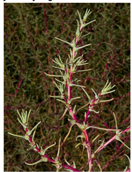
FLESHY RUSSIAN THISTLE (Salsola soda) Naturalized Annual - Goosefoot Family - (Jul-Oct) - Uppermost intertidal zone, saline or muddy flats, open areas in salt marshes - Plant 6-18" tall, succulent, branched from base, not red-striped. INVASIVE weed.