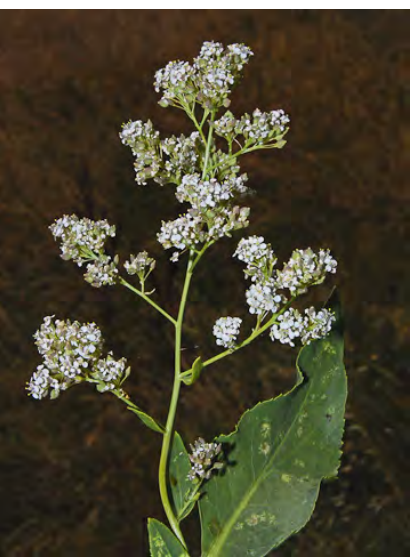
PERENNIAL PEPPERGRASS (Lepidium latifolium) Naturalized Perennial - Mustard Family - (Jun-Sep) - Pastures, disturbed areas, fields, grassland, saline meadows, streambanks, sagebrush scrub, edge of marshes - Plant 14-47". Petals white. NOXIOUS.