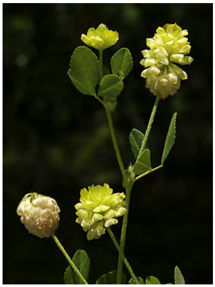
HOP CLOVER (Trifolium campestre) Naturalized Annual - Pea Family - (Apr-May) - Disturbed areas, roadsides - Flower heads 0.3-0.5" wide, bright yellow, brown w/age, quickly reflexing. Flowers with lengthwise ridges.