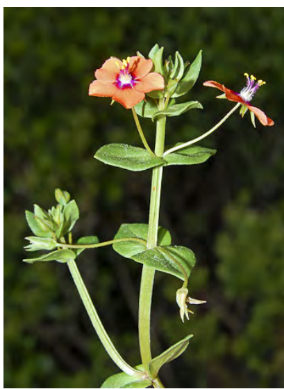
SCARLET PIMPERNEL (Anagallis arvensis) Naturalized Annual - Myrsine Family - (Mar–May) - Common. Disturbed places, ocean beaches -Plants 2-16" tall. Flowers 0.2-0.3" long, salmon or occasionally blue. Leaves TOXIC, can cause dermittis.