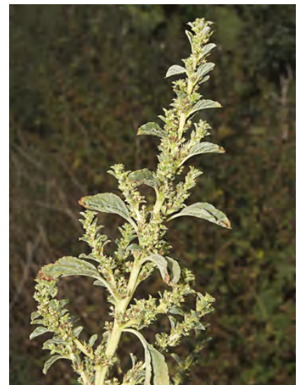
TUMBLEWEED (Amaranthus albus) Naturalized Annual - Amaranth Family - (Jun-Oct) - Disturbed areas, roadsides, riverbanks, sandy places, agricultural fields - Plant upright, bushy. Stem pale. Flower clusters <= 0.6" long, at base of leaves. Flowers with 3 "petals".