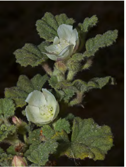
ALKAL-MALLOW (Malvella leprosa) Native Perennial - Mallow Family - (Apr-Nov) - Valleys, gen saline - Stem 4-16" long. Leaf blade 04.-1.4" long, toothed, densely short-hairy. Petals cream-white to yellow, 0.4-0.6" long.