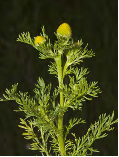
PINEAPPLE WEED (Matricaria discoidea) Naturalized Annual - Sunflower Family -(Feb-Aug) - Abundant. Disturbed sites, riverbanks - Plant 4-12" tall, sweet-scented. Heads pineapple-shaped, ~ 0.4" wide; head stalk to 0.6" long.