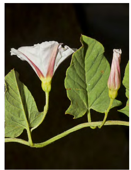
BINDWEED (Convolvulus arvensis) Naturalized Perennial - Morning-glory Family - (Mar–Oct) - Roadsides, open areas in many pl communities - Trailing. Leaf 0.8-1.2" long, w/round tip, pointed lobes. Flowers white to pink, 0.8-1" long. NOXIOUS.