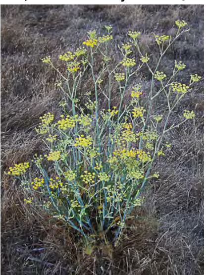
FENNEL (Foeniculum vulgare) Naturalized Perennial - Carrot Family - (May–Sep) - Roadsides, disturbed sites - Plants 3-6.5' tall, anise-scented. Stems waxy-blue, canelike. Flowers yellow. Leaf segments thread-like, edible when young. INVASIVE weed.