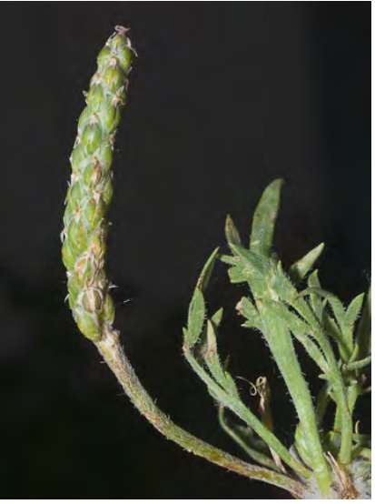
CUT-LEAF PLANTAIN (Plantago coronopus) Native Annual-Biennial - Plantain Family -(Apr-Jul) - Coastal bluffs, salt marshes, trampled places, chaparral, grassy flats - Leaves 1.6-10" long, tooth-like lobes. Flower: stems 1-6, 2-20" tall, cluster 0.8-8" long.