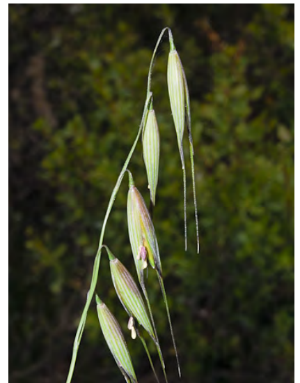
WILD OAT (Avena fatua) Naturalized Annual Grass Family - (Apr–Jun) - Disturbed sites - Plants 1-5' tall. Spikelets 0.7-1.3" long. Low awn 1-1.6" long. Lemma tip bristles < 0.04" long. Seeds EDIBLE whole or ground for flour. INVASIVE weed.