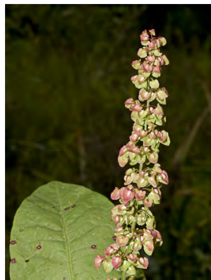
CURLY DOCK (Rumex crispus) Naturalized Perennial - Buckwheat Family - (All year) - Abundant. Disturbed places - Stem 16-39" tall. Flower cluster dense, valves 0.2-0.24", winged around tubercles, smooth edged. 1 tubercle enlarged. INVASIVE.