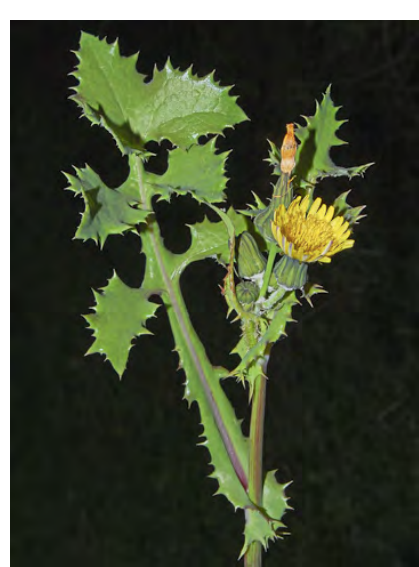
PRICKLY SOW THISTLE (Sonchus asper subsp. asper) Naturalized Annual - Sunflower Family - (All year) - Common. Slightly moist disturbed sites, along streams - Plant 4-48". Leaf teeth prickly. Basal lobes of upper leaves rounded, curving downward.