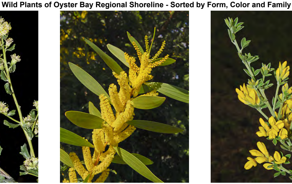
SYDNEY GOLDEN WATTLE (Acacia longifolia) Naturalized Perennial - Pea Family - (Jan-Apr) -Uncommon. Disturbed places, especially sandy coastal areas - Shrub-small tree, spineless. Leaves simple, 2-6" long with 2-4 main veins. Flowers bright yellow.