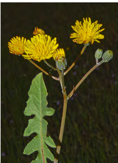
DANDELION-LEAF HAWKSBEARD (Crepis vesicaria subsp. taraxacifolia) Naturalized Annual-Biennial - Sunflower Family - (Feb-Oct) - Sandy clearings, hillsides, disturbed places - Plant 1-47" tall. Leaves dandelion-like. Fruit beak 0.1-0.2" long.