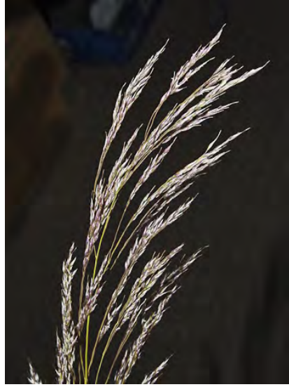
SMILO GRASS (Stipa miliacea var. miliacea) Naturalized Perennial - Grass Family - (Mar–Sep) - Salt marshes, streambanks, chaparral, open woodland, disturbed - Stems green, large tufts, sheaths lt. Inflor arching. INVASIVE weed.