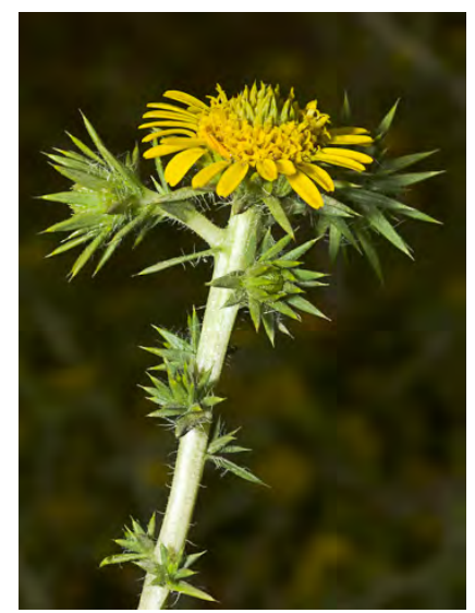
COMMON SPIKEWEED (Centromadia pungens subsp. pungens) Native Annual - Sunflower Family - (Apr–Nov) - Grassland, saltbush scrub, disturbed sites - Spiny. Leaves smooth or rough to the touch.