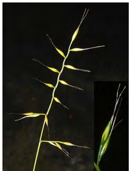
HAIRY FESCUE (Festuca microstachys) Native Annual - Grass Family - (Apr-Jun) - Disturbed, open, gen sandy soils - Stem 6-29". Spikelet 0.2-0.4" long, awn 0.1-0.5" long. Glumes & lemma smooth or hairy.