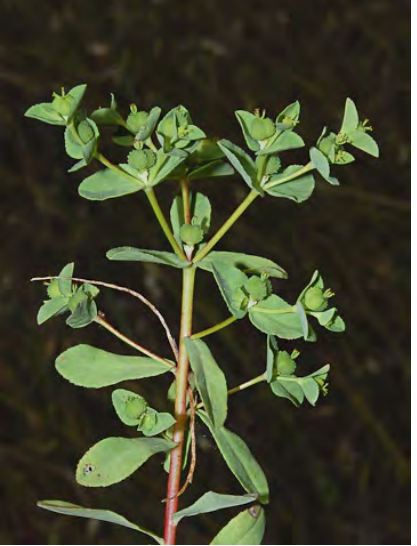
WART SPURGE (Euphorbia spathulata) Native Annual - Spurge Family - (Mar–Jun) - Open, gen disturbed places - Stem 6-17" tall, smooth. Leaves spoon-shaped, 0.4-1.2" long, finely toothed. Gland oblong.