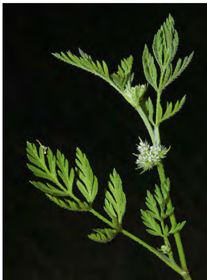
SHORT SOCK-DESTROYER (Torilis nodosa) Naturalized Annual - Carrot Family - (Apr—Jun) - Disturbed places - Plant spreading, 4-20" tall. Flowers white to red, clusters dense, < leaf. Fruit ~ 0.1" long, uncurved bristles on outer surface, bumps inside.