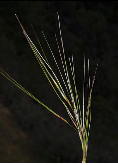
PURPLE NEEDLE GRASS (Stipa pulchra) Native Perennial - Grass Family (Mar–Jun) - Oak woodland, chaparral, grassland - Stem 14-39" long. Leaf blade 4-8" long, Glumes 0.5-0.8" long, ~equal. Awn 1.6-4" long, last segment straight.