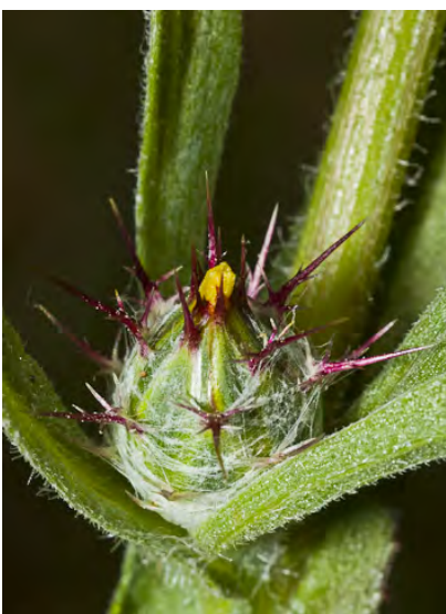
TOCALOTE (Centaurea melitensis) Naturalized Annual - Sunflower Family - (Apr–Jul) - Disturbed fields, open woodland - Plant 4-39", gray-hairy, resinous. Leaves 0.8-6" long. Flowers yellow, 0.4-0.8" long, bracts tipped w/purple spines. NOXIOUS weed.