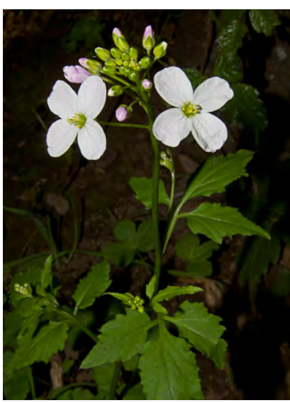
MILK MAIDS (Cardamine californica) Native Perennial - Mustard Family - (Jan-May) - Gen shaded sites, canyons, woodland. One of first spring flowers - Stem 10-24" long. Leaves lobed to compound w/sharp teeth. Petals white or pale rose, 0.3-0.5" long.