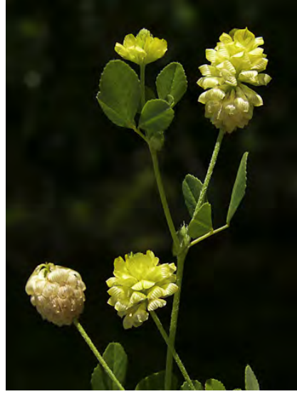
HOP CLOVER (Trifolium campestre) Naturalized Annual - Pea Family - (Apr–May) - Disturbed areas, roadsides - Flower heads 0.3-0.5" wide, bright yellow, brown w/age, quickly reflexing. Flowers with lengthwise ridges.