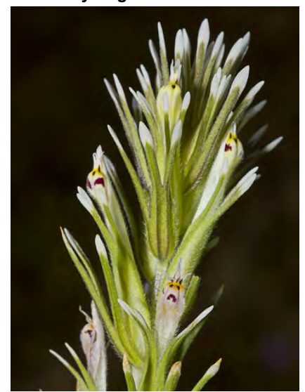
VALLEY TASSELS (Castilleja attenuata) Native Annual - Broom-rape Family - (Mar-May) - Grassland - Plant 4-20" tall, hairy, non-sticky. Leaves 0.8-3.1" long, narrow, 0-3 lobes. Flower cluster 1-12" long, narrow, tips white or pale vellow.