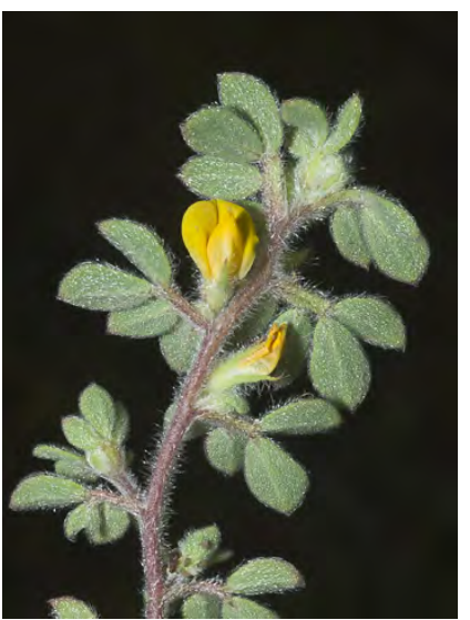
COLCHITA (Acmispon brachycarpus) Native Annual - Pea Family - (Mar–Jun) - Abundant. Grassland, oak and pine woodland, desert flats and mtns, roadsides - Soft, densely hairy, < 16" tall. Flower yellow, almost stemless, bract lobes 1-2x flower tube.