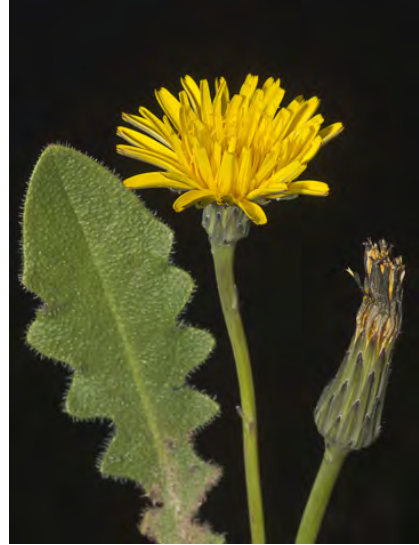
ROUGH CAT'S-EAR (Hypochaeris radicata) Naturalized Perennial - Sunflower Family - (Apr-Jul) - Disturbed areas, grassland, open woodland - Plant 4-32" tall, rough-hairy. Rays 0.4-0.6" long, well exceeding head bracts. Fruits all beaked. INVASIVE weed.