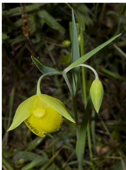
MOUNT DIABLO FAIRY-LANTERN (Calochortus pulchellus) Native Perennial - Lily Family - (Apr-Jun) - Wooded slopes, rarely chaparral, gen n aspect - Stem 4-12", gen branched. Petals light yellow, 1-1.3", sparsely hairy inside. CNPS: FAIRLY ENDANGERED.