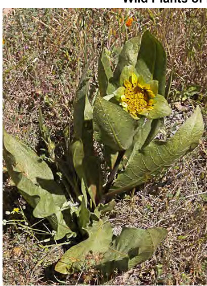
SMOOTH MULE'S EARS (Wyethia glabra) Native Perennial - Sunflower Family - (Mar–Jun) - Gen shady sites - Plant 4-16" tall, shiny green, no woolly hairs. Leaf basal blades 10-18" long, lance-shaped to oval, shiny. Ray flowers 1-2" long.