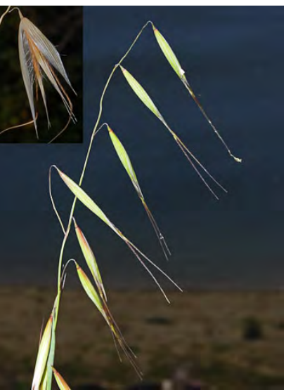
SLENDER WILD OAT (Avena barbata) Naturalized Annual - Grass Family - (Mar–Jun) - Disturbed sites - Plants gen 24-32". Spikelets 0.8-1.2" long. Awns 0.8-1.8" long. Lemma tip bristles >= 0.1" long. Seeds EDIBLE whole or ground for flour. INVASIVE weed.