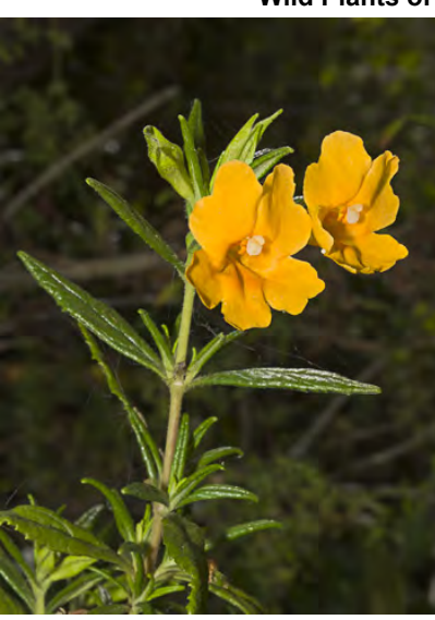
BUSH MONKEYFLOWER (Mimulus aurantiacus var. aurantiacus) Native Perennial - Lopseed Family - (Mar-Jun) - Disturbed areas, coastal cliffs, canyon sides - Shrub 4-60". Flowers yellow, orange or red; 1-2.3" long; bract tube glabrous.