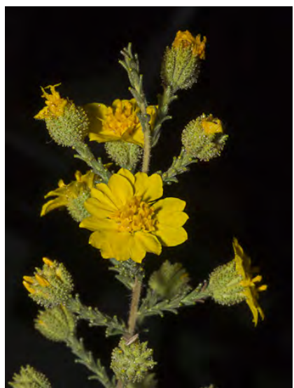
HEERMANN TARPLANT (Holocarpha heermannii) Native Annual - Sunflower Family - (May-Nov) - Grassland - Plant 0.2-1.2 m tall, densely very-short-hairy, glandular. Ray flowers 3-13, yellow. Disk flowers yellow to brown. Yellow anthers.