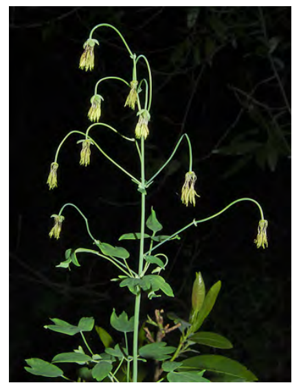
FOOTHILL MEADOW-RUE (Thalictrum fendleri var. polycarpum) Native Perennial - Buttercup Family - (Mar–Jun) - Moist, open to shaded places, woodland, forest - Plant 2-6'+ tall, male or female. Leaf 1-4x divided, 3-18" long, segments 0.3-0.8" long. No petals.