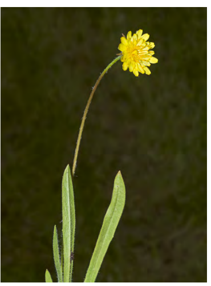
ANNUAL NATIVE DANDELION (Agoseris heterophylla var. cryptopleura) Native Annual - Sunflower Family - (May–Jun) - Many open habitats - Leaf lobes gen 3-5 pair. Flower stem > 2x leaf length. Ray flowers 0.4-0.6" long, much exceeding bracts.