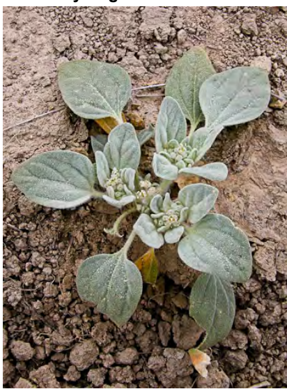
TURKEY-MULLEIN (Croton setigerus) Native Annual - Spurge Family - (May-Oct) - Dry, open, often disturbed areas - Plant < 8" tall, moundlike, covered w/long stiff hairs. Leaf blade 0.4-2" long, oval. TOXIC to livestock.