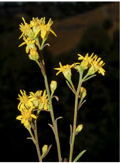
CALIFORNIA MATCHWEED (Gutierrezia californica) Native Perennial - Sunflower Family -(Jul–Nov) - Grassland, arid woodland and shrubland, serpentine - Stem 8-40" long, woodly base. Leaf narrow, flat, <= 2" long. Ray flowers 4-13, 0.1-0.3" long.