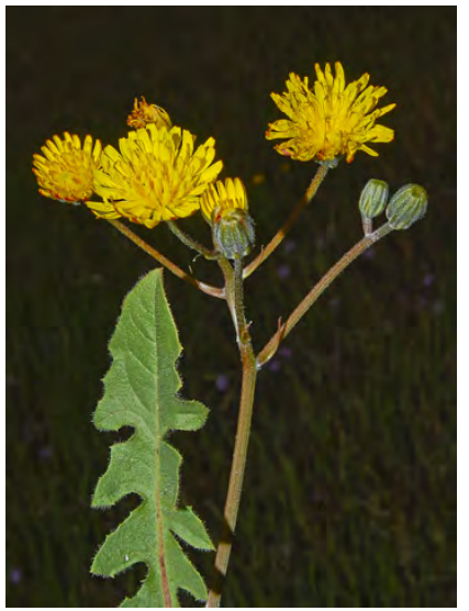
DANDELION-LEAF HAWKSBEARD (Crepis vesicaria subsp. taraxacifolia) Naturalized Annual-Biennial - Sunflower Family - (Feb-Oct) - Sandy clearings, hillsides, disturbed places - Plant 1-47" tall. Leaves dandelion-like. Fruit beak 0.1-0.2" long.