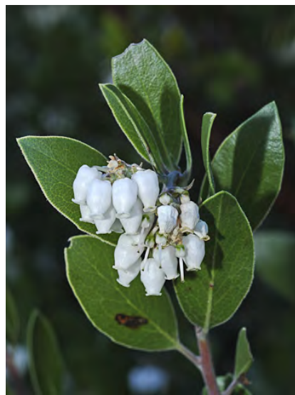
COMMON / GIANT MANZANITA (Arctostaphylos manzanita subsp. manzanita) Native Perennial -Heath Family - (Feb-May) - Chaparral, conifer forest - Erect, 7-26' tall. Flower cluster w/2-7 branches, immature axis 0.6-1.8" long. Flower stalks smooth, hairless.