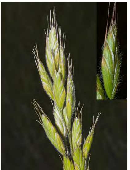
SOFT CHESS (Bromus hordeaceus) Naturalized Annual - Grass Family - (Apr-Jul) - Fields, disturbed areas - Plant 4-26" tall. Leaf hairy. Flower cluster 1-5" long, dense, some stalks > spikelet. Spikelet 0.5-0.9". Lemma 0.26-0.4", awn 0.16-0.4". INVASIVE weed.