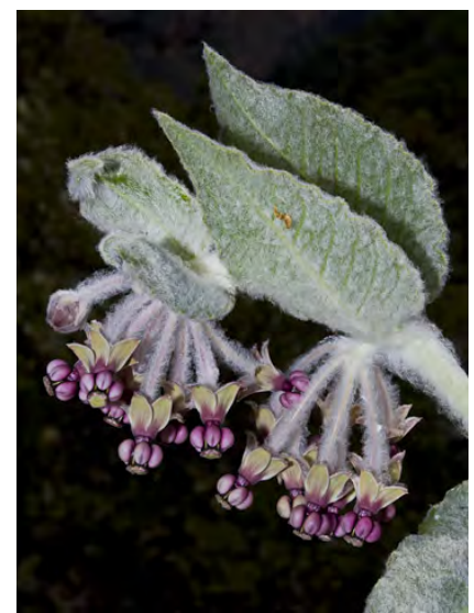
CALIFORNIA MILKWEED (Asclepias californica) Native Perennial - Dogbane Family - (Apr–Jul) - Flats, grassy or brushy hillsides - Plant densly white-woolly. Leaves oval. Flowers dark purple, ~ 0.5" long, petals bent back. Food plant for Monarch butterflies.