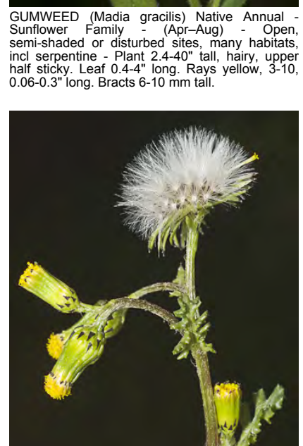
COMMON GROUNDSEL (Senecio vulgaris) Naturalized Annual - Sunflower Family -(Feb-Jul) - Common. Disturbed areas - Plant 4-24" tall, not hairy, w/1-10+ stems. Flower head bracts with black-tips. Milky sap.