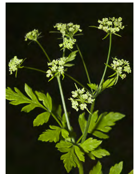
TALL SOCK-DESTROYER (Torilis arvensis) Naturalized Annual - Carrot Family - (Apr–Jul) - Disturbed places - Plant erect, 12-40". Flower clusters open, > leaf. Fruits 0.1-0.2" long, covered with uncurved bristles. Flowers white or pinkish. INVASIVE weed.