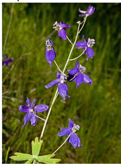
SPREADING LARKSPUR (Delphinium patens subsp. patens) Native Perennial - Buttercup Family - (Mar–Jun) - Grassland, open woodland - Stem 4-35" long. Leaves glabrous, divided into few-toothed lobes. Flowers few, bright or dark blue-purple.