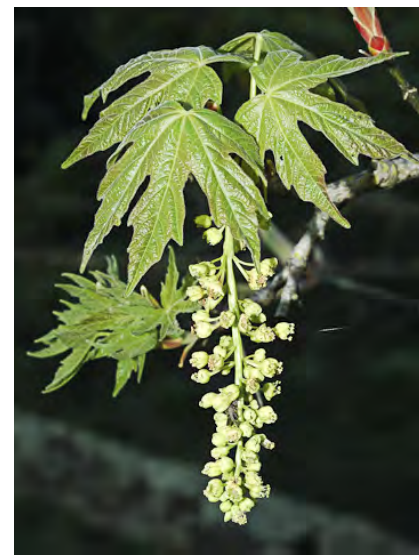
BIG-LEAF MAPLE (Acer macrophyllum) Native Perennial - Soapberry Family - (Mar–Jun) -Common. Streambanks, canyons - Tree < 100'. Leaves 5-lobed, 3-6" long, 4-10" wide. Group of 20-90 hanging flowers appear after leaves. Winged seeds.