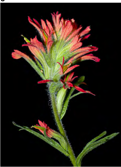
COMMON INDIAN PAINTBRUSH (Castilleja affinis subsp. affinis) Native Perennial - Broom-rape Family - (Mar–Jun) - Chaparral, coastal scrub - Plants 6-24" tall, gen bristly, non-sticky. Leaves 1-3", lance-shaped, 0-5 lobes. Flower cluster open, red to orange-red.