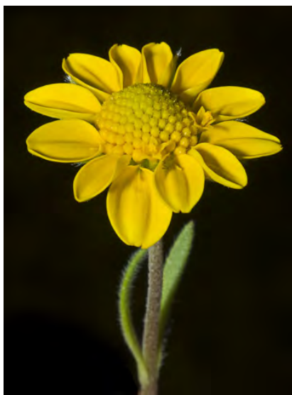
CALIFORNIA GOLDFIELDS (Lasthenia californica subsp. californica) Native Annual - Sunflower Family - (Feb—Jun) - Many habitats - Stem < 16" tall, hairy. Leaves 0.3-2.8" long, <0.25" wide, smooth edged. Head bracts 4-13, not joined. Rays 0.2-0.7" long.