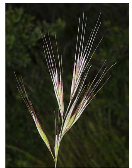
FOXTAIL CHESS (Bromus madritensis subsp. madritensis) Naturalized Annual - Grass Family - (Apr-Jan) - Disturbed areas, roadsides - Plants 4-20" tall. Stem and sheathes smooth. Flower cluster branches visible, lower spikelets erect, > stalk.