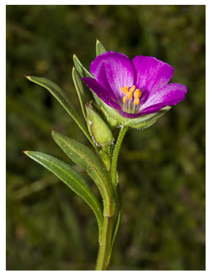
RED MAIDS (Calandrinia ciliata) Native Annual - Miner's Lettuce Family - (Feb-May) - Common. Sandy to loamy soil, grassy areas, cult fields - Petals 0.2-0.6" long, bright pink to red, round-tipped. Fruit < 0.1" longer than bracts.