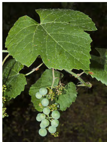
CALIFORNIA WILD GRAPE (Vitis californica) Native Perennial - Grape Family - (May—Jun) - Streamsides, springs, canyons - Woody vine to 33'+long. Leaves deciduous, heart-shaped to kidney-shaped. Fruit purple when mature, gen > 0.3" wide.