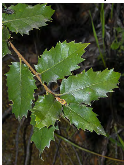
INTERIOR LIVE OAK (Quercus wislizeni var. wislizeni) Native Perennial - Oak Family -Wisizerii) radive Feliniai - Oak Tailily (Mar-May) - Interior canyons, slopes, pine/oak woodland - Tree < 75'. Leaf blades 0.8-2" long, hairless, flat. Acorns on 2nd year twigs, shell woolly inside.