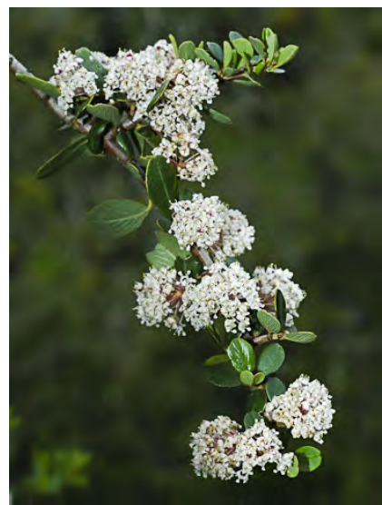
BUCKBRUSH (Ceanothus cuneatus var. cuneatus) Native Perennial - Buckthorn Family - (Feb–May) - Sandy to rocky flats, slopes, ridges - Shrub/tree < 10' tall. Leaves opposite on rigid twigs, w/single main vein. Flowers gen white.