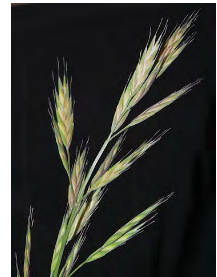
CALIFORNIA BROME (Bromus carinatus var. carinatus) Native Perennial - Grass Family - (Apr-Aug) - Coastal prairies, openings in chaparral, plains, open oak and pine woodland -Plant 20-40" tall. Flower cluster 6-16" long. Spikelet 0.8-1.6" long. Lemma 0.5-0.8" long, hairy, awn 0.3-0.6" long.