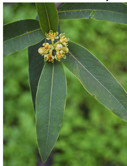
CALIFORNIA BAY (Umbellularia californica) Native Perennial - Laurel Family - (Nov-May) -Common. Canyons, valleys, chaparral - Tree < 150' tall. Leaf 1.2-4", 0.6-1.2" wide, aromatic. Cluster of 5-10 small, yellow or yellow-green flowers. Fruit 0.8-1" diam.