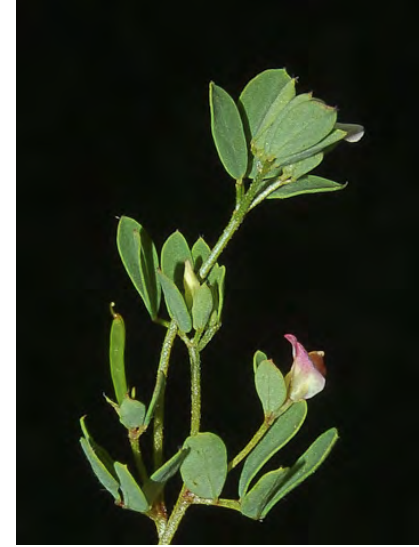
SMALL-FLOWER LOTUS (Acmispon parviflorus) Native Annual - Pea Family - (Mar–May) - Abundant. Coastal bluffs to oak/pine or fir woodland, open or disturbed areas - Flowers pinkish, solitary, 0.2" long, on stalk with bracts. Not hairy.