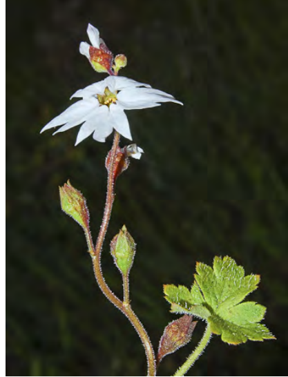
WOODLAND STAR (Lithophragma affine) Native Perennial - Saxifrage Family - (Mar–Apr) - Open, grassy slopes - Plant 4-24" tall. Leaves w/3-5 sharp-toothed shallow lobes, stem leaves alternate. Petals 0.2-0.5" long, white. Hypanthium funnel-shaped.