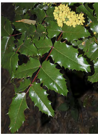
SHINYLEAF OREGON-GRAPE (Berberis pinnata subsp. pinnata) Native Perennial - Barberry Family - (Feb-May) - Rocky slopes, conifer forest, oak woodland, chaparral - Shrub gen < 7'. Leaflets w/15-23 spiny teeth, spines < 0.1" long. Flowers yellow.