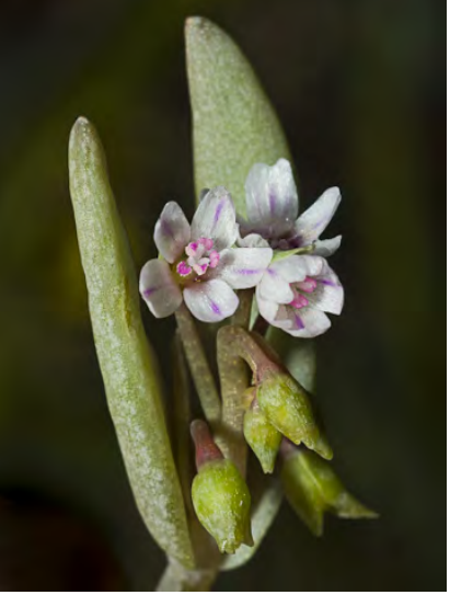
COMMON PALE CLAYTONIA (Claytonia exigua subsp. exigua) Native Annual - Miner's Lettuce Family - (Apr-Jul) - Dry or moist, disturbed bare clay to sandy soils, often serpentine - Stem leaf free or fused. Petals 0.1-0.2", white or pink. Seeds dull w/appendage.