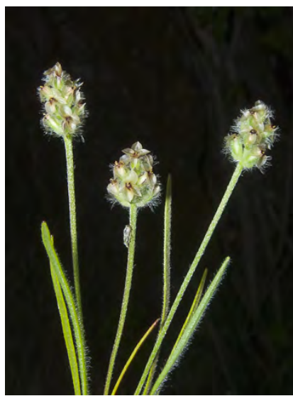
CALIFORNIA DWARF PLANTAIN (Plantago erecta) Native Annual - Plantain Family - (Mar–May) - Sandy, clay, serpentine soil; grassy slopes, flats, open woodland - Leaf 1.2-5" long, linear, hairy. Flowers + stem 1.2-12" tall, cluster 0.2-1.2" long.