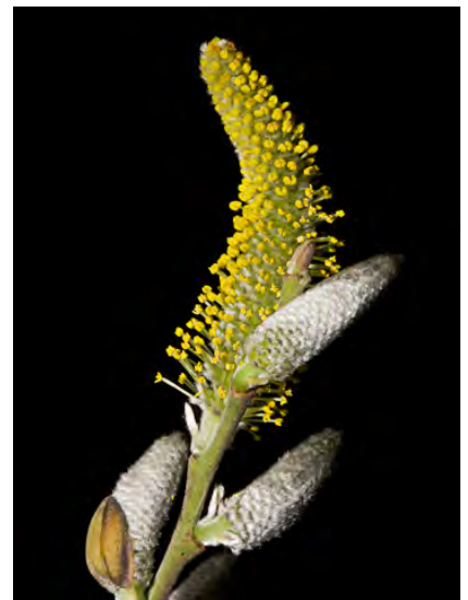
ARROYO WILLOW (Salix lasiolepis) Native Perennial - Willow Family - (Jan-Jun) - Common. Shores, marshes, meadows, etc - Shrub-tree, bark smooth. Leaf-like stipules. Leaf egg-shaped, waxy below. Fruit smooth, bract persistent, dark, stamens 2.