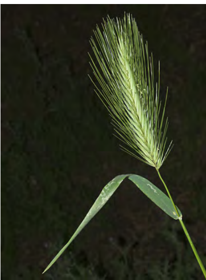
HARE BARLEY (Hordeum murinum subsp. leporinum) Naturalized Annual - Grass Family - (Feb-May) - Moist, gen disturbed sites. Common - Stem 12-43" tall. Central spikelet stalk ~0.06" long. Central floret << lateral florets. INVASIVE