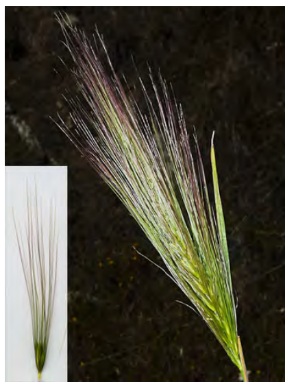
BIG SQUIRRELTAIL (Elymus multisetus) Native Perennial - Grass Family - (May-Jul) - Open, sandy to rocky areas - Tufted. Stem 6-24" tall. Leaf 0.06-0.2" wide. Spikelet 0.4-0.6" long. Glume divisions needle-shaped, lemma awn 1-4 long.