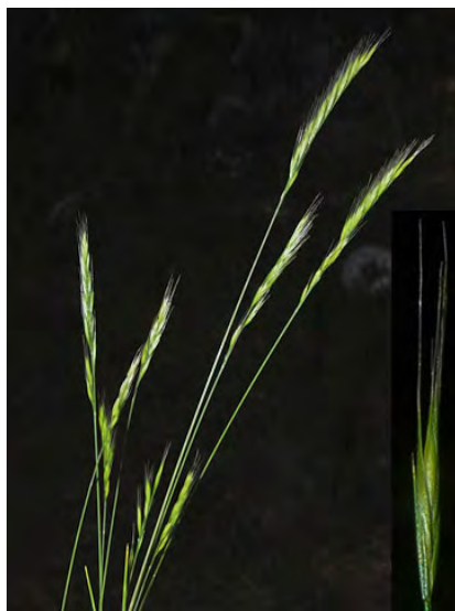
BROME FESCUE (Festuca bromoides) Naturalized Annual - Grass Family - (May-Jun) -Uncommon. Dry, disturbed places, coastal-sage scrub, chaparral - Stem < 20". Inflor 0.6-6" tall, dense, lower branches erect. Spikelet 0.2-0.4" long, awn 0.1-0.3" long.