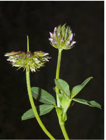
PINPOINT CLOVER (Trifolium gracilentum) Native Annual - Pea Family - (Mar—Jun) - Open, disturbed places, occas serpentine - Leaflet tips not deep-notched. Reflexed pink-purple flowers w/point. Flower bracts completely smooth.