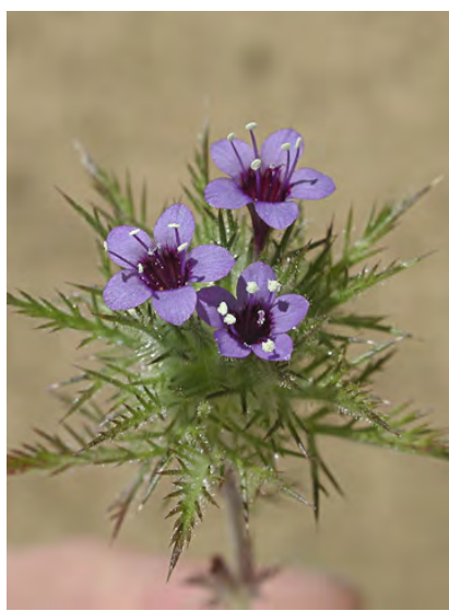
DOWNY NAVARRETIA (Navarretia pubescens) Native Annual - Phlox Family - (May—Jul) - Open, slopes, gravel, clay - Stem 5.5-13", tan to red-brown. Bracts irregularly toothed. Calyx lobes often toothed. Flowers 0.4-0.6" long, bright blue-purple.