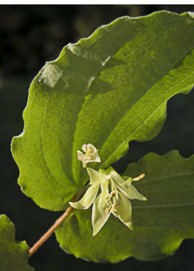
HOOKER FAIRY BELLS (Prosartes hookeri) Native Perennial - Lily Family - (Mar–Jun) - Montane conifer, mixed-evergreen forest, exposed roadside - Stem 12-32" tall. Leaf 1.2-6" long. Flower 0.3-0.6" long, white, hanging below the leaves, stamens > petals.