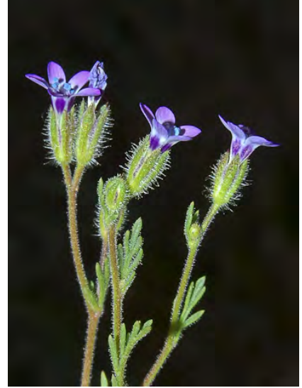
PURPLESPOT GILIA (Gilia clivorum) Native Annual - Phlox Family - (Feb–Jun) - Common. Open, grassy areas - Stem 2-12" tall, hairy, branched. Leaves narrowly linear-lobed. Flowers 0.25-0.3" long, tube yellow, purple-spotted. Flowering stem sticky.