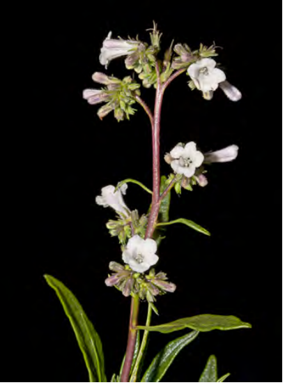
CALIFORNIA YERBA SANTA (Eriodictyon californicum) Native Perennial - Borage Family canionicum) islative Perennial - Borage Family - (Apr–Jul) - Slopes, fields, roadsides, woodland, chaparral - Shrub 3.3-10' tall. Leaf blade sticky, <= 6" long, 1.6-2" wide. Flowers white to purple, 0.3-0.5" long.