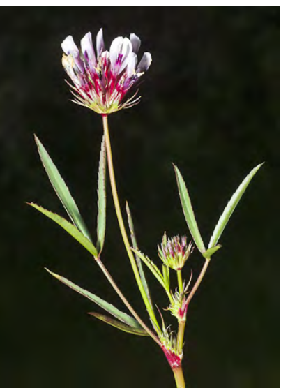
TOMCAT CLOVER (Trifolium willdenovii) Native Annual - Pea Family - (Mar–Jun) - Abundant. Disturbed, gen spring-moist, heavy soils, occas serpentine - Head bract wheel-shaped, sharp-lobed. Leaf narrow. Flowers purple w/white tip, 0.3-0.6" long.