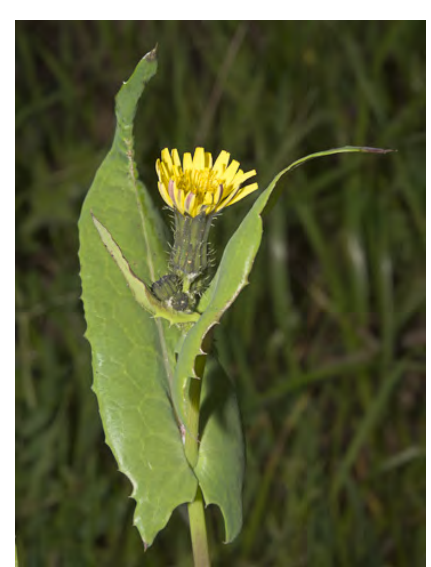
COMMON SOW THISTLE (Sonchus oleraceus) Naturalized Annual - Sunflower Family - (All year) - Abundant. Disturbed places - Plant 4-55" tall. Leaf teeth soft to touch. Basal lobes of upper leaves sharply pointed, straight to curving upward.