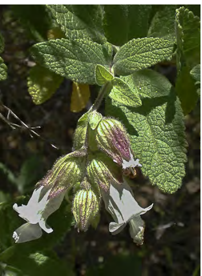
PITCHER SAGE (Lepechinia calycina) Native Perennial - Mint Family - (Apr-Jun) - Common. Rocky slopes; chaparral, woodland - Shrub 3.3-6.6 tall. Leaf blade gen 1.6-4.7" long. Flowers white to lavender tinged, 1-1.2" long, 5-lobed, 2-lipped.