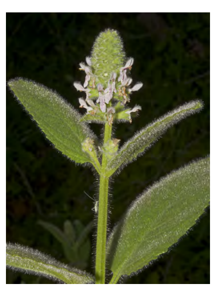
SHORT-SPIKED HEDGE-NETTLE (Stachys pycnantha) Native Perennial - Mint Family - (Jun-Oct) - Streambanks, springs, pine/oak forest - Plant 12-39", densely glandular, aromatic. Flower cluster < 2", no spaces. Petals white to pink, ~0.3" long.