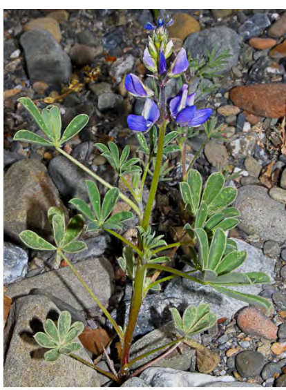
ARROYO LUPINE (Lupinus succulentus) Native Annual - Pea Family - (Feb-May) - Abundant. Open or disturbed areas, often seeded on roadbanks - Plant 8-40" tall, fleshy, sparsely hairy. Flowers 0.5-0.7" long, whorled, gen blue-purple, petal claws short-hairy.