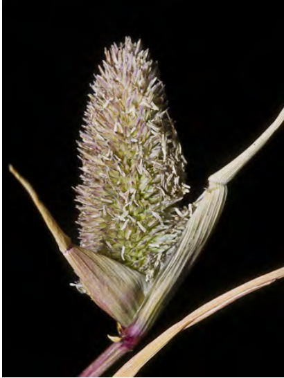
SWAMP PRICKLE GRASS (Crypsis schoenoides) Naturalized Annual - Grass Family - (Jun-Oct) - Wet places - Plant mat-like. Stem 2-30" long. Leaf blade 1-4" long. Flower cluster 0.1-3" long, 0.2-0.6" wide. Spikelet ~0.1" long.