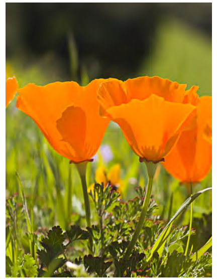
CALIFORNIA POPPY (Eschscholzia californica) Native Perennial - Poppy Family - (Feb-Sep) - Grassy, open areas - Plant 2-24" tall. Flower w/spreading rim <= 0.2". Petals 0.8-2.4" long, early spring = large and orange, fall = smaller and yellow.