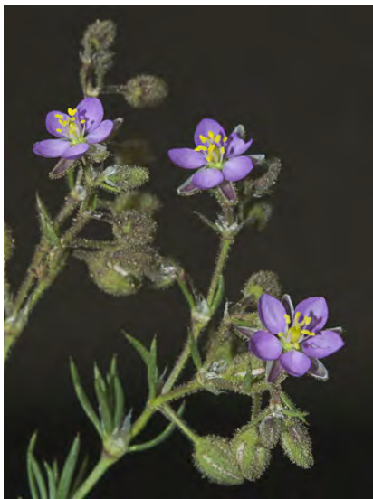
RED SAND-SPURRY (Spergularia rubra) Naturalized Annual-Perennial - Pink Family -(Spring-fall) - Forest, meadows, mud flats, disturbed - Plant 1.6-10". Leaf non-fleshy, whorls w/large white bracts. Petals pink. Stamens 6-10. Sepals < 0.16".