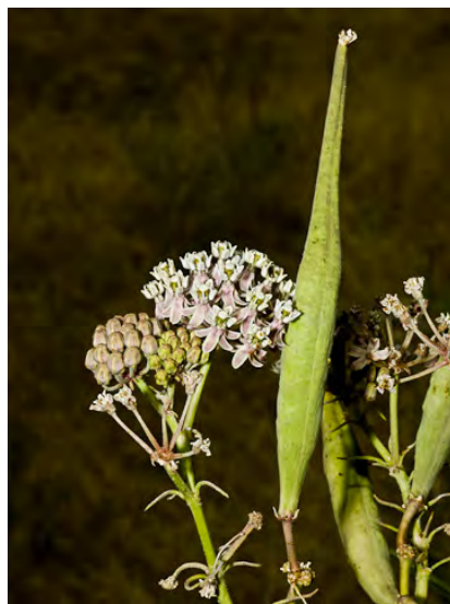
NARROW-LEAF MILKWEED (Asclepias fascicularis) Native Perennial - Dogbane Family - (May-Oct) - Dry ground, valleys, foothills - Plant gen hairless. Stem leaves narrow, 3-5 in whorts. Flowers green-white to purple-tinged, ~0.25"