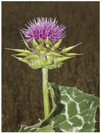
MILK THISTLE (Silybum marianum) Naturalized Annual-Biennial - Sunflower Family - (Feb–Jun) - Roadsides, pastures, disturbed areas - Stem 1-10', stout. Leaves spiny, shiny green wiwhite veins and spots. Flowers red-purple. INVASIVE weed.