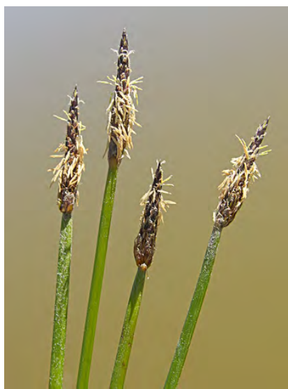
COMMON SPIKERUSH (Eleocharis macrostachya) Native Perennial - Sedge Family - (Spring—summer) - Common. Fresh to brackish wetland - Stem 8-39" tall, 0.06-0.1" wide. Spikelet 0.2-1.6" long, 0.08-0.2" wide, style 2-branched.