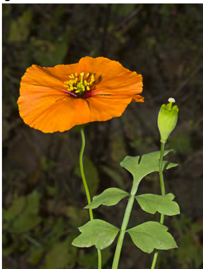
WIND POPPY (Papaver heterophyllum) Native Annual - Poppy Family - (Apr-May) - Grassy areas, openings in chaparral - Plant 1-2', yellow sap. Petals orange-red, 0.4-0.8" long. Stigma spherical on slender style.