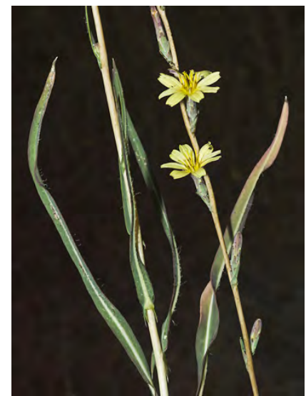
WILLOW LETTUCE (Lactuca saligna) Naturalized Annual - Sunflower Family (Jul-Nov) - Roadsides, grassland - Stem 12-39" tall. Leaf lobes entire or few-toothed, no prickles underneath. Flowers 5-12, pale yellow, open in morning.