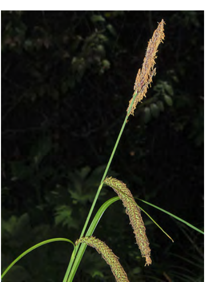
SANTA BARBARA SEDGE (Carex barbarae) - Native Perennial - Sedge Family - (May-Aug) - Seasonally wet places - Stem 6-36" tall, base brown to purple. Lowest flower cluster "leaves" < 4" long. Spikelets brown, 1-3" long, 0.2-0.3" wide.