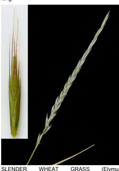
SLENDER WHEAT GRASS (Elymus rachycaulus subsp. trachycaulus) Native Perennial - Grass Family - (Jun-Aug) - Dry to moist, open areas, forest, woodland - Tufted. Stem 1-5' tall. Spikelet 0.4-0.8" long, 1 per node. Lemma awn < 0.3" long.