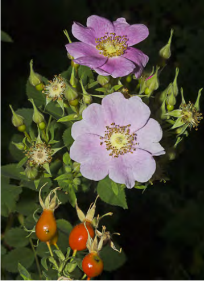
CALIFORNIA ROSE (Rosa californica) Native Perennial - Rose Family - (Feb-Nov) - Gen ± moist areas in sun, esp streambanks - Shrub 2.6-8.2' tall withick curved spines, forming thickets. Petals pink, 0.6-1" long; sepals unlobed.