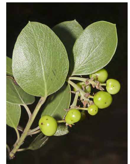
BIG-BERRY MANZANITA (Arctostaphylos glauca) Native Perennial - Heath Family - (Dec-Mar) - Rocky slopes, chaparral, woodland - Shrub-small tree, 3-26' tall. Twigs glabrous. Leaves smooth, waxy-white. Flower stalk 0.3-0.4" long, sticky-hairy.