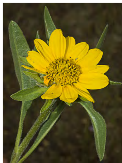
DIABLO HELIANTHELLA (Helianthella castanea) Native Perennial - Sunflower Family - (Apr–Jun) - Open, grassy sites - Stem 4-20" tall. Leaves w/ 1 pair of veins more distinct. Outer head bracts leaf-like, curl around head. CNPS: FAIRLY ENDANGERED.