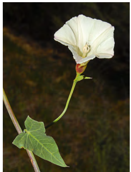
CLIMBING MORNING-GLORY (Calystegia purpurata subsp. purpurata) Native Perennial - Morning-glory Family - (May—Jun) - Chaparral, coastal scrub - Stem strongly climbing. Leaf triangular, lobes strongly angled. Bractlets smooth, small, distant.