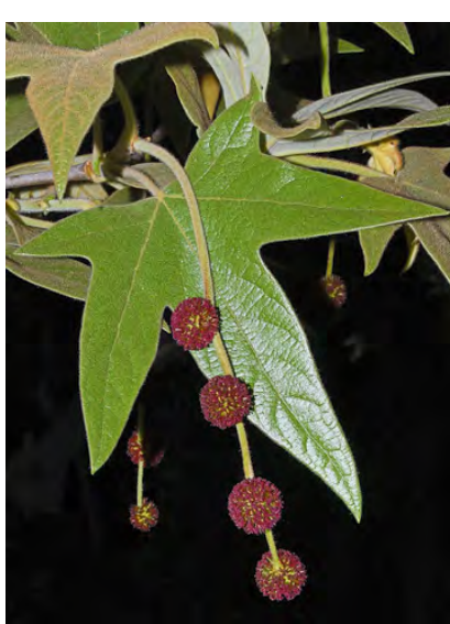
WESTERN SYCAMORE (Platanus racemosa) Native Perennial - Sycamore Family - (Feb–Apr) -Common. Streamsides, canyons, arroyos - Tree 33-115' tall. Bark peeling pale. Leaf blades 4-10" long, palmately lobed, smooth to hairy above, short-woolly under.