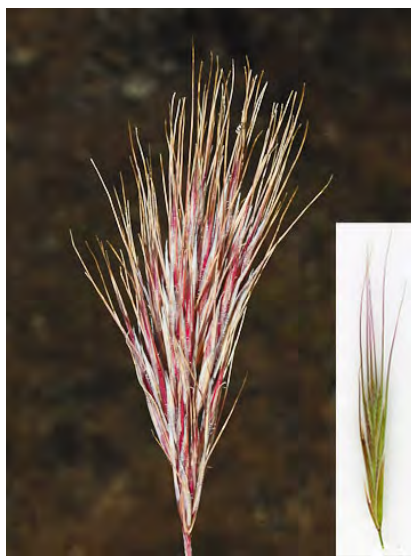
RED BROME (Bromus madritensis subsp. rubens) Naturalized Annual - Grass Family - (Mar–Jun) - Disturbed areas, roadsides - Plant 4-20". Flower cluster condensed, branches obscure, < spikelets. Stem & sheathes hairy. INVASIVE weed.