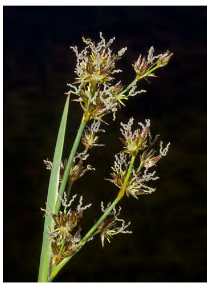
IRIS-LEAVED RUSH (Juncus xiphioides) Native Perennial - Rush Family - (Jul-Oct) - Wet places - Plant 16-32" tall. Leaf blades 0.2-0.5" wide, flat, Iris-like. Heads many, few-flowered. Anthers 6, < filaments, flowers self-pollinating.