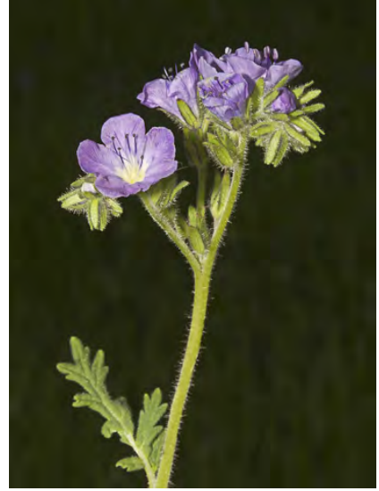
FIELD PHACELIA (Phacelia ciliata) Native Annual - Borage Family - (Feb–Jun) - Clay or gravelly slopes in grassland, fields - Plant 4-22" tall. Leaves deeply lobed to divided. Flowers 0.3-0.4" long, purple. Flower bracts large w/raised veins. Seeds 4.