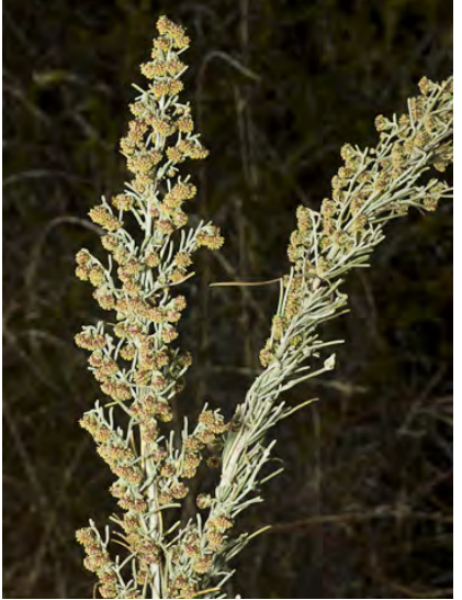
CALIFORNIA SAGEBRUSH (Artemisia californica) Native Perennial - Sunflower Family -(Aug-Nov) - Coastal scrub, chaparral, open woodland - Shrub 2-8.5' tall, rounded. Leaves 0.4-4", hairy, thread-like, It green to gray. Flower heads < 5 mm wide. Sage-scented.