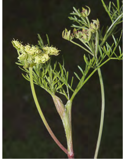
ALKALI DESERTPARSLEY (Lomatium caruifolium var. caruifolium) Native Perennial - Carrot Family - (Mar–May) - Wet, clay depressions, open grassland - Plant 6-18" tall, gen stemless. Leaves from base, linear segments, no swollen sheathes. Flowers bright yellow.