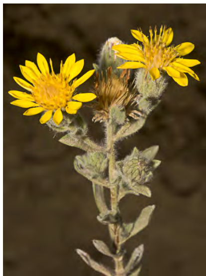
BRISTLY GOLDENASTER (Heterotheca sessiliflora subsp. echioides) Native Perennial - Sunflower Family - (Jul-Oct) - Grassland, scrub, woodland, open forest, disturbed sites - Plant 2-7 dm, bristly. Leaves flat, to 5 cm long, upper reduced. Head bracts not leafy.