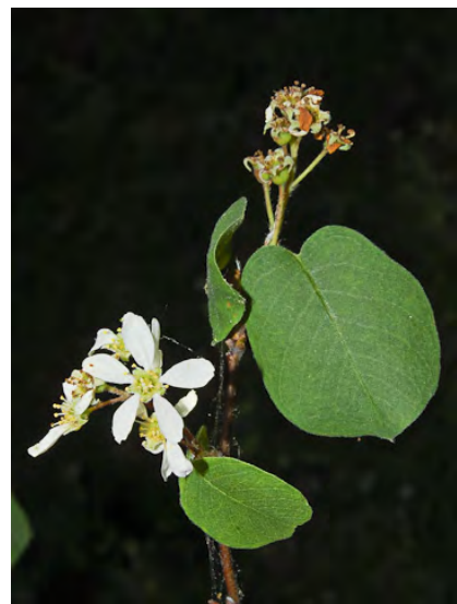
SIERRA PLUM (Prunus subcordata) Native Perennial - Rose Family - (Mar–May) -Mixed-evergreen or conifer forest - Shrub < 10'. Leaf: stem 0.16-0.6", blade 1-2", elliptic to wide egg-shaped, base round heart-shaped, tip round. Petals 0.2-0.4" long, white.