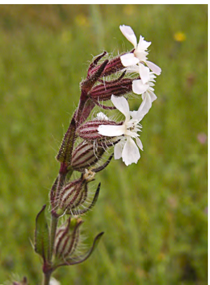
SMALL-FLOWER CATCHFLY (Silene gallica) Naturalized Annual - Pink Family - (Spring-early summer) - Fields, disturbed areas - Plant 4-16". Leaves < 1.4" long. Flower cluster short-hairy, bracts sticky-hairy, petal blade 0.2-0.5" long, smooth to notched, white to pink.