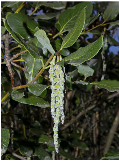
GREEN-LEAF SILK TASSEL (Garrya fremontii) Native Perennial - Silk Tassel Family - (Jan-Apr) - Chaparral, foothill woodland, montane forest -Shrub < 10' tall. Leaves gen hairless below, not wavy-margined. Fruit smooth or w/hairy tip.