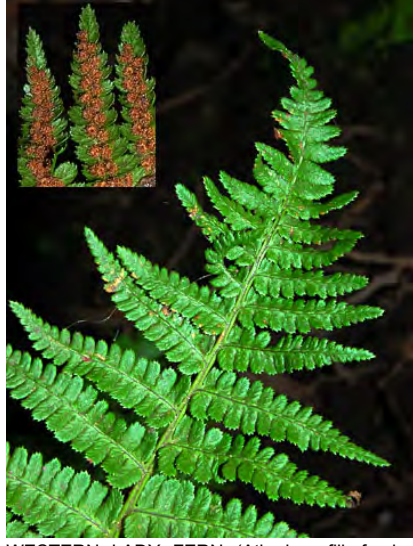
WESTERN LADY FERN (Athyrium filix-femina var. cyclosorum) Native Perennial - Cliff Fern Family - - - Woodland, along streams, seepage area - Leaves gen 12-39" long, broadest near middle, 1-2 divided, ultimate divisions rounded.