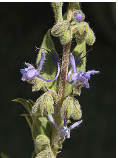
VINEGAR WEED (Trichostema lanceolatum) Native Annual - Mint Family - (Jun-Nov) - Dry, open, gen disturbed habitats - Plant < 39" tall. Leaf blades 0.8-2.8" long, leaf stalk, ~ stalkless. Flowers purple-blue, tube 0.2-0.4" long, curving up. Vinegar scent.