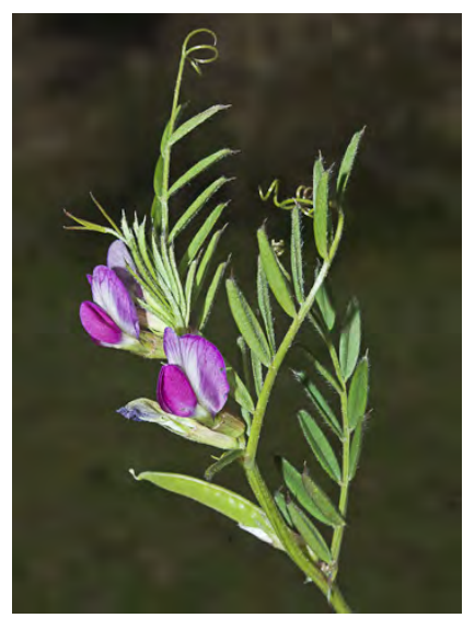
NARROW-LEAVED VETCH (Vicia sativa subsp. nigra) Naturalized Annual - Pea Family - (Mar-Jun) - Roadsides, disturbed areas, grassland, open areas in oak and riparian woodlands - Flowers 1-2 at leaf bases, pink-purple to white, 0.4-0.7" long. Leaflets 0.2-0.3" wide.