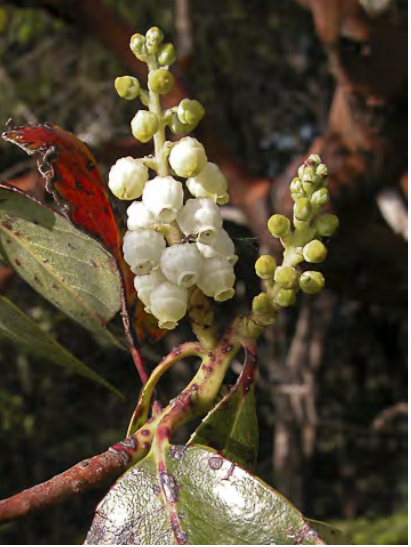
PACIFIC MADRONE (Arbutus menziesii) Native Perennial - Heath Family - (Mar–May) - Conifer, oak forests - Tree < 130' tall, evergreen, peeling red bark. Leaf blades < 5" long. Flowers yellow-white or pink, < 3.1" long. Berries red, < 0.5" diam, round.