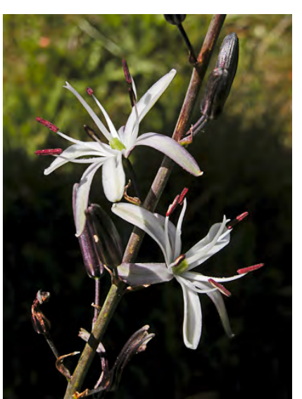
WAVYLEAF SOAP PLANT (Chlorogalum pomeridianum var. pomeridianum) Native Perennial - Century Plant Family - (May–Aug) - Common. Open grassland, chaparral, woodland - Plant 1-8' tall, flowers at night. Bulb juices lather in water.