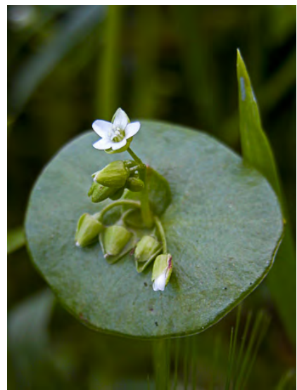
COMMON MINER'S LETTUCE (Claytonia perfoliata subsp. perfoliata) Native Annual - Miner's Lettuce Family - (Jan-May) - Vernally moist, often shady or disturbed sites - Basal leaf length <3x width. Stem leaf gen not angled. Seeds shiny w/large appendage.