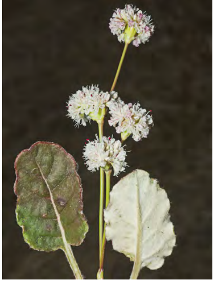
EAR-SHAPED WILD BUCKWHEAT (Eriogonum nudum var. auriculatum) Native Perennial - Buckwheat Family - (May—Oct) - Common. Sand or gravel - Plant 5-15 dm. Leaves on stem, curled. Inflor smooth. Flowers white to pink, smooth.