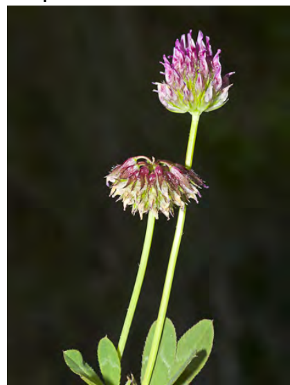
FOOTHILL CLOVER (Trifolium ciliolatum) Native Annual - Pea Family - (Mar—Jun) - Locally common. Grassland, chaparral, disturbed areas - Flower head 0.3-0.8" wide w/vestigial bract. Flowers pink to purple, soon reflexed, bracts w/short, flat bristles.