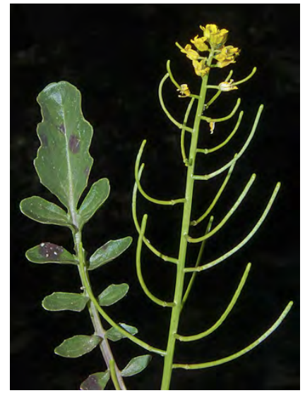
ERECT-POD WINTER CRESS (Barbarea orthoceras) Native Perennial - Mustard Family - (Mar–Jul) - Meadows, streambanks, moist woodland, grassland - Stem 8-24". Lower leaves w/large terminal lobe, upper clasping stem. Petals bright yellow, 0.2-0.3" long.