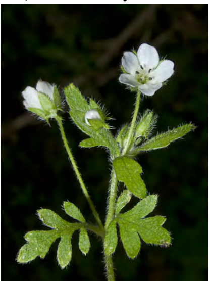
VARIABLE-LEAF NEMOPHILA (Nemophila heterophylla) Native Annual - Borage Family - (Feb-Jun) - Common. Forest, chaparral, roadsides, streambanks - Flower 0.1-0.4" long, unspotted, bract appendages < 0.04" long in fruit.