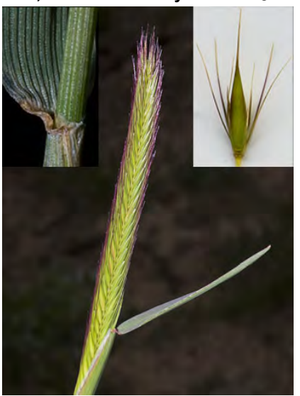
NORTHERN BARLEY (Hordeum brachyantherum subsp. brachyantherum) Native Perennial - Grass Family - (May-Aug) - Meadows, pastures, streambanks - Stem 1-3' tall, gen robust. Leaf sheaths gen smooth, blade < 7.5" long. Lemma awn < 0.25".