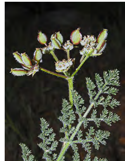
WOOLLY FRUITED DESERTPARSLEY (Lomatium dasycarpum subsp. dasycarpum) Native Perennial - Carrot Family - (Mar–Jun) - Rocky (gen serpentine), chaparral, woodland - Plant 4-20", short-hairy. Flowers greenish-white, petals and fruit hairy.