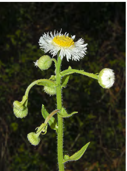
PHILADELPHIA FLEABANE (Erigeron philadelphicus var. philadelphicus) Native Biennial-Perennial - Sunflower Family - (May–Jun) - Streamsides, other moist habitats - Plant 10-32" tall. Disk yellow. Rays 150-400, narrow, white to pink. Leaves clasping.