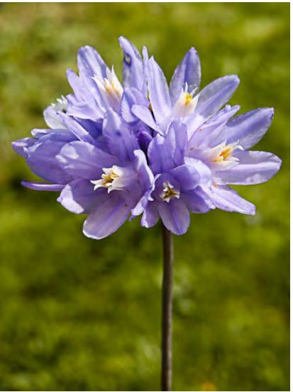
BLUE DICKS (Dichelostemma capitatum subsp. capitatum) Native Perennial - Brodiaea Family - (Mar-Jun) - Open woodland, scrub, desert, grassland - Plant 2-28" tall. Flowers blue-purple, not narrowed in the middle. Stamens 6. Early spring bloomer.