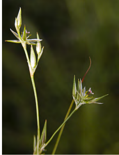
TOAD RUSH (Juncus bufonius var. bufonius) Native Annual - Rush Family - (May-Sep) - Damp sunny ground, gen disturbed - Stem gen 1-4" tall, gen brached from base, ~0.04" wide. Flower cluster open. Flowers 0.16-0.3" long.