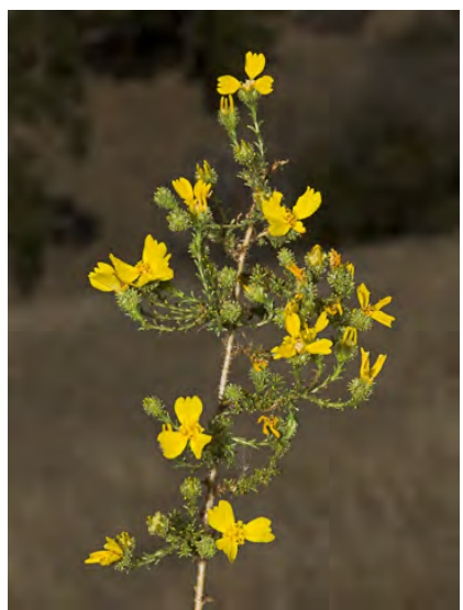
SAN JOAQUIN TARPLANT (Holocarpha obconica) Native Annual - Sunflower Family - (Apr-Nov) - Grassland - Plant 4-32" tall, outer portion sticky. Flower heads in flat-topped or open clusters. Ray flowers 4-9; disk flowers 11-21, anthers yellow to brown.