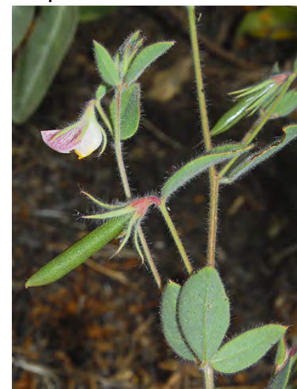
SPANISH CLOVER (Acmispon americanus var. americanus) Native Annual - Pea Family - (May-Oct) - Coast, chaparral, waterways, roadsides, disurbed areas - Plant 2-24", hairy. Flowers white to pink, solitary, bract lobes >> flower tube.