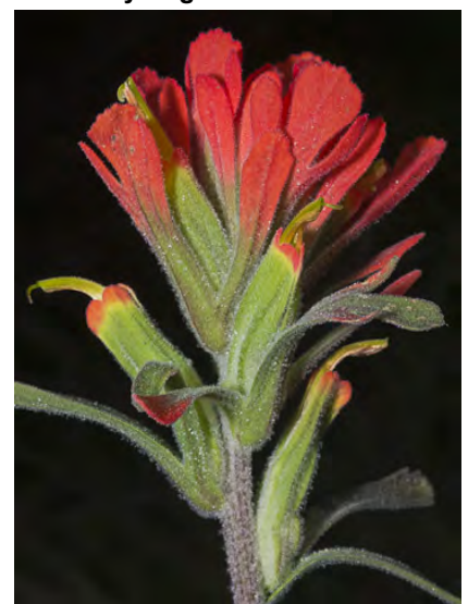
WOOLLY PAINTBRUSH (Castilleja foliolosa) Native Perennial - Broom-rape Family -(Mar-Jun) - Dry, open, rocky slopes, edges of chaparral - Plant 1-2' tall, base slightly woody, much branched, woolly. Flower cluster orange-red (occas. yellow-green).