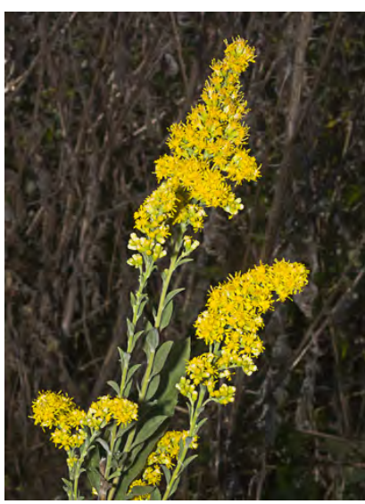
CALIFORNIA GOLDENROD (Solidago velutina subsp. californica) Native Perennial - Sunflower Family - (May–Nov) - Woodland margins, grassland, disturbed soils - Stem 8-60" tall. Gen densely short-soft-hairy. Flower cluster height 2-4x width.