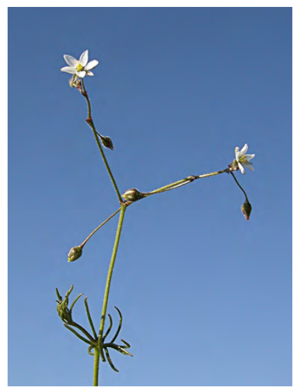
STICKWORT (Spergula arvensis) Naturalized Annual - Pink Family - (Spring-early summer) - Open slopes, pine woodland, sand dunes, fields, disturbed areas - Stem 4-16"+. Leaves 0.4-2" long, linear, in whorls.