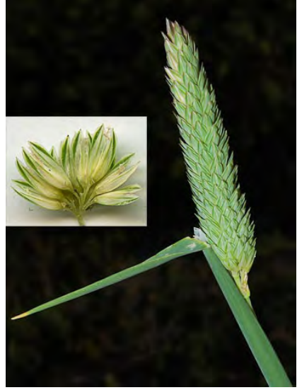
HARDING GRASS (Phalaris aquatica) Naturalized Perennial - Grass Family - (Apr-Aug) - Disturbed areas, roadsides - Plant 16-79" tall, tufted. Flower cluster 0.6-6" long, unbranched. Lower florets 1 or or unequal. Glume wing untoothed. INVASIVE weed.