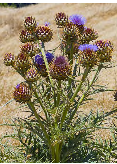
ARTICHOKE THISTLE (Cynara cardunculus subsp. flavescens) Naturalized Perennial - Sunflower Family - (Apr–Jul) - Disturbed places - Plant 1.6-8' tall. Artichoke head 1.6-6" diam, spine-tipped. Flowers blue or purple, 1.2-2" long. NOXIOUS weed.