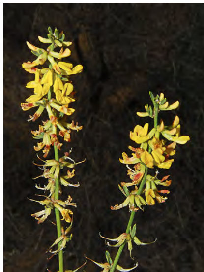
DEERWEED (Acmispon glaber var. glaber) Native Perennial - Pea Family - (Mar–Aug) -Chaparral, roadsides, coastal sands; common -Often shrubby, leaflets 3-6, many clusters of 3-7 stemless flowers, yellow fading to orange-red, 0.3-0.5" long.