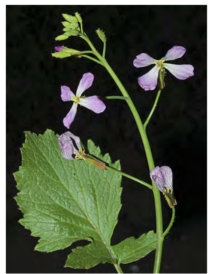
RADISH (Raphanus sativus) Naturalized Annual - Mustard Family - (May–Jul) - Disturbed areas, fields - Stem 16-51" long. Petals 0.6-1" long, white to purple. Fruit a fat cylinder w/constrictions between seeds. INVASIVE weed.