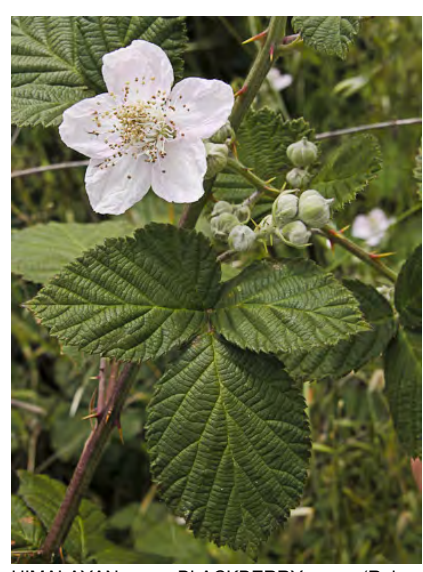
HIMALAYAN BLACKBERRY (Rubus armeniacus) Naturalized Perennial - Rose Family - (Mar–Jun) - Common. Disturbed areas, roadsides - Shrub w/thorny 5-angled stem. Leaflets 3-5, white-hairy beneath. Blackberry-type fruit. INVASIVE.