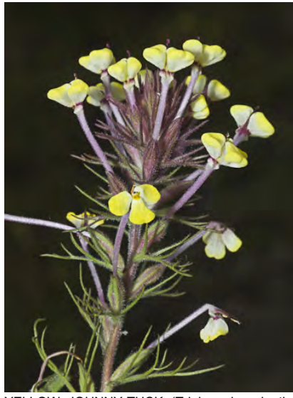
YELLOW JOHNNY-TUCK (Triphysaria eriantha subsp. eriantha) Native Annual - Broom-rape Family - (Mar–May) - Grassland, foothills - Plant 4-14" tall, purple. Leaves 0.4-2" long, 3-7 lobed. Flowers yellow with dark purple beak, 0.4-1" long.