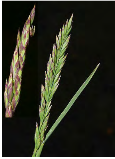
ONE-SIDED BLUE GRASS (Poa secunda subsp. secunda) Native Perennial - Grass Family - (Mar-Aug) - Common. Dry slopes to saline/alkaline meadows to alpine - Plant 6-40" tall, densely tufted. Flower clusters congested. Spikelets gen 0.3-0.4" long. Lemmas 0.16-0.2" long, backs rounded.