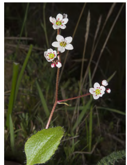
CALIFORNIA SAXIFRAGE (Micranthes californica) Native Perennial - Saxifrage Family - (Feb-May(Jun)) - Moist, shady places - Plant 6-14" tall. Leaves 1.6-4" long, at base, egg-shaped, >= 0.08" wide, toothed. Petals white, 0.1-0.18" long.