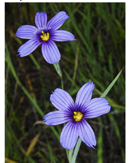
WESTERN BLUE-EYED-GRASS (Sisyrinchium bellum) Native Perennial - Iris Family - (Mar-May) - Common. Open, gen moist, grassy areas, woodland - Stem < 25" tall. Leaves iris-like. Petals 6, blue-purple with dark veins, 0.4-0.7" long.