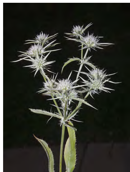
BUTTON CELERY (Eryngium jepsonii) Native Perennial - Carrot Family - (Apr-Aug) - Moist clay soil, vernal pools, lake shores, drying lakes, wet depressions - Leaf blade toothed-irreg lobed. Sepals 0.1", smooth-edged. Flowers white to blue or purple.