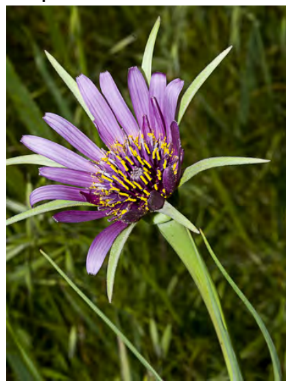
PURPLE SALSIFY (Tragopogon porrifolius) Naturalized Biennial-Perennial - Sunflower Family - (Mar–Nov) - Common. Disturbed places - Plant 16-39" tall, milky sap. Leaves 0.8-1.6" long, very narrow, waxy blue. Flowers purple.