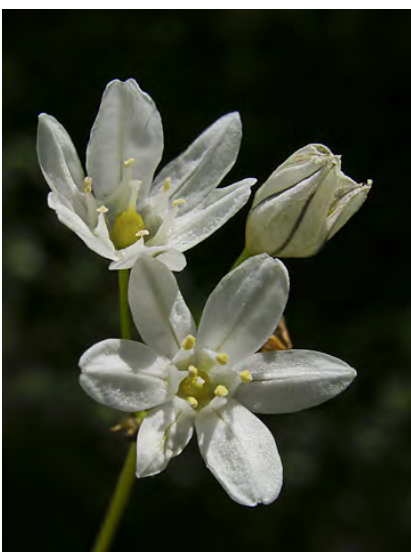
FOOL'S ONION (Triteleia hyacinthina) Native Perennial - Brodiaea Family - (Mar–Jul) - Grassland, vernally wet meadows, occ drier slopes - Flowering stem 1-2' tall. Leaves 4-16", 0.16-0.9" wide. Flower stalks 0.2-0.6" long. Flowers white, 0.35-0.6" long.