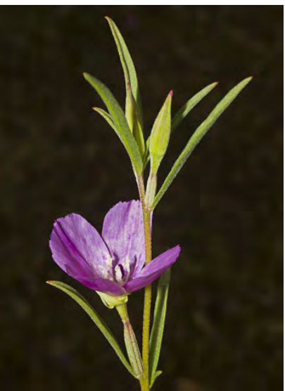
SMALL CLARKIA (Clarkia affinis) Native Annual - Evening Primrose Family - (May–Jun) - Openings in woodland, chaparral - Stem < 32". Buds erect, ovary 8-grooved, sepals united on side. Petals 0.2-0.6" long, pale pink to dark wine-red, often purple-flecked.