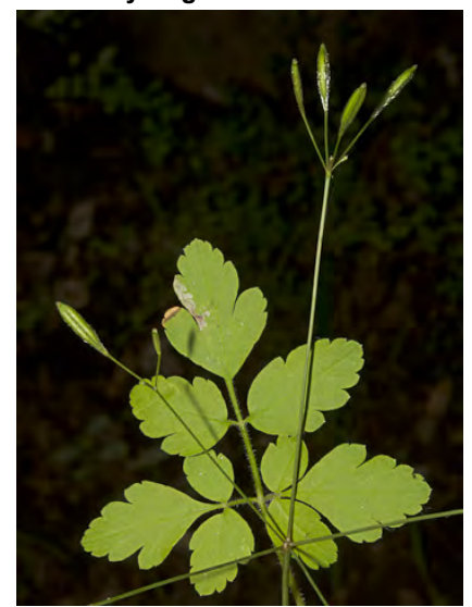
SWEET-CICELY (Osmorhiza berteroi) Native Perennial - Carrot Family - (Apr–Jul) - Conifer forest, woodland, disturbed areas - Plant 12-47". Leaflets in 3s, serrate to irreg lobed. Flower white. Fruit 0.5-1", upward pointing barbs, splitting apart below.