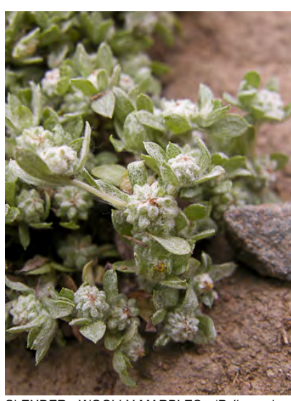
SLENDER WOOLLY-MARBLES (Psilocarphus tenellus) Native Annual - Sunflower Family - (Mar–Jul) - Common. Dry, seasonally moist slopes, flats, burns, trails, rarely vernal pools - Plant hairy. Leaves spoon-shaped. Disk flowers 4-lobed.