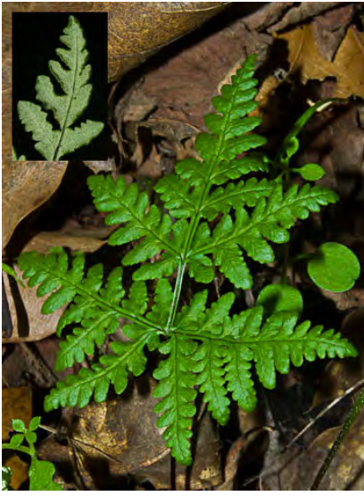
GOLDENBACK FERN (Pentagramma triangularis subsp. triangularis) Native Perennial - Brake Fern Family - - - Gen shaded, sometimes rocky or wooded areas - Leaves triangular, 1.2-4" long, undersides either granular green or powdery gold.