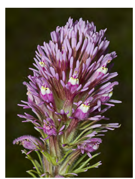
PURPLE OWL'S-CLOVER (Castilleja exserta subsp. exserta) Native Annual - Broom-rape Family - (Mar-May) - Open fields, grassland - Plant sticky, short-hairy. Flower cluster tipped white, pale yellow or rose. Flower upper lip hooked, fuzzy.