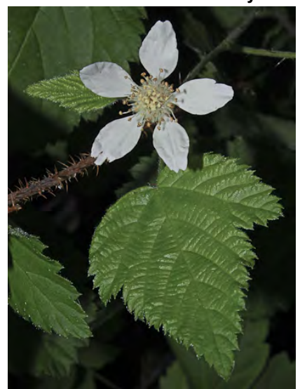
CALIFORNIA BLACKBERRY (Rubus ursinus) Native Perennial - Rose Family - (Mar-Jul) -Open, disturbed areas - Stem round, bristly/prickly. Leaves simple to 3 leaflets, underside green. Plants unisexual. Petals 0.24-0.6" long, white. Blackberry-type fruit.