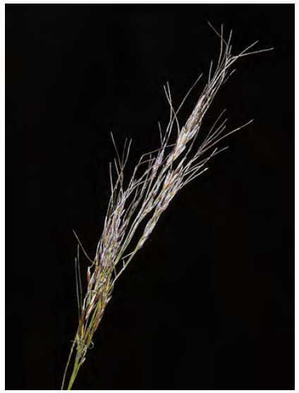
FOOTHILL NEEDLE GRASS (Stipa lepida) Native Perennial - Grass Family - (Mar–Jun) - Dry slopes, chaparral, grassland, savanna, coastal scrub - Stem 14-39" tall. Leaf blade 4.7-9.1" long, narrow. Glumes 0.2-0.6" long. Awn 0.8-2" long.