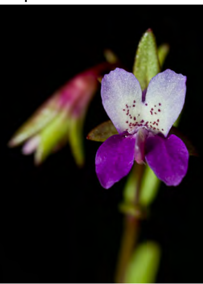
FEW-FLOWERED COLLINSIA (Collinsia sparsiflora var. collina) Native Annual - Plantain Family - (Mar–Apr) - Disturbed grassy fields, roadbanks, open chaparral, open oak and dry mixed woodland - Flowers 0.2-0.3" long, purple, pouch hidden by calyx.