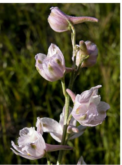
PALE-FLOWERED WESTERN LARKSPUR (Delphinium hesperium subsp. pallescens) Native Perennial - Buttercup Family - (Mar–May) - Oak woodland, e slope coast ranges - Plant gen 16-32" w/short-hairy base. Flowers white, pinkish or It blue.