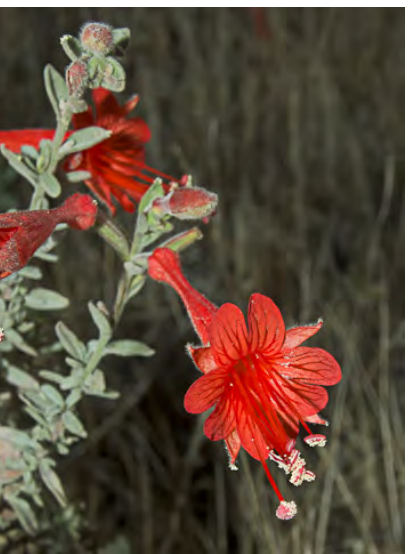
CALIFORNIA FUCHSIA (Epilobium canum subsp. canum) Native Perennial - Evening Primrose Family - (Jun-Dec) - Dry slopes, ridges - Plant hairy, gen sticky with a woody base. Leaf 0.3-2.8" long, gray to green. Flowers red-orange, floral tube 0.8-1.2" long.