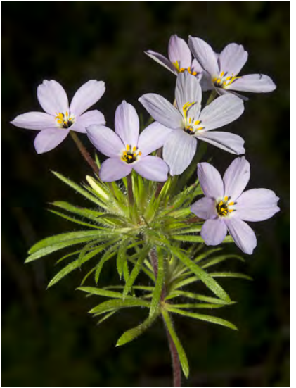
PINKLOBE LEPTOSIPHON (Leptosiphon androsaceus) Native Annual - Phlox Family - (Apr–Jun) - Open or shaded areas in woodland, chaparral - Plant 2-18", hairy. Flowers pink, bracted group, tube 0.4-1.3" long, lobes gen > 0.3" long.