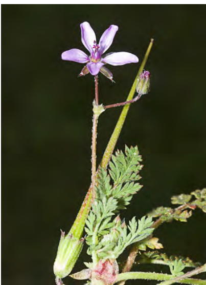
REDSTEM FILAREE (Erodium cicutarium) Naturalized Annual - Geranium Family (Feb-Sep) - Open, disturbed sites, grassland, scrub - Stem 4-20". Leaves compound, leaflets dissected. Sepal tip bristly. Petal pink to purple. Fruit beak 0.8-2". INVASIVE.