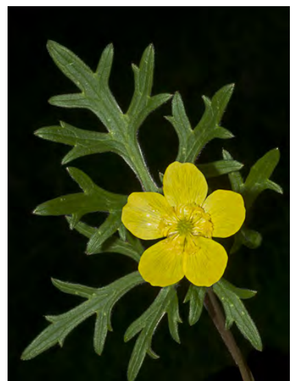
WESTERN BUTTERCUP (Ranunculus occidentalis var. occidentalis) Native Perennial - Buttercup Family - (Mar–Jul) - Grassy slopes in meadows or open woodland - Plant 4-24". Basal leaves partly divided. Petals 5-6, 0.2-0.4" long. Fruit wishort bristles.