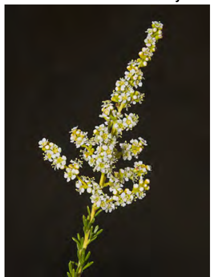
CHAMISE (Adenostoma fasciculatum var. fasciculatum) Native Perennial - Rose Family -(May-Jun) - Dry slopes, ridges, chaparral - Shrub or small tree < 13' tall. Flowers cream to white. Leaves narrow, shiny with flammable oils in warm weather.