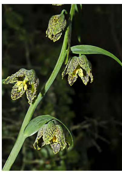
CHECKER LILY (Fritillaria affinis) Native Perennial - Lily Family - (Mar–Jun) - Common. Oak or pine scrub, grassland - Stem 4-47" tall. Leaves 1.6-6.3" long, whorled below. Petals mottled brown-purple and yellow-green, 0.4-1.6" long.