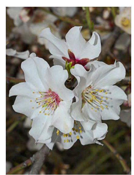
ALMOND (Prunus dulcis) Naturalized Perennial -Rose Family - (Feb-Mar) - Canyons, roadsides, grassland (as waif) - Tree 16-26' tall. Leaf blades 1-4" long. Flowers 1-3/cluster. Petals pink to nearly white, 0.5-1" long. Fruit 1-1.6" long, hairy. Cultivar.