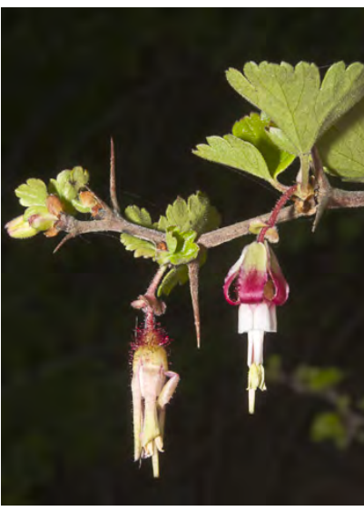
HILLSIDE GOOSEBERRY (Ribes californicum var. californicum) Native Perennial - Gooseberry Family - (Feb-Mar) - Forest openings, woodland - Shrub < 5' tall. Leaf blades 0.4-1.2" long, not sticky. Sepals greenish, petals 0.12" long, white.