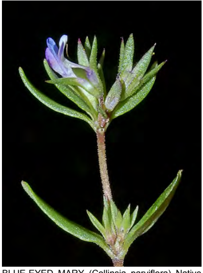
BLUE-EYED MARY (Collinsia parviflora) Native Annual - Plantain Family - (Mar–Jul) - Common. Moist, ± shady places, montane - Plant 1-16" tall. Flowers 0.16-0.3" long; tube, throat and upper lip white; lobes gen blue; hidden in upper leaves.