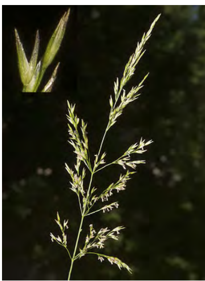
DUNE BENT GRASS (Agrostis pallens) Native Perennial - Grass Family - (Jun-Aug) - Common. Open meadows, woodland, forest, subalpine - Lower leaf blades <= 0.2" wide, flat to inrolled. Flower cluster 2-8" long, < 0.8" wide; narrow and arching when young.