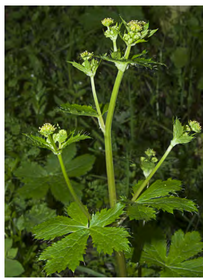
PACIFIC WOODLAND SANICLE (Sanicula crassicaulis) Native Perennial - Carrot Family - (Mar–May) - Open slopes, ravines, woodland - Plants stout, 9-47". Leaves 1-5" across with 3-5 deep, palmate lobes and serrate edges. Flowers yellow.