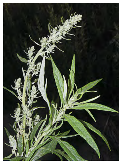
MUGWORT (Artemisia douglasiana) Native Perennial - Sunflower Family - (May–Nov) - Common. Open to shady areas, often in drainages - Plant 20-60" tall. Leaves gen 0.4-4" long, densely hairy below, some 3-5 lobed. Flower bracts hairy.