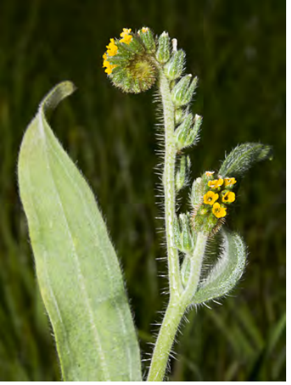
SMALL-FLOWERED FIDDLENECK (Amsinckia menziesii) Native Annual - Borage Family - (May-Jul) - Shade-tolerant, open, disturbed areas at forest/woodland edges - Flowers yellow to orange-yellow, generally spotted, 0.2-0.3" long, 0.1" wide. Leaves coarse-hairy.