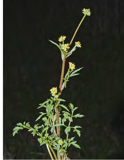
POISON SANICLE (Sanicula bipinnata) Native Perennial - Carrot Family - (Apr-May) - Open grassland or pine/oak woodland - Plants 5-24" tall. Leaves 2x pinnate. Flowers yellow, male flower stalk < fruit. Reported to be slightly TOXIC.