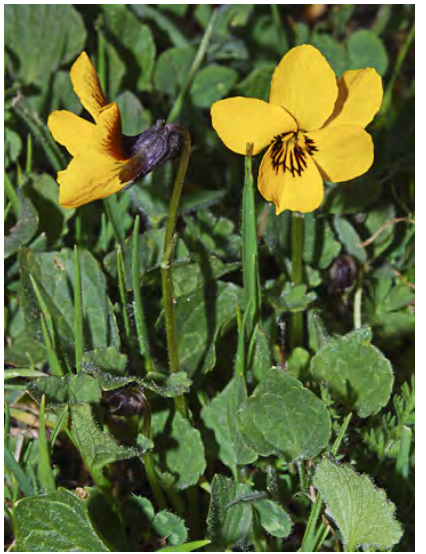
JOHNNY-JUMP-UP (Viola pedunculata) Native Perennial - Violet Family - (Feb-Apr) - Open, grassy slopes, hillsides, chaparral, oak woodland, gen full sun - Plant 2-15" tall. No basal leaves. Petals gold-yellow, lower 3 brown-veined, upper 2 red-brown on back.