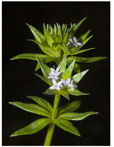
FIELD MADDER (Sherardia arvensis) Naturalized Annual - Madder Family - (Mar–Jul) -Pastures, disturbed areas, grassland, dry meadows, oak woodland - Stem 2.8-6.3" long. Leaves in whorls of 5-6, 0.2-0.5" long. Flowers pink or lavender, the 4 lobes < tube.