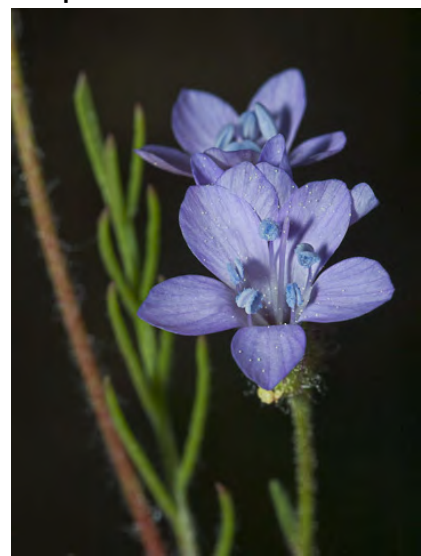
MANY-STEM CALIFORNIA GILIA (Gilia achilleifolia subsp. multicaulis) Native Annual - Phlox Family - (Feb-Jun) - Open or shaded, gen grassy places, sandy or rocky soil - Leaves linear-lobed. Flowers white to lavender, 0.2-0.4" long, not in heads.