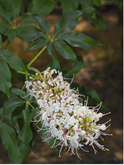
CALIFORNIA BUCKEYE (Aesculus californica) Native Perennial - Soapberry Family - (May-Jun) or tree 13-39' tall. 5-7 leaflets. Flowers white to pale rose. Large seeds toxic but edible after leaching out saponins.