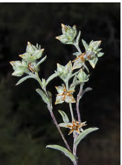
DAGGERLEAF COTTONROSE (Logfia gallica) Naturalized Annual - Sunflower Family - (Mar-Jul) - Bare or grassy openings, burns - Plant 1-20" tall, gen cobwebby. Leaves awl-shaped, stiff, > flower heads. Flowers brown to yellow.