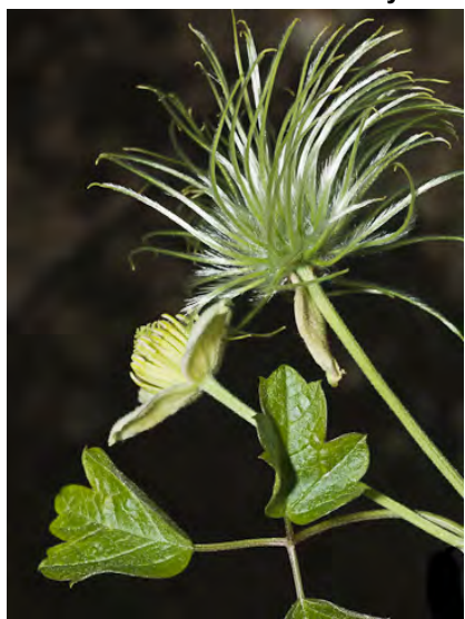
CHAPARRAL CLEMATIS (Clematis lasiantha) Native Perennial - Buttercup Family - (Jan-Jun) -Hillsides, chaparral, open woodland - Woody vine. Leaflets 3-5, +-3-lobed. Flowers gen 1, in spring; sepals white to cream, 0.4-0.8" long.