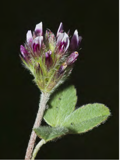
RANCHERIA CLOVER (Trifolium albopurpureum) Native Annual - Pea Family - (Mar–Jun) - Abundant. Dunes, grassland, wet meadows, slopes, disturbed areas, etc - No head bract. Flowers purple + white, 0.2-0.3", no stalk. Flower bracts hairy, teeth linear, = flowers.