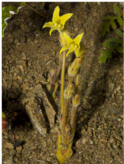
CLUSTERED BROOMRAPE (Orobanche fasciculata) Native Perennial - Broom-rape Family - (Apr–Jul) - Dry, gen bare places. Root parasite on various shrubs - Plant 2-8" tall. Flowers pink or yellow, 5-20 on long stems.