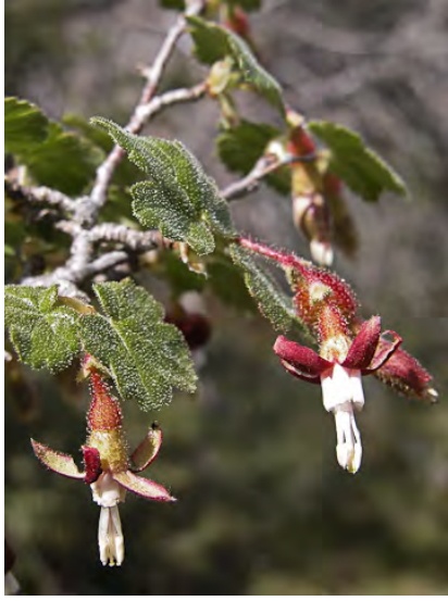
CANYON GOOSEBERRY (Ribes menziesii var. menziesii) Native Perennial - Gooseberry Family - (Feb-Apr) - Common. Forest openings, chaparral - Shrub < 10', prickly. Leaves sticky below. Styles glabrous, anthers exserted, sepals