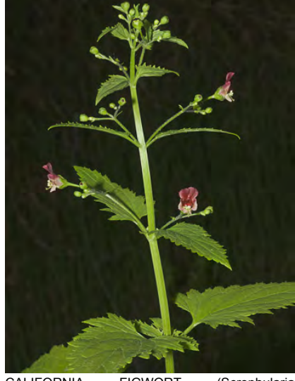
CALIFORNIA FIGWORT (Scrophularia californica) Native Perennial - Snapdragon Family - (Mar-Jul) - Common; damp places, chaparral, roadsides - Stem 2.6-4' tall, square x-section. Leaves opposite, to 7" long, triangular, toothed. Flowers 0.3-0.5" long, upper lips red to maroon, lower paler or yellowish.