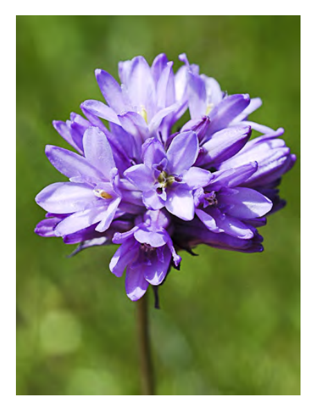
FORK-TOOTHED OOKOW (Dichelostemma congestum) Native Perennial - Brodiaea Family - (Apr-Jun) - Open woodland, grassland - Plant 12-35" tall. Flowers blue-purple, narrowed above ovary. Stamens 3. Late spring bloomer.