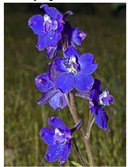
ROYAL LARKSPUR (Delphinium variegatum subsp. variegatum) Native Perennial - Buttercup Family - (Mar–May) - Grassland, open oak woodland - Stem < 24" w/spreading hairs. Leaves w/finger-like segments. Flowers dark royal blue, large and few.