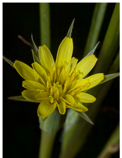
SILVERPUFFS (Uropappus lindleyi) Native Annual - Sunflower Family - (Mar–May) - Common. Open grassland, woodland, chaparral, deserts, gen in loose soils - Heads pale yellow, never nod. Outer head bracts always > 1/4 inner length. Pappus scale notched.