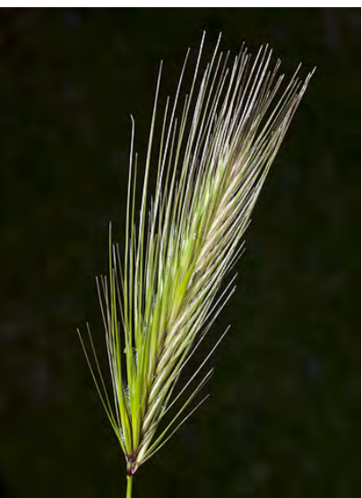
WALL BARLEY (Hordeum murinum subsp. murinum) Naturalized Annual - Grass Family - (Feb-May) - Moist, gen disturbed sites - Stem 1-2'. Leaf auricles notable. Central spikelet stalk 0-0.02". Central floret gen = lateral florets. INVASIVE weed.