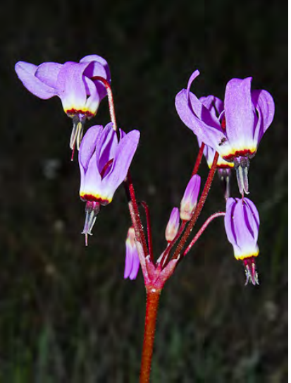
MOSQUITOBILLS SHOOTING STAR (Dodecatheon hendersonii) Native Perennial - Primrose Family - (Mar–Jul) - Gen in shady sites - Leaf blade length generally <2x width. Flower parts 4s or 5s. Filament tube solid black.