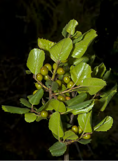
HOLLYLEAF REDBERRY (Rhamnus ilicifolia) Native Perennial - Buckthorn Family - (Mar–Jun) -Chaparral, montane forest - Shrub < 13' tall, evergreen w/stiff branches. Leaf blades 0.8-1.6" long, toothed. Fruits 0.2-0.3" wide, red.