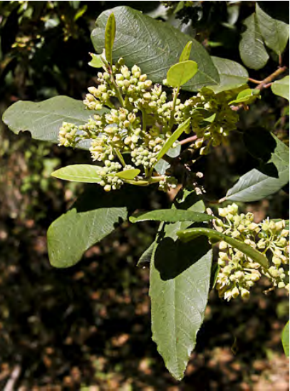
CALIFORNIA COFFEE BERRY (Frangula californica subsp. californica) Native Perennial - Buckthorn Family - (May–Jul) - Coastal-sage scrub, chaparral, forest, woodland - Shrub < 16' tall. Flowers greenish. Leaves smooth beneath.