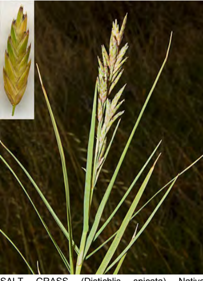
SALT GRASS (Distichlis spicata) Perennial - Grass Family - (Apr-Sep) - Salt marshes, coastal dunes, moist, alkaline areas -Stem 4-20" long. Leaves 0.8-4" long, flat, stiff. Flower cluster 0.8-3" long, narrow. Spikelets straw-colored to purple, 2-20/group, 0.24-0.8"