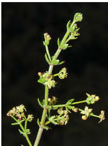
CLIMBING BEDSTRAW (Galium porrigens var. porrigens) Native Perennial - Madder Family - (May-Aug) - Among shrubs in chaparral, forest - Stem 4-59" long. Leaves 0.1-0.7" long, oval to egg-shaped, in whorls of 4. Flowers yellow to red, 4-lobed.