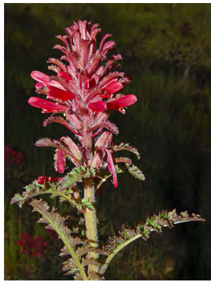
WARRIOR'S PLUME (Pedicularis densiflora) Native Perennial - Broom-rape Family - (Mar–May) - Dry chaparral, oak/pine forest - Hairy. Stem 2.4-22". Basal leaves 5-28 cm long, 13-41 segments. Flowers deep-red to red-purple, 0.9-1.4" long, lower lip 1/8th upper.