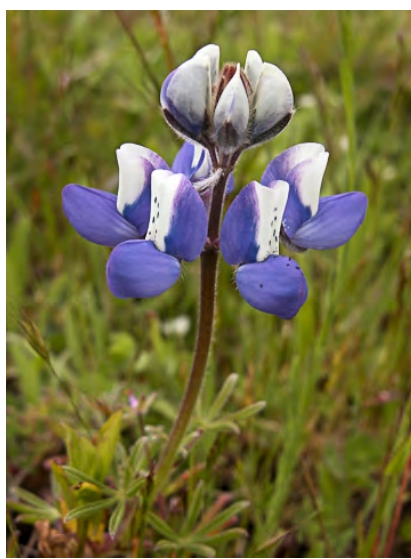
SKY LUPINE (Lupinus nanus) Native Annual -Pea Family - (Mar–Jun) - Abundant. Open or disturbed areas - Plant 4-24" tall, hairy. Flowers blue to pink to white, 0.2-0.6" long; banner as wide as long. Flower stalk gen > 0.12" long.