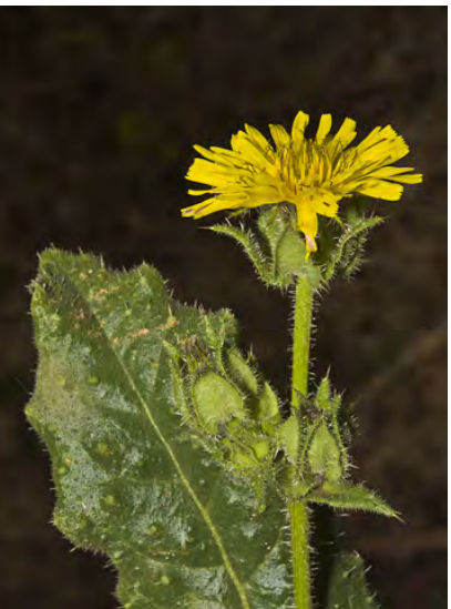
BRISTLY OX-TONGUE (Helminthotheca echioides) Naturalized Annual-Biennial - Sunflower Family - (All year) - Common. Disturbed areas - Stem 1-6.5' tall, bristly. Leaf 2-8" long, covered with prickly bumps. Flower heads 0.8-1.6" wide. INVASIVE weed.