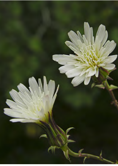
CALIFORNIA CHICORY (Rafinesquia californica) Native Annual - Sunflower Family - (Apr–Jul) -Open sites in scrub, woodland; often common after fire - Stem 2-15+ dm. Flower heads 0.8-1.2" wide, solitary. Rays white or cream, extend 0.2-0.3" beyond bracts.