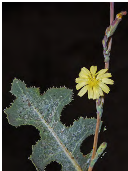
PRICKLY LETTUCE (Lactuca serriola) Naturalized Annual - Sunflower Family (May–Oct) - Abundant. Disturbed places - Stem 1.6-10' tall, prickly-bristly. Leaves deeply-lobed, midvein and edges prickly-bristly. Flowers pale yellow, 0.16-0.2" wide.