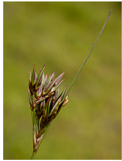
WESTERN RUSH (Juncus occidentalis) Native Perennial - Rush Family - (May–Sep) - Moist gen sunny areas - Plant 1-2' tall, tufted, stiff. Flower cluster gen tightly clustered. Leaves basal, < 1/2 stem length, 'petals' > 0.16".