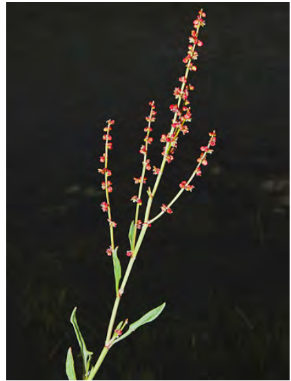
SHEEP SORREL (Rumex acetosella) Naturalized Perennial - Buckwheat Family - (Åpr–Jul) - ± Disturbed, often acidic places - Stem < 16". Leaf gen basal, blade 0.8-2.4" long, lower arrowhead-shaped w/2 lobes. Flowers yellowish, turn reddish. INVASIVE.