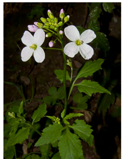
MILK MAIDS (Cardamine californica) Native Perennial - Mustard Family - (Jan–May) - Gen shaded sites, canyons, woodland. One of first spring flowers - Stem 10-24" long. Leaves lobed to compound w/sharp teeth. Petals white or pale rose, 0.3-0.5" long.