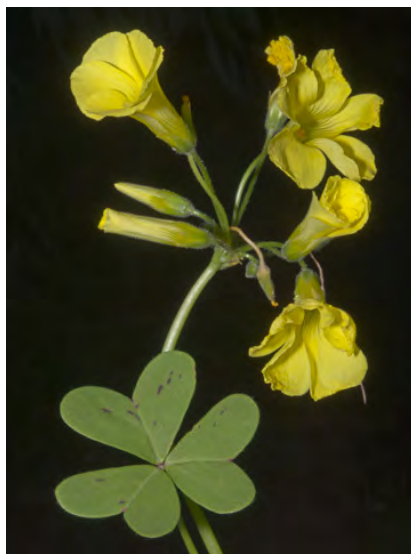
BERMUDA BUTTERCUP (Oxalis pes-caprae) Naturalized Perennial - Oxalis Family (Jan-May) - Disturbed areas, roadsides, grassland, dunes - Flowering stem < 12" tall. Leaflets in 3s, < 1.4" long. Petals yellow, < 1" long. Ornamental. INVASIVE weed.