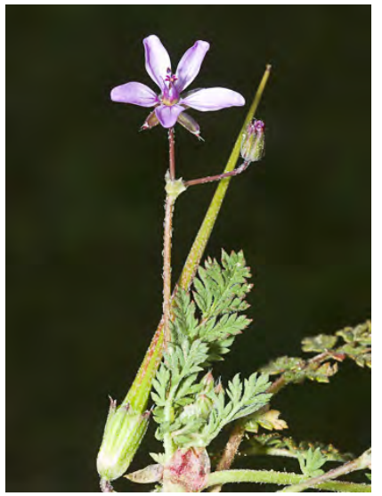
REDSTEM FILAREE (Erodium cicutarium) Naturalized Annual - Geranium Family (Feb-Sep) - Open, disturbed sites, grassland, scrub - Stem 4-20". Leaves compound, leaflets dissected. Sepal tip bristly. Petal pink to purple. Fruit beak 0.8-2". INVASIVE.