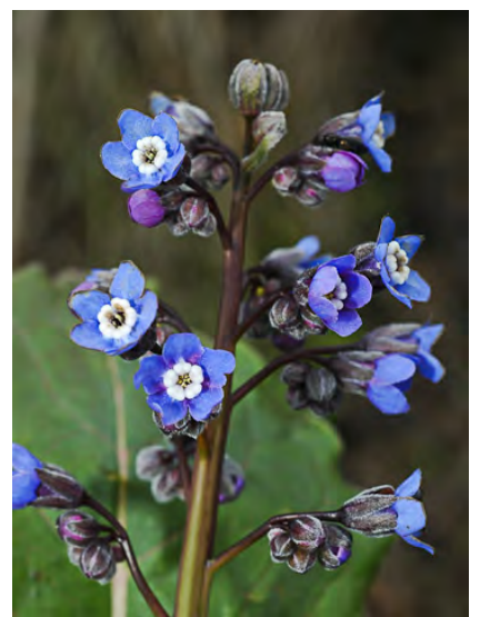
GRAND HOUND'S TONGUE (Cynoglossum grande) Native Perennial - Borage Family - (Feb-May) - Chaparral, woodland - Stem 1-3'. Leaf stalk 3-6". Leaf blade 3-6" cm long, broadly oval. Flowers bright blue w/inner white teeth.