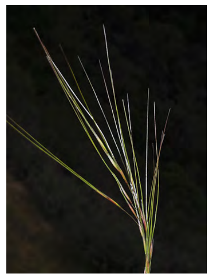
PURPLE NEEDLE GRASS (Stipa pulchra) Native Perennial - Grass Family - (Mar–Jun) - Oak woodland, chaparral, grassland - Stem 14-39" long. Leaf blade 4-8" long. Glumes 0.5-0.8" long, ~equal. Awn 1.6-4" long, last segment straight.