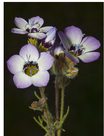
BIRD'S-EYE GILIA (Gilia tricolor subsp. tricolor) Native Annual - Phlox Family - (Mar–May) -Open, grassland, hills, valleys - Stem 3-15" tall, many branched. Flowers not in heads. Petals 0.4\mbox{-}0.75 " long, throat yellow w/purple spots merged into ring.