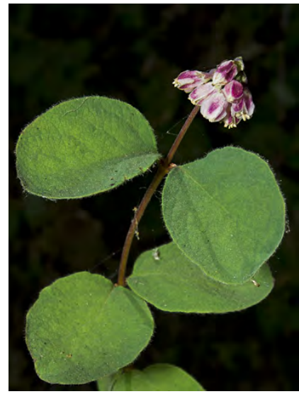
CREEPING SNOWBERRY (Symphoricarpos mollis) Native Perennial - Honeysuckle Family -(Apr–May) - Ridges, slopes, open places in woodland - Shrub 6-24" tall, sprawling. Flowers < 8/cluster, pink + often red outside, 0.16" long, bell-shaped, symetrical.