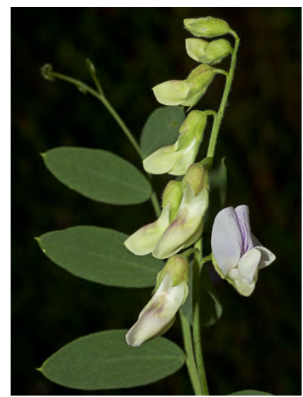
PACIFIC PEA (Lathyrus vestitus var. vestitus) Native Perennial - Pea Family - (Feb—Jul) - North: Conifer forest. South: chaparral & oak woodland -Stem wings to 0.02" wide. Leaves gen elliptic. Flowers 0.5-0.7" long, pale lavender to purple.