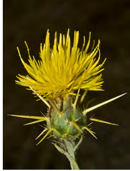
YELLOW STAR-THISTLE (Centaurea solstitialis) Naturalized Annual - Sunflower Family (May-Oct) - Invasive, roadsides, disturbed grassland or woodland - Plant 4-39" tall. Leaves woolly, extend down the stem. Flower bract spines 0.4-1" long. NOXIOUS weed.