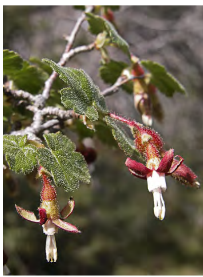
CANYON GOOSEBERRY (Ribes menziesii var. menziesii) Native Perennial - Gooseberry Family - (Feb-Apr) - Common. Forest openings, chaparral - Shrub < 10', prickly. Leaves sticky below. Styles glabrous, anthers exserted, sepals purplish.