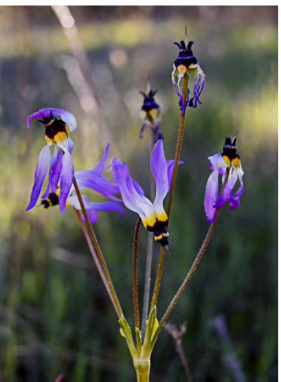
PADRE SHOOTING STAR (Dodecatheon clevelandii subsp. patulum) Native Perennial - Primrose Family - (Mar–May) - Moist places, often on serpentine or in ± alkaline sites - Leaf blade length >2x width. Flowers often white. Filiment tube w/light spots below anthers.