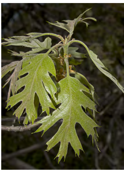
CALIFORNIA BLACK OAK (Quercus kelloggii) Native Perennial - Oak Family - (Apr-May) -Slopes, valleys, woodland, conifer forest - Tree < 80', deciduous. Leaves 3.5-8" long, supple, deeply-lobed, lobes bristle-tipped.