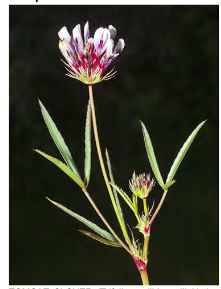
TOMCAT CLOVER (Trifolium willdenovii) Native Annual - Pea Family - (Mar-Jun) - Abundant. Disturbed, gen spring-moist, heavy soils, occas serpentine - Head bract wheel-shaped, sharp-lobed. Leaf narrow. Flowers purple w/white tip, 0.3-0.6" long.