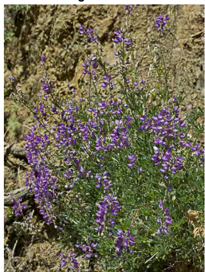
BAY AREA SILVER LUPINE (Lupinus albifrons var. collinus) Native Perennial - Pea Family -(Mar–Jun) - Cliffs, forest openings - Subshrub 8-16" tall, woody only at base, silvery. Flowers 0.35-0.6" long, violet to lavender.