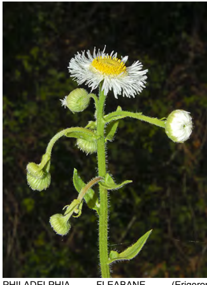
PHILADELPHIA FLEABANE (Erigeron philadelphicus var. philadelphicus) Native Biennial-Perennial - Sunflower Family - (May-Jun) - Streamsides, other moist habitats - Plant 10-32" tall. Disk yellow. Rays 150-400, narrow, white to pink. Leaves clasping.