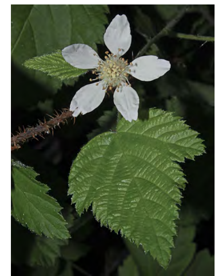
CALIFORNIA BLACKBERRY (Rubus ursinus) Native Perennial - Rose Family - (Mar–Jul) - Open, disturbed areas - Stem round, bristly/prickly. Leaves simple to 3 leaflets, underside green. Plants unisexual. Petals 0.24-0.6" long, white. Blackberry-type fruit.