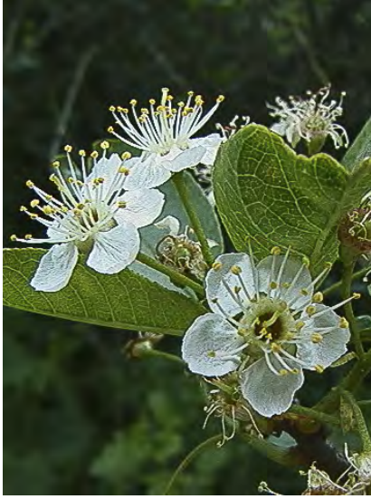
BITTER CHERRY (Prunus emarginata) Native Perennial - Rose Family - (Apr-Jun) - Rocky slopes, canyons, chaparral, mixed-evergreen, conifer forest - Shrub/tree < 50'. Leaf: stem 0.1-0.5", blade 0.6-2.4" long. Petals white, 0.12-0.3" long. Fruit red to purple.