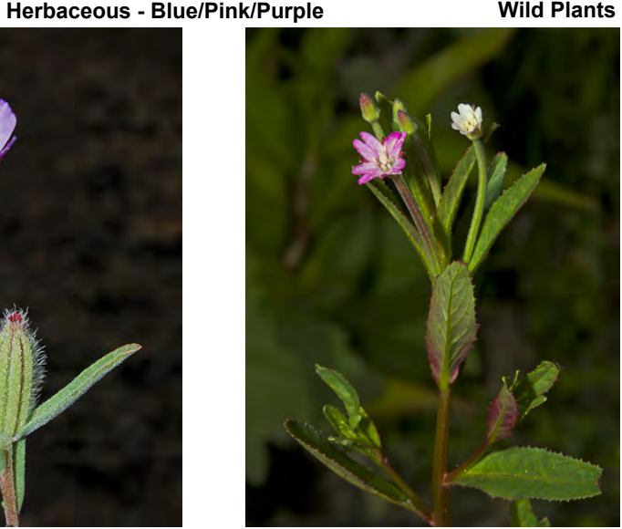
COMMON WILLOWHERB (Epilobium ciliatum subsp. ciliatum) Native Perennial - Evening Primrose Family - (Jun-Oct) - Common. Disturbed places, moist meadows, streambanks, roadsides - Plant 20-48" tall, smooth or short-hairy. Petals 2-6 mm, white to pink.