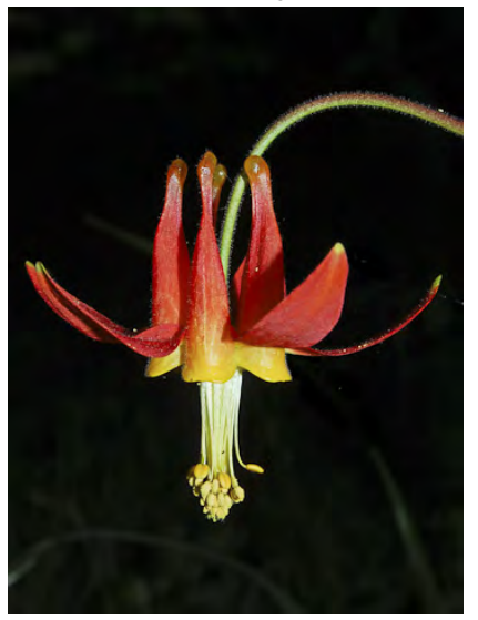
CRIMSON COLUMBINE (Aquilegia formosa) Native Perennial - Buttercup Family - (Apr–Sep) - Streambanks, seeps, moist places, chaparral, oak woodland, mixed-evergreen or conifer forests - Flowers about 2" long, yellow with red sepals & spurs.