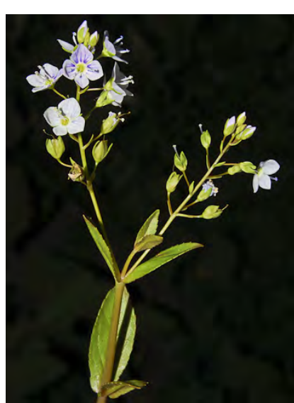
WATER SPEEDWELL (Veronica anagallis-aquatica) Naturalized Perennial - Plantain Family - (May-Sep) - Wet meadows, streambanks, slow streams - Stem 4-24" long. Leaves 0.8-3.1" long, gen stemless. Petals lavender to blue, violet-lined,0.2-0.4" long.