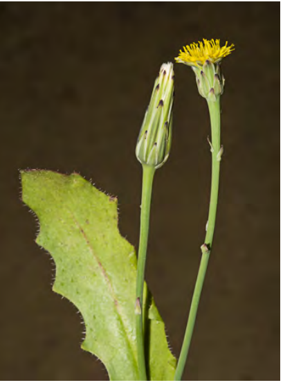
SMOOTH CAT'S-EAR (Hypochaeris glabra) Naturalized Annual - Sunflower Family (Mar–Jun) - Common. Disturbed areas, grassland, open woodland - Plant 4-24" tall, smooth. Rays 0.2-0.3" long, barely > head bracts. Only inner fruit beaked. INVASIVE.