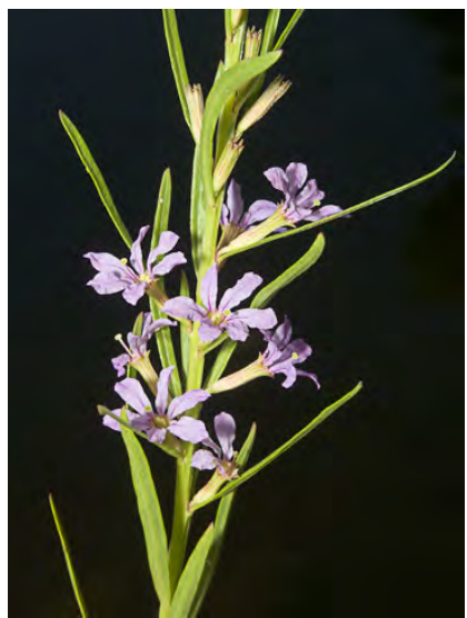
CALIFORNIA LOOSESTRIFE (Lythrum californicum) Native Perennial - Loosestrife Family - (Apr—Sep) - Marshes, pond and stream margins - Stem 8-24" tall. Leaves 0.4-2.8" long, gray-smooth, linear. Petals purple, 0.2-0.3" long; 2 style forms.