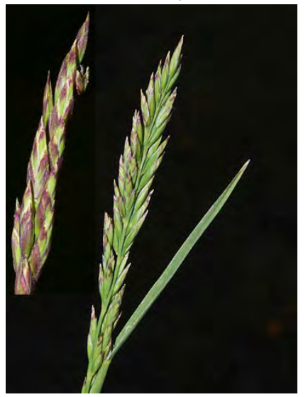
ONE-SIDED BLUE GRASS (Poa secunda subsp. secunda) Native Perennial - Grass Family - (Mar-Aug) - Common. Dry slopes to saline/alkaline meadows to alpine - Plant 6-40" tall, densely tuffed. Flower clusters congested. Spikelets gen 0.3-0.4" long. Lemmas 0.16-0.2" long, backs rounded.