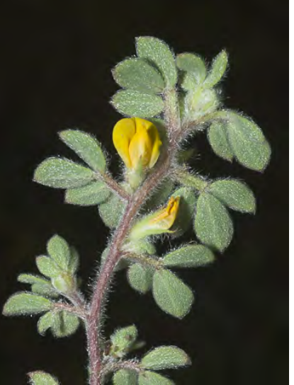
COLCHITA (Acmispon brachycarpus) Native Annual - Pea Family - (Mar–Jun) - Abundant. Grassland, oak and pine woodland, desert flats and mtns, roadsides - Soft, densely hairy, < 16" tall. Flower yellow, almost stemless, bract lobes 1-2x flower tube.