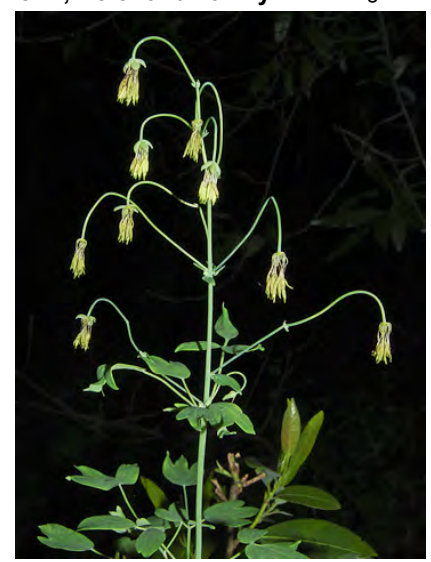
FOOTHILL MEADOW-RUE (Thalictrum fendleri var. polycarpum) Native Perennial - Buttercup Family - (Mar-Jun) - Moist, open to shaded places, woodland, forest - Plant 2-6'+ tall, male or female. Leaf 1-4x divided, 3-18" long, segments 0.3-0.8" long. No petals.