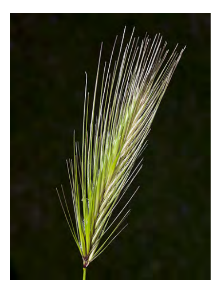
WALL BARLEY (Hordeum murinum subsp. murinum) Naturalized Annual - Grass Family - (Feb-May) - Moist, gen disturbed sites - Stem 1-2'. Leaf auricles notable. Central spikelet stalk 0-0.02". Central floret gen = lateral florets. INVASIVE weed.