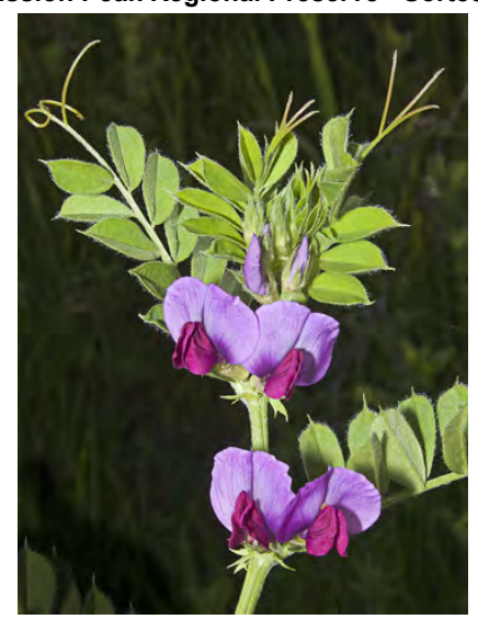
SPRING VETCH (Vicia sativa subsp. sativa) Naturalized Annual - Pea Family - (Mar–Jun) -Roadsides, disturbed areas, grassland, open areas in oak and riparian woodlands - Flowers 1-2 at leaf bases, pink-purple to white, 0.7-1.2" long. Leaflets 0.16-0.4" wide.