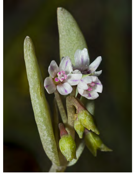
COMMON PALE CLAYTONIA (Claytonia exigua subsp. exigua) Native Annual - Miner's Lettuce Family - (Apr-Jul) - Dry or moist, disturbed bare clay to sandy soils, often serpentine - Stem leaf free or fused. Petals 0.1-0.2", white or pink. Seeds dull w/appendage.