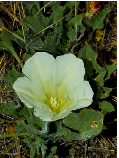
SHORTSTEM MORNING-GLORY (Calystegia subacaulis subsp. subacaulis) Native Perennial - Morning-glory Family - (Apr–Jun) - Dry, open scrub or woodland - Stem gen ~0.8" long. Flowers 1.3-2.4" long, white or cream. Bractlets concealing flower bracts.