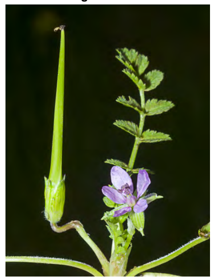
LONG-BEAKED FILAREE (Erodium botrys) Naturalized Annual - Geranium Family -(Mar-Jul) - Dry, open or disturbed sites - Stem 4-35" tall, coarse-hairy. Leaves lobed. Petals pink, 0.3-0.5" long. Sepals w/reddish tip. Fruit beak 2-4.7" long.