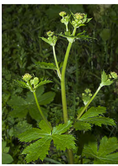
PACIFIC WOODLAND SANICLE (Sanicula crassicaulis) Native Perennial - Carrot Family - (Mar-May) - Open slopes, ravines, woodland - Plants stout, 9-47". Leaves 1-5" across with 3-5 deep, palmate lobes and serrate edges. Flowers yellow.