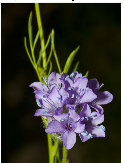
CALIFORNIA GILIA (Gilia achilleifolia subsp. achilleifolia) Native Annual - Phlox Family -(Mar–Jun) - Open or shaded, gen grassy places, sandy or rocky soil - Leaves linear-lobed. Flowers lavender, 0.4-0.8" long, throat > tube, 8-25 in hemispheric head.