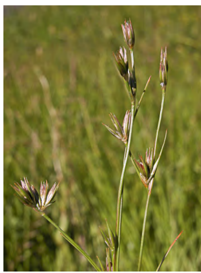
CLUSTERED TOAD RUSH (Juncus bufonius var. congestus) Native Annual - Rush Family - (Apr–Aug) - Drying pools, shores, disturbed ground, gen saline - Stem 1-4" tall, gen brached from base, ~0.04" wide. Flower cluster crowded. Flowers 0.2-0.3" long.