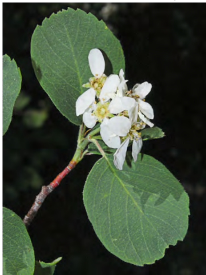
UTAH SERVICE-BERRY (Amelanchier utahensis) Native Perennial - Rose Family - (Apr—Jun) - Open, rocky slopes, canyons, banks of creeks, deserts, conifer forest - Shrub-small tree 2-16'. Leaves deciduous, toothed along outer half of blade.