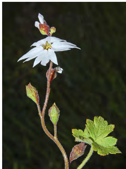
WOODLAND STAR (Lithophragma affine) Native Perennial - Saxifrage Family - (Mar-Apr) - Open, grassy slopes - Plant 4-24" tall. Leaves w/3-5 sharp-toothed shallow lobes, stem leaves alternate. Petals 0.2-0.5" long, white. Hypanthium funnel-shaped.