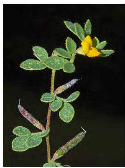
CALIFORNIA LOTUS (Acmispon wrangelianus) Native Annual - Pea Family - (Mar–Jun) - Abundant. Coastal bluffs, chaparral, disturbed areas - Low growing. Flowers yellow aging red, 0.2-0.4" long, almost stemless. Bract lobes same length as flower tube.