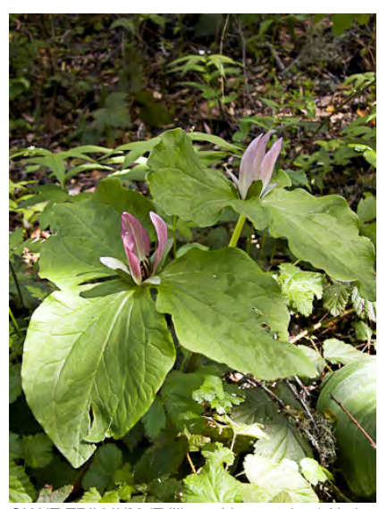
GIANT TRILLIUM (Trillium chloropetalum) Native Perennial - Bunchflower Family - (Apr–May) - Edges of redwood forest, chaparral, gen moist slopes, canyon banks in alluvial soils - Flowers dark purple to white, sessile. Petals 2.6-4" long, odor rose-like or spicy.