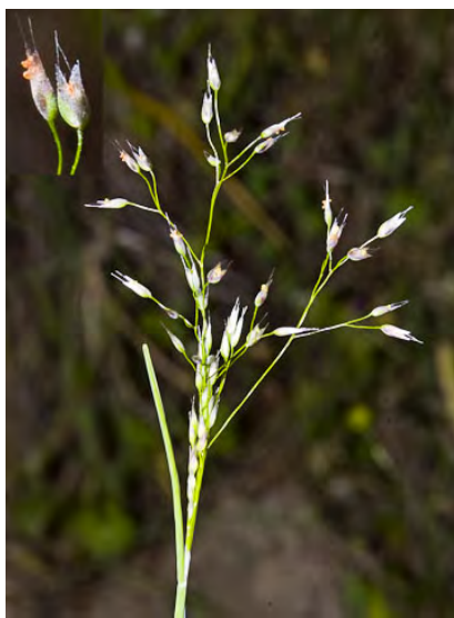
SILVER HAIR GRASS (Aira caryophyllea) Naturalized Annual - Grass Family - (Apr–Jun) - Sandy soils, open or disturbed sites - Flower cluster > 0.6" wide, diffuse with long slender branches. Spikelets about 0.1" long with 2 extended awns.