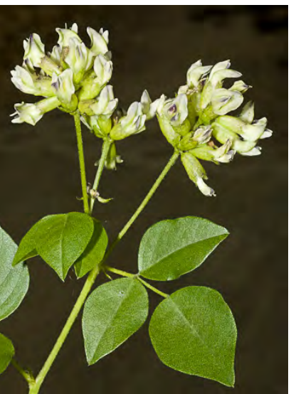
CALIFORNIA TEA (Rupertia physodes) Native Perennial - Pea Family - (May—Sep) - Woodland - Stem ~1.6'. Leaflets 3, triangular to lance-shaped, 1.4-2.8" long, sticky. Flower bracts not hairy, lobes = Flowers white or yellow, banner 0.4-0.55" long.