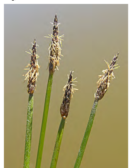
COMMON SPIKERUSH (Eleocharis macrostachya) Native Perennial - Sedge Family -(Spring–summer) - Common. Fresh to brackish wetland - Stem 8-39" tall, 0.06-0.1" wide. Spikelet 0.2-1.6" long, 0.08-0.2" wide, style 2-branched.