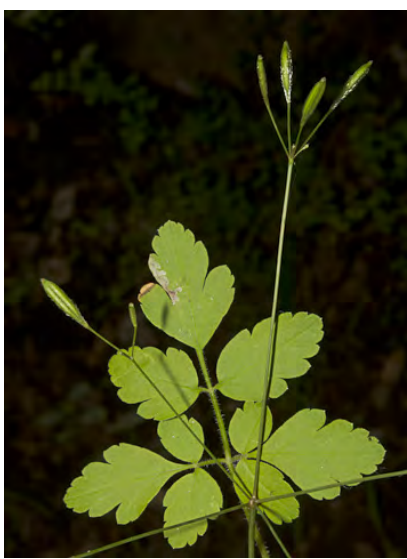
SWEET-CICELY (Osmorhiza berteroi) Native Perennial - Carrot Family - (Apr-Jul) - Conifer forest, woodland, disturbed areas - Plant 12-47". Leaflets in 3s, serrate to irreg lobed. Flower white. Fruit 0.5-1", upward pointing barbs, splitting apart below.