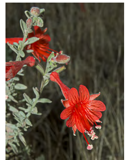
CALIFORNIA FUCHSIA (Epilobium canum subsp. canum) Native Perennial - Evening Primrose Family - (Jun-Dec) - Dry slopes, ridges - Plant hairy, gen sticky with a woody base. Leaf 0.3-2.8" long, gray to green. Flowers red-orange, floral tube 0.8-1.2" long.