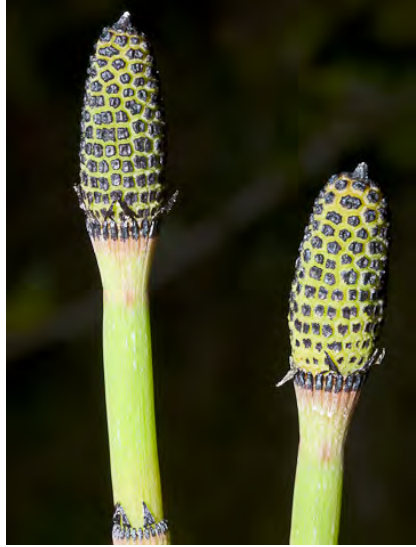
SMOOTH SCOURING RUSH (Equisetum laevigatum) Native Perennial - Horsetail Family - - Moist, sandy or gravelly areas - Stems 1 kind only, 12-71" fall, unbranched. Sheath w/dark band only at the top.