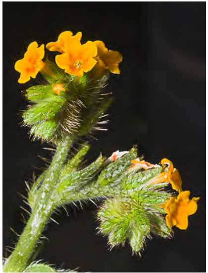
COMMON FIDDLENECK (Amsinckia intermedia) Native Annual - Borage Family - (Mar–Jun) - Abundant. Open, generally disturbed places - Plant 0.5-3' tall. Flowers orange with 5 red spots, 0.3-0.4" long, 0.2-0.4" wide, tube straight.