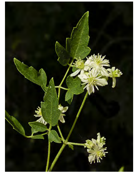
WESTERN VIRGIN'S BOWER (Clematis ligusticifolia) Native Perennial - Buttercup Family - (Jun-Sep) - Along streams, wet places - Leaflets 5-15, irregularly lobed. Flowers many, in fall. Sepals white to cream, 0.2-0.24" long.