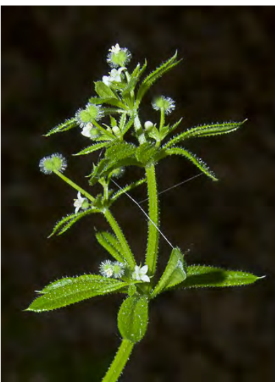
GOOSE GRASS (Galium aparine) Native Annual - Madder Family - (Apr-Jun) - Grassy, ± shady places - Stem 12-35" long, weak, brittle. Leaves 0.5-1.6" long, in whorls of 6-8. Flowers white, 4-lobed. Fruits covered w/short, hooked hairs.