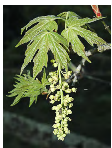
BIG-LEAF MAPLE (Acer macrophyllum) Native Perennial - Soapberry Family - (Mar–Jun) - Common. Streambanks, canyons - Tree < 100'. Leaves 5-lobed, 3-6" long, 4-10" wide. Group of 20-90 hanging flowers appear after leaves. Winged seeds.