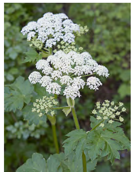
COW PARSNIP (Heracleum maximum) Native Perennial - Carrot Family - (Apr—Jul) - Moist places, wooded or open - Plants 1-3 m tall, woolly-hairy. Leaflets 3, maple-lobed, 4-16" wide. Petals white, outermost longest. Juice causes dermatitis.