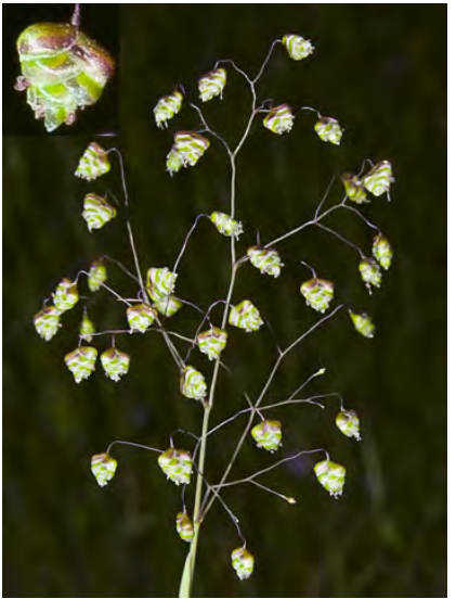
LITTLE QUAKING GRASS (Briza minor) Naturalized Annual - Grass Family - (Apr–Jul) -Shaded or moist, open sites - Stem 3-20" tall. Spikelets 0.1-0.2" long, resemble tiny rattlesnake rattles.