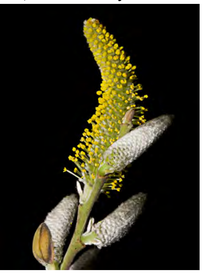
ARROYO WILLOW (Salix lasiolepis) Native Perennial - Willow Family - (Jan–Jun) - Common. Shores, marshes, meadows, etc - Shrub-tree, bark smooth. Leaf-like stipules. Leaf egg-shaped, waxy below. Fruit smooth, bract persistent, dark, stamens 2.