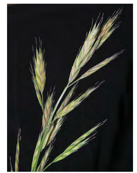
CALIFORNIA BROME (Bromus carinatus var. carinatus) Native Perennial - Grass Family - (Apr-Aug) - Coastal prairies, openings in chaparral, plains, open oak and pine woodland -Plant 20-40" tall. Flower cluster 6-16" long. Spikelet 0.8-1.6" long. Lemma 0.5-0.8" long, hairy, awn 0.3-0.6" long.