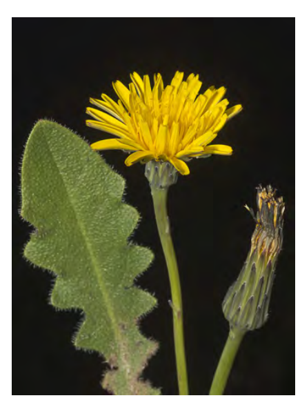
ROUGH CAT'S-EAR (Hypochaeris radicata) Naturalized Perennial - Sunflower Family -(Apr–Jul) - Disturbed areas, grassland, open woodland - Plant 4-32" tall, rough-hairy. Rays 0.4-0.6" long, well exceeding head bracts. Fruits all beaked. INVASIVE weed.