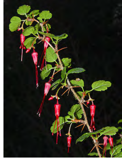
FUCHSIA-FLOWERED GOOSEBERRY (Ribes speciosum) Native Perennial - Gooseberry Family - (Jan–May) - Coastal-sage scrub, chaparral - Shrub < 26.6' tall. Stem bristly with 3 spines/node. Flowers 4-5 mm long, red with 4 erect sepals.