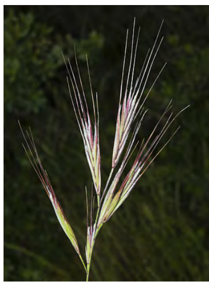
FOXTAIL CHESS (Bromus madritensis subsp. madritensis) Naturalized Annual - Grass Family - (Apr-Jan) - Disturbed areas, roadsides - Plants 4-20" tall. Stem and sheathes smooth. Flower cluster branches visible, lower spikelets erect, >