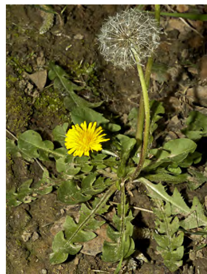
COMMON DANDELION (Taraxacum officinale) Naturalized Biennial-Perennial - Sunflower Family - (All year) - Abundant. Esp disturbed areas - Stem hollow. Leaves bright green with sharp down-pointing lobes. Outer head bracts reflexed. Fruit ~ brown.