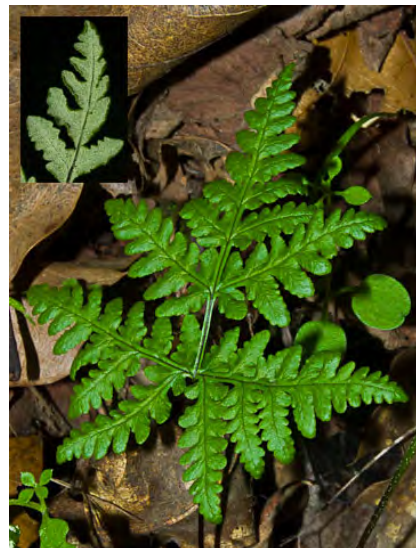
GOLDENBACK FERN (Pentagramma triangularis subsp. triangularis) Native Perennial - Brake Fern Family - - Gen shaded, sometimes rocky or wooded areas - Leaves triangular, 1.2-4" long, undersides either granular green or powdery gold.