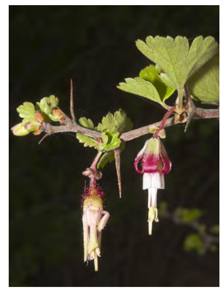
HILLSIDE GOOSEBERRY (Ribes californicum var. californicum) Native Perennial - Gooseberry Family - (Feb-Mar) - Forest openings, woodland - Shrub < 5' tall. Leaf blades 0.4-1.2" long, not sticky. Sepals greenish, petals 0.12" long, white.