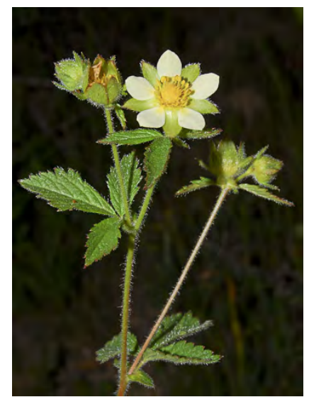
STICKY CINQUEFOIL (Drymocallis glandulosa var. wrangelliana) Native Perennial - Rose Family - (May—Jul) - Gen ± shady or moist areas - Stem 8-28". Flower 0.2-0.25" long, pale yellow to cream. Terminal leaflet distinct, unlobed.