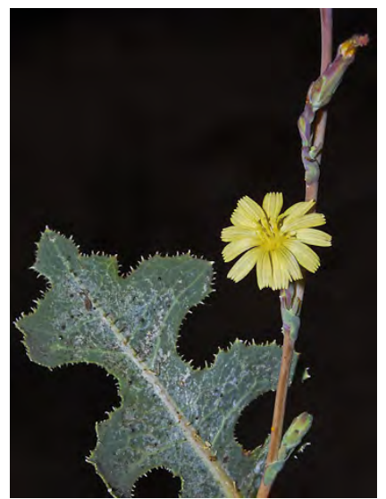
PRICKLY LETTUCE (Lactuca serriola) Naturalized Annual - Sunflower Family - (May-Oct) - Abundant. Disturbed places - Stem 1.6-10' tall, prickly-bristly. Leaves deeply-lobed, midvein and edges prickly-bristly. Flowers pale yellow, 0.16-0.2" wide.