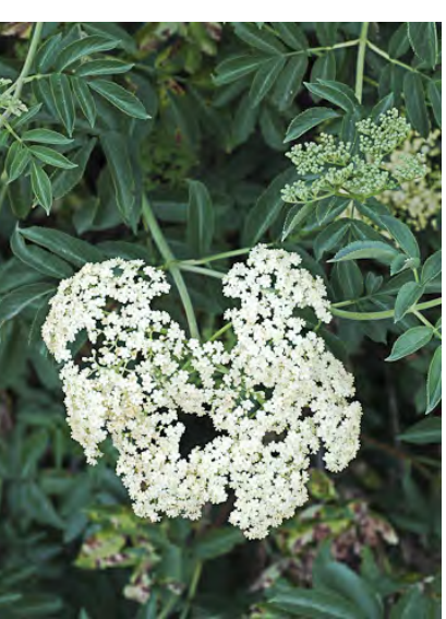
BLUE ELDERBERRY (Sambucus nigra subsp. caerulea) Native Perennial - Muskroot Family - (Mar-Sep) - Common. Streambanks, open places in forest - Shrub 7-26' tall. Flower cluster flat-topped, 1.6-13" diam, petals spreading. Fruits waxy blue-black.