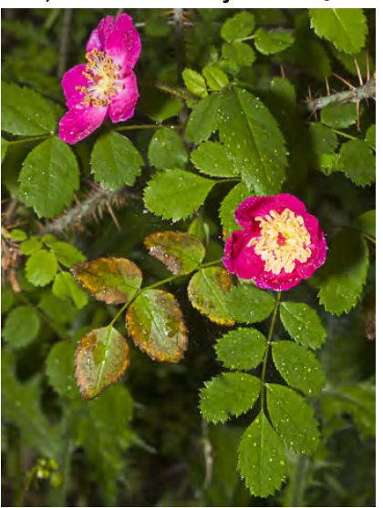
WOOD ROSE (Rosa gymnocarpa var. gymnocarpa) Native Perennial - Rose Family -((Feb)Apr–Jul) - Common. Gen in shade of forest, scrub - Shrub wstraight thorns. Flowers gen solitary, stalks sticky, fruit smooth, sepals deciduous.