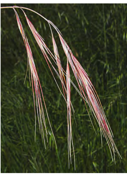
RIPGUT GRASS (Bromus diandrus) Naturalized Annual - Grass Family - (Apr–Jul) - Open, gen disturbed areas - Plant 6-40" tall. Spikelet 1-2.8" long. Lemma body 0.8-1.2" long, awn > 1.2" long. Barbed seeds can stick in flesh of animals. INVASIVE weed.