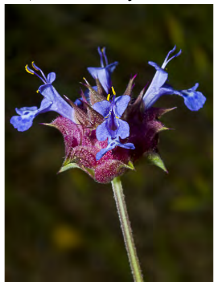
CHIA (Salvia columbariae) Native Annual - Mint Family - (Mar–Jun) - Dry, disturbed sites, chaparral, coastal-sage scrub - Plant 4-20" tall. Leaf 0.8-4" long, many 2x divided. Flower cluster head-like, 1-2 on bare stem. Flowers blue, tubes 6-8 mm long.