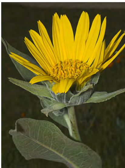
GRAY MULE'S EARS (Wyethia helenioides) Native Perennial - Sunflower Family (Mar-May(Aug)) - Open grassland, woodland, scrub - Plant 8-28" tall, densely woolly, often becoming smooth. Some woolly hairs remain on leaf stalks and floral bracts.