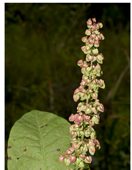
CURLY DOCK (Rumex crispus) Naturalized Perennial - Buckwheat Family - (All year) - Abundant. Disturbed places - Stem 16-39" tall. Flower cluster dense, valves 0.2-0.24", winged around tubercles, smooth edged. 1 tubercle enlarged. INVASIVE.