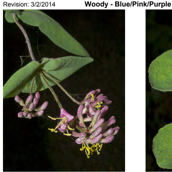
HAIRY VINE HONEYSUCKLE (Lonicera hispidula) Native Perennial - Honeysuckle Family - (May—Jun) - Canyons, streamsides, woodland - Shrub sprawling-climbing, 6-10' long, short-hairy. Flower cluster densely sticky. Flowers pink, 0.5-0.6" long, sticky-hairy.