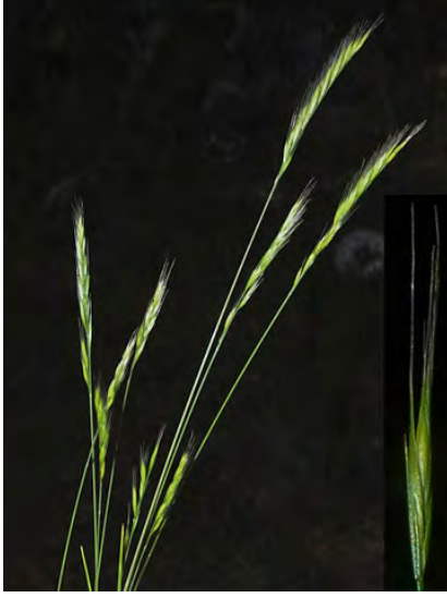
BROME FESCUE (Festuca bromoides) Naturalized Annual - Grass Family - (May–Jun) -Uncommon. Dry, disturbed places, coastal-sage scrub, chaparral - Stem < 20". Inflor 0.6-6" tall, dense, lower branches erect. Spikelet 0.2-0.4" long, awn 0.1-0.3" long.