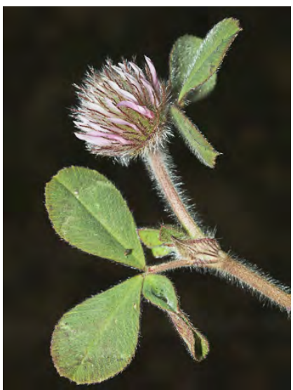
ROSE CLOVER (Trifolium hirtum) Naturalized Annual - Pea Family - (Apr-May) - Disturbed areas, roadsides - Head with 1-2 bract-like leaves immed below. Flowers pink, 0.4-0.6" long, densely-bristly in fruit. INVASIVE weed.