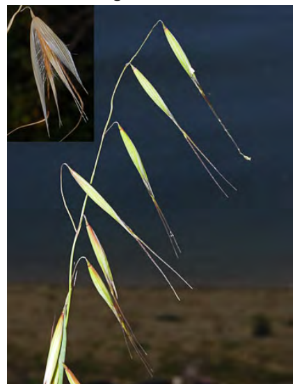
SLENDER WILD OAT (Avena barbata) Naturalized Annual - Grass Family - (Mar–Jun) - Disturbed sites - Plants gen 24-32". Spikelets 0.8-1.2" long. Awns 0.8-1.8" long. Lemma tip bristles >= 0.1" long. Seeds EDIBLE whole or ground for flour. INVASIVE weed.