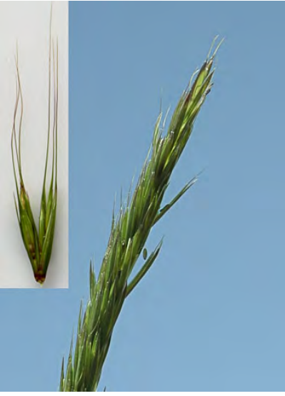
WESTERN WILD-RYE (Elymus glaucus subsp. glaucus) Native Perennial - Grass Family - (Jun-Aug) - Open areas, chaparral, woodland, forest - Tufted. Stem 12-55" tall. Leaf 0.2-0.5" wide, flat. Spikelets0.3-0.6" long, 2-4 per node. Lemma awn 0.4-1.2" long.