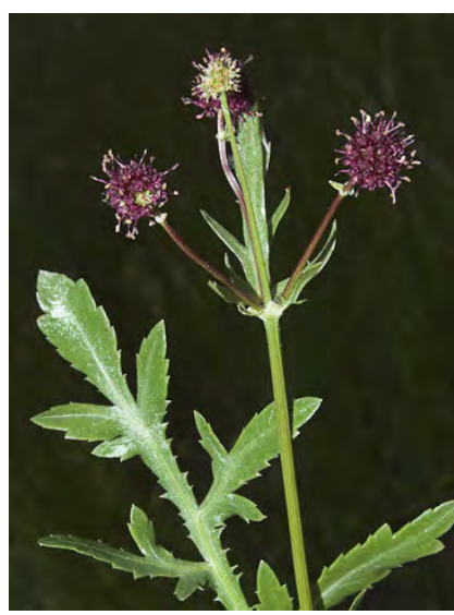
PURPLE SANICLE (Sanicula bipinnatifida) Native Perennial - Carrot Family - (Mar–May) -Open grassland, gen on serpentine, or pine/oak woodland - Plant 5-24" tall. Leaves 1.6-7.5" long, 1-2x divided on a winged central axis. Flowers dark purple. Fruits prickly.