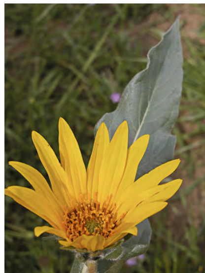
NARROW-LEAVED MULE'S EARS (Wyethia angustifolia) Native Perennial - Sunflower Family - (Apr-Aug) - Grassland - Plant 4-35" tall, rough-hairy. Leaves narrow, veins all similar, base blades 4-20" long. Ray flowers 0.6-1.8"