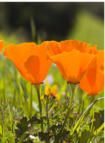
CALIFORNIA POPPY (Eschscholzia californica) Native Perennial - Poppy Family - (Feb-Sep) - Grassy, open areas - Plant 2-24" tall. Flower w/spreading rim <= 0.2". Petals 0.8-2.4" long, early spring = large and orange, fall = smaller and yellow.