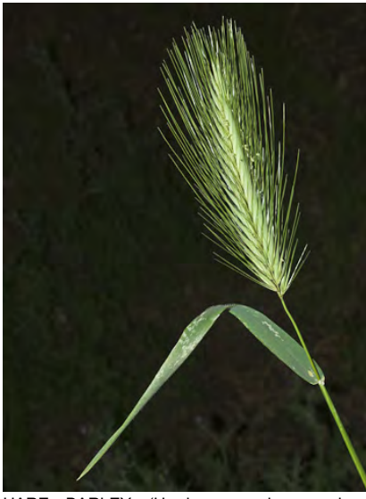
HARE BARLEY (Hordeum murinum subsp. leporinum) Naturalized Annual - Grass Family - (Feb-May) - Moist, gen disturbed sites. Common - Stem 12-43" tall. Central spikelet stalk ~0.06" long. Central floret << lateral florets. INVASIVE weed