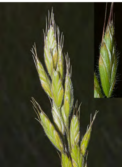
SOFT CHESS (Bromus hordeaceus) Naturalized Annual - Grass Family - (Apr-Jul) - Fields, disturbed areas - Plant 4-26" tall. Leaf hairy. Flower cluster 1-5" long, dense, some stalks > spikelet. Spikelet 0.5-0.9". Lemma 0.26-0.4", awn 0.16-0.4". INVASIVE weed.