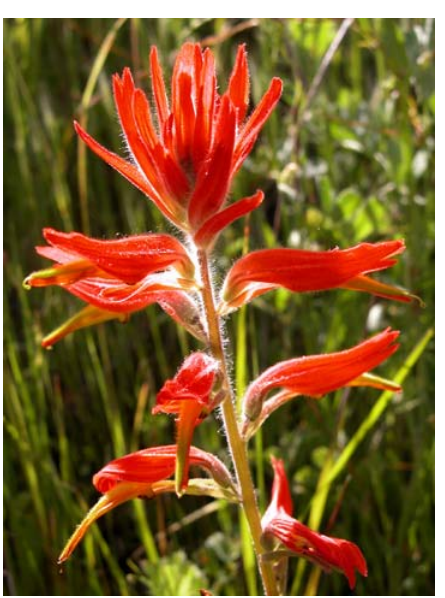
Common Indian Paintbrush Castilleja affinis ssp. affinis Native Perennial Snapdragon Family

Scarlet Pimpernel Anagallis arvensis Introduced Annual Primrose Family