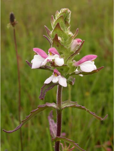
Bellardia Bellardia trixago Introduced Annual Snapdragon Family