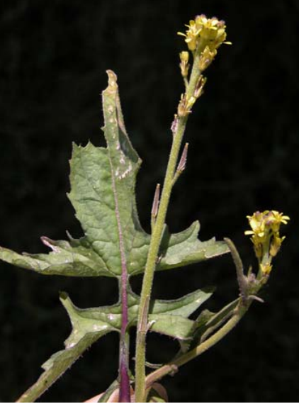
Black Mustard Brassica nigra Introduced Annual Mustard Family