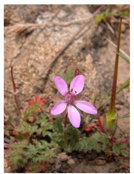
Red-stem Filaree Erodium cicutarium Introduced Annual Geranium Family