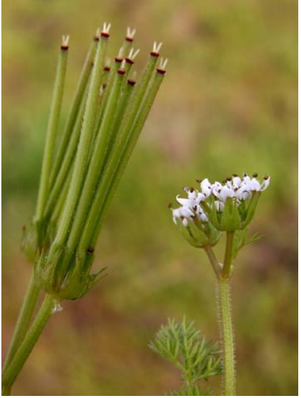
Shepherd's Needle Scandix pecten-veneris Introduced Annual Carrot Family