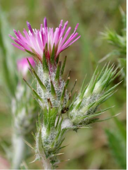
Italian Thistle Carduus pycnocephalus Introduced Annual Sunflower Family

Chinese Houses Collinsia heterophylla Native Annual Snapdragon Family