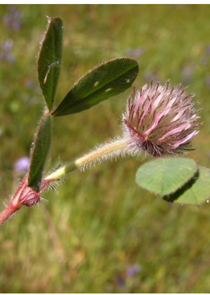
Rose Clover Trifolium hirtum Introduced Annual Pea Family