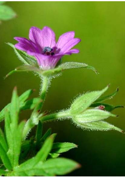
Purpletip Cut-leaf Geranium Geranium dissectum Introduced Annual Geranium Family