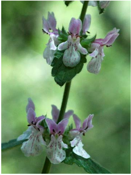
Common Rigid Hedge Nettle Stachys ajugoides var. rigida Native Perennial Mint Family