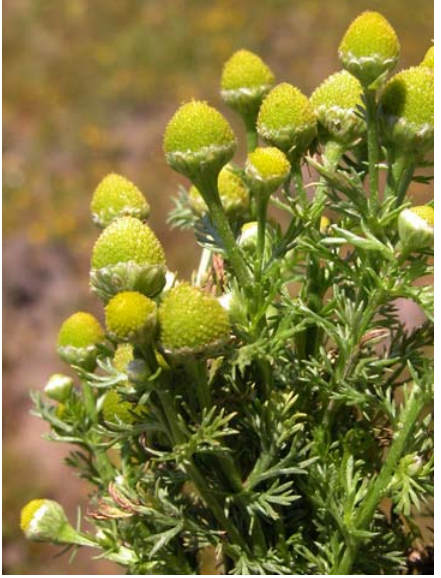
Pineapple Weed Chamomilla suaveolens Introduced Annual Sunflower Family