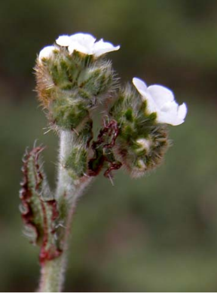
Nievitas Popcorn Flower Plagiobothrys nothofulvus Native Annual Borage Family