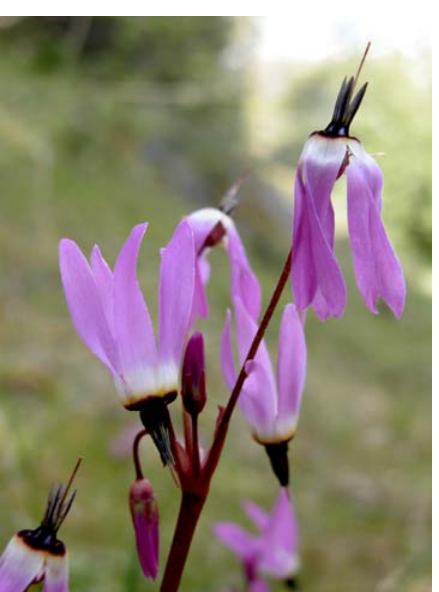
Mosquitobills Shooting Star Dodecatheon hendersonii Native Perennial Primrose Family