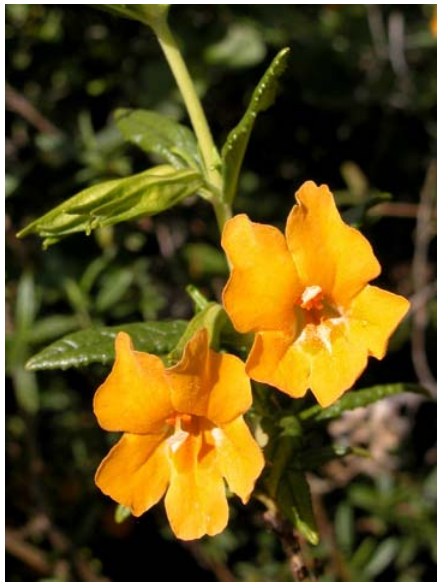
Bush Monkey Flower Mimulus aurantiacus Native Perennial Snapdragon Family