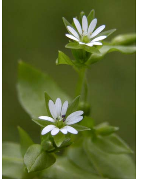
Common Chickweed Stellaria media Introduced Annual Pink Family