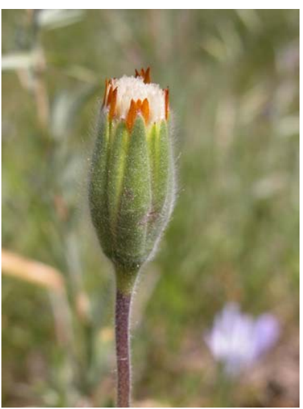
Blow Wives Achyrachaena mollis Native Annual Sunflower Family