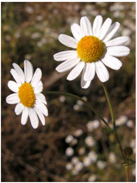
Mayweed Anthemis cotula Introduced Annual Sunflower Family