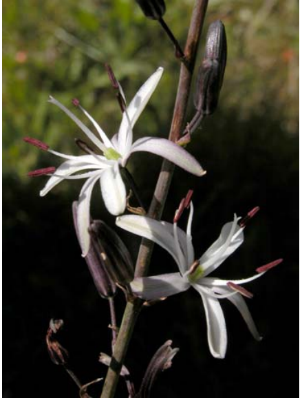
Common Soap Plant Chlorogalum pomeridianum var. pomeridianum Native Perennial Lily Family