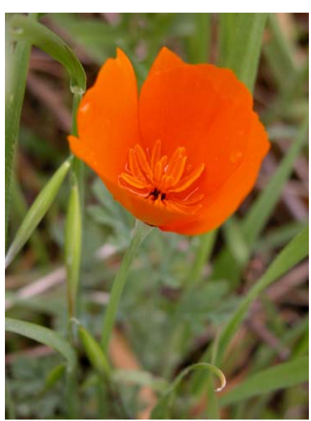
California Poppy Eschscholzia californica Native Perennial Poppy Family