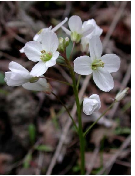
Milkmaids Cardamine californica Native Perennial Mustard Family