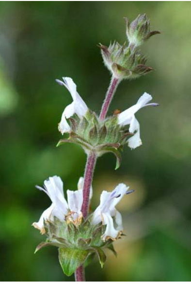
Black Sage Salvia mellifera Native Perennial Mint Family