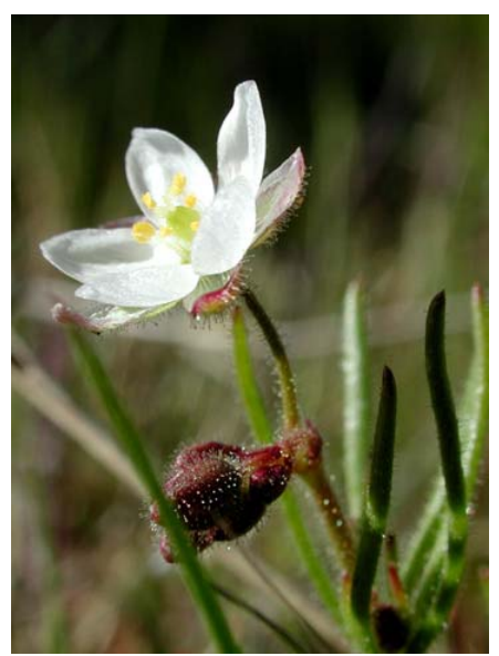
Stickwort Spergula arvensis ssp. arvensis Introduced Annual Pink Family