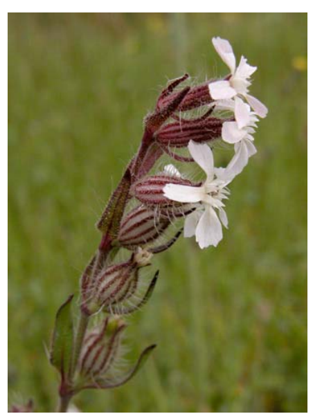
Windmill Pink Silene gallica Introduced Annual Pink Family