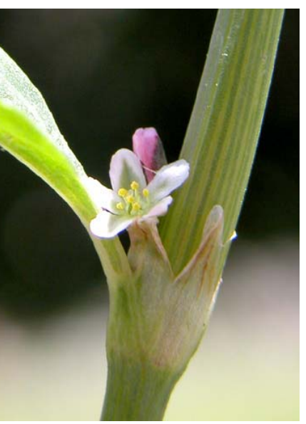
Common Yard Knotweed Polygonum arenastrum Introduced Annual Buckwheat Family