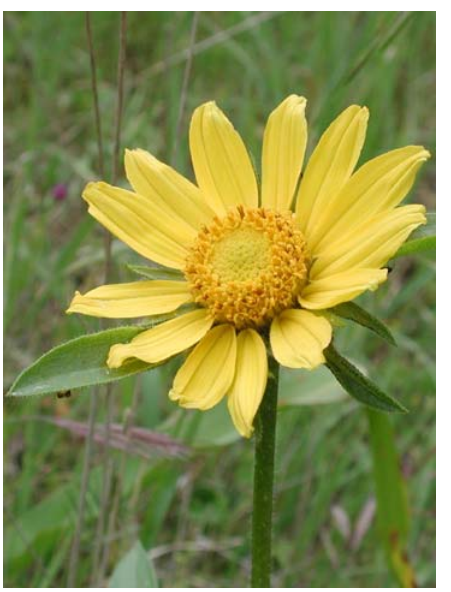
Mt. Diablo Helianthella Helianthella castanea Native Perennial Sunflower Family