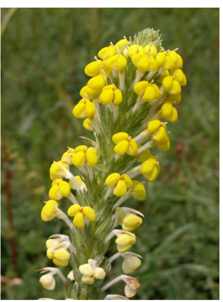
Yellow Johnny-tuck Triphysaria eriantha ssp. eriantha Native Annual Snapdragon Family