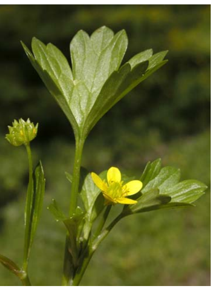
Prickleseed Buttercup Ranunculus muricatus Introduced Annual Buttercup Family