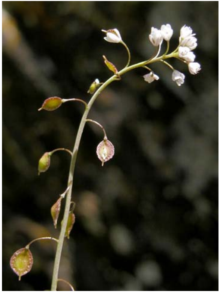
Hairy Fringepod Thysanocarpus curvipes Native Annual Mustard Family