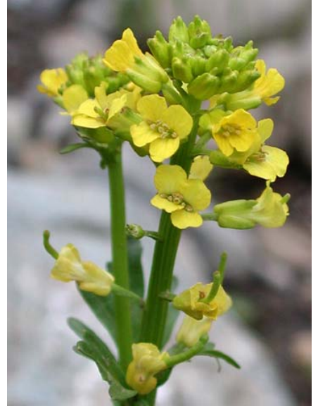
Erect-pod Winter Cress Barbarea orthoceras Native Perennial Mustard Family