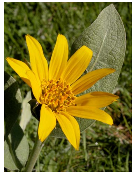
Gray Mule's Ear Wyethia helenioides Native Perennial Sunflower Family