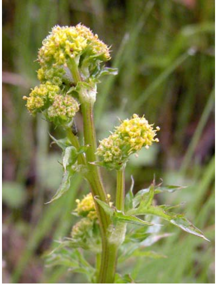
Pacific Woodland Sanicle Sanicula crassicaulis Native Perennial Carrot Family