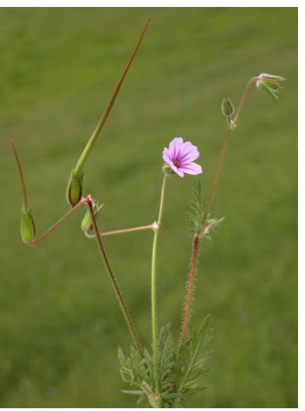
Long-beaked Filaree Erodium botrys Introduced Annual Geranium Family