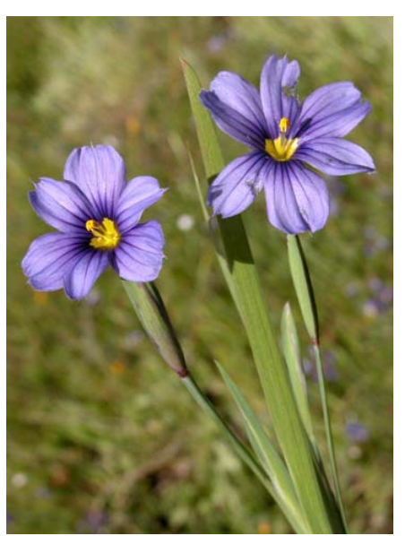
Blue-eyed Grass Sisyrinchium bellum Native Perennial Iris Family