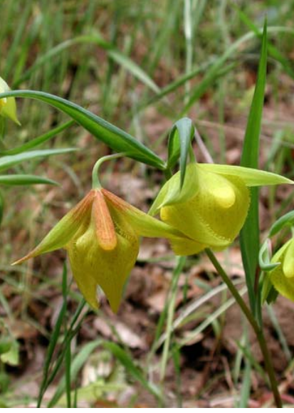
Mt. Diablo Fairy Lantern Calochortus pulchellus Native Perennial Lily Family