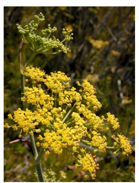
Sweet Fennel Foeniculum vulgare Introduced Perennial Carrot Family