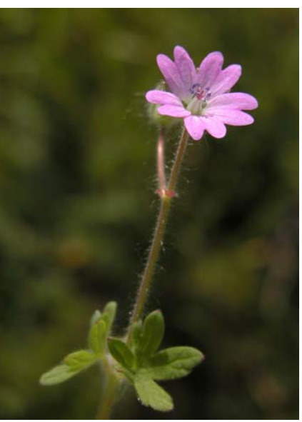
Hairy Dove's Foot Geranium Geranium molle Introduced Annual Geranium Family