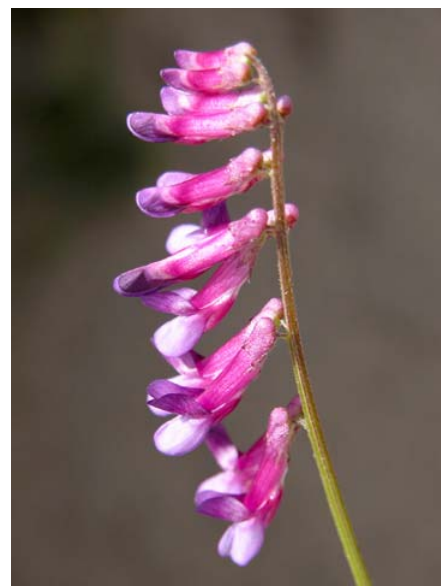
Winter Vetch Vicia villosa ssp. varia Introduced Annual-Biennial Pea Family