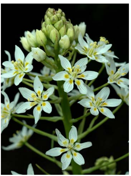
Common Star Lily Zigadenus fremontii Native Perennial Lily Family