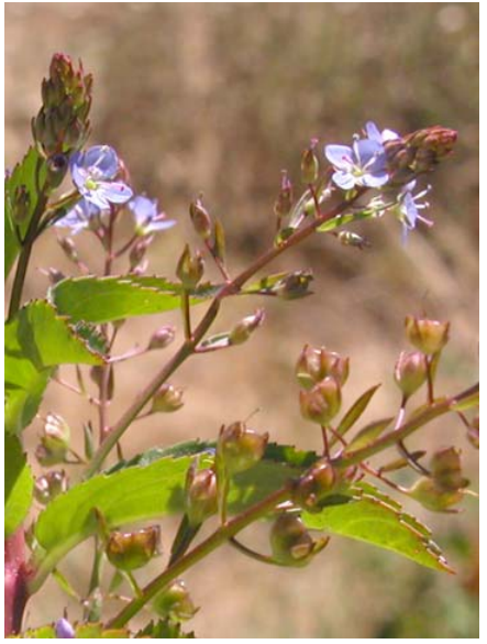
American Brooklime Speedwell Veronica americana Native Perennial Snapdragon Family