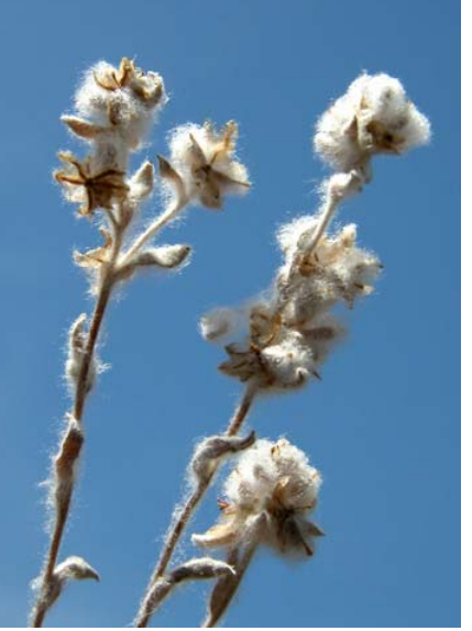
Slender Cottonweed Micropus californicus var. californicus Native Annual Sunflower Family