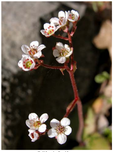
California Saxifrage Saxifraga californica Native Perennial Saxifrage Family