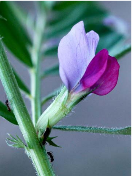
Spring Vetch Vicia sativa ssp. sativa Introduced Annual Pea Family