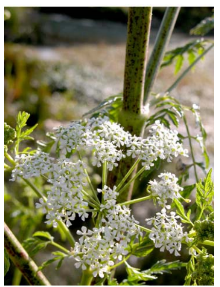
Poison Hemlock Conium maculatum Introduced Biennial Carrot Family