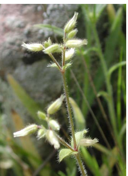
Mouse-ear Chickweed Cerastium glomeratum Introduced Annual Pink Family