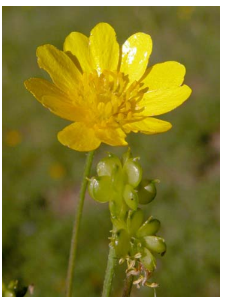
California Buttercup Ranunculus californicus Native Perennial Buttercup Family