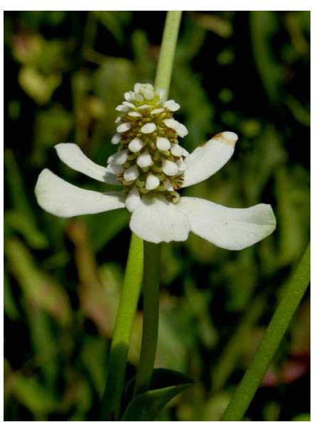
Yerba Mansa Anemopsis californica Native Perennial Lizard's-Tail Family