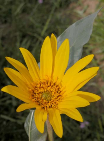
Narrow-leaf Mule's Ear Wyethia angustifolia Native Perennial Sunflower Family