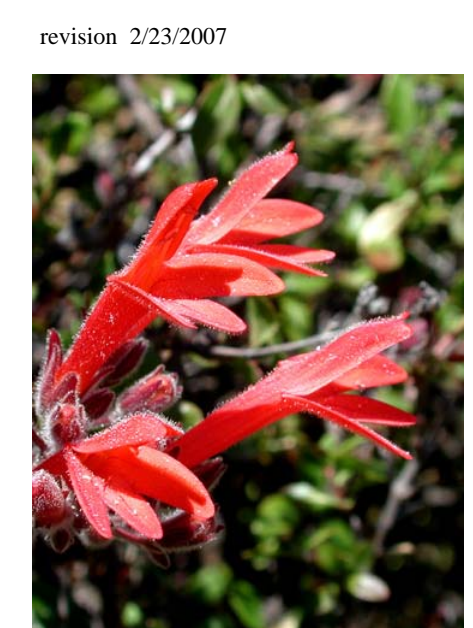
California Fuchsia Epilobium canum ssp. canum Native Perennial Evening Primrose Family