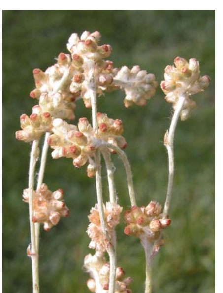
Weedy Cudweed Gnaphalium luteo-album Introduced Annual Sunflower Family