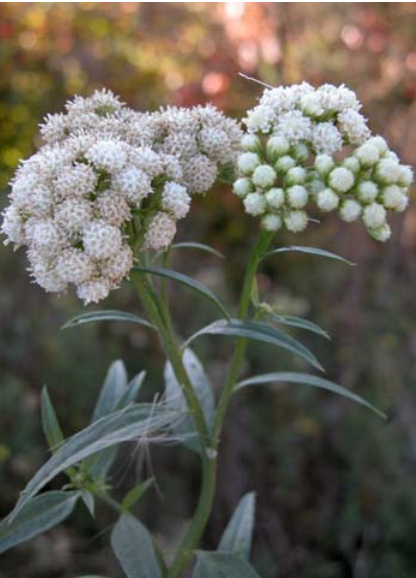
Douglas/Salt Marsh Baccharis Baccharis douglasii Native Perennial Sunflower Family