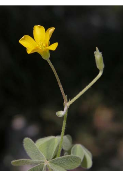
Creeping Wood Sorrel Oxalis corniculata Introduced Perennial Oxalis Family