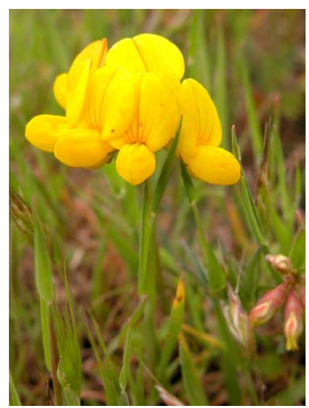
Bird's-foot Deerweed Lotus corniculatus Introduced Perennial Pea Family