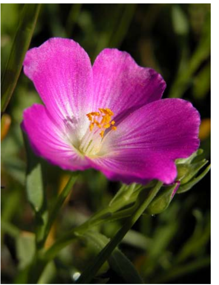
Magenta Red Maids Calandrinia ciliata Native Annual Purslane Family