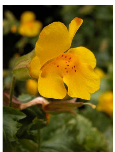
Golden Monkey Flower Mimulus guttatus Native Perennial Snapdragon Family