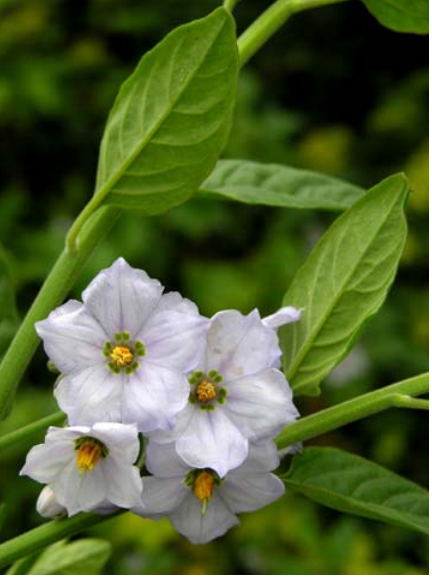
Blue Witch Solanum umbelliferum Native Perennial Nightshade Family