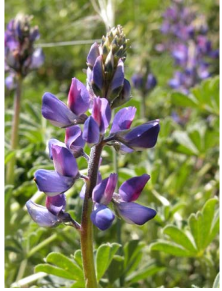
Arroyo Lupine Lupinus succulentus Native Annual Pea Family