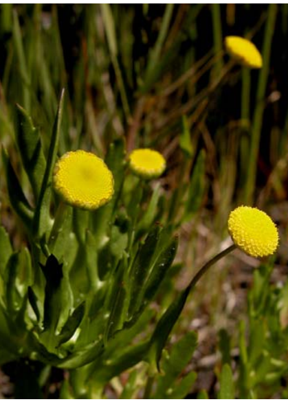
Brass Buttons Cotula coronopifolia Introduced Perennial Sunflower Family