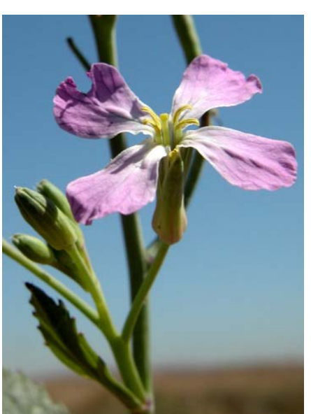
Wild Radish Raphanus sativus Introduced Annual Mustard Family