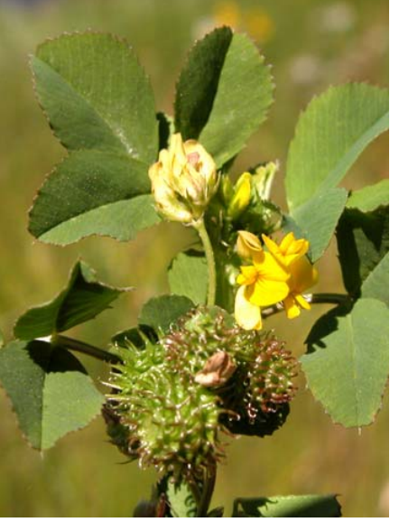
California Bur Clover Medicago polymorpha Introduced Annual Pea Family