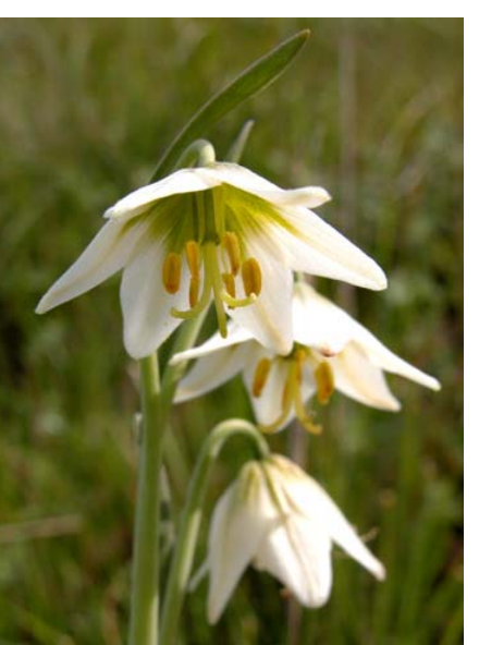
Fragrant White Fritillary Fritillaria liliacea Native Perennial Lily Family