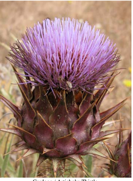
Cardoon / Artichoke Thistle Cynara cardunculus Introduced Perennial Sunflower Family