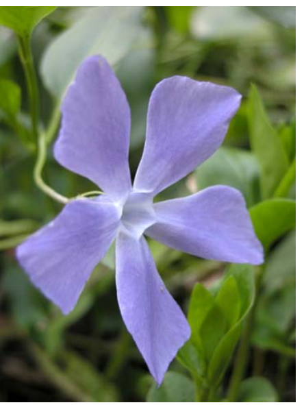
Greater Periwinkle Vinca major Introduced Perennial Dogbane Family