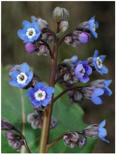
Large Hound's Tongue Cynoglossum grande Native Perennial Borage Family