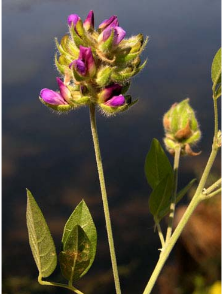
California Tea Rupertia physodes Native Perennial Pea Family