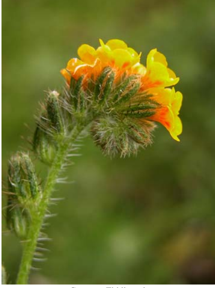
Common Fiddleneck Amsinckia menziesii var. intermedia Native Annual Borage Family