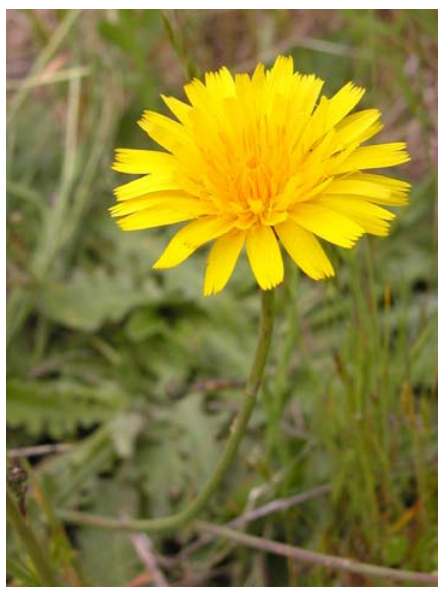
Rough Cat's-ear Hypochaeris radicata Introduced Perennial Sunflower Family