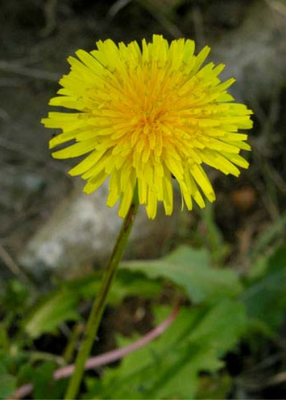
Common Dandelion Taraxacum officinale Introduced Biennial-Perennial Sunflower Family