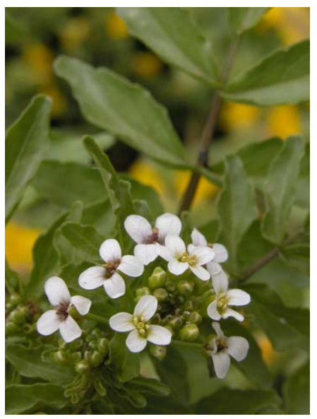
White Water Cress Rorippa nasturtium-aquaticum Native Perennial Mustard Family