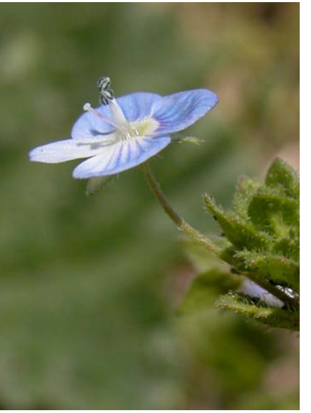
Persian Speedwell Veronica persica Introduced Annual Snapdragon Family