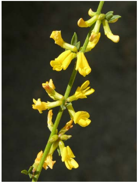
Deerweed Lotus scoparius var. scoparius Native Perennial Pea Family