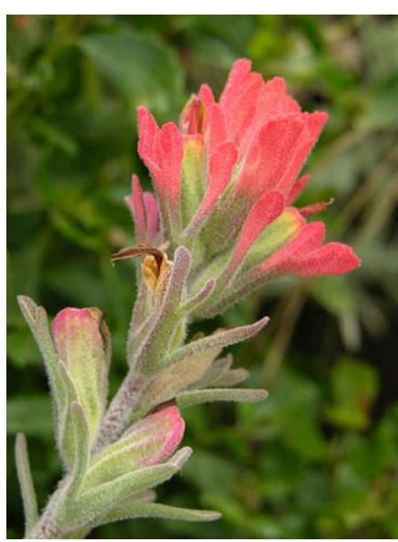
Woolly Paintbrush Castilleja foliolosa Native Perennial Snapdragon Family