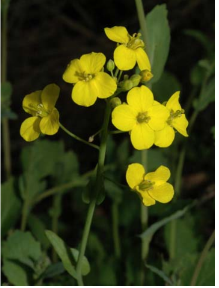
Yellow Field Mustard Brassica rapa Introduced Annual Mustard Family