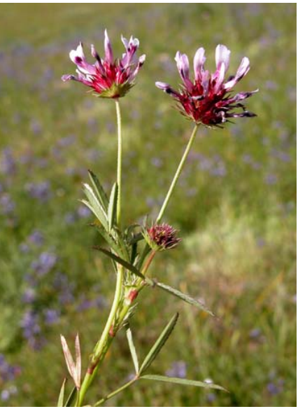
Tomcat Clover Trifolium willdenovii Native Annual Pea Family