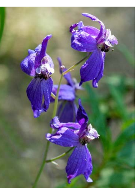
Royal Larkspur Delphinium variegatum ssp. variegatum Native Perennial Buttercup Family