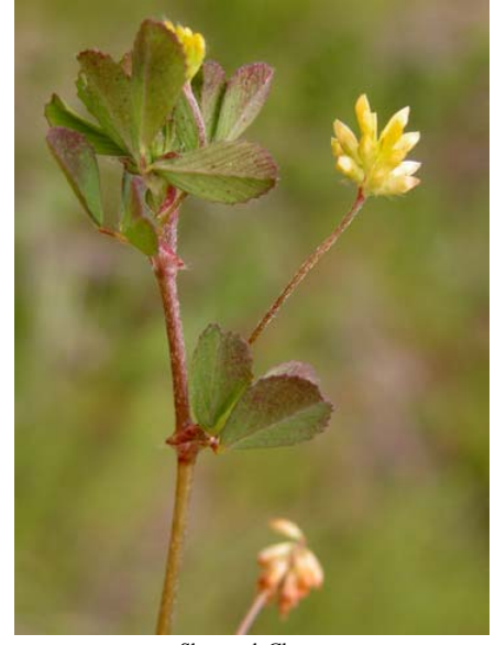
Shamrock Clover Trifolium dubium Introduced Annual Pea Family