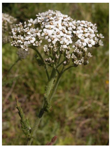
Yarrow Achillea millefolium Native Perennial Sunflower Family