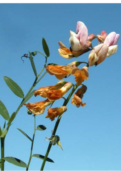
Pale Purple Pacific Pea Lathyrus vestitus var. vestitus Native Perennial Pea Family