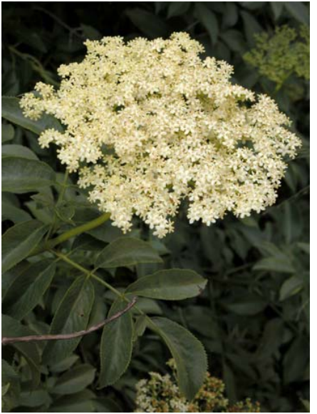
Blue Elderberry Sambucus mexicana Native Perennial Honeysuckle Family

Common / California Manroot Marah fabaceus Native Perennial Gourd Family