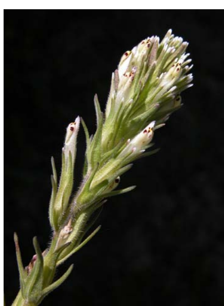
Valley Tassels Castilleja attenuata Native Annual Snapdragon Family