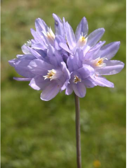
Blue Dicks Dichelostemma capitatum ssp. capitatum Native Perennial Lily Family