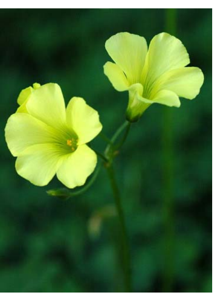
Bermuda Buttercup Oxalis pes-caprae Introduced Perennial Oxalis Family