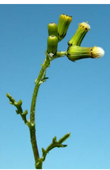
Common Groundsel Senecio vulgaris Introduced Annual Sunflower Family