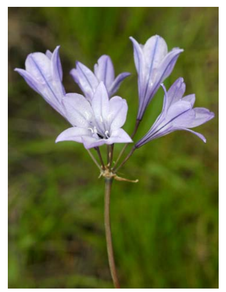
Ithuriel's Spear Triteleia laxa Native Perennial Lily Family