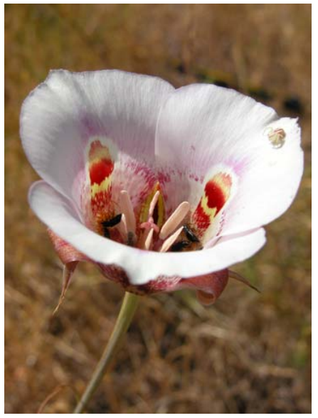
White Butterfly Mariposa Lily Calochortus venustus Native Perennial Lily Family