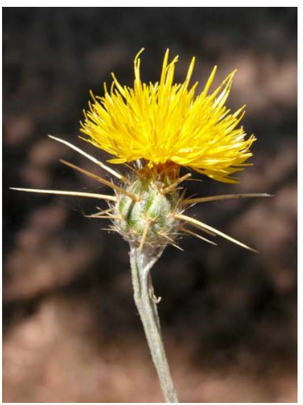
Yellow Star Thistle Centaurea solstitialis Introduced Annual Sunflower Family