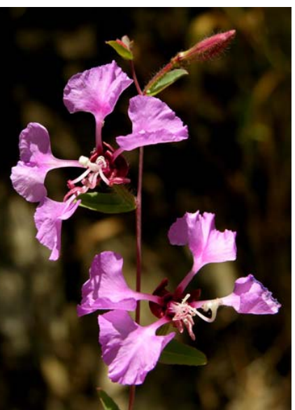
Elegant Clarkia Clarkia unguiculata Native Annual Evening Primrose Family