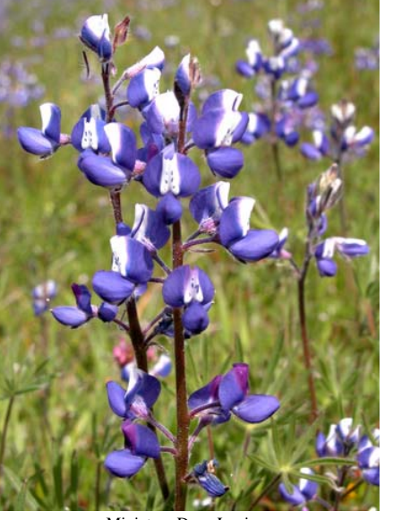
Miniature Dove Lupine Lupinus bicolor Native Annual Pea Family