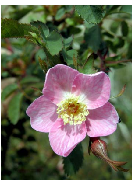
California Wild Rose Rosa californica Native Perennial Rose Family