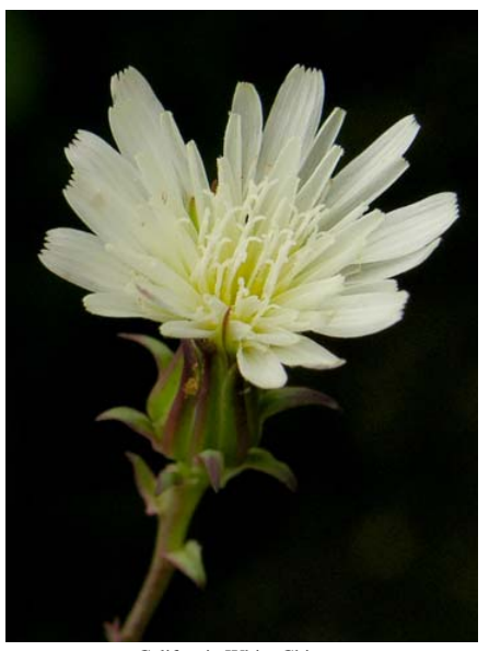
California White Chicory Rafinesquia californica Native Annual Sunflower Family