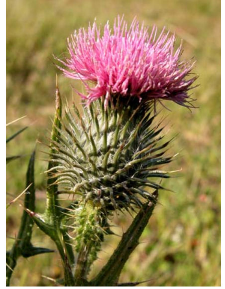
Bull Thistle Cirsium vulgare Introduced Biennial Sunflower Family