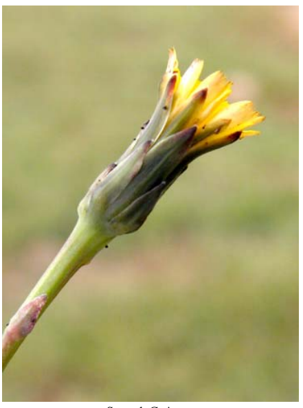
Smooth Cat's-ear Hypochaeris glabra Introduced Annual Sunflower Family