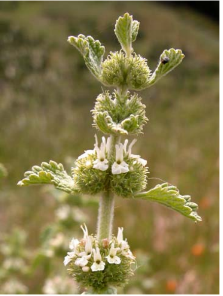
Common Horehound Marrubium vulgare Introduced Perennial Mint Family