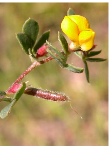
California Lotus Lotus wrangelianus Native Annual Pea Family