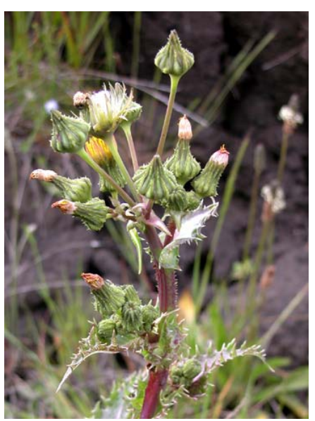
Prickly Sow Thistle Sonchus asper ssp. asper Introduced Annual Sunflower Family