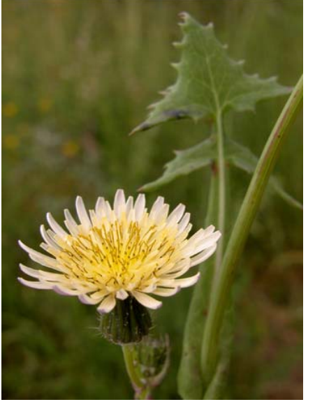
Common Sow Thistle Sonchus oleraceus Introduced Annual Sunflower Family