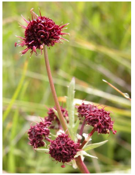
Purple Sanicle Sanicula bipinnatifida Native Perennial Carrot Family