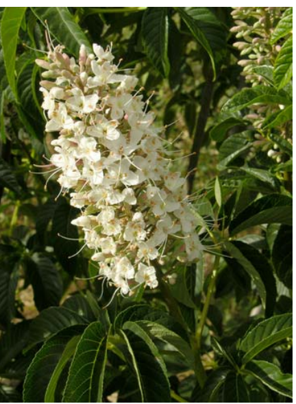
California Buckeye Aesculus californica Native Perennial Buckeye Family