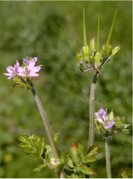
White-stem Filaree Erodium moschatum Introduced Annual Geranium Family