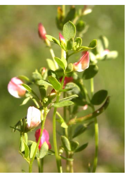
Spanish Clover Lotus purshianus var. purshianus Native Annual Pea Family