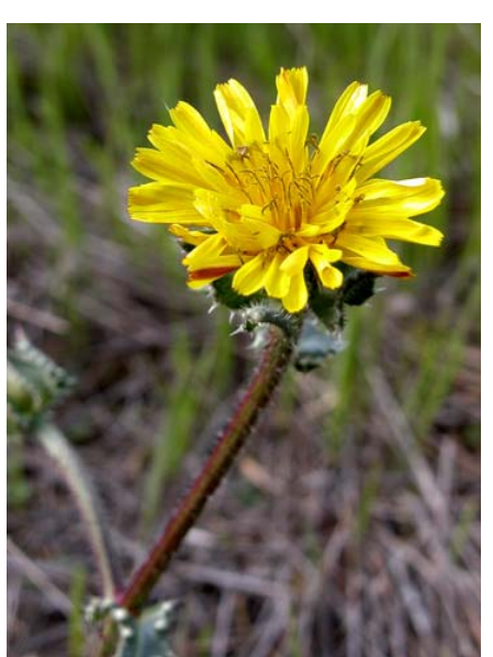
Bristly Ox-tongue Picris echioides Introduced Annual-Biennial Sunflower Family