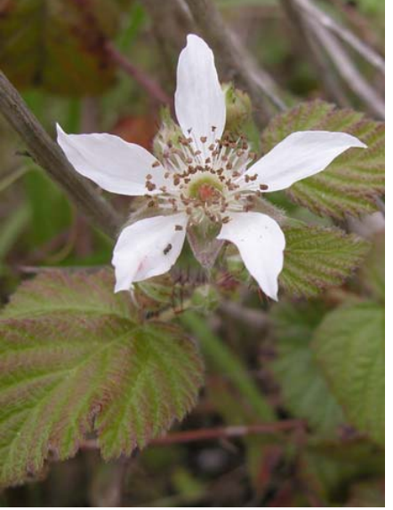
Native California Blackberry Rubus ursinus Native Perennial Rose Family

California Dwarf Plantain Plantago erecta Native Annual Plantain Family