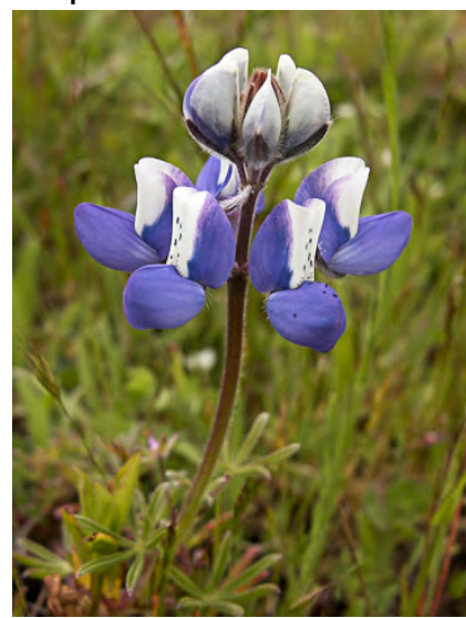
SKY LUPINE (Lupinus nanus) Native Annual -Pea Family - (Mar–Jun) - Abundant. Open or disturbed areas - Plant 4-24" tall, hairy. Flowers blue to pink to white, 0.2-0.6" long; banner as wide as long. Flower stalk gen > 0.12" long.