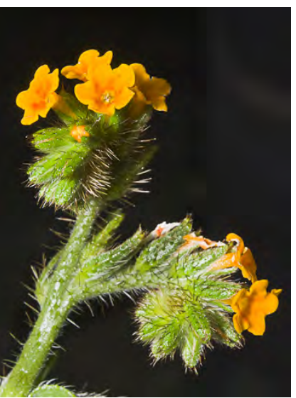
COMMON FIDDLENECK (Amsinckia intermedia) Native Annual - Borage Family - (Mar–Jun) -Abundant. Open, generally disturbed places -Plant 0.5-3' tall. Flowers orange with 5 red spots, 0.3-0.4" long, 0.2-0.4" wide, tube straight.