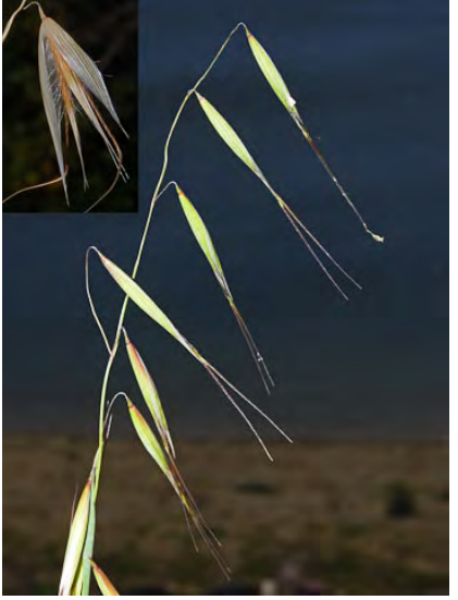
SLENDER WILD OAT (Avena barbata) Naturalized Annual - Grass Family - (Mar–Jun) - Disturbed sites - Plants gen 24-32". Spikelets 0.8-1.2" long. Awns 0.8-1.8" long. Lemma tip bristles >= 0.1" long. Seeds EDIBLE whole or ground for flour. INVASIVE weed.