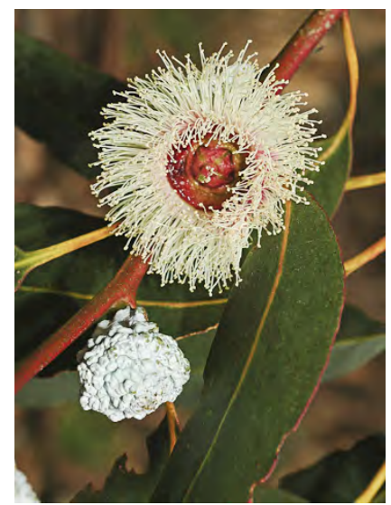
BLUE GUM (Eucalyptus globulus) Naturalized Perennial - Myrtle Family - (Oct–Jan) - Common. Disturbed areas - Tree < 200' tall. Flowers single, large, gen stemless. Leaves 4-12" long, 1-1.6" wide; used medicinally by Aboriginals. INVASIVE weed.