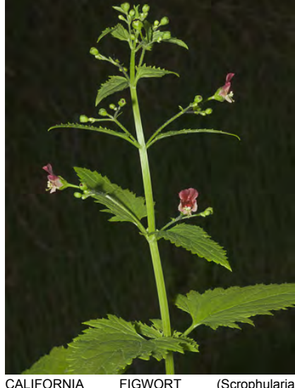
CALIFORNIA FIGWORT (Scrophularia californica) Native Perennial - Snapdragon Family - (Mar-Jul) - Common; damp places, chaparral, roadsides - Stem 2.6-4' tall, square x-section. Leaves opposite, to 7" long, triangular, toothed. Flowers 0.3-0.5" long, upper lips red to maroon, lower paler or yellowish.