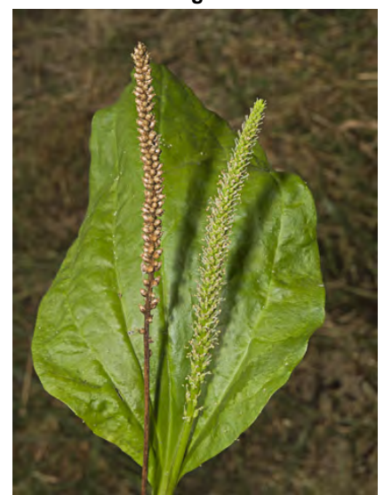
COMMON PLANTAIN (Plantago major) Naturalized Annual-Perennial - Plantain Family - (Apr-Sep) - Disturbed areas - Leaves basal, blades 5-18 cm long, broadly oval, not hairy. Flowers + stem 2-24" tall, flower cluster gen 1.2-8" long.