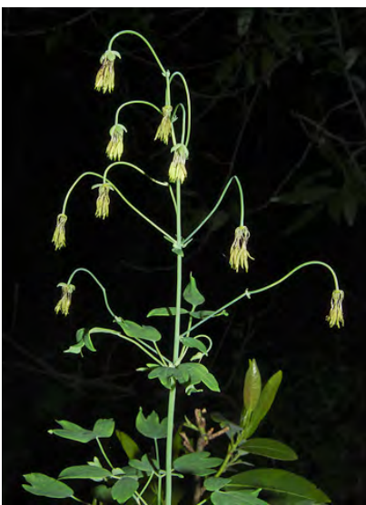
FOOTHILL MEADOW-RUE (Thalictrum fendleri var. polycarpum) Native Perennial - Buttercup Family - (Mar–Jun) - Moist, open to shaded places, woodland, forest - Plant 2-6'+ tall, male or female. Leaf 1-4x divided, 3-18" long, segments 0.3-0.8" long. No petals.