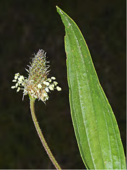
ENGLISH PLANTAIN (Plantago lanceolata) Naturalized Annual - Plantain Family - (Apr-Aug) - Common. Disturbed areas - Leaves basal, hairy, 2-10" long, <= 1" wide. Flowers + stem 8-31" tall, flower cluster 0.8-3" long. INVASIVE, lawn weed.