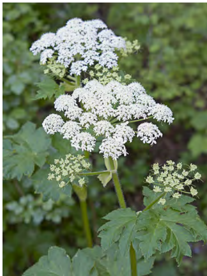
COW PARSNIP (Heracleum maximum) Native Perennial - Carrot Family - (Apr-Jul) - Moist places, wooded or open - Plants 1-3 m tall, woolly-hairy. Leaflets 3, maple-lobed, 4-16" wide. Petals white, outermost longest. Juice causes dermatitis.