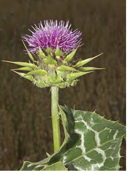
MILK THISTLE (Silybum marianum) Naturalized Annual-Biennial - Sunflower Family - (Feb-Jun) - Roadsides, pastures, disturbed areas - Stem 1-10', stout. Leaves spiny, shiny green w/white veins and spots. Flowers red-purple. INVASIVE weed