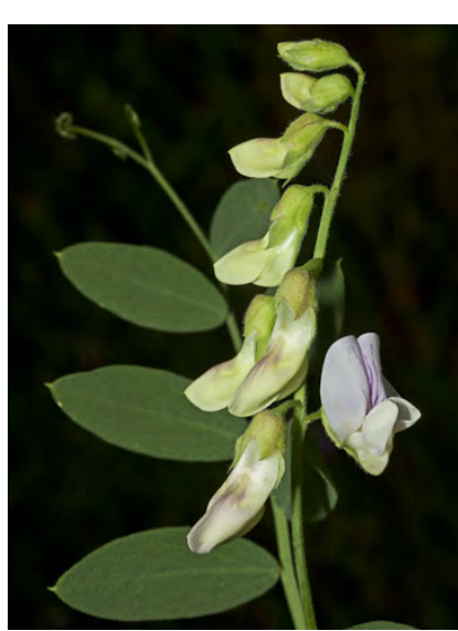
PACIFIC PEA (Lathyrus vestitus var. vestitus) Native Perennial - Pea Family - (Feb-Jul) - North: Conifer forest. South: chaparral & oak woodland - Stem wings to 0.02" wide. Leaves gen elliptic. Flowers 0.5-0.7" long, pale lavender to purple.