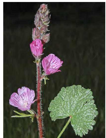
COMMON CHECKERBLOOM (Sidalcea malviflora subsp. malviflora) Native Perennial - Mallow Family - (Mar-Jul) - Coastal prairie, scrub, open forest - Plant 6-24" tall. Middle leaves not linear-lobed. Petals 0.4-1" long, pink to rose, gen white veined.