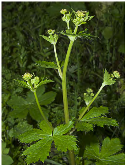
PACIFIC WOODLAND SANICLE (Sanicula crassicaulis) Native Perennial - Carrot Family - (Mar-May) - Open slopes, ravines, woodland - Plants stout, 9-47". Leaves 1-5" across with 3-5 deep, palmate lobes and serrate edges. Flowers yellow.