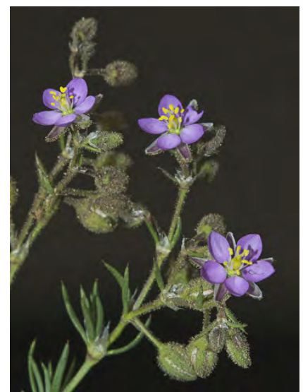
RED SAND-SPURRY (Spergularia rubra) Naturalized Annual-Perennial - Pink Family - (Spring–fall) - Forest, meadows, mud flats, disturbed - Plant 1.6-10". Leaf non-fleshy, whorls w/large white bracts. Petals pink. Stamens 6-10. Sepals < 0.16".