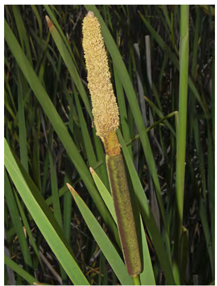
BROAD-LEAVED CATTAIL (Typha latifolia) Native Perennial - Cattail Family - (Jun-Jul) - Unpolluted to nutrient-rich freshwater (brackish) marshes - Plant 4.9-9.8' tall. Widest leaves 0.4-1.1" wide. Flower cluster with no gap between flower types.