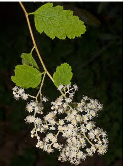
OCEANSPRAY (Holodiscus discolor discolor) Native Perennial - Rose Family -(May-Aug) - Moist woodland edges, rocky slopes - Shrub 5-20' tall. Leaf blade 0.6-3.1" long, toothed at end. Flower cluster 0.8-10" long. Petals white, ~0.07" long.