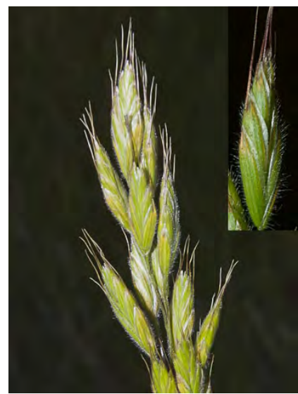
SOFT CHESS (Bromus hordeaceus) Naturalized Annual - Grass Family - (Apr-Jul) - Fields, disturbed areas - Plant 4-26" tall. Leaf hairy. Flower cluster 1-5" long, dense, some stalks > spikelet. Spikelet 0.5-0.9". Lemma 0.26-0.4", awn 0.16-0.4". INVASIVE weed.