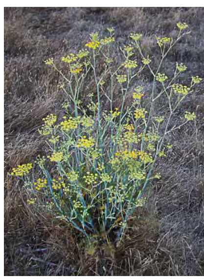
FENNEL (Foeniculum vulgare) Naturalized Perennial - Carrot Family - (May–Sep) - Roadsides, disturbed sites - Plants 3-6.5' tall, anise-scented. Stems waxy-blue, canelike. Flowers yellow. Leaf segments thread-like, edible when young. INVASIVE weed.