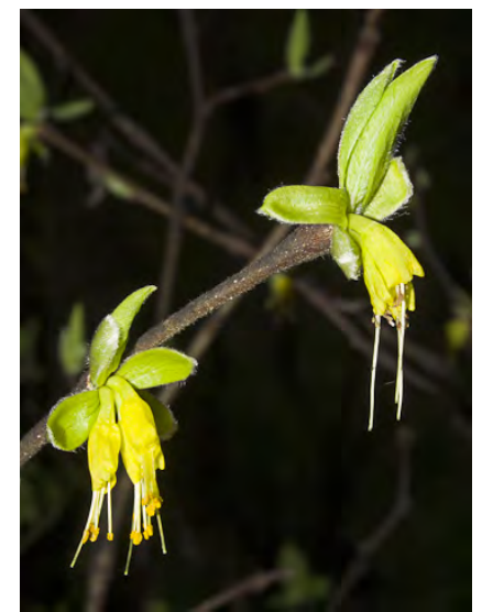
WESTERN LEATHERWOOD (Dirca occidentalis) Native Perennial - Daphne Family - (Nov-Mar) - Gen n facing slopes, mixed-evergreen forest to chaparral, gen fog belt - Shrub 3-10'. Flowers yellow, 1-4 per group, open before/with leaves. CNPS: Fairly ENDANGERED.