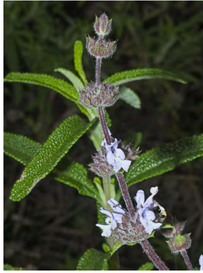
BLACK SAGE (Salvia mellifera) Native Perennial - Mint Family - (Mar–Jun) - Coastal-sage scrub, lower chaparral - Shrub 3.3-6' tall. Leaf 1-2.8" long, toothed, hairy underneath. Flowers blue, white or lavender, tube 0.2-0.4" long, in clusters 0.6-1.6" wide.