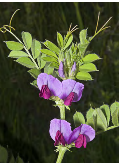
SPRING VETCH (Vicia sativa subsp. sativa) Naturalized Annual - Pea Family - (Mar–Jun) - Roadsides, disturbed areas, grassland, open areas in oak and riparian woodlands - Flowers 1-2 at leaf bases, pink-purple to white, 0.7-1.2" long. Leaflets 0.16-0.4" wide.