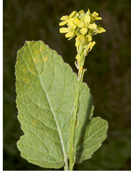
BLACK MUSTARD (Brassica nigra) Naturalized Annual - Mustard Family - (Apr-Sep) - Common. Disturbed areas, fields - Plant 1-6' tall. Petals bright yellow, 0.3-0.4" long. Fruit upright, pressed against stem. INVASIVE weed.