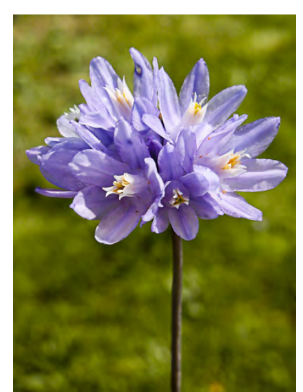
BLUE DICKS (Dichelostemma capitatum subsp. capitatum) Native Perennial - Brodiaea Family - (Mar–Jun) - Open woodland, scrub, desert, grassland - Plant 2-28" tall. Flowers blue-purple, not narrowed in the middle. Stamens 6. Early spring bloomer.