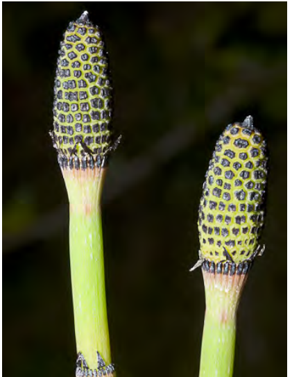
SMOOTH SCOURING RUSH (Equisetum laevigatum) Native Perennial - Horsetail Family - - Moist, sandy or gravelly areas - Stems 1 kind only, 12-71" tall, unbranched. Sheath w/dark band only at the top.