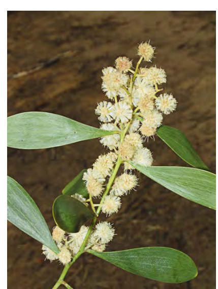
BLACKWOOD ACACIA (Acacia melanoxylon) Naturalized Perennial - Pea Family - (Feb-Mar) -Uncommon. Disturbed areas - Tree < 100' tall. Leaves simple, 0.2-1.2" wide, 3-5 main veins. Flowers pale yellow, 2-8 per head. INVASIVE weed.