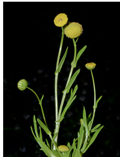
BRASS-BUTTONS (Cotula coronopifolia) Naturalized Perennial - Sunflower Family (Mar-Dec) - Common. Saline and freshwater marshes, mud flats - Plant 2-16"+ tall, smooth, ± fleshy. Leaves linear to lance-shaped w/linear teeth or lobes. INVASIVE.