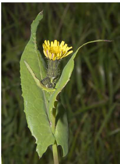
COMMON SOW THISTLE (Sonchus oleraceus) Naturalized Annual - Sunflower Family - (All year) - Abundant. Disturbed places - Plant 4-55" tall. Leaf teeth soft to touch. Basal lobes of upper leaves sharply pointed, straight to curving upward.