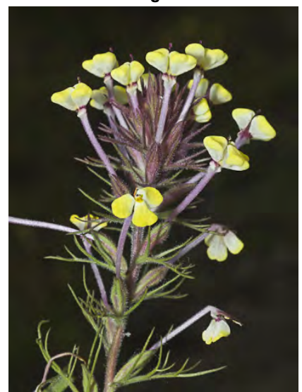
YELLOW JOHNNY-TUCK (Triphysaria eriantha subsp. eriantha) Native Annual - Broom-rape Family - (Mar–May) - Grassland, foothills - Plant 4-14" tall, purple. Leaves 0.4-2" long, 3-7 lobed. Flowers yellow with dark purple beak, 0.4-1" long.