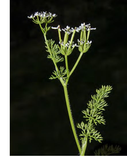
VENUS' NEEDLE (Scandix pecten-veneris) Naturalized Annual - Carrot Family - (Apr–Jun) - Grassy slopes, roadsides - Plant 6-20" tall. Leaf segments finely divided, linear. Flowers white, outer petals larger. Fruit 0.2-1" long with a beak 0.8-2.8" long.