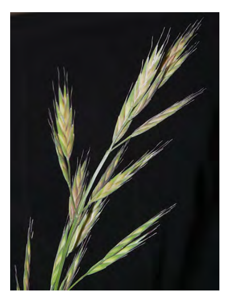
CALIFORNIA BROME (Bromus carinatus var. carinatus) Native Perennial - Grass Family - (Apr-Aug) - Coastal prairies, openings in chaparral, plains, open oak and pine woodland -Plant 20-40" tall. Flower cluster 6-16" long. Spikelet 0.8-1.6" long. Lemma 0.5-0.8" long, hairy, awn 0.3-0.6" long.