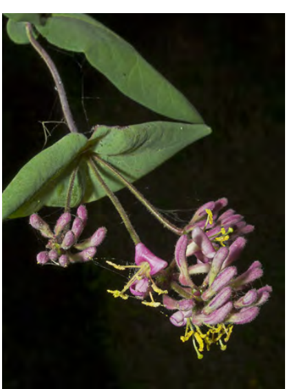
HAIRY VINE HONEYSUCKLE (Lonicera hispidula) Native Perennial - Honeysuckle Family - (May–Jun) - Canyons, streamsides, woodland - Shrub sprawling-climbing, 6-10' long, short-hairy. Flower cluster densely sticky. Flowers pink, 0.5-0.6" long, sticky-hairy.