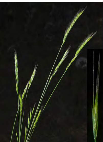
BROME FESCUE (Festuca bromoides) Naturalized Annual - Grass Family - (May–Jun) -Uncommon. Dry, disturbed places, coastal-sage scrub, chaparral - Stem < 20". Inflor 0.6-6" tall, dense, lower branches erect. Spikelet 0.2-0.4" long, awn 0.1-0.3" long.