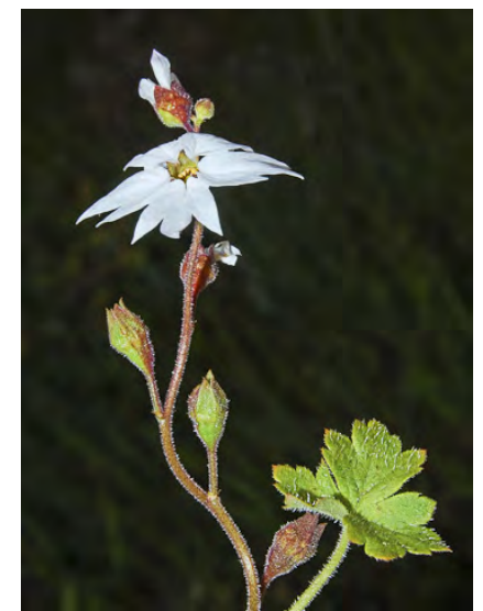
WOODLAND STAR (Lithophragma affine) Native Perennial - Saxifrage Family - (Mar–Apr) - Open, grassy slopes - Plant 4-24" tall. Leaves w/3-5 sharp-toothed shallow lobes, stem leaves alternate. Petals 0.2-0.5" long, white. Hypanthium funnel-shaped.