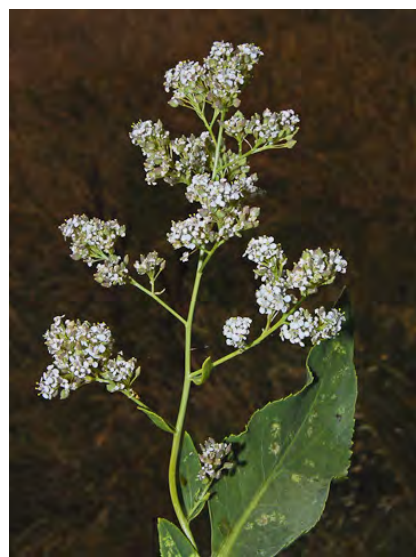
PERENNIAL PEPPERGRASS (Lepidium latifolium) Naturalized Perennial - Mustard Family - (Jun—Sep) - Pastures, disturbed areas, fields, grassland, saline meadows, streambanks, sagebrush scrub, edge of marshes - Plant 14-47". Petals white. NOXIOUS.