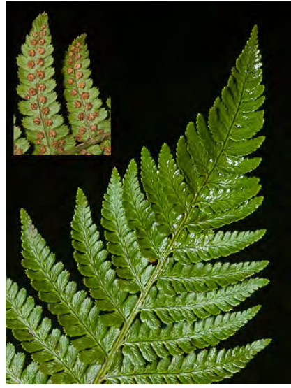
COASTAL WOOD FERN (Dryopteris arguta) Native Perennial - Wood Fern Family - - - Locally common. Open, wooded slopes, caves - Leaf 12-24" long,5-12" wide, divided 1-2 times. Segments generally with spine-tipped teeth.