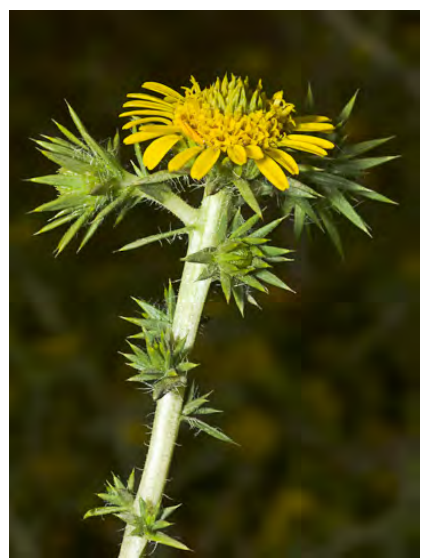
COMMON SPIKEWEED (Centromadia pungens subsp. pungens) Native Annual - Sunflower Family - (Apr–Nov) - Grassland, saltbush scrub, disturbed sites - Spiny. Leaves smooth or rough to the touch.