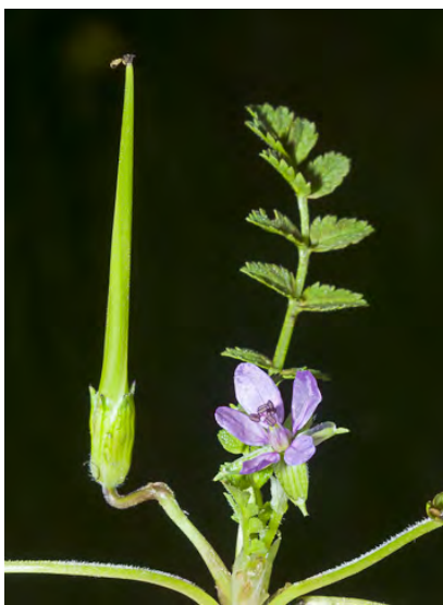
LONG-BEAKED FILAREE (Erodium botrys) Naturalized Annual - Geranium Family -(Mar-Jul) - Dry, open or disturbed sites - Stem 4-35" tall, coarse-hairy. Leaves lobed. Petals pink, 0.3-0.5" long. Sepals w/reddish tip. Fruit beak 2-4.7" long.