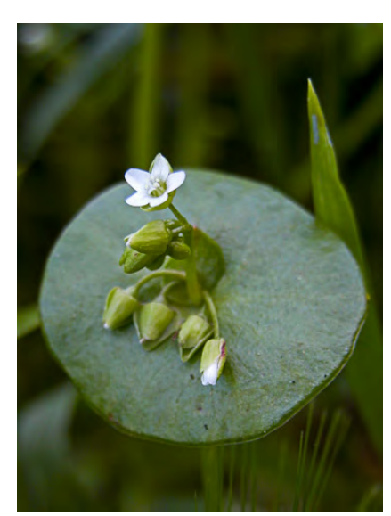
COMMON MINER'S LETTUCE (Claytonia perfoliata subsp. perfoliata) Native Annual - Miner's Lettuce Family - (Jan–May) - Vernally moist, often shady or disturbed sites - Basal leaf length <3x width. Stem leaf gen not angled. Seeds shiny w/large appendage.