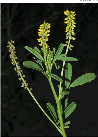
SOURCLOVER (Melilotus indicus) Naturalized Annual-Biennial - Pea Family - (Apr—Oct) - Open, disturbed areas - Stem 4-24" long. Leaflets 3, 0.4-1" long. Flowers yellow, ~0.1" long.