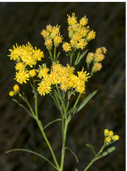
WESTERN GOLDENROD (Euthamia occidentalis) Native Perennial - Sunflower Family - (Jul-Nov) - Marshes, streambanks, meadows - Stem < 6.6', smooth. Leaves < 4" long, <= 0.24" wide, w/dark glandular pits. Flowers yellow, rays 0.06-0.1" long.