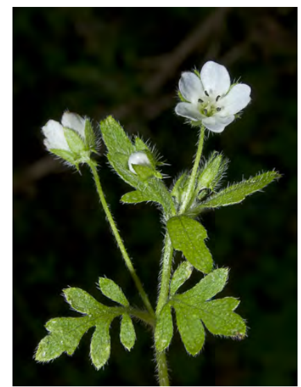
VARIABLE-LEAF NEMOPHILA (Nemophila heterophylla) Native Annual - Borage Family - (Feb-Jun) - Common. Forest, chaparral, roadsides, streambanks - Flower 0.1-0.4" long, unspotted, bract appendages < 0.04" long in fruit.