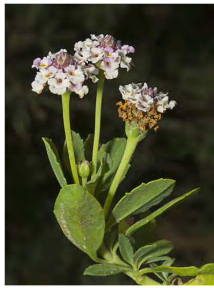
LEMON VERBENA (Phyla nodiflora) Native Perennial - Vervain Family - (May–Nov) - Wet places, pond margins - Mat-like. Leaf blade 0.2-1.2" long, < 0.4" wide, 5-11 teeth. Flowers white to red. Flower stem 0.6-3.5" tall. Ornamental.