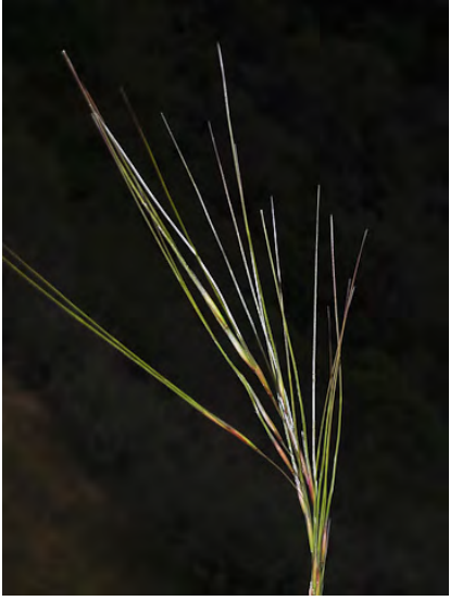
PURPLE NEEDLE GRASS (Stipa pulchra) Native Perennial - Grass Family - (Mar–Jun) - Oak woodland, chaparral, grassland - Stem 14-39" long. Leaf blade 4-8" long. Glumes 0.5-0.8" long, ~equal. Awn 1.6-4" long, last segment straight.