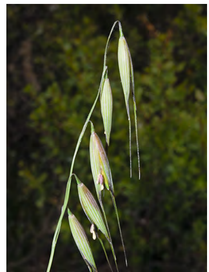
WILD OAT (Avena fatua) Naturalized Annual - Grass Family - (Apr-Jun) - Disturbed sites - Plants 1-5' tall. Spikelets 0.7-1.3" long. Low awn 1-1.6" long. Lemma tip bristles < 0.04" long. Seeds EDIBLE whole or ground for flour. INVASIVE weed.