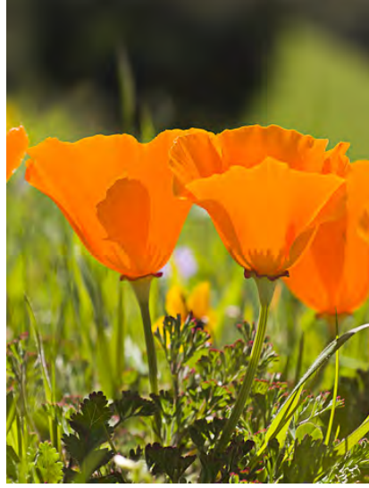
CALIFORNIA POPPY (Eschscholzia californica) Native Perennial - Poppy Family - (Feb-Sep) - Grassy, open areas - Plant 2-24" tall. Flower w/spreading rim <= 0.2". Petals 0.8-2.4" long, early spring = large and orange, fall = smaller and yellow.