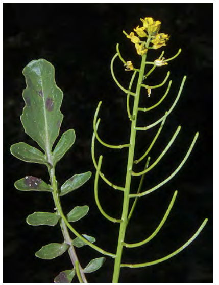
ERECT-POD WINTER CRESS (Barbarea orthoceras) Native Perennial - Mustard Family - (Mar–Jul) - Meadows, streambanks, moist woodland, grassland - Stem 8-24". Lower leaves w/large terminal lobe, upper clasping stem. Petals bright yellow, 0.2-0.3" long.