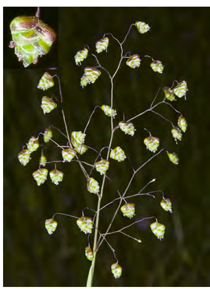
LITTLE QUAKING GRASS (Briza minor) Naturalized Annual - Grass Family - (Apr–Jul) - Shaded or moist, open sites - Stem 3-20" tall. Spikelets 0.1-0.2" long, resemble tiny rattlesnake rattles