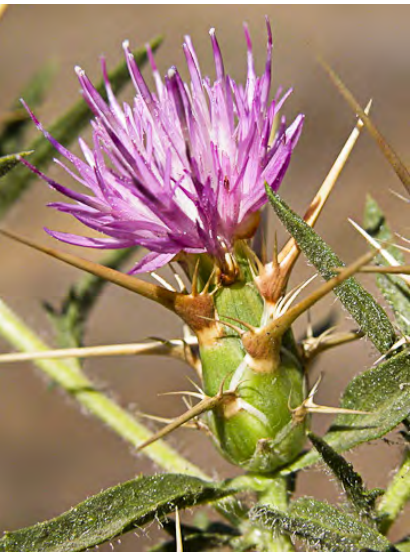
PURPLE STAR-THISTLE (Centaurea calcitrapa) Naturalized Annual-Biennial - Sunflower Family -(Apr-Nov) - Pastures, disturbed places - Plant 8-40"+. Basal leaves 1-2x divided into narrow lobes. Flowers purple with spiny bracts. NOXIOUS weed.