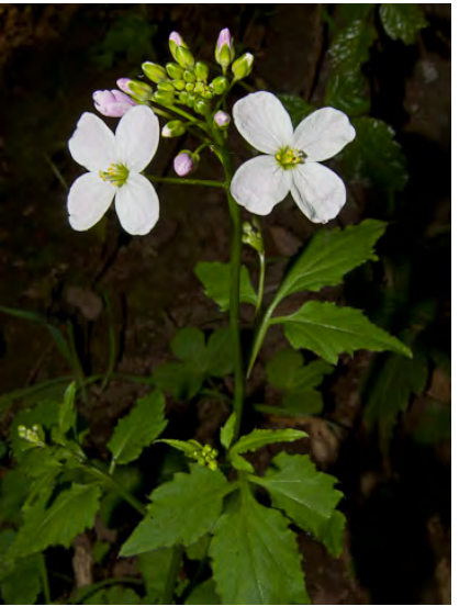
MILK MAIDS (Cardamine californica) Native Perennial - Mustard Family - (Jan-May) - Gen shaded sites, canyons, woodland. One of first spring flowers - Stem 10-24" long. Leaves lobed to compound w/sharp teeth. Petals white or pale rose, 0.3-0.5" long.