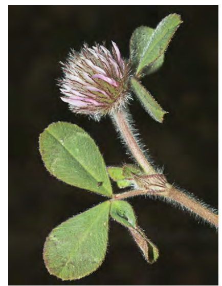
ROSE CLOVER (Trifolium hirtum) Naturalized Annual - Pea Family - (Apr–May) - Disturbed areas, roadsides - Head with 1-2 bract-like leaves immed below. Flowers pink, 0.4-0.6" long, densely-bristly in fruit. INVASIVE weed.