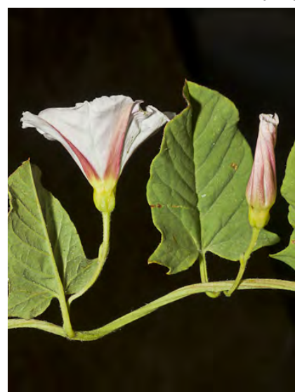
BINDWEED (Convolvulus arvensis) Naturalized Perennial - Morning-glory Family - (Mar–Oct) - Roadsides, open areas in many pl communities - Trailing. Leaf 0.8-1.2" long, w/round tip, pointed lobes. Flowers white to pink, 0.8-1" long. NOXIOUS.