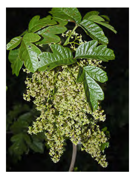
WESTERN POISON OAK (Toxicodendron diversilobum) Native Perennial - Sumac Family - (Apr–Jun) - Canyons, slopes, chaparral, coastal scrub, oak woodland - Shrub or vine. Leaflets 3, red in fall, mid leaflet stalked. Flowers green. Fruits white. TOXIC.