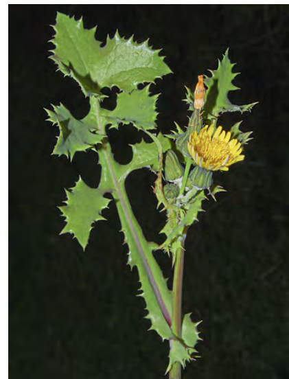
PRICKLY SOW THISTLE (Sonchus asper subsp. asper) Naturalized Annual - Sunflower Family - (All year) - Common. Slightly moist disturbed sites, along streams - Plant 4-48". Leaf teeth prickly. Basal lobes of upper leaves rounded, curving downward.