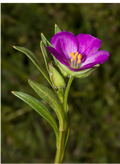
RED MAIDS (Calandrinia ciliata) Native Annual - Miner's Lettuce Family - (Feb-May) - Common. Sandy to loamy soil, grassy areas, cult fields - Petals 0.2-0.6" long, bright pink to red, round-tipped. Fruit < 0.1" longer than bracts.