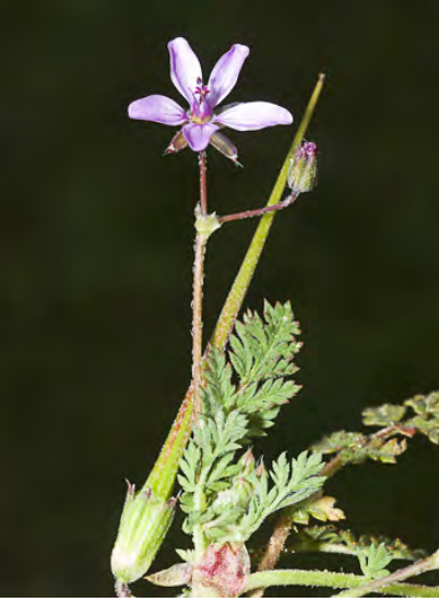
REDSTEM FILAREE (Erodium cicutarium) Naturalized Annual - Geranium Family (Feb-Sep) - Open, disturbed sites, grassland, scrub - Stem 4-20". Leaves compound, leaflets dissected. Sepal tip bristly. Petal pink to purple. Fruit beak 0.8-2". INVASIVE.