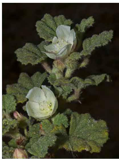
ALKAL-MALLOW (Malvella leprosa) Native Perennial - Mallow Family - (Apr-Nov) - Valleys, gen saline - Stem 4-16" long. Leaf blade 04.-1.4" long, toothed, densely short-hairy. Petals cream-white to yellow, 0.4-0.6" long.