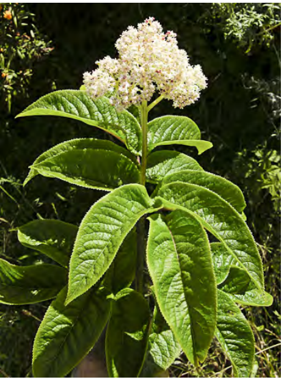
RED ELDERBERRY (Sambucus racemosa var. racemosa) Native Perennial - Muskroot Family -(May-Jul) - Moist places - Shrub/tree 3-20' tall. Leaflets 5-7, 1.6-6.3" long. Flower cluster dome-shaped, gen 6-12 cm diam, petals often reflexed. Fruits red.