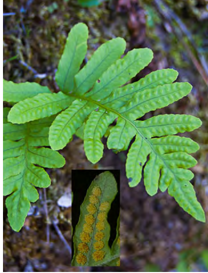
POLYPODY FERN (Polypodium calirhiza) Native Perennial - Polypody Family - - - On plants, rocky cliffs or outcrops, roadcuts, often granitic or volcanic, rarely dunes - Leaf blades 4-8" long, often widest above base, deeply lobed.