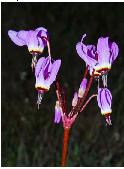
MOSQUITOBILLS SHOOTING STAR (Dodecatheon hendersonii) Native Perennial - Primrose Family - (Mar–Jul) - Gen in shady sites - Leaf blade length generally <2x width. Flower parts 4s or 5s. Filament tube solid black.