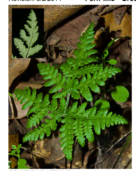
GOLDENBACK FERN (Pentagramma triangularis subsp. triangularis) Native Perennial - Brake Fern Family - - - Gen shaded, sometimes rocky or wooded areas - Leaves triangular, 1.2-4" long, undersides either granular green or powdery gold.