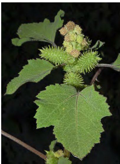
COCKLEBUR (Xanthium strumarium) Native Annual - Sunflower Family - (Jul-Oct) -Disturbed, seasonally wet, often alkaline sites, in grassland, marshes, watercourses - Plant 4-32" tall. Stem spineless. Bur 0.4-1.2"+ long.