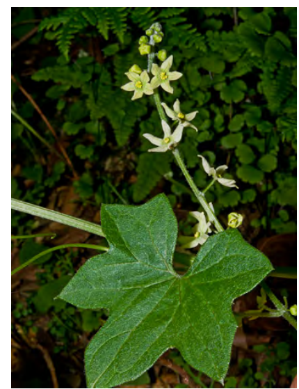
CALIFORNIA MAN-ROOT (Marah fabacea) Native Perennial - Gourd Family - (Feb-Apr) -Streamsides, washes, shrubby open areas - Vine 6-20' long. Leaves moderately lobed. Flowers cream or white, < 0.3" wide. Fruit spiny all over.