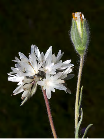
BLOW WIVES (Achyrachaena mollis) Native Annual - Sunflower Family - (Mar–Jun) - Common. Grassy sites, often clay soils - Plant 2-24" tall, soft-hairy. Flowers yellow turning red, 0.1-0.5" wide, extend < 0.1" beyond green bracts. Showy, flat scales attached to seeds.