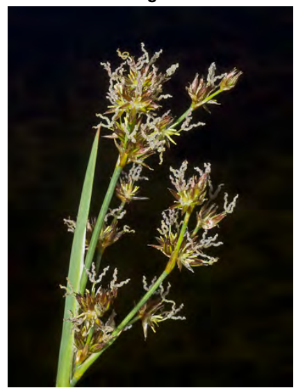
IRIS-LEAVED RUSH (Juncus xiphioides) Native Perennial - Rush Family - (Jul-Oct) - Wet places - Plant 16-32" tall. Leaf blades 0.2-0.5" wide, flat, ris-like. Heads many, few-flowered. Anthers 6, < filaments, flowers self-pollinating.