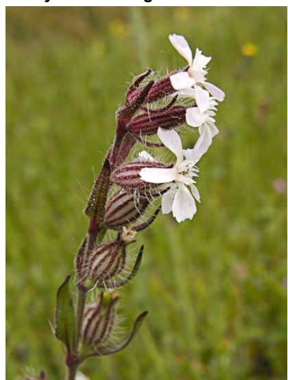
SMALL-FLOWER CATCHFLY (Silene gallica) Naturalized Annual - Pink Family - (Spring-early summer) - Fields, disturbed areas - Plant 4-16". Leaves < 1.4" long. Flower cluster short-hairy, racts sticky-hairy, petal blade 0.2-0.5" long, smooth to notched, white to pink.