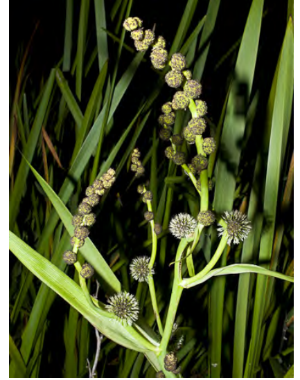
BROAD-FRUITED BUR-REED (Sparganium eurycarpum var. eurycarpum) Native Perennial - Cattail Family - (Jun-Aug) - Marshes, lakes, ponds, along streams - Plant to 8' tall. Flower cluster stem branched, clusters spherical. Styles