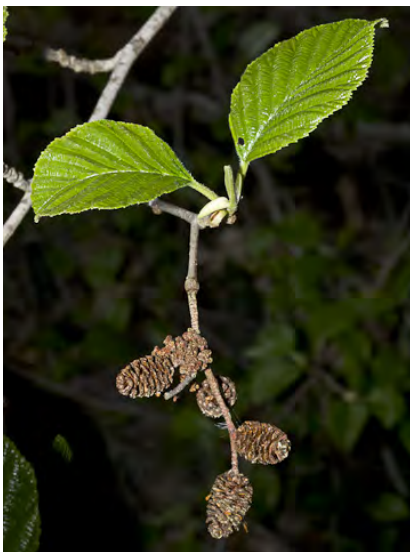
WHITE ALDER (Alnus rhombifolia) Native Perennial - Birch Family - (Apr–Jun) - Along permanent streams - Tree. Leaves flat, not rusty underneath, margins serrate, not rolled under. Female flowers cone-like. Wood used for furniture and for smoking meats.