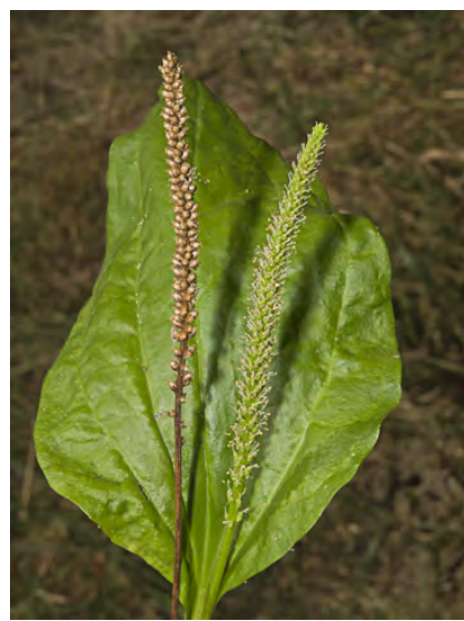
COMMON PLANTAIN (Plantago major) Naturalized Annual-Perennial - Plantain Family -(Apr–Sep) - Disturbed areas - Leaves basal, blades 5-18 cm long, broadly oval, not hairy. Flowers + stem 2-24" tall, flower cluster gen 1.2-8" long.