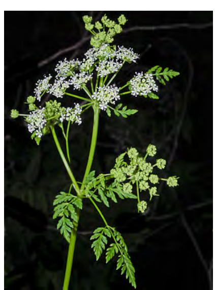
POISON HEMLOCK (Conium maculatum) Naturalized Biennial - Carrot Family - (Apr-Jul) -Common. Moist, esp disturbed places - Plants 2-10' tall. Stems purple-spotted. Leaves fern-like, gen 2x divided. Flowers white. TOXIC. INVASIVE