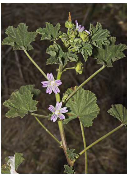
BULL MALLOW (Malva nicaeensis) Naturalized Annual - Mallow Family - (Mar–Jun) - Disturbed places - Stem 0.7-2'. Leaf blade 1.2-4.7" wide, 5-7 shallow lobes. Bractlets egg-shaped,0.16-0.2" long. Petals pink to blue-violet, 0.2-0.5" long.