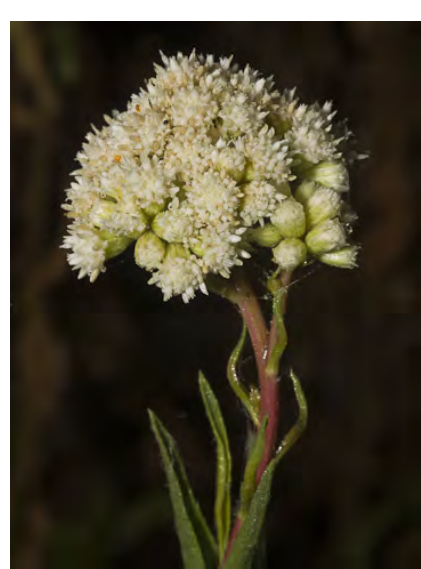
MARSH BACCHARIS (Baccharis glutinosa) Native Perennial - Sunflower Family - (Jul-Oct) -Coastal freshwater and saltwater marshes, streambanks - Plant herbaceous, sticky, 3-6' tall. Leaf blades lance-shaped, < 5" long, 0.5-1.2"