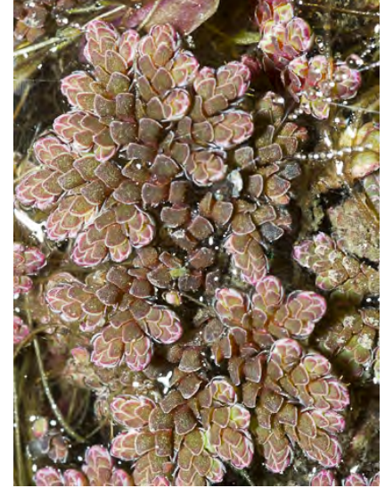
MOSQUITO FERN (Azolla filiculoides) Native Perennial - Mosquito Fern Family - - - Common. Ponds, slow streams - Floating aquatic fern, green to red. Stem gen 0.4-1.2" long. Leaves oval, gen ~0.06" long by 0.04" wide. NITROGEN