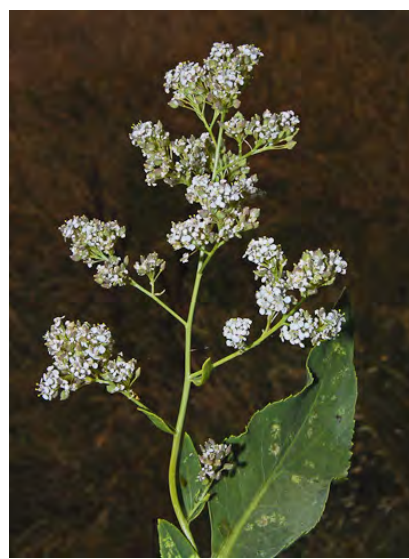
PERENNIAL PEPPERGRASS (Lepidium latifolium) Naturalized Perennial - Mustard Family - (Jun-Sep) - Pastures, disturbed areas, fields, grassland, saline meadows, streambanks, sagebrush scrub, edge of marshes - Plant 14-47". Petals white. NOXIOUS.