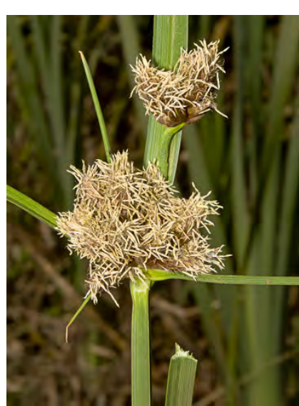
OLNEY'S THREE-SQUARE BULRUSH (Schoenoplectus americanus) Native Perennial - Sedge Family - (Summer) - Mineral-rich or brackish marshes, shores, fens, springs - Stem 1.2-8.2' tall, sharply 3-angled, not leafy. Flower cluster head-like.