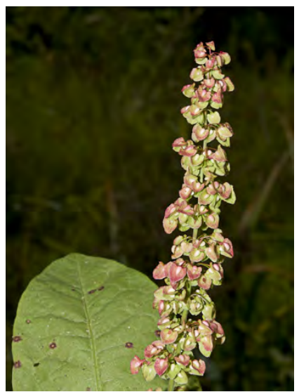
CURLY DOCK (Rumex crispus) Naturalized Perennial - Buckwheat Family - (All year) - Abundant. Disturbed places - Stem 16-39" tall. Flower cluster dense, valves 0.2-0.24", winged around tubercles, smooth edged. 1 tubercle enlarged. INVASIVE.