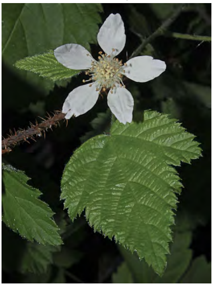
CALIFORNIA BLACKBERRY (Rubus ursinus) Native Perennial - Rose Family - (Mar–Jul) - Open, disturbed areas - Stem round, pristly/prickly. Leaves simple to 3 leaflets, underside green. Plants unisexual. Petals 0.24-0.6" long, white. Blackberry-type fruit.