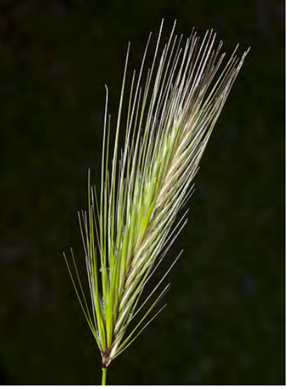
WALL BARLEY (Hordeum murinum subsp. murinum) Naturalized Annual - Grass Family - (Feb-May) - Moist, gen disturbed sites - Stem 1-2'. Leaf auricles notable. Central spikelet stalk 0-0.02". Central floret gen = lateral florets. INVASIVE weed.