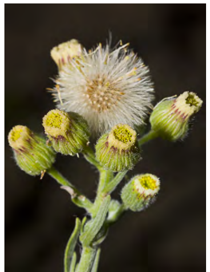
FLAX-LEAVED HORSEWEED (Erigeron bonariensis) Naturalized Annual - Sunflower Family - (All year) - Disturbed sites - Plant 4-39" tall, gray-hairy. Upper leaves narrow. Disk flowers yellow, disk-like rays white. Head bracts 0.14-0.2" tall.