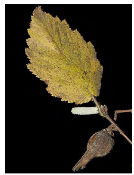
CALIFORNIA HAZELNUT (Corylus cornuta subsp. californica) Native Perennial - Birch Family - (Jan–Mar) - Common. Many habitats, esp moist, shady places - Shrub, small tree < 13' tall. Leaf velvetry-hairy. Fruits 0.8-1.2" long in papery bracts, 1-2/group.