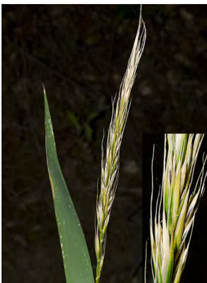
BEARDLESS WILD RYE (Elymus triticoides) Native Perennial - Grass Family - (Jun-Jul) - Dry to moist, often saline, meadows - Plant 18-50" tall, from rhizomes. Flower cluster 2-8" long. Spikelets generally 2/node. Lemmas 3-7, 0.2-0.5" long, awn to 0.12" long.