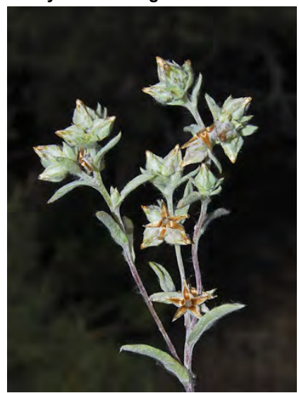
DAGGERLEAF COTTONROSE (Logfia gallica) Naturalized Annual - Sunflower Family - (Mar–Jul) - Bare or grassy openings, burns - Plant 1-20" tall, gen cobwebby. Leaves awl-shaped, stiff, > flower heads. Flowers brown to yellow.