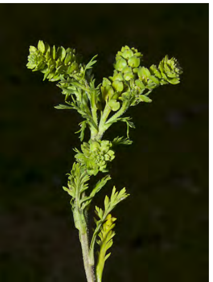
PROSTRATE PEPPERGRASS (Lepidium strictum) Naturalized Annual - Mustard Family - (Apr-Jun) - Uncommon. Disturbed areas, woodland, slopes - Stem 2.8-6.7", gen crawling. Leaves pinnately lobed. Flower cluster crowded, stallk < fruit, sepals stay.