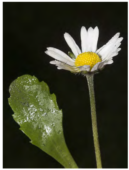
ENGLISH DAISY (Bellis perennis) Naturalized Perennial - Sunflower Family - (Dec-Sep) -Damp, grassy areas - Herbaceous lawn weed. Leaves 0.8-4" long, spoon-shaped. Ray flowers white, 0.3-0.4" long, narrow. Disk flowers yellow, ~ 0.1" long.