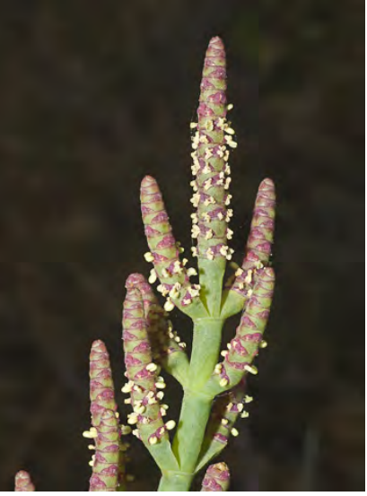
PACIFIC PICKLEWEED (Salicornia pacifica) Native Perennial - Goosefoot Family - (Jul-Nov) - Salt marshes, alkaline flats - Plant 4-28" tall, branching from base, branches opposite. Flower clusters 0.8-3.3" long, 0.1-0.2" wide.