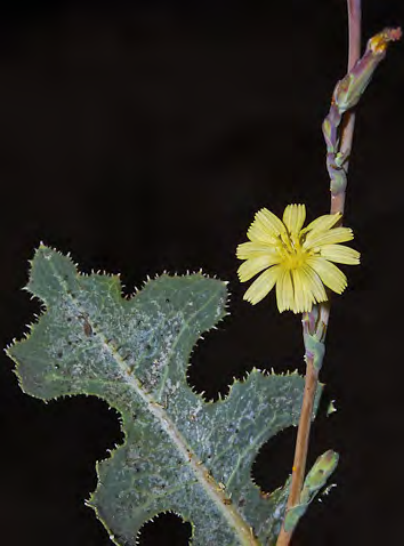
PRICKLY LETTUCE (Lactuca serriola) Naturalized Annual - Sunflower Family (May–Oct) - Abundant. Disturbed places - Stem 1.6-10' tall, prickly-bristly. Leaves deeply-lobed, midvein and edges prickly-bristly. Flowers pale yellow, 0.16-0.2" wide.