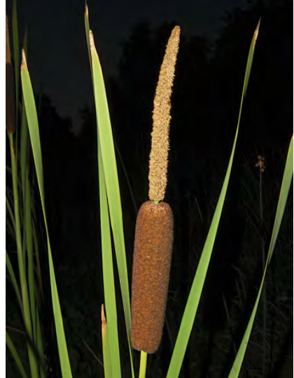
NARROW-LEAVED CATTAIL (Typha angustifolia) Native Perennial - Cattail Family - (May-Aug) - Nutrient-rich freshwater to brackish marshes, wet disturbed places - Plant 4.9-9.8' tall. Leaves gen < 0.4" wide. Flower cluster gap > 0.4"