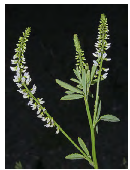
WHITE SWEETCLOVER (Melilotus albus) Naturalized Annual-Biennial - Pea Family (May-Sep) - Locally abundant. Pastures, open disturbed sites - Stem 1.6-6.6' long. Leaflets 3, 0.4-1" long, toothed. Flowers white, 0.14-0.2" long.