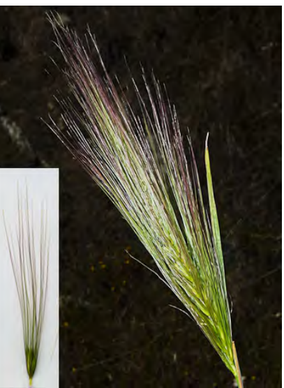
BIG SQUIRRELTAIL (Elymus multisetus) Native Perennial - Grass Family - (May-Jul) - Open, sandy to rocky areas - Tufted. Stem 6-24" tall. Leaf 0.06-0.2" wide. Spikelet 0.4-0.6" long. Glume divisions needle-shaped, lemma awn 1-4"