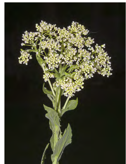
HEART-PODDED HOARY CRESS (Lepidium draba) Naturalized Perennial - Mustard Family - (Apr-Aug) - Disturbed areas, saline soils, pastures, fields - Stem gen 9-26" tall. Flowers white. Sepals smooth. Fruit smooth, heart-shaped. NOXIOUS weed.