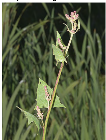
FAT-HEN (Atriplex prostrata) Native Annual -Goosefoot Family - (Apr-Oct) - Wet places, marshes - Plant 4-48" tall, branched at base. Leaves alternate, blades 0.4-3.5" long, triangular, green, not dense-scaly underneath.