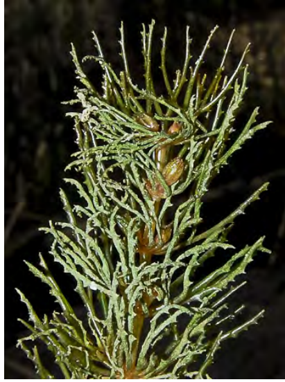
HORNWORT (Ceratophyllum demersum) Native Annual - Hornwort Family - (Jun—Aug) - Common. Ditches, lakes, ponds, pools, slow watercourses; water 0.1—4 m deep, fresh to ± brackish, medium to high nutrient levels. - Leaves forked, serrate, or the common state of the common state of the common state of the common state.