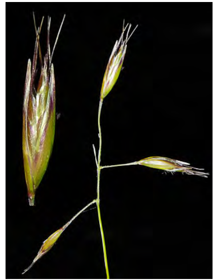
CALIFORNIA OAT GRASS (Danthonia californica) Native Perennial - Grass Family - (Apr–Aug) - Gen moist meadows, open woodland - Stem 12-52" tall. Flower cluster 0.8-2.4" long. Spikelets 3-6, 0.5-1" long, awn 0.16-0.5" long.