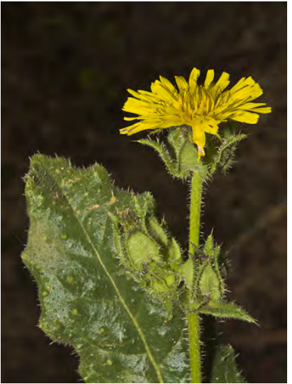
BRISTLY oX-TONGUE (Helminthotheca echioides) Naturalized Annual-Biennial - Sunflower Family - (All year) - Common. Disturbed areas - Stem 1-6.5' tall, bristly. Leaf 2-8" long, covered with prickly bumps. Flower heads 0.8-1.6" wide. INVASIVE weed.