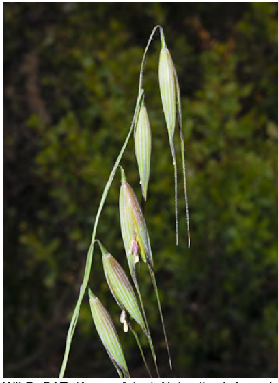
WILD OAT (Avena fatua) Naturalized Annual -Grass Family - (Apr–Jun) - Disturbed sites -Plants 1-5 tall. Spikelets 0.7-1.3" long. Low awn 1-1.6" long. Lemma tip bristles < 0.04" long. Seeds EDIBLE whole or ground for flour. INVASIVE weed.