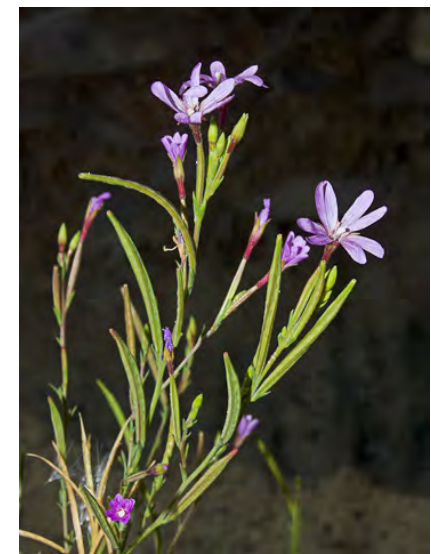
PANICLED / WEEDY WILLOWHERB (Epilobium brachycarpum) Native Annual - Evening Primrose Family - (Jun-Sep) - Common. Dry open or disturbed woodland, grassland, roadsides - Plant 8-79" tall, diffuse. Petals 2-15 mm long, white to rose-purple.