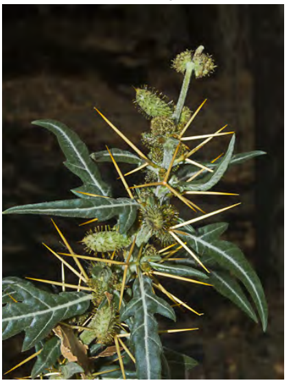
SPINY COCKLEBUR (Xanthium spinosum) Native Annual - Sunflower Family - (Jul-Oct) - Disturbed, seasonally wet, often alkaline sites, in grassland, marshes, watercourses - Plant 4-24". Stem node spines 0.6-1.2" long, golden, gen 3-lobed. Bur 0.4-0.5" long.