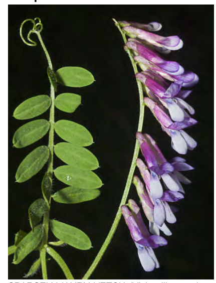
SPARSELY HAIRY VETCH (Vicia villosa subsp. varia) Naturalized Annual-Biennial - Pea Family - (Mar-Jun) - Grassland, roadside, disturbed areas - Stems w/few hairs. Flowers 10-20, blue-purple to white, 0.4-0.55" long. Lower bract lobes 0.04-0.1" long.