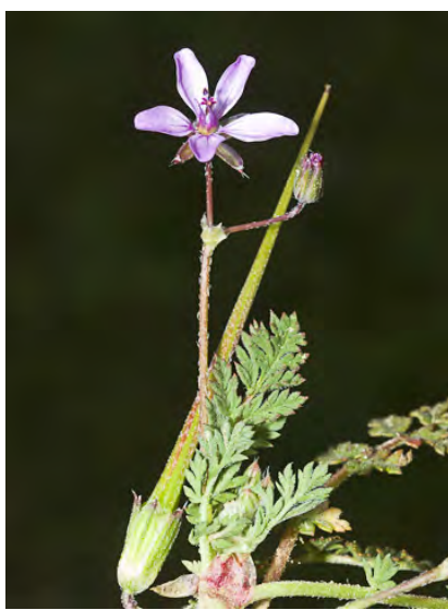
REDSTEM FILAREE (Erodium cicutarium) Naturalized Annual - Geranium Family (Feb-Sep) - Open, disturbed sites, grassland, scrub - Stem 4-20". Leaves compound, leaflets dissected. Sepal tip bristly. Petal pink to purple. Fruit beak 0.8-2". INVASIVE.