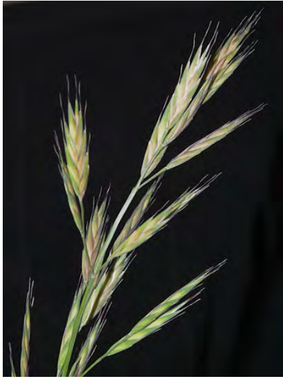
CALIFORNIA BROME (Bromus carinatus var. carinatus) Native Perennial - Grass Family -(Apr-Aug) - Coastal prairies, openings in chaparral, plains, open oak and pine woodland -Plant 20-40" tall. Flower cluster 6-16" long. Spikelet 0.8-1.6" long. Lemma 0.5-0.8" long, hairy, awn 0.3-0.6" long.