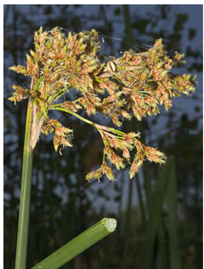
SOUTHERN BULRUSH (Schoenoplectus californicus) Native Perennial - Sedge Family - (Spring-summer) - Common. Brackish to fresh marshes, shores - Stem 3.3-13' tall, slender, bright green, bluntly 3-angled. Flower cluster somewhat open.