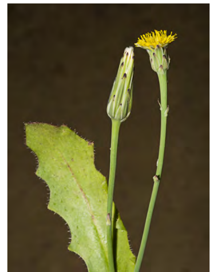
SMOOTH CAT'S-EAR (Hypochaeris glabra) Naturalized Annual - Sunflower Family (Mar-Jun) - Common. Disturbed areas, grassland, open woodland - Plant 4-24" tall, smooth. Rays 0.2-0.3" long, barely > head bracts. Only inner fruit beaked. INVASIVE.