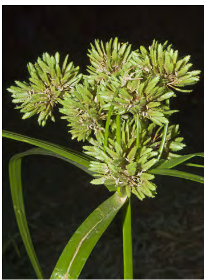
TALL NUTSEDGE (Cyperus eragrostis) Native Perennial - Sedge Family - (May–Nov) - Vernal pools, streambanks - Leaves basal. Flower cluster bracts 4-8. Spikelets 0.2-0.8" long, oblong, in heads to 1.6" wide. Seeds short-stalked.