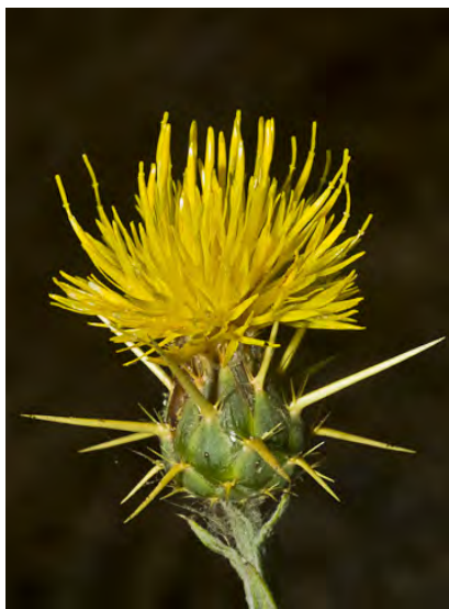
YELLOW STAR-THISTLE (Centaurea solstitialis) Naturalized Annual - Sunflower Family (May-Oct) - Invasive, roadsides, disturbed grassland or woodland - Plant 4-39" tall. Leaves woolly, extend down the stem. Flower bract spines 0.4-1" long. NOXIOUS weed.