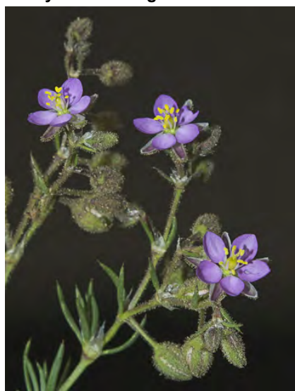
RED SAND-SPURRY (Spergularia rubra) Naturalized Annual-Perennial - Pink Family -(Spring-fall) - Forest, meadows, mud flats, disturbed - Plant 1.6-10". Leaf non-fleshy, whorls w/large white bracts. Petals pink. Stamens 6-10. Sepals < 0.16".