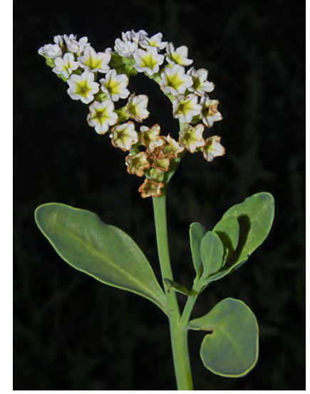
SEASIDE HELIOTROPE (Heliotropium curassavicum var. oculatum) Native Perennial - Borage Family - (Feb-Oct) - Moist to dry, saline to alkaline soils, gen near water - Plant fleshy. Leaf 0.4-2.4 cm long. Flowers white w/ yellow center, 0.12-0.2" long.