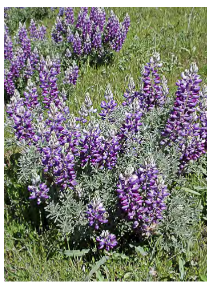
BUSH LUPINE (Lupinus albifrons var. albifrons) Native Perennial - Pea Family - (Mar–Jun) -Common. Chaparral, foothill woodland - Shrub 2-16' tall, gen distinct trunk, green to silvery. Flowers 0.35-0.6' long, purple, banner back hairy, keel top ciliate mid to tip.