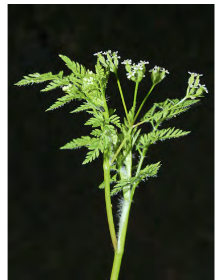
BUR-CHERVIL (Anthriscus caucalis) Naturalized Annual - Carrot Family - (Apr-Jun) - Generally shady places - Plant 18-40" tall. Flowers white; flower stalk >= fruit length. Fruits 0.1-0.2" long with curved "velcro" bristles. Leaves fern-like, triangular outline.