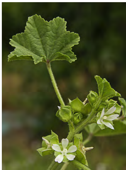
CHEESEWEED (Malva parviflora) Naturalized Annual - Mallow Family - (Mar–May) - Common. Disturbed places - Stem 8-32" long, gen erect, widely branched. Flower bractlets linear. Petals 0.1-0.2" long, pink to gen white. Fruit with flange from flower bracts.