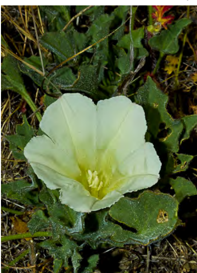
SHORTSTEM MORNING-GLORY (Calystegia subacaulis subsp. subacaulis) Native Perennial - Morning-glory Family - (Apr-Jun) - Dry, open scrub or woodland - Stem gen ~0.8" long. Flowers 1.3-2.4" long, white or cream. Bractlets concealing flower bracts.