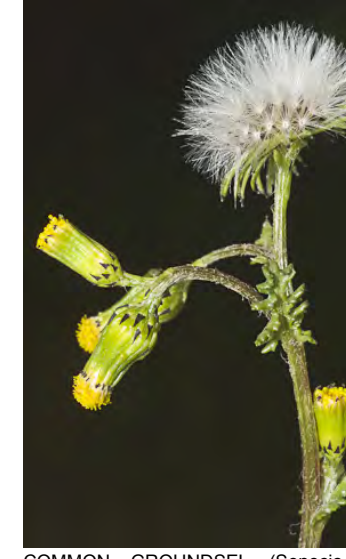
COMMON GROUNDSEL (Senecio vulgaris) Naturalized Annual - Sunflower Family -(Feb-Jul) - Common. Disturbed areas - Plant 4-24" tall, not hairy, w/1-10+ stems. Flower head bracts with black-tips. Milky sap.