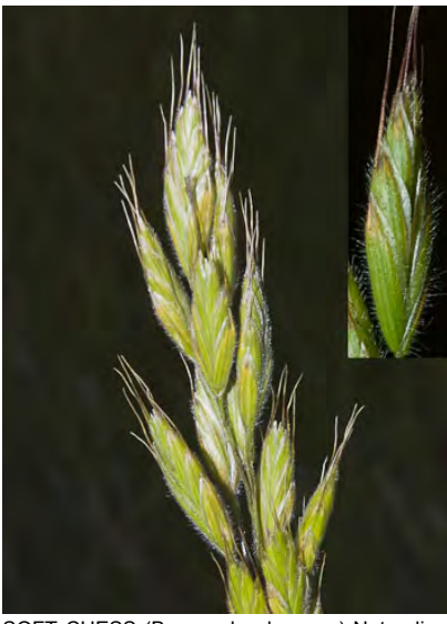
SOFT CHESS (Bromus hordeaceus) Naturalized Annual - Grass Family - (Apr-Jul) - Fields, disturbed areas - Plant 4-26" tall. Leaf hairy. Flower cluster 1-5" long, dense, some stalks > spikelet. Spikelet 0.5-0.9". Lemma 0.26-0.4", awn 0.16-0.4". INVASIVE weed.