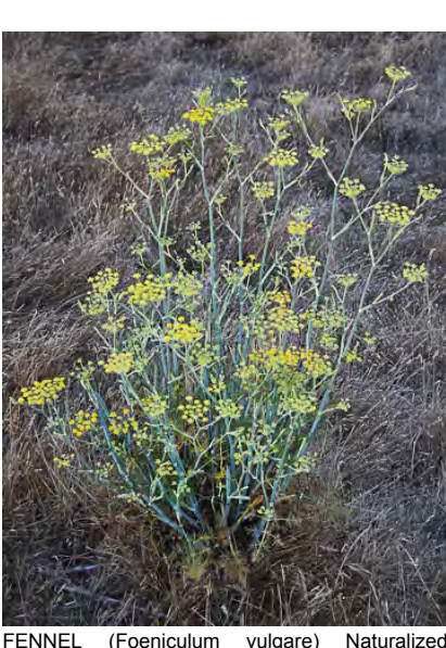
FENNEL (Foeniculum vulgare) Naturalized Perennial - Carrot Family - (May-Sep) -Roadsides, disturbed sites - Plants 3-6.5' tall, anise-scented. Stems waxy-blue, canelike. Flowers yellow. Leaf segments thread-like, edible when young. INVASIVE weed.