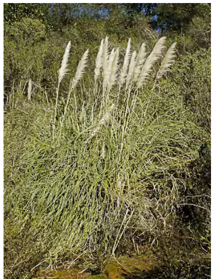
HAIRY PAMPAS GRASS (Cortaderia jubata) Naturalized Perennial - Grass Family - (Sep-Feb) - Disturbed sites, many habitats, esp coastal -Plant 6-23' tall. Leaf blades 0.1-0.5" wide, sheathes hairy. NOXIOUS weed.