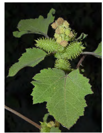
COCKLEBUR (Xanthium strumarium) Native Annual - Sunflower Family - (Jul-Oct) -Disturbed, seasonally wet, often alkaline sites, in grassland, marshes, watercourses - Plant 4-32" tall. Stem spineless. Bur 0.4-1.2"+ long.