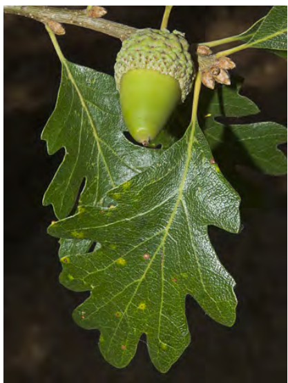
VALLEY OAK (Quercus lobata) Native Perennial - Oak Family - (Mar–Apr) - Slopes, valleys, savanna - Tree < 115' tall, deciduous. Leaves 2-5" long, not leathery, deeply lobed, lobes without bristles. Acorns 1.2-2" long, slender, cup 0.4-1.2" deep.