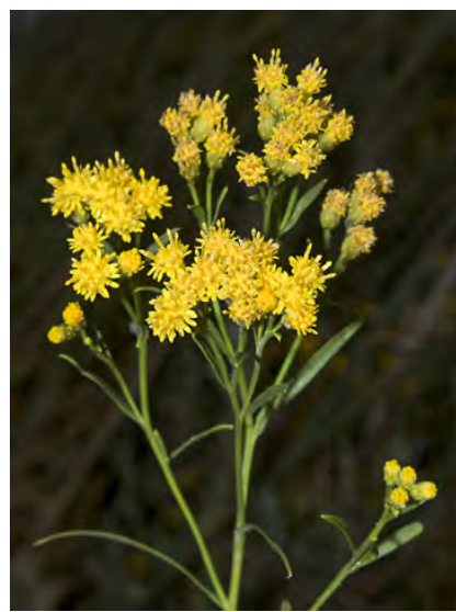
WESTERN GOLDENROD (Euthamia occidentalis) Native Perennial - Sunflower Family - (Jul-Nov) - Marshes, streambanks, meadows - Stem < 6.6', smooth. Leaves < 4" long, <= 0.24" wide, w/dark glandular pits. Flowers yellow, rays 0.06-0.1" long.