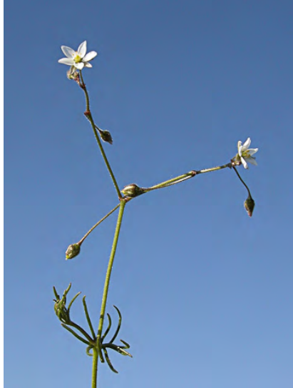
STICKWORT (Spergula arvensis) Naturalized Annual - Pink Family - (Spring-early summer) - Open slopes, pine woodland, sand dunes, fields, disturbed areas - Stem 4-16"+. Leaves 0.4-2" long, linear, in whorls.