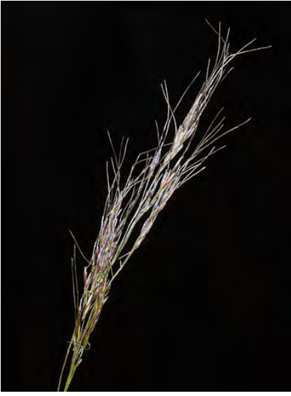
FOOTHILL NEEDLE GRASS (Stipa lepida) Native Perennial - Grass Family - (Mar–Jun) - Dry slopes, chaparral, grassland, savanna, coastal scrub - Stem 14-39" tall. Leaf blade 4.7-9.1" long, narrow. Glumes 0.2-0.6" long. Awn 0.8-2" long.