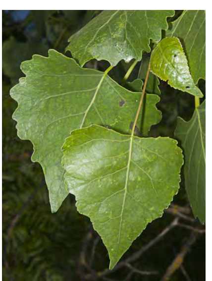
FREMONT COTTONWOOD (Populus fremontii subsp. fremontii) Native Perennial - Willow Family - (Mar–Apr) - Scattered. Alluvial bottomland, streamsides - Tree < 66' tall. Leaves heart-shaped to triangular, coarsely scalloped, blade 1.2-2.8" long.