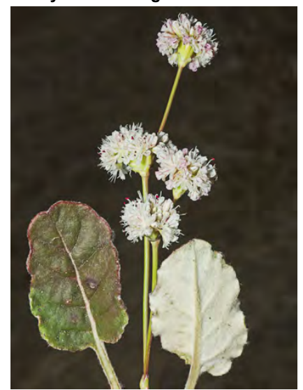
EAR-SHAPED WILD BUCKWHEAT (Eriogonum nudum var. auriculatum) Native Perennial - Buckwheat Family - (May-Oct) - Common. Sand or gravel - Plant 5-15 dm. Leaves on stem, curled. Inflor smooth. Flowers white to pink, smooth.