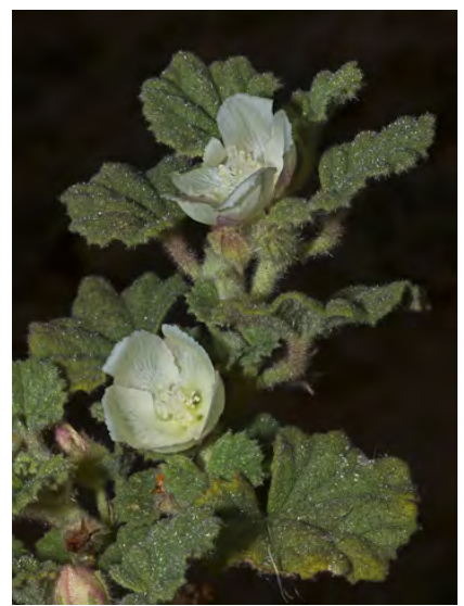
ALKAL-MALLOW (Malvella leprosa) Native Perennial - Mallow Family - (Apr-Nov) - Valleys, gen saline - Stem 4-16" long. Leaf blade 04.-1.4" long, toothed, densely short-hairy. Petals cream-white to yellow, 0.4-0.6" long.