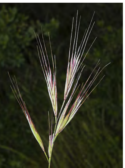
FOXTAIL CHESS (Bromus madritensis subsp. madritensis) Naturalized Annual - Grass Family -(Apr-Jan) - Disturbed areas, roadsides - Plants 4-20" tall. Stem and sheathes smooth. Flower cluster branches visible, lower spikelets erect, >