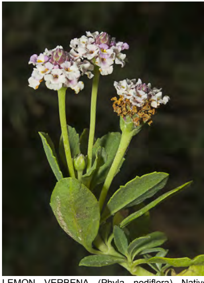
LEMON VERBENA (Phyla nodiflora) Native Perennial - Vervain Family - (May–Nov) - Wet places, pond margins - Mat-like. Leaf blade 0.2-1.2" long, < 0.4" wide, 5-11 teeth. Flowers white to red. Flower stem 0.6-3.5" tall. Ornamental.