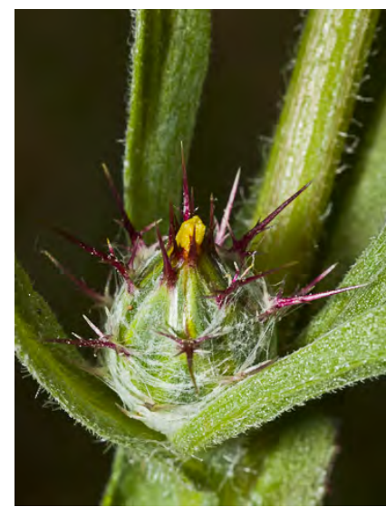
TOCALOTE (Centaurea melitensis) Naturalized Annual - Sunflower Family - (Apr–Jul) - Disturbed fields, open woodland - Plant 4-39", gray-hairy, resinous. Leaves 0.8-6" long. Flowers yellow, 0.4-0.8" long, bracts tipped w/purple spines. NOXIOUS weed.