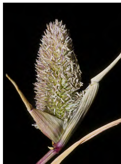
SWAMP PRICKLE GRASS (Crypsis schoenoides) Naturalized Annual - Grass Family - (Jun-Oct) - Wet places - Plant mat-like. Stem 2-30" long. Leaf blade 1-4" long. Flower cluster 0.1-3" long, 0.2-0.6" wide. Spikelet ~0.1" long.