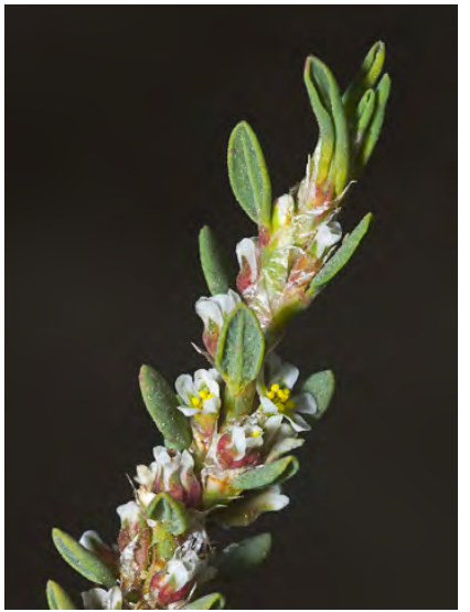
KNOTWEED (Polygonum aviculare subsp. depressum) Naturalized Annual - Buckwheat Family - (May–Nov) - Disturbed places - Stem 4-20", mat-forming, Flowers 2-8/leaf axil, ~0.1" long, fused 1/2 length, w/white or pink margins.