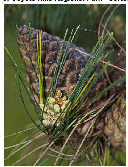
MONTEREY PINE (Pinus radiata) Native Perennial - Pine Family - - - Closed-cone-pine forest, oak woodland - Tree < 125' tall. Mature bark black, deep-grooved. Needles 3 per bundle, 2.4-5.9" long. Seed cone 2.4-6" long, asymmetric, opening 2nd year.