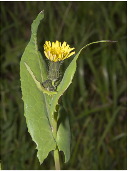
COMMON SOW THISTLE (Sonchus oleraceus) Naturalized Annual - Sunflower Family - (All year) - Abundant. Disturbed places - Plant 4-55" tall. Leaf teeth soft to touch. Basal lobes of upper leaves sharply pointed, straight to curving upward.