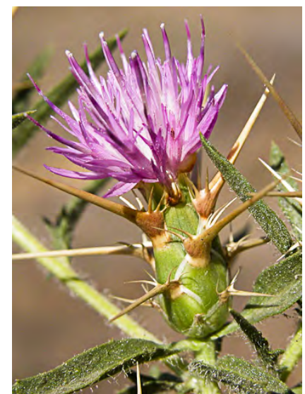
PURPLE STAR-THISTLE (Centaurea calcitrapa) Naturalized Annual-Biennial - Sunflower Family -(Apr-Nov) - Pastures, disturbed places - Plant 8-40"+. Basal leaves 1-2x divided into narrow lobes. Flowers purple with spiny bracts. NOXIOUS weed.