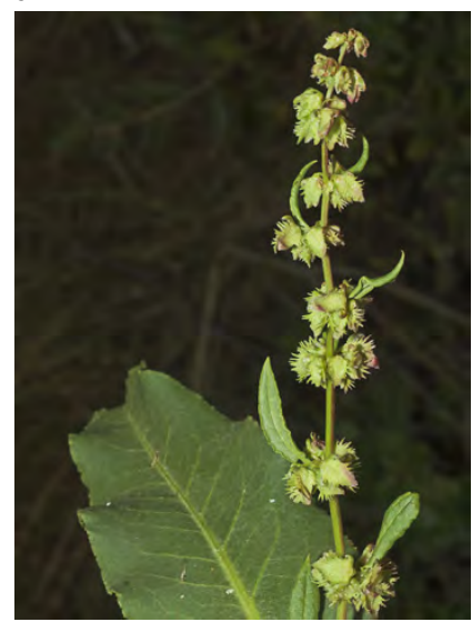
FIDDLE DOCK (Rumex pulcher) Naturalized Perennial - Buckwheat Family - (May–Sep) - Disturbed places, meadows, moist or dry habitats - Stem 8-24" long, branches widely spreading. Leaf blades 1.6-4" long, 1.2-2" wide. Valves w/2-5 teeth.