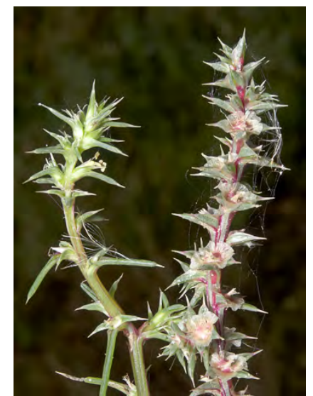
RUSSIAN THISTLE (Salsola tragus) Naturalized Annual-Perennial - Goosefoot Family - (Jul-Oct) - Common. Disturbed places - Plant < 5' tall. Stem gen red-striped, widely branched. Leaves succulent, 0.3-2" long, upper spine-tipped. NOXIOUS.