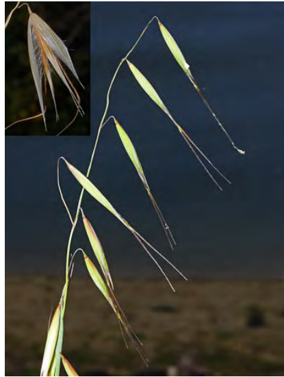
SLENDER WILD OAT (Avena barbata) Naturalized Annual - Grass Family - (Mar–Jun) -