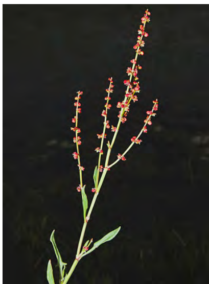
SHEEP SORREL (Rumex acetosella) Naturalized Perennial - Buckwheat Family - (Apr–Jul) - ± Disturbed, often acidic places - Stem < 16". Leaf gen basal, blade 0.8-2.4" long, lower arrowhead-shaped w/2 lobes. Flowers yellowish, turn reddish. INVASIVE.