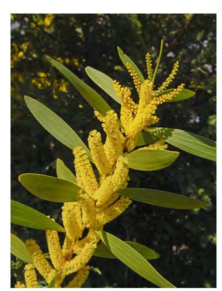
SYDNEY GOLDEN WATTLE (Acacia longifolia) Naturalized Perennial - Pea Family - (Jan-Apr) - Uncommon. Disturbed places, especially sandy coastal areas - Shrub-small tree, spineless. Leaves simple, 2-6" long with 2-4 main veins. Flowers bright yellow.