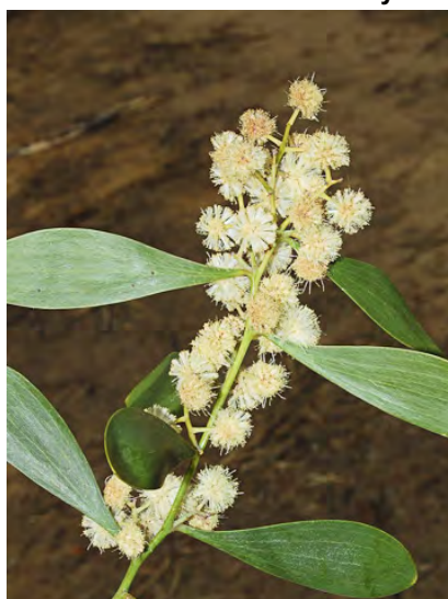
BLACKWOOD ACACIA (Acacia melanoxylon) Naturalized Perennial - Pea Family - (Feb-Mar) -Uncommon. Disturbed areas - Tree < 100' tall. Leaves simple, 0.2-1.2" wide, 3-5 main veins. Flowers pale yellow, 2-8 per head. INVASIVE weed.