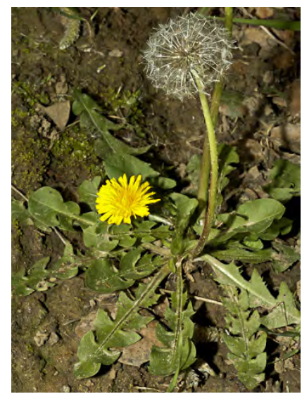
COMMON DANDELION (Taraxacum officinale) Naturalized Biennial-Perennial - Sunflower Family - (All year) - Abundant. Esp disturbed areas -Stem hollow. Leaves bright green with sharp down-pointing lobes. Outer head bracts reflexed. Fruit ~ brown.