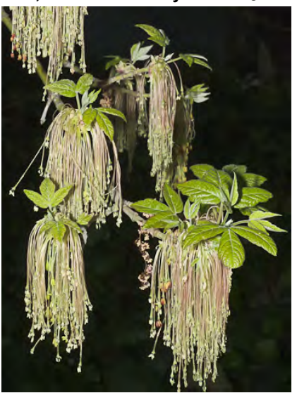
BOX ELDER (Acer negundo) Native Perennial - Soapberry Family - (Mar–Apr) - Streamsides, bottomland. - Tree < 66' tall. Leaflets in 3s. Group of 10-250 hanging flowers appear with leaves. Winged fruits. Widely planted ornamental.