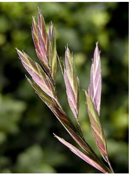
RESCUE GRASS (Bromus catharticus var. catharticus) Naturalized Annual-Perennial - Grass Family - (Apr–Nov) - Open, disturbed places - Plant 8-48" tall. Flower cluster 3-12" long, ~ open. Spikelet flattened, 0.6-1.2" long. Lemma 0.4-0.7" long, awn < 0.2" long.