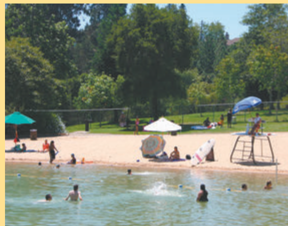
Don Castro's lifeguarded swim lagoon is a favorite summertime recreation spot. The park is a great place for picnicking, hiking, bike riding, birdwatching, and other recreational activities. Don Castro lies on the route of the Chabot-to-Garin Regional Trail, a segment of the Bay Area Ridge Trail.

PLEASE RECYCLE your bottles and cans while you are at Don Castro. Recycling containers are located throughout the park.