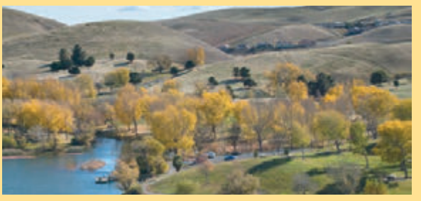
The hiking trails of Contra Loma extend into the hills of the adjacent Black Diamond Mines Regional Preserve (background).

Visitors may launch their own boats. Private boaters may use electric motors, but not gasoline engines. Maximum allowable boat length is 20 feet. Coast Guard approved personal flotation devices are required for each person.