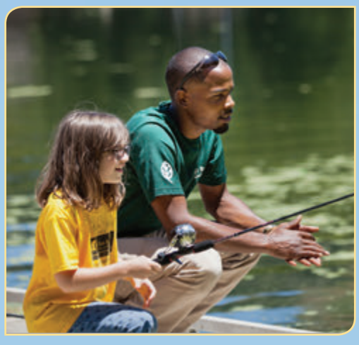
Temescal Regional Park, Oakland

Additionally, 11,669 volunteers contributed a total of 91,770 hours of service toward improving nature and park safety, and providing information about regional parks at community events. Activities included cleanup and trash removal, restoration, and maintenance of parklands, shorelines, and trails.