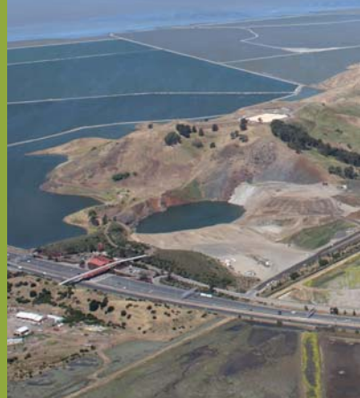
Dumbarton Quarry Regional Recreation Area, Fremont