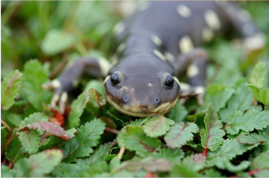
California tiger salamander.

more suitable for California ground squirrels (USFWS 2003). Salamanders that inhabit vernal pools may also benefit from grazing. These ephemeral pools are wet only during the winter-spring rainy season, and too much vegetation in and around their edges can cause drying pools to lose depth too quickly. Because it reduces this vegetation, grazing can keep the pools wet longer, giving salamander larvae more time to grow up (USFWS 2004).