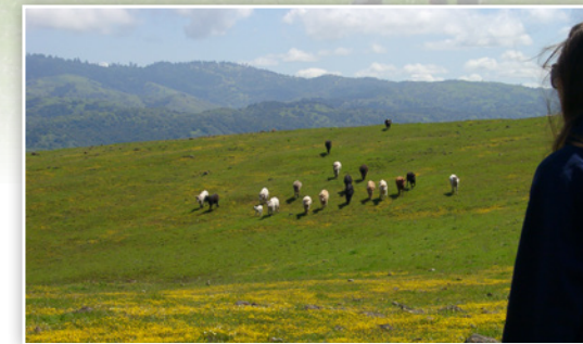
Cattle grazing in the Bay checkerspot butterfly habitat at Coyote Ridge, south of San Jose, California.

Looking out across the grasslands of California's Mediterranean climate zone, most of the plants you see are non-native annuals brought here from Europe and Asia. These include grasses, such as wild oats ( Avena spp.) and soft chess ( Bromus hordeaceus mollis ) as well as forbs such as filarees ( Erodium spp.) and black mustard ( Brassica nigra ). When left unmanaged, these non-native grasses and forbs can grow profusely in normal and above-normal precipitation years, degrading habitat conditions for some native plants and animals and increasing the risks of wildfire and pest plant infestations. California's Mediterranean-type grasslands are recognized among the world's "hot spots" of native biodiversity, despite being generally dominated by non-native species (Bartolome et al. 2014). An appreciation of this paradox and how it came to be can help conservation biologists, environmental regulators, agency managers, recreationists, and ranchers communicate more clearly about how to best manage California rangelands for the purposes of conservation.