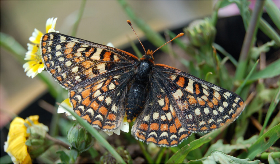
Bay checkerspot butterfly, Coyote Ridge, Santa Clara County, California.

( Passerculus sandwichensis ). Two coastal sites in Sonoma County were compared: one that was grazed (Jenner Headlands Preserve) and one that was not grazed (Sonoma Coast State Park). The grazed site had more grassland birds overall as well as more species of grassland birds. This difference is thought to relate to the greater abundance of shrubs and thatch, which do not provide the types of habitat that some grassland birds need, on the ungrazed site (DiGaudio 2010). In a study of valley grassland and oak woodland matrix, grassland birds responded to grassland size and surrounding land uses as well as smaller-scale grazing effects (Rao et al. 2008). Larger patches of open grassland support a more species-rich, abundant grassland bird community.