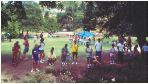
Lake Temescal is a popular venue for Regional Parks-sponsored fishing derbies. Inner-city kids enjoy a day of fishing, picnicking, and enjoying the day with volunteers.

MEMBERSHIPS The Regional Parks Foundation offers Memberships to park users. For more information, call (510) 544-2220.