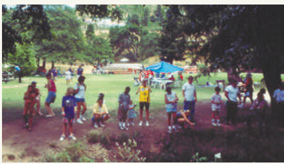
Lake Temescal is a popular venue for Regional Parks-sponsored fishing derbies. Inner-city kids enjoy a day of fishing, picnicking, and enjoying the day with volunteers.

MEMBERSHIPS The Regional Parks Foundation offers Memberships to park users. For more information, call (510) 544-2220.