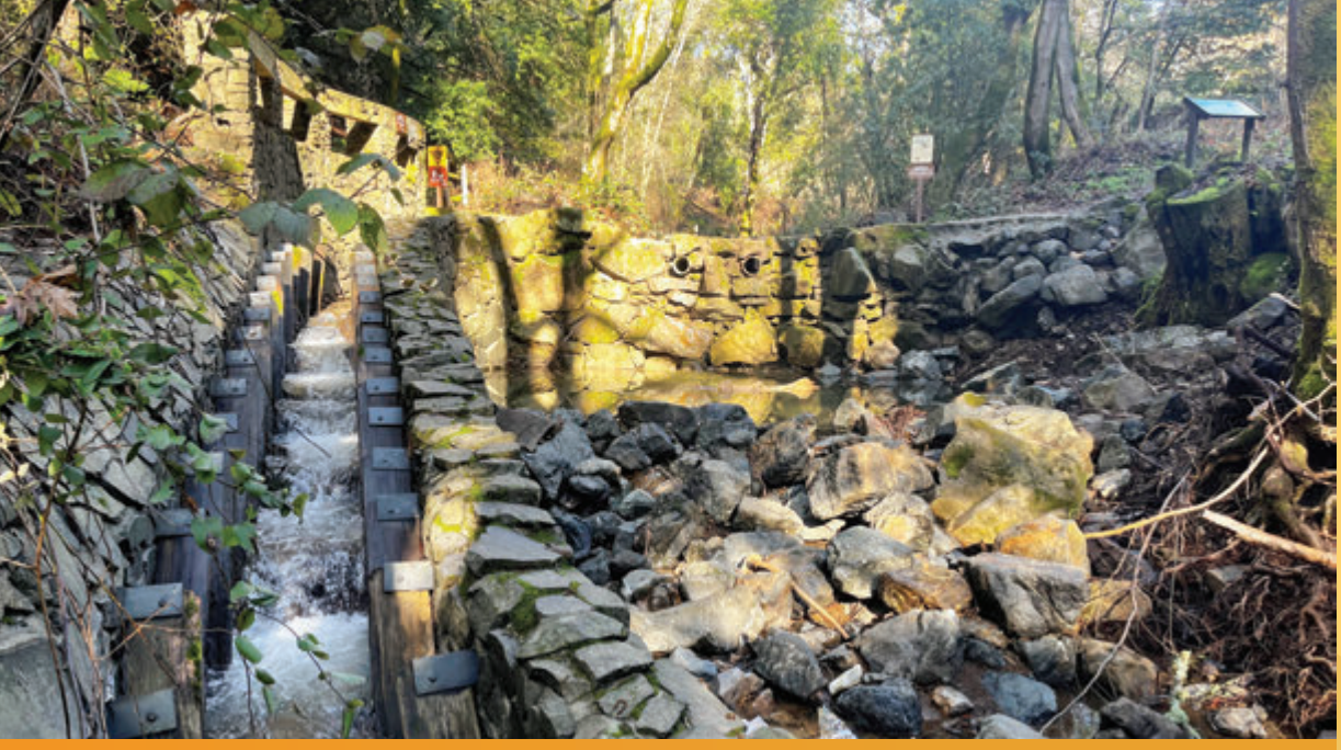
Native trout use a constructed fish ladder to seasonally migrate up Redwood Creek.

Besides hiking, biking, and nature study, there are picnic sites with meadows, and children's play area. Equestrian amenities are found near the east entrances of the park.