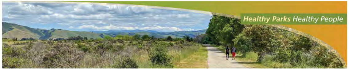
Park Users at Check-In Meeting (70 total)