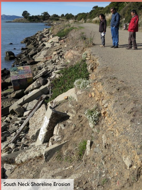
South Neck Shoreline Erosion