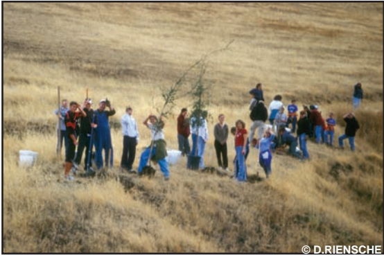
Happy "Quail Rangers" planting trees.

"Quail Rangers" of all ages are planting bird friendly vegetation, building brush piles, and conducting field surveys to aid quail and other treasured wildlife. In our area the ideal quail habitat is composed of quail bush, blackberry, chemise, California sage, and various oak tree species. Quail eat insects, seeds, leaves and berries. When visiting our parks, watch for quail as they scurry between protective bushes.