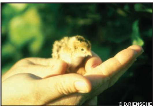
The future of quail is in your hand.

"Quail Rangers" of all ages are planting bird friendly vegetation, building brush piles, and conducting field surveys to aid quail and other treasured wildlife. In our area the ideal quail habitat is composed of quail bush, blackberry, chemise, California sage, and various oak tree species. Quail eat insects, seeds, leaves and berries. When visiting our parks, watch for quail as they scurry between protective bushes.