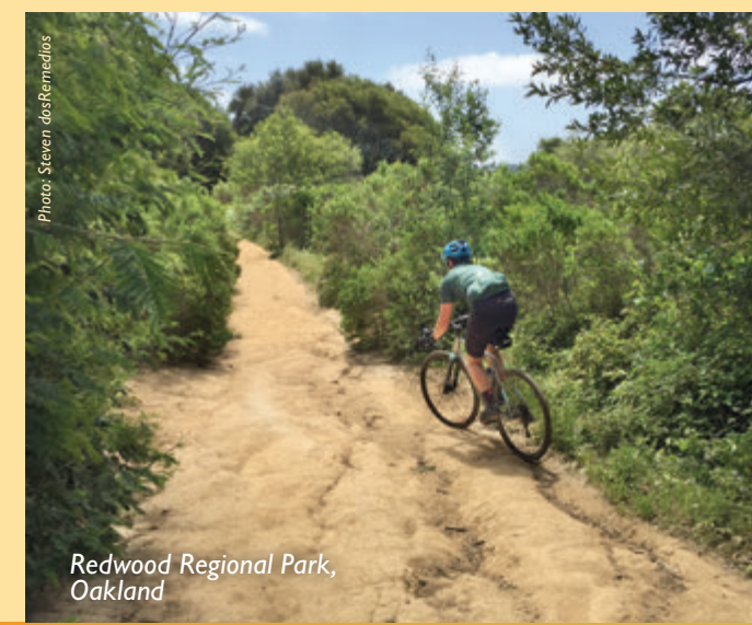
Redwood Regional Park, Oakland