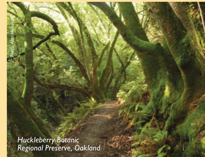
Huckleberry Botanic Regional Preserve, Oakland