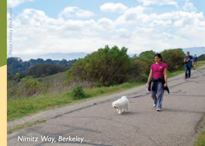
Nimitz Way, Berkeley