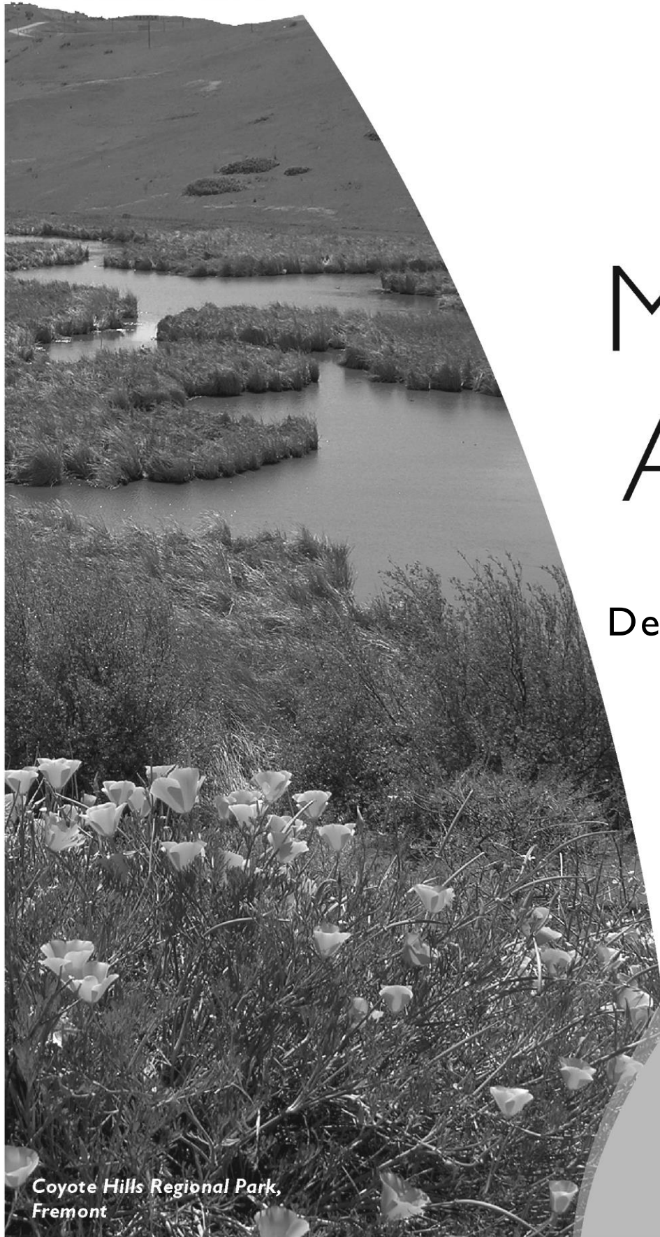
Coyote Hills Regional Park, Fremont