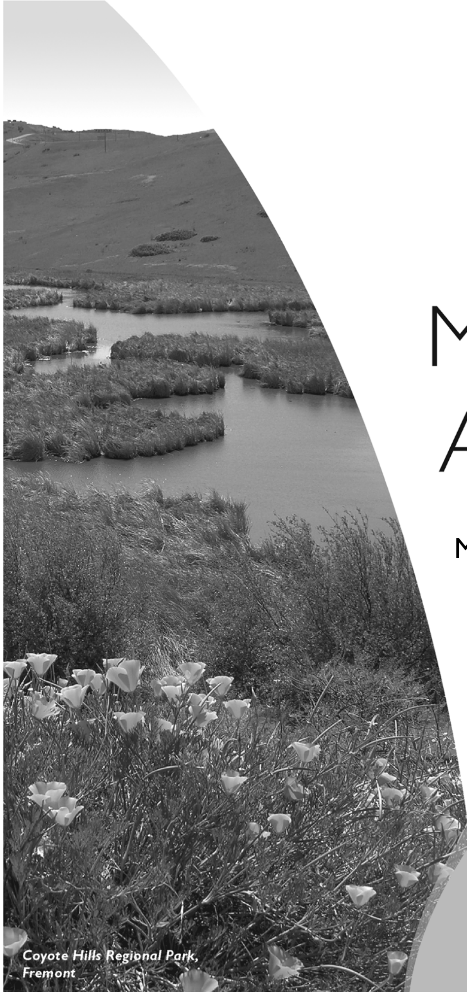
Coyote Hills Regional Park, Fremont