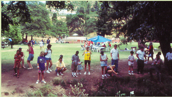
Lake Temescal is a popular venue for Regional Parks-sponsored fishing derbies. Inner-city kids enjoy a day of fishing, picnicking, and enjoying the day with volunteers.

MEMBERSHIPS The Regional Parks Foundation offers Memberships to park users. For more information, call (510) 544-2203.