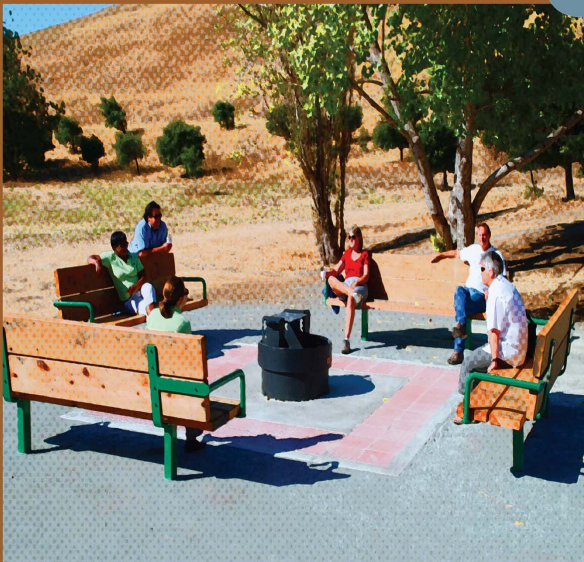
Dairy Glen Group Camp, Coyote Hills Regional Park, Fremont