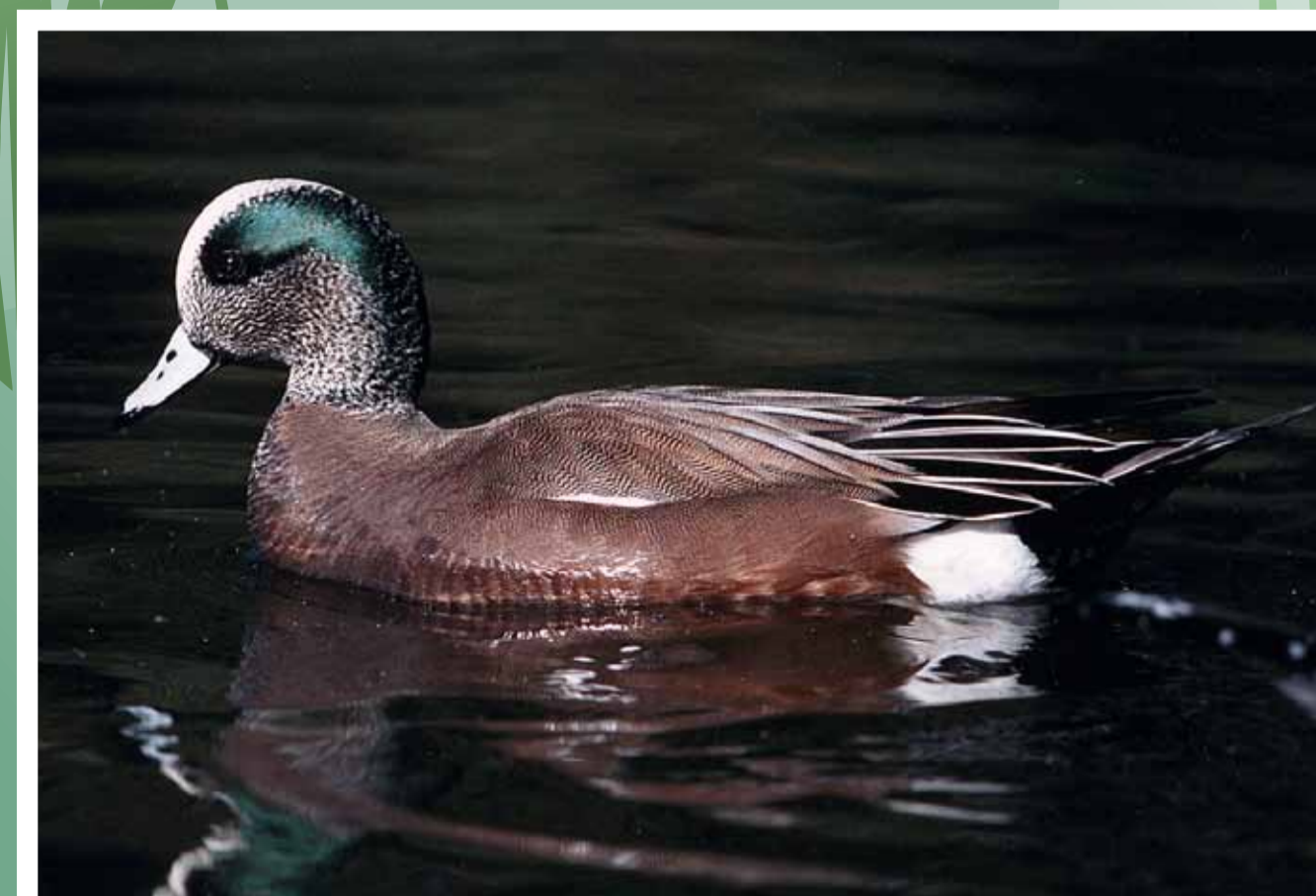
American wigeon (male)