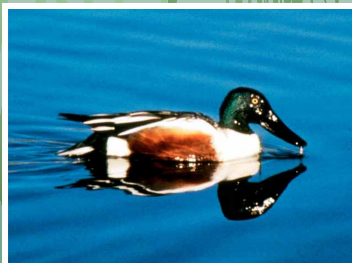
northern shoveler (male)