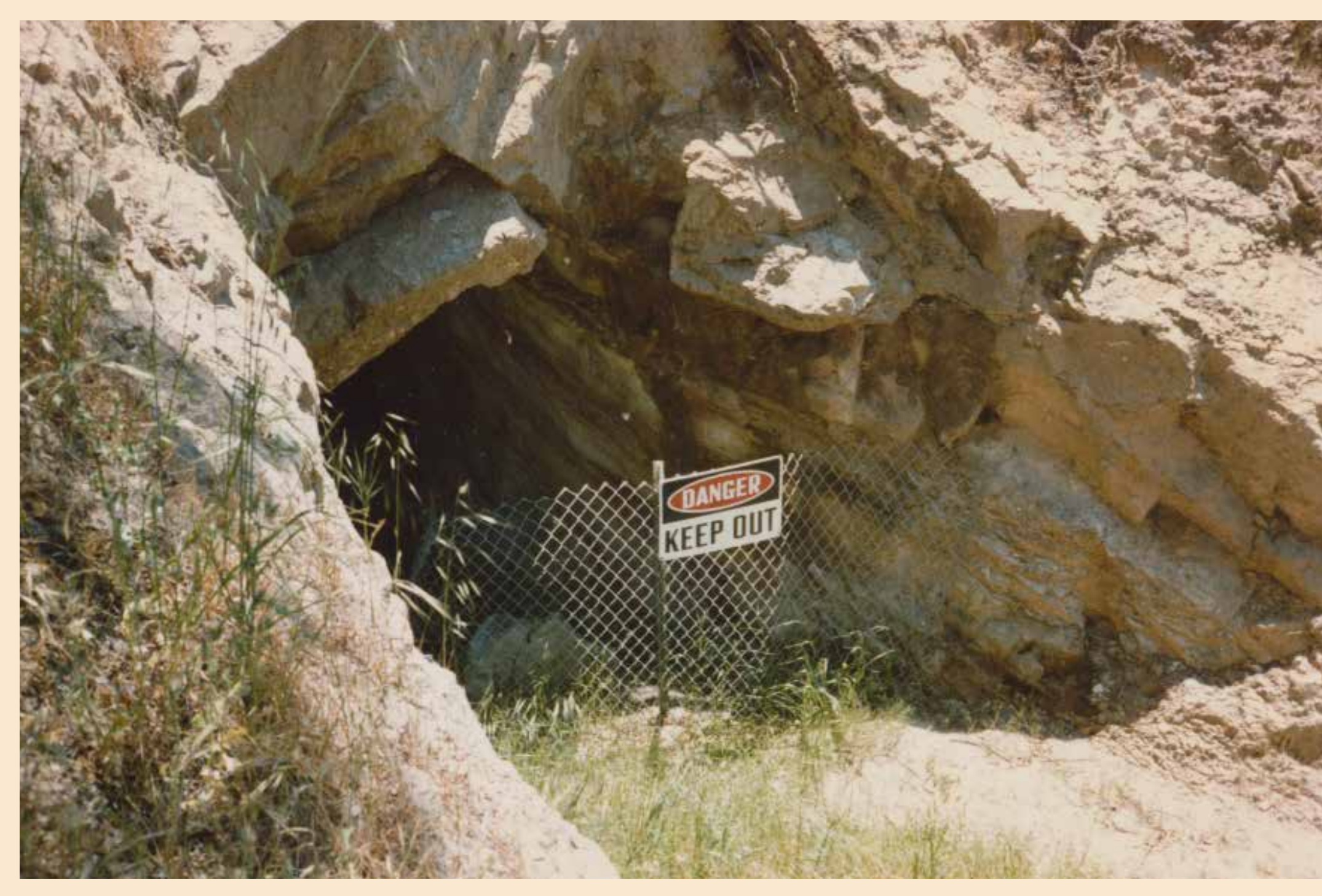
An abandoned coal mine before closure, 1986