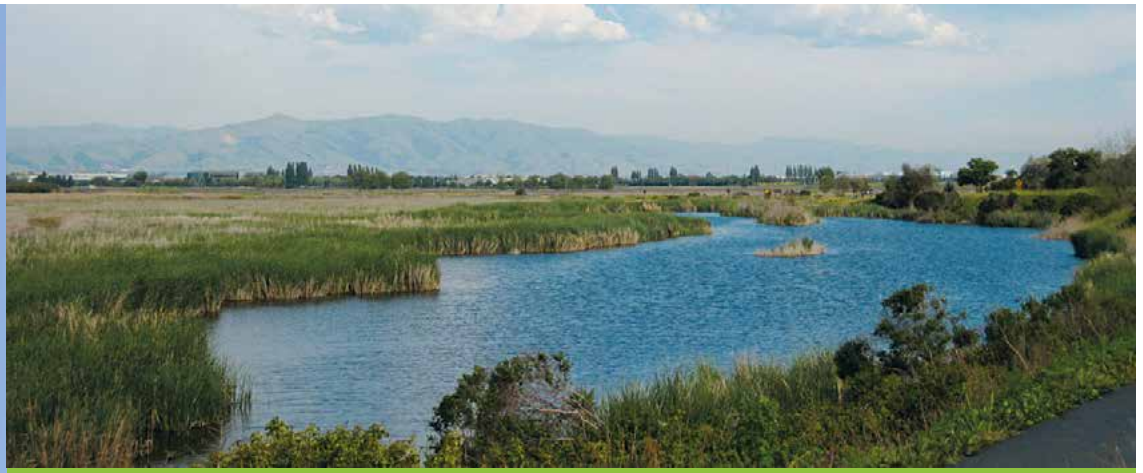
Coyote Hills Regional Park.