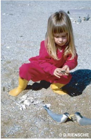
Children have painted and installed decoys to attract terns.

Hundreds of wildlife volunteers have been working to give "birth" to the Least Tern Habitat Enhancement Project at the Hayward Regional Shoreline. These Habitat Helpers are shaping the future of our wildlife heritage for generations to come. Holding tightly to the belief that their legacy will be no less than their inheritance, many people like you have contributed thousands of hours in support of this monumental stewardship effort.