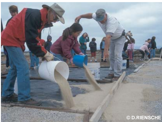
People of all ages have spread out more than 150 tons of sand, salt, and oyster shells to encourage least terns to nest on the island.

least terns nested next to estuaries, on sandy beaches and salt flats with sparse vegetation. As the human population along the California coast has increased, least tern habitat has decreased. In order for the species to survive, terns require protection from disturbance and predation. In addition, their remaining habitat needs to be maintained and enhanced.