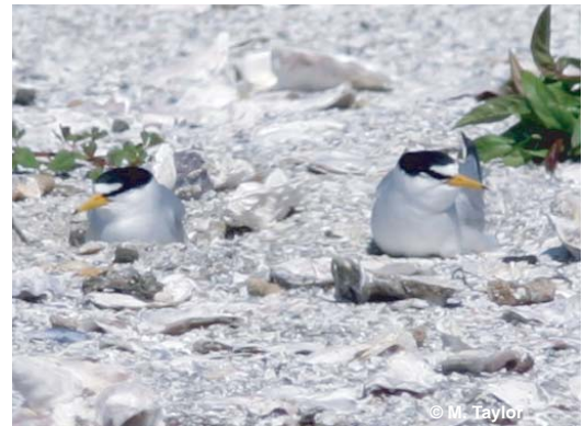
Nesting California least terns.

The California least tern is an endangered species due to the loss and disturbance of coastal habitats. Historically,