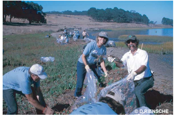
Removing "green aliens" (non-native plants) helps create a wildlife friendly environment.

This restoration effort is helping wildlife at Point Pinole Regional Shoreline. Your park is home to several protected species including the California black rail, California clapper rail, and the salt-marsh harvest mouse. They spend their lives in the tidal marsh. Their conservation depends upon protecting and enhancing the remaining habitat, and controlling non-native predators.