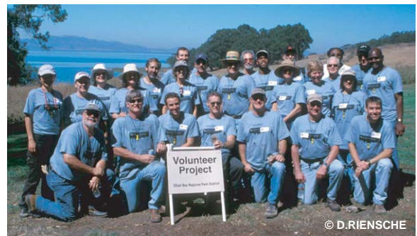
Chevron employees helping wildlife.

Thanks to the vision and financial support of the East Bay Regional Park District, Regional Parks Foundation, Chevron, U.S. Fish & Wildlife Service Coastal Program, Contra Costa County Fish and Wildlife Committee, and the Contra Costa Mosquito & Vector Control, this newly enhanced wildlife habitat will benefit future generations of park users.