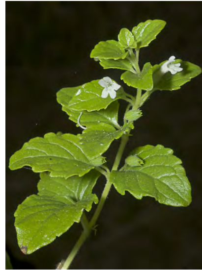
YERBA BUENA ( Clinopodium douglasii ) Native Perennial - Mint Family - (Apr-Sep) - Shady places, chaparral, woodland - Stem trailing, gen woody, forming mats. Leaves 0.4-1.4" long, oval. Petals white to lavender, 3-8 mm long. Aromatic.