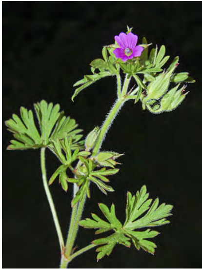
CUT-LEAVED GERANIUM ( Geranium dissectum ) Naturalized Annual - Geranium Family - (Mar-Jul) - Open, disturbed sites - Stem 3-28" tall, rough-hairy. Leaf blades deeply divided. Petals violet-red, 0.1-0.25" long w/notched tips. Flower stalk sticky. INVASIVE.