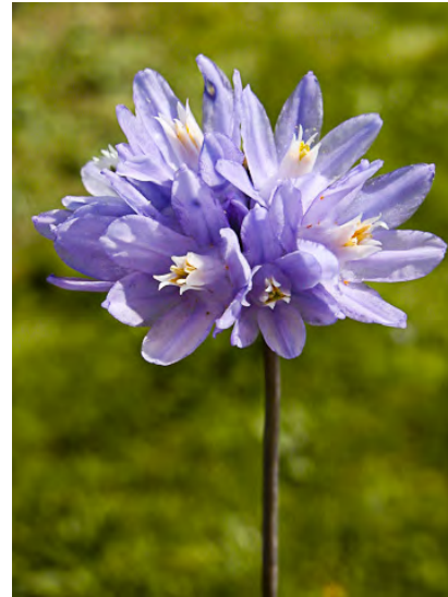
BLUE DICKS ( Dichelostemma capitatum subsp. capitatum ) Native Perennial - Brodiaea Family - (Mar-Jun) - Open woodland, scrub, desert, grassland - Plant 2-28" tall. Flowers blue-purple, not narrowed in the middle. Stamens 6. Early spring bloomer.