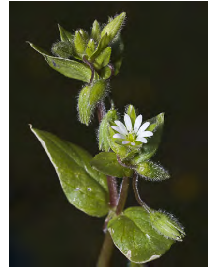
COMMON CHICKWEED ( Stellaria media ) Naturalized Annual - Pink Family - (Feb-Sep) - Oak woodland, meadows, disturbed areas - Plant 2.8-20" tall. Stem w/line of hairs on 1 side. Sepals 0.12-0.18" long. Petals white, 2-lobed, 0.7-0.9x sepals.