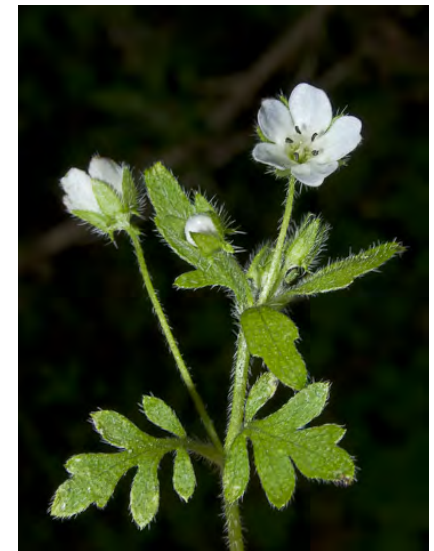
VARIABLE-LEAF NEMOPHILA ( Nemophila heterophylla ) Native Annual - Borage Family - (Feb-Jun) - Common. Forest, chaparral, roadsides, streambanks - Flower 0.1-0.4" long, unspotted, bract appendages < 0.04" long in fruit.