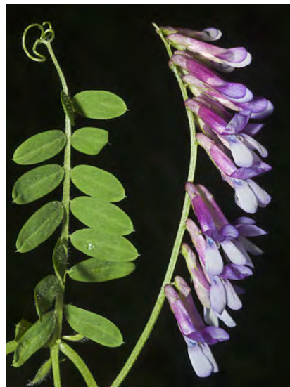
SPARSELY HAIRY VETCH ( Vicia villosa subsp. varia ) Naturalized Annual-Biennial - Pea Family - (Mar-Jun) - Grassland, roadside, disturbed areas - Stems w/few hairs. Flowers 10-20, blue-purple to white, 0.4-0.55" long. Lower bract lobes 0.04-0.1" long.