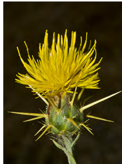
YELLOW STAR-THISTLE ( Centaurea solstitialis ) Naturalized Annual - Sunflower Family - (May-Oct) - Invasive, roadsides, disturbed grassland or woodland - Plant 4-39" tall. Leaves woolly, extend down the stem. Flower bract spines 0.4-1" long. NOXIOUS weed.