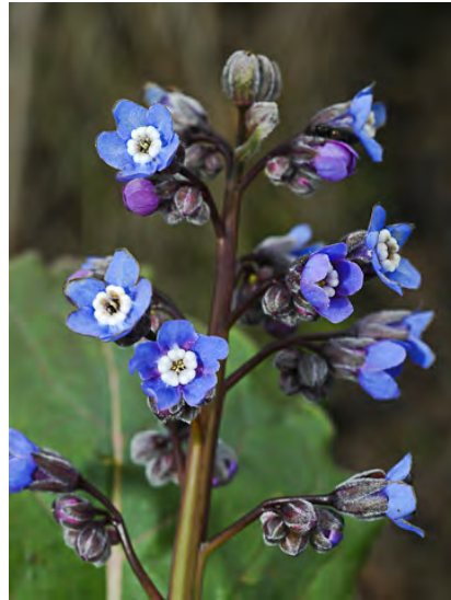
GRAND HOUND'S TONGUE ( Cynoglossum grande ) Native Perennial - Borage Family - (Feb-May) - Chaparral, woodland - Stem 1-3'. Leaf stalk 3-6". Leaf blade 3-6" cm long, broadly oval. Flowers bright blue w/inner white teeth.