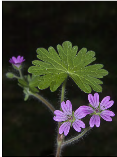
HAIRY DOVE'S FOOT GERANIUM ( Geranium molle ) Naturalized Annual - Geranium Family - (Feb-Aug) - Open to shaded sites, disturbed ground - Stem 4-17" tall. Petals red-purple, 0.1-0.4" long, notched. Sepals awnless. Fruit smooth, wrinkled.