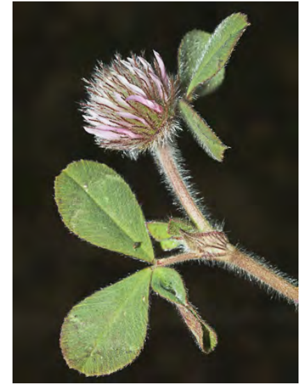
ROSE CLOVER ( Trifolium hirtum ) Naturalized Annual - Pea Family - (Apr-May) - Disturbed areas, roadsides - Head with 1-2 bract-like leaves immed below. Flowers pink, 0.4-0.6" long, densely-bristly in fruit. INVASIVE weed.