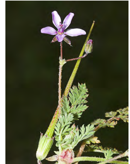
REDSTEM FILAREE ( Erodium cicutarium ) Naturalized Annual - Geranium Family - (Feb-Sep) - Open, disturbed sites, grassland, scrub - Stem 4-20". Leaves compound, leaflets dissected. Sepal tip bristly. Petal pink to purple. Fruit beak 0.8-2". INVASIVE.