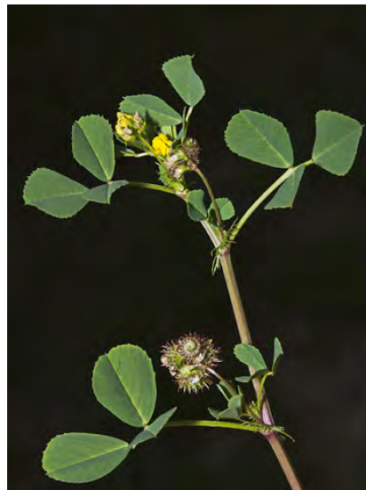
CALIFORNIA BURCLOVER ( Medicago polymorpha ) Naturalized Annual - Pea Family - (Mar-Jul) - Common. Chaparral, oak woodland, streambanks, roadsides, disturbed areas - Stem 4-20". Flower yellow, 0.14-0.24" long. Spiny spiral fruits. INVASIVE.