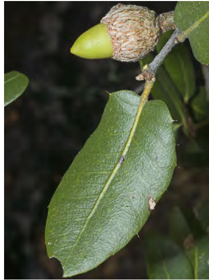
SHREVE OAK ( Quercus parvula var. shrevei ) Native Perennial - Oak Family - (Mar-May) - ± Moist woodland - Tree < 56' tall. Leaves 1.2-3.5" long, dull olive-green beneath. Acorn 1.2-1.8" long, oblong below middle and abruptly tapered to tip.