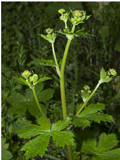
PACIFIC WOODLAND SANICLE ( Sanicula crassicaulis ) Native Perennial - Carrot Family - (Mar-May) - Open slopes, ravines, woodland - Plants stout, 9-47". Leaves 1-5" across with 3-5 deep, palmate lobes and serrate edges. Flowers yellow.