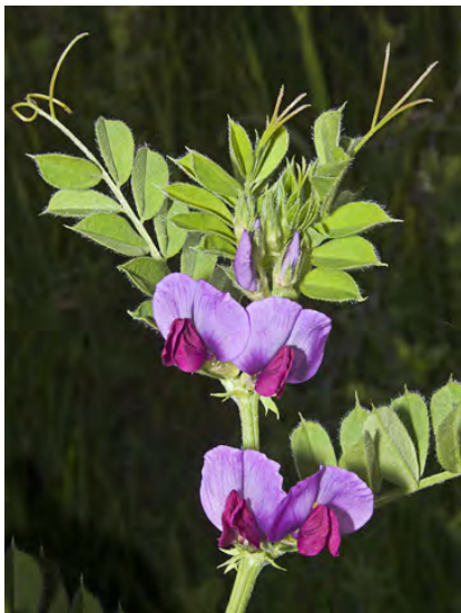
SPRING VETCH ( Vicia sativa subsp. sativa ) Naturalized Annual - Pea Family - (Mar-Jun) - Roadsides, disturbed areas, grassland, open areas in oak and riparian woodlands - Flowers 1-2 at leaf bases, pink-purple to white, 0.7-1.2" long. Leaflets 0.16-0.4" wide.