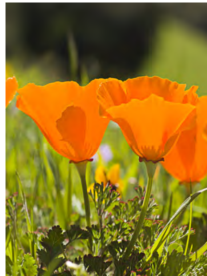
CALIFORNIA POPPY ( Eschscholzia californica ) Native Perennial - Poppy Family - (Feb-Sep) - Grassy, open areas - Plant 2-24" tall. Flower w/spreading rim <= 0.2". Petals 0.8-2.4" long, early spring = large and orange, fall = smaller and yellow.