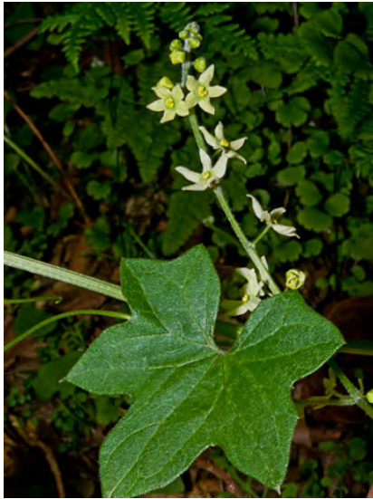
CALIFORNIA MAN-ROOT ( Marah fabacea ) Native Perennial - Gourd Family - (Feb-Apr) - Streamsides, washes, shrubby open areas - Vine 6-20' long. Leaves moderately lobed. Flowers cream or white, < 0.3" wide. Fruit spiny all over.