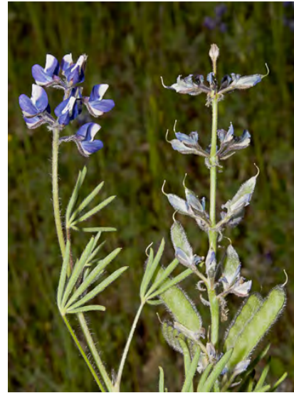
MINIATURE LUPINE ( Lupinus bicolor ) Native Annual - Pea Family - (Mar-Jun) - Abundant. Open or disturbed areas - Plant 4-16", hairy. Flower 0.16-0.4" long, banner longer than wide, upper keel ciliate near tip, pedicel < 0.12". Fruit 0.12-0.24" wide.