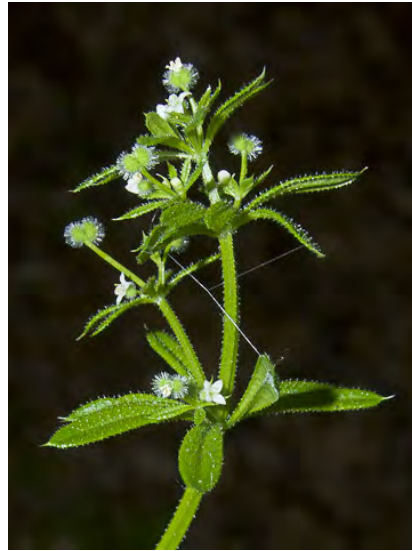
GOOSE GRASS ( Galium aparine ) Native Annual - Madder Family - (Apr-Jun) - Grassy, ± shady places - Stem 12-35" long, weak, brittle. Leaves 0.5-1.6" long, in whorls of 6-8. Flowers white, 4-lobed. Fruits covered w/short, hooked hairs.