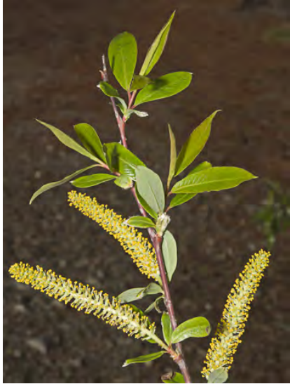
RED WILLOW ( Salix laevigata ) Native Perennial - Willow Family - (Dec-Jun) - Common. Riverbanks, seepage areas, lakeshores, canyons - Tree bark fissured. Leaf lanceolate, glaucous below, gen w/stalk glands. Stamens 5. Fruit glabrous.