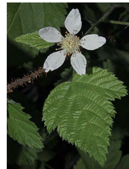
CALIFORNIA BLACKBERRY ( Rubus ursinus ) Native Perennial - Rose Family - (Mar-Jul) - Open, disturbed areas - Stem round, bristly/prickly. Leaves simple to 3 leaflets, underside green. Plants unisexual. Petals 0.24-0.6" long, white. Blackberry-type fruit.