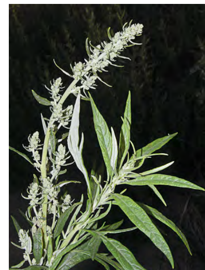
MUGWORT ( Artemisia douglasiana ) Native Perennial - Sunflower Family - (May-Nov) - Common. Open to shady areas, often in drainages - Plant 20-60" tall. Leaves gen 0.4-4" long, densely hairy below, some 3-5 lobed. Flower bracts hairy.