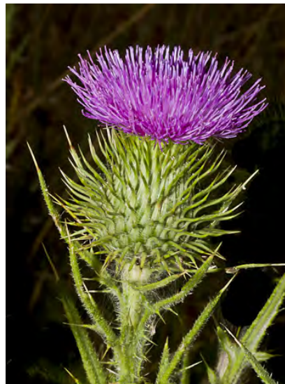
BULL THISTLE ( Cirsium vulgare ) Naturalized Biennial - Sunflower Family - (May-Oct) - Common. Disturbed areas - Plant 12-79" tall. Top of leaves bristly; leaf base forming decurrent wings on stem. Flowers purple, gen 1-2" wide. NOXIOUS weed.