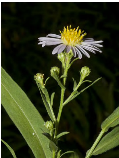
COMMON CALIFORNIA WILD ASTER ( Symphyotrichum chilense ) Native Perennial - Sunflower Family - (Jun-Oct) - Grassland, salt marshes, disturbed places - Plant 16-39", partly hairy. Leaf 1.6-6", 0.2-1.2" wide. Rays violet, 0.3-0.5" long.