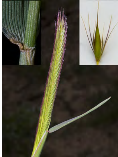
NORTHERN BARLEY ( Hordeum brachyantherum subsp. brachyantherum ) Native Perennial - Grass Family - (May-Aug) - Meadows, pastures, streambanks - Stem 1-3' tall, gen robust. Leaf sheaths gen smooth, blade < 7.5" long. Lemma awn < 0.25".