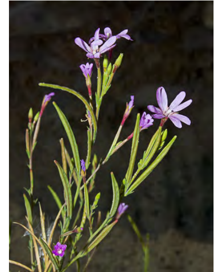
PANICLED / WEEDY WILLOWHERB ( Epilobium brachycarpum ) Native Annual - Evening Primrose Family - (Jun-Sep) - Common. Dry open or disturbed woodland, grassland, roadsides - Plant 8-79" tall, diffuse. Petals 2-15 mm long, white to rose-purple.