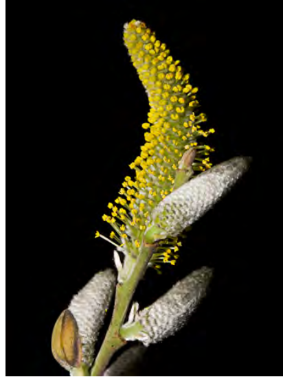
ARROYO WILLOW ( Salix lasiolepis ) Native Perennial - Willow Family - (Jan-Jun) - Common. Shores, marshes, meadows, etc - Shrub-tree, bark smooth. Leaf-like stipules. Leaf egg-shaped, waxy below. Fruit smooth, bract persistent, dark, stamens 2.