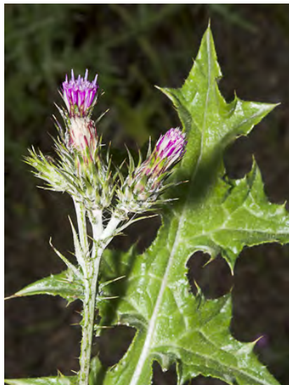
ITALIAN THISTLE ( Carduus pycnocephalus subsp. pycnocephalus ) Naturalized Annual - Sunflower Family - (Mar-Jul) - Roadsides, pastures, disturbed areas - Stems 8-79", narrow spiny-wings. Lower leaves 4-10 lobed, heads 2-5, flower bracts woolly. NOXIOUS.