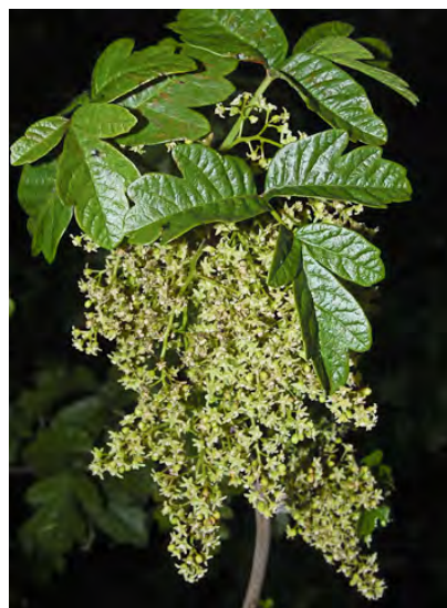
WESTERN POISON OAK ( Toxicodendron diversilobum ) Native Perennial - Sumac Family - (Apr-Jun) - Canyons, slopes, chaparral, coastal scrub, oak woodland - Shrub or vine. Leaflets 3, red in fall, mid leaflet stalked. Flowers green. Fruits white. TOXIC.