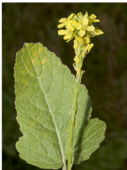
BLACK MUSTARD ( Brassica nigra ) Naturalized Annual - Mustard Family - (Apr-Sep) - Common. Disturbed areas, fields - Plant 1-6' tall. Petals bright yellow, 0.3-0.4" long. Fruit upright, pressed against stem. INVASIVE weed.