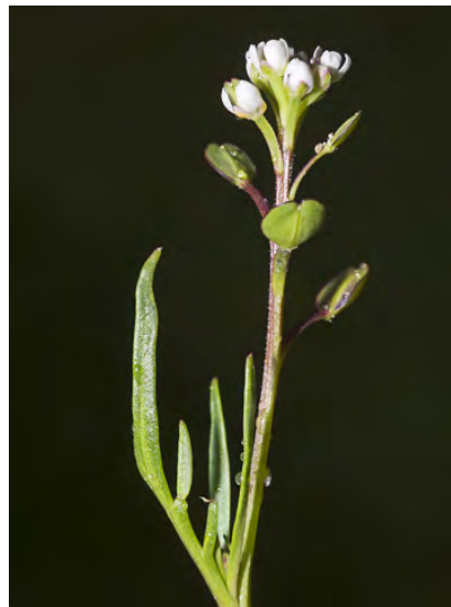
THREADLEAF PEPPERGRASS ( Lepidium nitidum ) Native Annual - Mustard Family - (Feb-Mar) - Alkaline soils, pastures, dry vernal pools, fields, beaches - Fruit stalk flat. Fruit smooth, 0.14-0.24" long, cupped, winged.