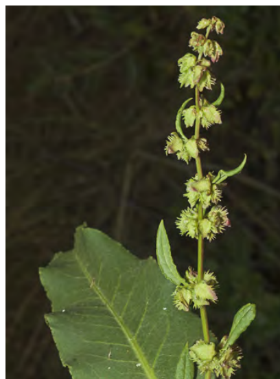
FIDDLE DOCK ( Rumex pulcher ) Naturalized Perennial - Buckwheat Family - (May-Sep) - Disturbed places, meadows, moist or dry habitats - Stem 8-24" long, branches widely spreading. Leaf blades 1.6-4" long, 1.2-2" wide. Valves w/2-5 teeth.