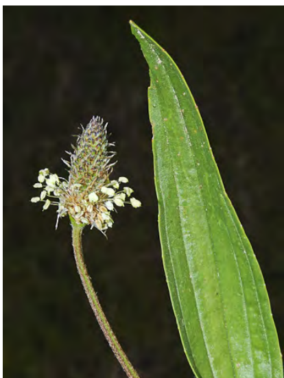
ENGLISH PLANTAIN ( Plantago lanceolata ) Naturalized Annual - Plantain Family - (Apr-Aug) - Common. Disturbed areas - Leaves basal, hairy, 2-10" long, <= 1" wide. Flowers + stem 8-31" tall, flower cluster 0.8-3" long. INVASIVE, lawn weed.