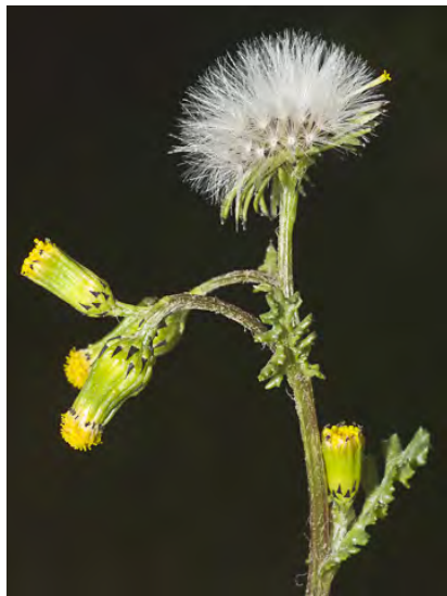
COMMON GROUNDSEL ( Senecio vulgaris ) Naturalized Annual - Sunflower Family - (Feb-Jul) - Common. Disturbed areas - Plant 4-24" tall, not hairy, w/1-10+ stems. Flower head bracts with black-tips. Milky sap.