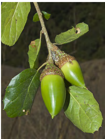
COAST LIVE OAK ( Quercus agrifolia var. agrifolia ) Native Perennial - Oak Family - (Mar-Apr) - Valleys, slopes, mixed-evergreen forest, woodland - Tree 30-80'. Leaves convex, hair-tuft below in vein axils. Acorns on 1st year twigs, shell glabrous inside.