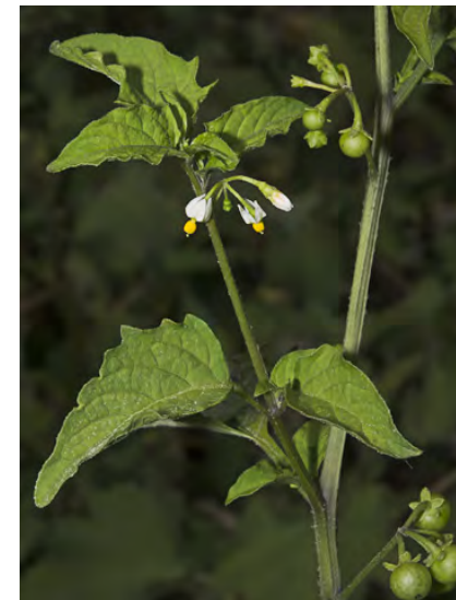
SMALL-FLOWERED NIGHTSHADE ( Solanum americanum ) Native Annual-Perennial - Nightshade Family - (Apr-Nov) - Open, often disturbed places - Flower 0.12-0.24" wide w/3mm lobes, white, anthers ~0.07". Seeds ~0.05". Bracts 0.04-0.08", curled back in fruit.