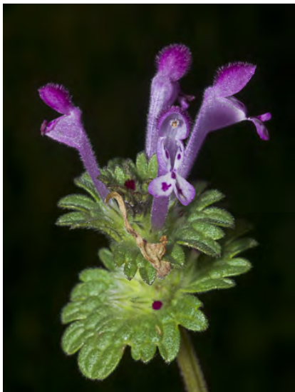
CLASPING HENBIT ( Lamium amplexicaule ) Naturalized Annual-Biennial - Mint Family - (Apr-Sep) - Disturbed sites, cult or abandoned fields - Stem 4-16" long. Leaf blades 0.4-1" long, upper stalkless. Flowers red-purple, gen 0.4-0.7" long.