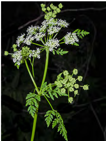
POISON HEMLOCK ( Conium maculatum ) Naturalized Biennial - Carrot Family - (Apr-Jul) - Common. Moist, esp disturbed places - Plants 2-10' tall. Stems purple-spotted. Leaves fern-like, gen 2x divided. Flowers white. TOXIC. INVASIVE weed.