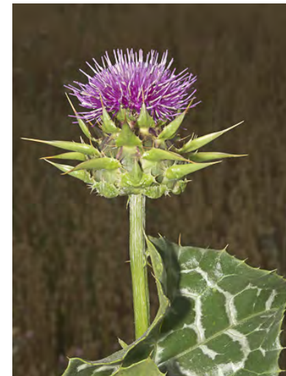
MILK THISTLE ( Silybum marianum ) Naturalized Annual-Biennial - Sunflower Family - (Feb-Jun) - Roadsides, pastures, disturbed areas - Stem 1-10', stout. Leaves spiny, shiny green w/white veins and spots. Flowers red-purple. INVASIVE weed.