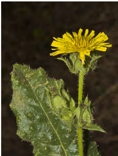
BRISTLY OX-TONGUE ( Helminthotheca echioides ) Naturalized Annual-Biennial - Sunflower Family - (All year) - Common. Disturbed areas - Stem 1-6.5' tall, bristly. Leaf 2-8" long, covered with prickly bumps. Flower heads 0.8-1.6" wide. INVASIVE weed.