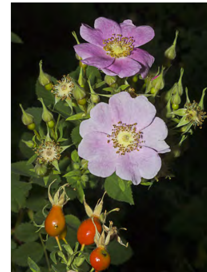
CALIFORNIA ROSE ( Rosa californica ) Native Perennial - Rose Family - (Feb-Nov) - Gen ± moist areas in sun, esp streambanks - Shrub 2.6-8.2' tall w/thick curved spines, forming thickets. Petals pink, 0.6-1" long; sepals unlobed.