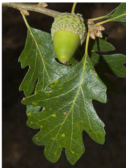
VALLEY OAK ( Quercus lobata ) Native Perennial - Oak Family - (Mar-Apr) - Slopes, valleys, savanna - Tree < 115' tall, deciduous. Leaves 2-5" long, not leathery, deeply lobed, lobes without bristles. Acorns 1.2-2" long, slender, cup 0.4-1.2" deep.