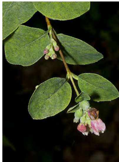
SNOWBERRY ( Symphoricarpos albus var. laevigatus ) Native Perennial - Honeysuckle Family - (May-Jul) - Shady woodland, streambanks, N. slopes - Shrub 20-71" tall. Flowers > 8/cluster, pink, 0.16-0.24" long, bell-shaped, swollen on 1 side.