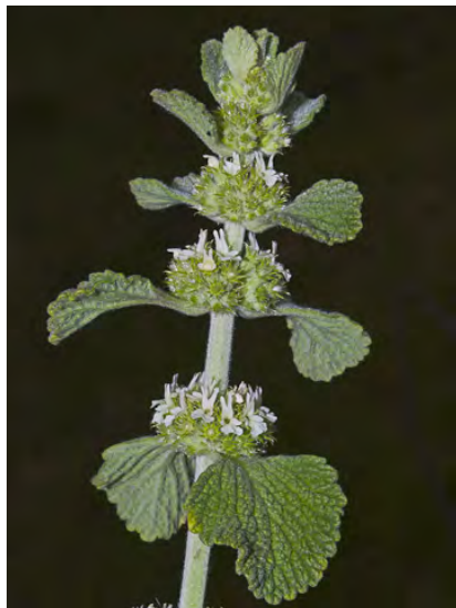
COMMON HOREHOUND ( Marrubium vulgare ) Naturalized Perennial - Mint Family - (Mar-Nov) - Disturbed sites, gen overgrazed pastures - Stem 4-24" long. Leaf blades 0.6-2.2" long. Flower bract w/10 hook-tipped teeth. Flowers white, ~0.2" long. INVASIVE.