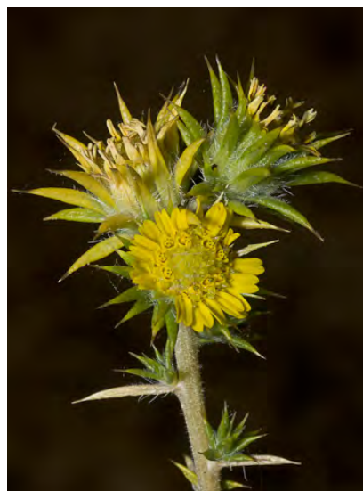
CONGDON'S TARPLANT ( Centromadia parryi subsp. congdonii ) Native Annual - Sunflower Family - (Jun-Oct) - Terraces, swales, floodplains, grassland, disturbed sites - Main plant not sticky or short-hairy. Spiny. CNPS: ENDANGERED.