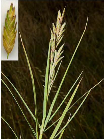
SALT GRASS ( Distichlis spicata ) Native Perennial - Grass Family - (Apr-Sep) - Salt marshes, coastal dunes, moist, alkaline areas - Stem 4-20" long. Leaves 0.8-4" long, flat, stiff. Flower cluster 0.8-3" long, narrow. Spikelets straw-colored to purple, 2-20/group, 0.24-0.8" long.