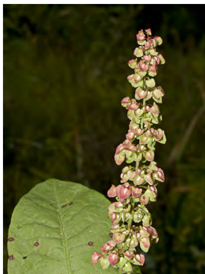
CURLY DOCK ( Rumex crispus ) Naturalized Perennial - Buckwheat Family - (All year) - Abundant. Disturbed places - Stem 16-39" tall. Flower cluster dense, valves 0.2-0.24", winged around tubercles, smooth edged. 1 tubercle enlarged. INVASIVE.