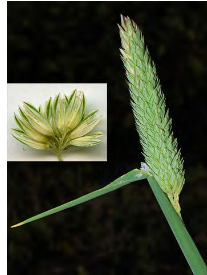
HARDING GRASS ( Phalaris aquatica ) Naturalized Perennial - Grass Family - (Apr-Aug) - Disturbed areas, roadsides - Plant 16-79" tall, tufted. Flower cluster 0.6-6" long, unbranched. Lower florets 1 or unequal. Glume wing untoothed. INVASIVE weed.