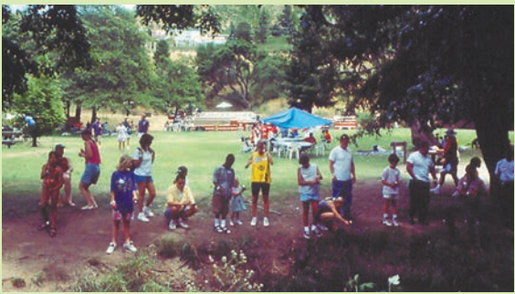
Lake Temescal is a popular venue for Regional Parks-sponsored fishing derbies. Inner-city kids enjoy a day of fishing, picnicking, and enjoying the day with volunteers.