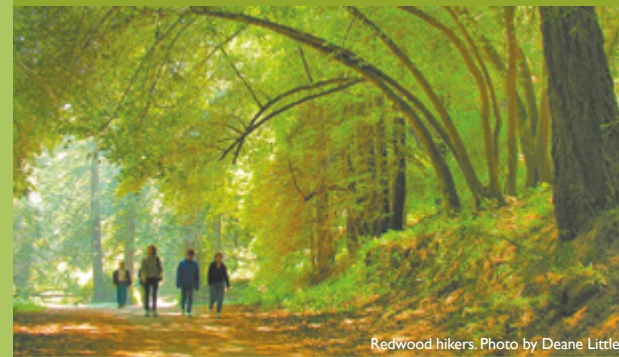
Redwood hikers.