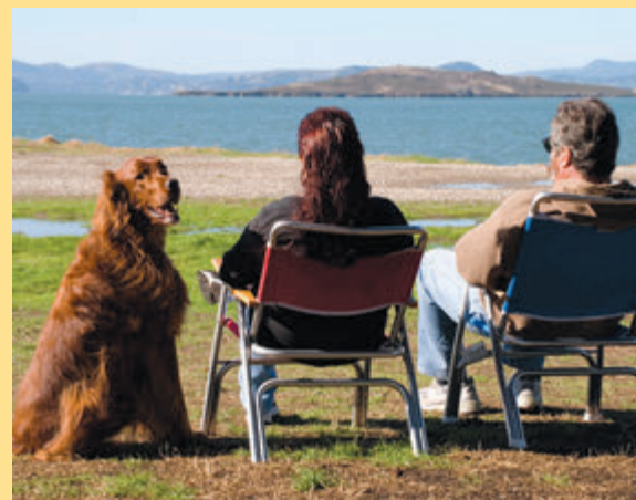
There are beautiful views of the Golden Gate Bridge, Marin County, and Brooks Island from this popular 23-acre park. Special rules allow dogs to be off-leash (but under the voice control of their owner) throughout the park, although owners must carry a leash at all times (six-foot maximum), and dogs must be leashed in parking lots and on streets. Canine visitors can enjoy baths, treats, toys, and supplies from the on-site Mudpuppy's Tub & Scrub.

Visitors are responsible for knowing and complying with park rules (Ordinance 38), available online at www.ebparks.org/ord38 .