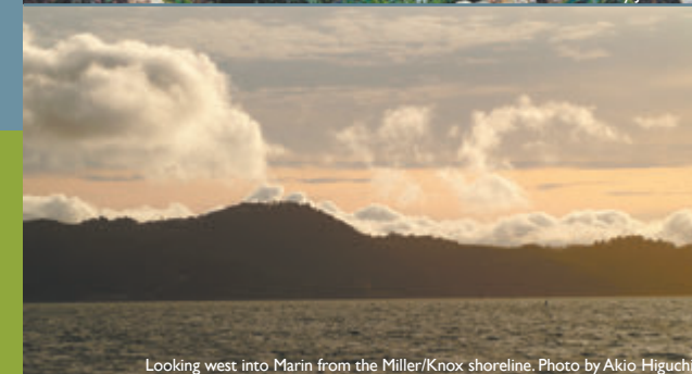
Looking west into Marin from the Miller/Knox shoreline.