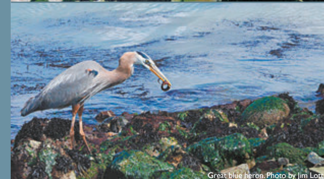
Great blue heron.