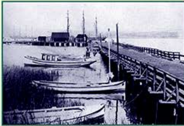
Fishing boats at Grangers' Wharf.