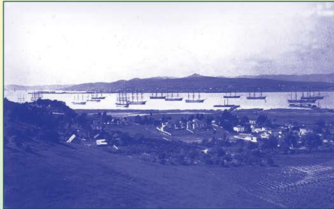
This photo was probably taken in the late 1800s.