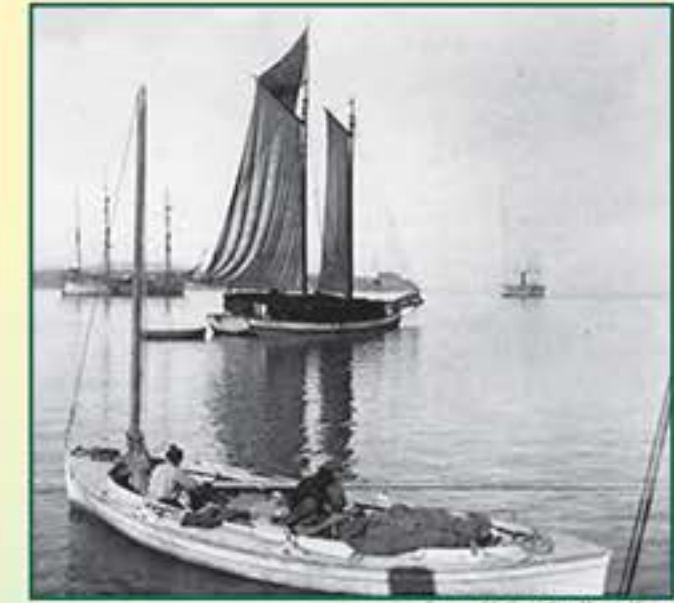
A felucca fishing boat used by Italian fishermen.

M artinez Regional Shoreline was once the site of a wharf, grain warehouses, a fishing village, and the oldest and longest operating ferry in the San Francisco Bay area. This area is now part of the East Bay Regional Park District and is home to many species of plants and animals that thrive in the delicate marshland.