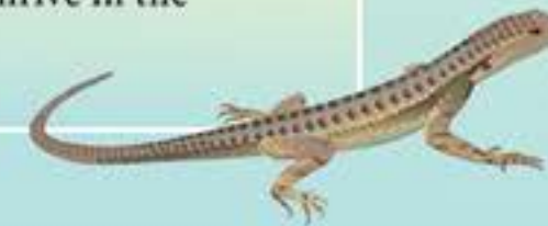
western fence lizard