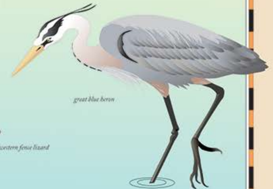
great blue heron