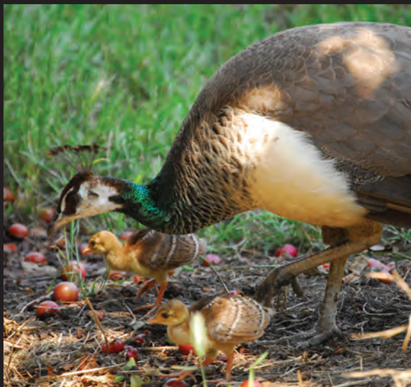
peafowl with peachicks

While we have no evidence that the Patterson family of Ardenwood Historic Farm kept peafowl, these exotic birds would not have been out of place. Wealthy Victorians expressed their appreciation for nature with orderly gardens featuring well manicured lawns and exotic plant species from across the globe. The Victorian garden was an