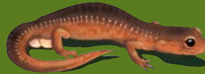
Ensatina salamander with eggs.