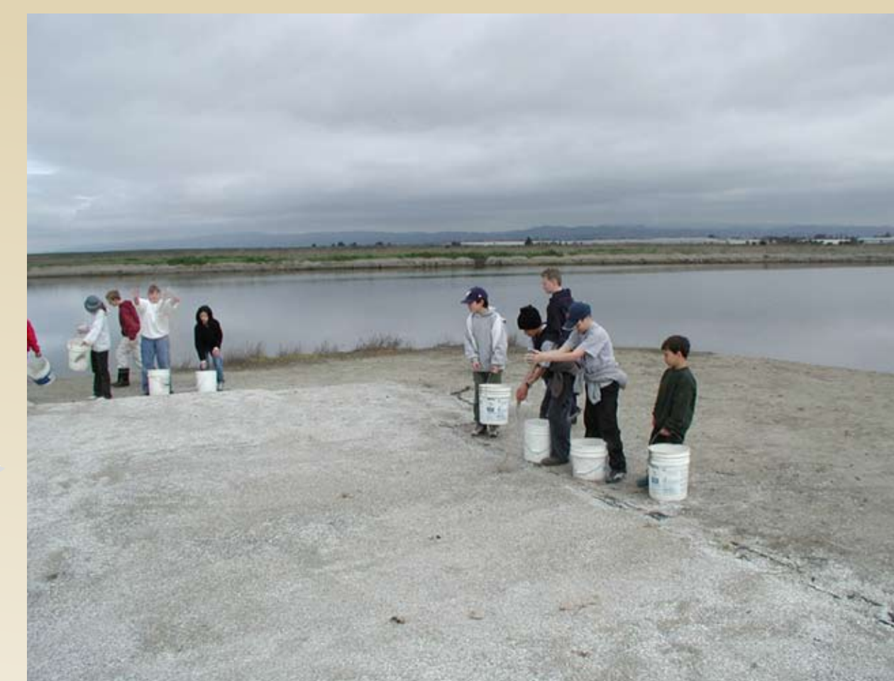
People of all ages creating a nesting habitat for the California least tern.

Thanks to the support of the East Bay Regional Park District, Regional Parks Foundation, U.S. Fish & Wildlife Service Coastal Program, Alameda Countywide Clean Water Program, New United Motor Manufacturing, and Orchard Supply Hardware, the endangered California least tern will keep its foothold in the East Bay.