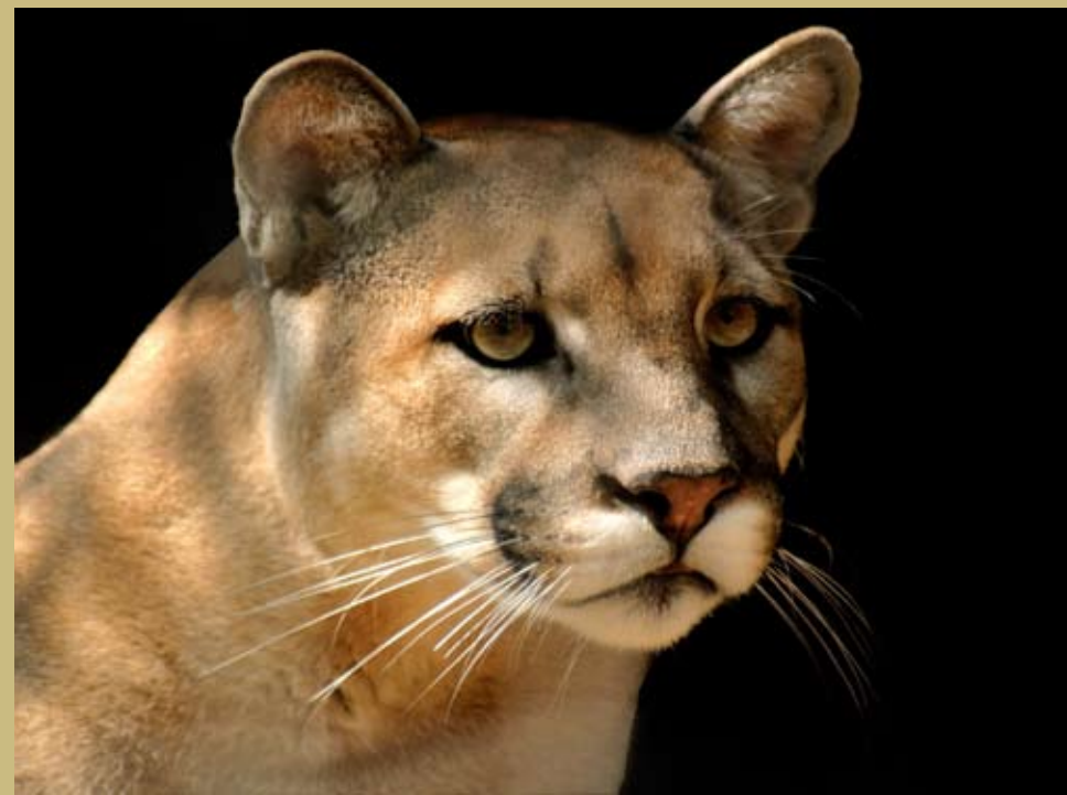
Alert and reclusive, mountain lions use their keen senses to avoid contact with humans.