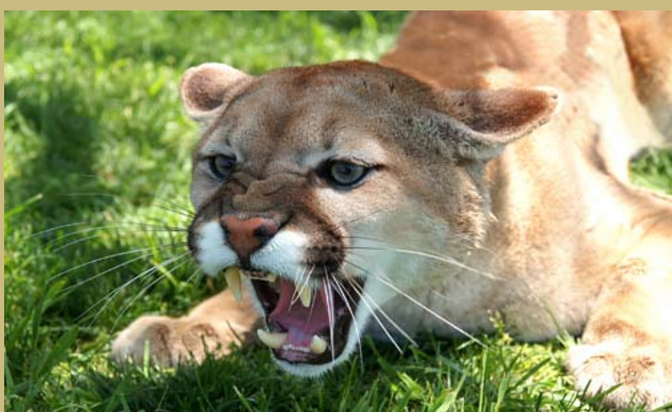
Large canine teeth can penetrate bone and sever vertebrae to efficiently kill prey, especially deer.

Cougars still live throughout California, including areas of the Coast Ranges with adequate open space, cover and food. They are more active during dawn and dusk when their favorite prey—the black-tailed deer—is also foraging. The most common signs of their activities are tracks, deer-kills, and scrapes.