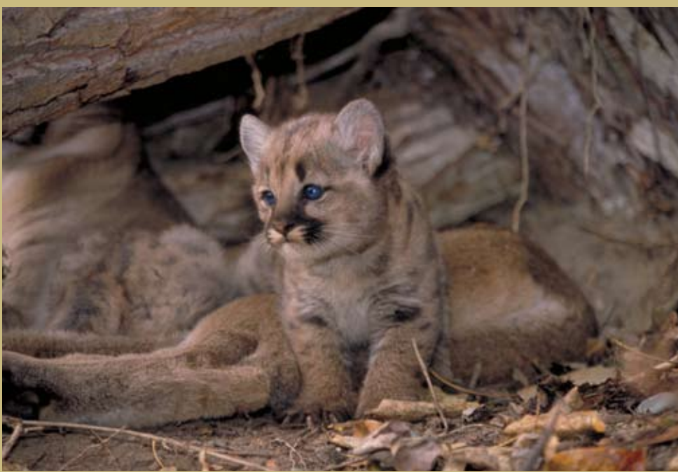
Young mountain lions have spotted coats for the first few months.

Mountain lions, cougars, pumas, catamounts, panthers...the list goes on. Puma concolor , "the cat of one color" as scientists call them, once roamed throughout North America. Now they are primarily a symbol of the American West.