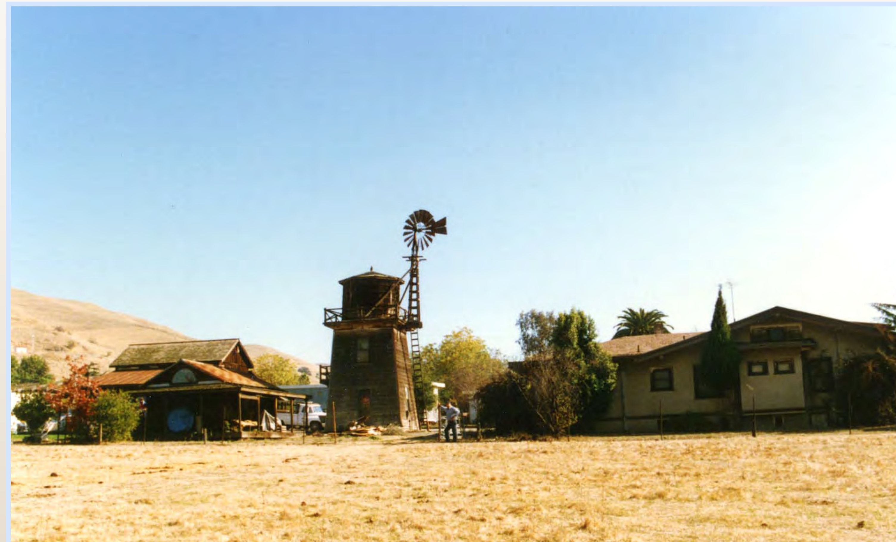
The tank house on the Leal Ranch.